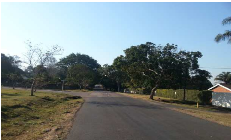
Looking in a Northerly showing the proposed pipeline route along Ashely Road