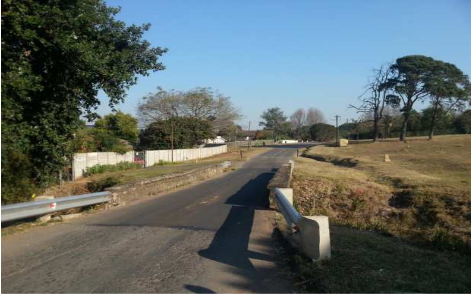
Looking South-West showing the Bridge along Elizabeth road and the crossing of Watercourse unit 3.