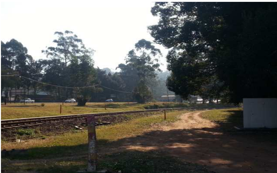
Looking West from Galloway Road.