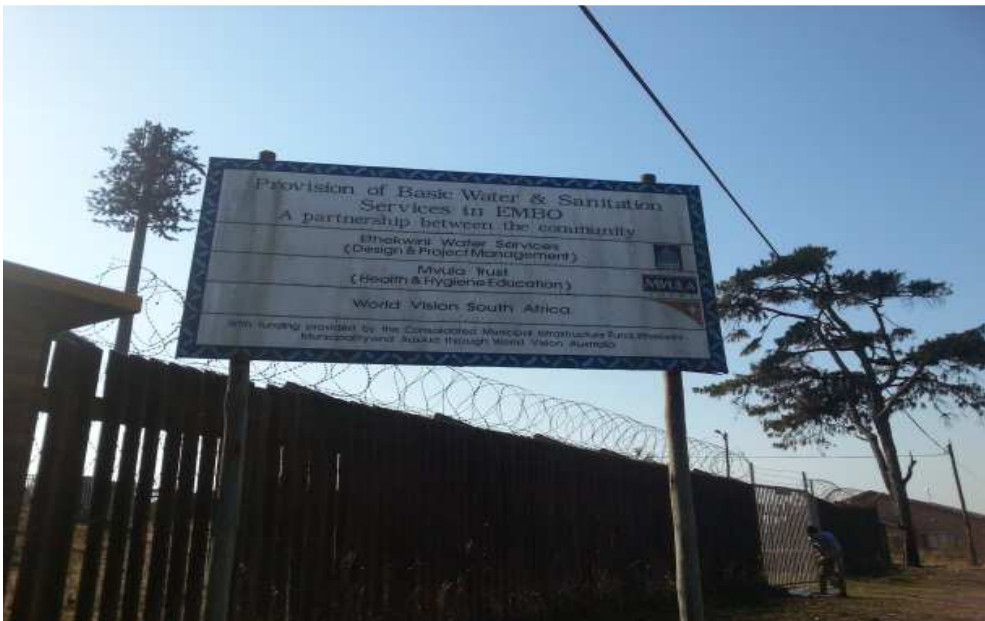
Showing the entrance to West Riding Reservoir marking the end of the proposed pipeline route.