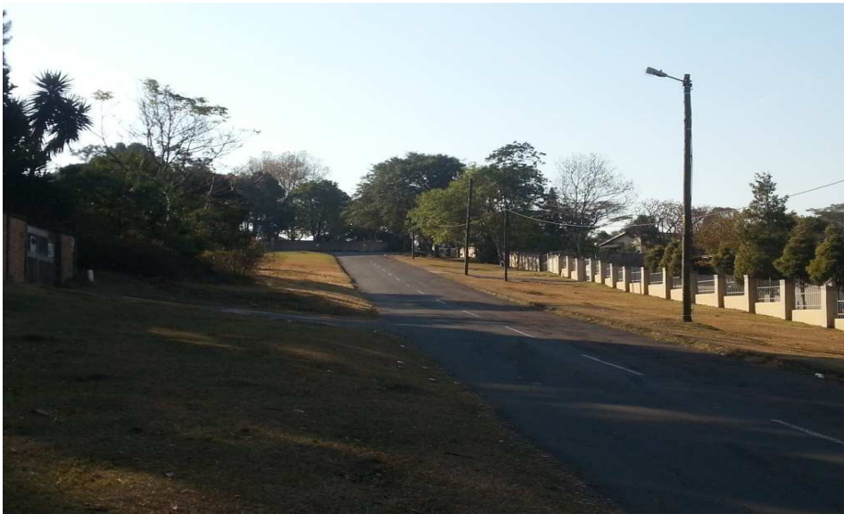
Looking North, Showing the proposed location of the pipeline route along Elizabeth Road.