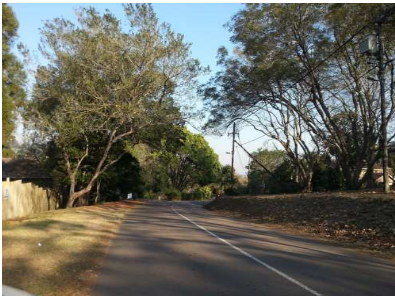
Looking South-East on Assagay Road.