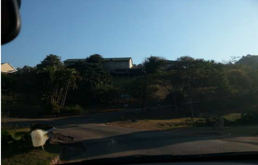
Looking South - West along Assagay Road showing the first crossing of Watercourse unit 1.