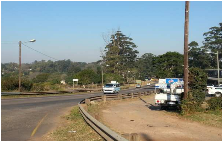
Looking in a Southerly direction - showing the corner of Old Main road and Assagy road.