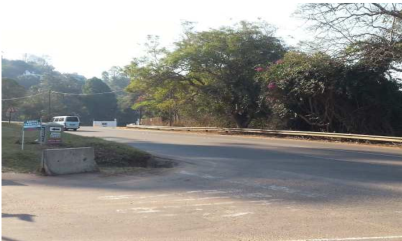
Looking in a Northerly direction - showing the corner of Old Main road and Assagay road.