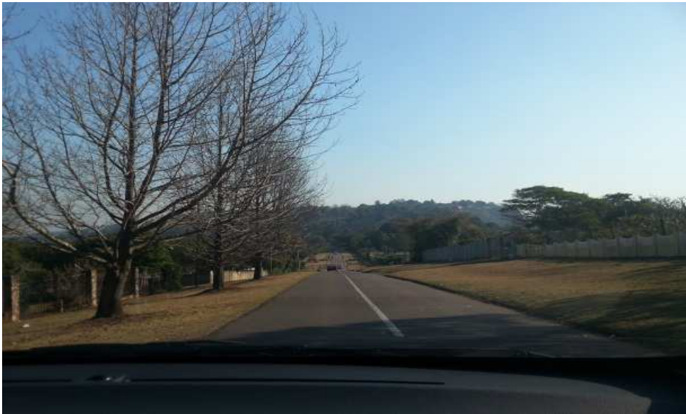
Looking South, showing the proposed route of the pipeline along Marion Road.