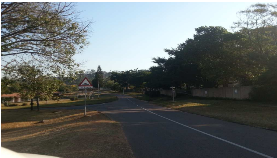
Looking South, Showing the corner of Elizabeth Road and Marion Road.