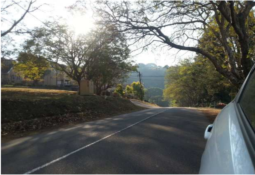
Looking North - East along Assagay Road.