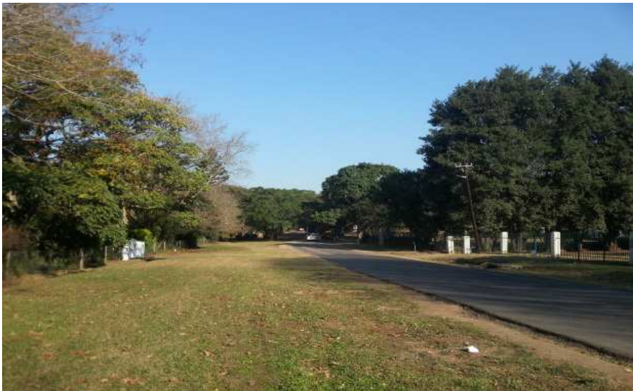
Looking in a South-Easterly direction showing the proposed pipeline route along Ashely Road