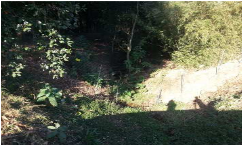
Showing type of vegetation located below the bridge at Elizabeth road.