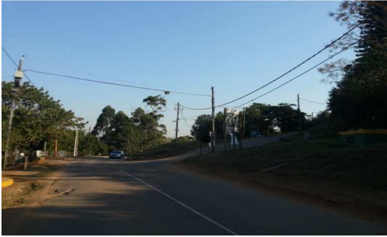
Facing South West: The corner of Assagay Road and Gevers Road.