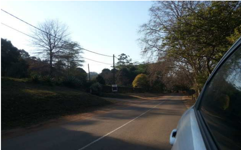
Looking North East on Assagay Road near the start of the project.