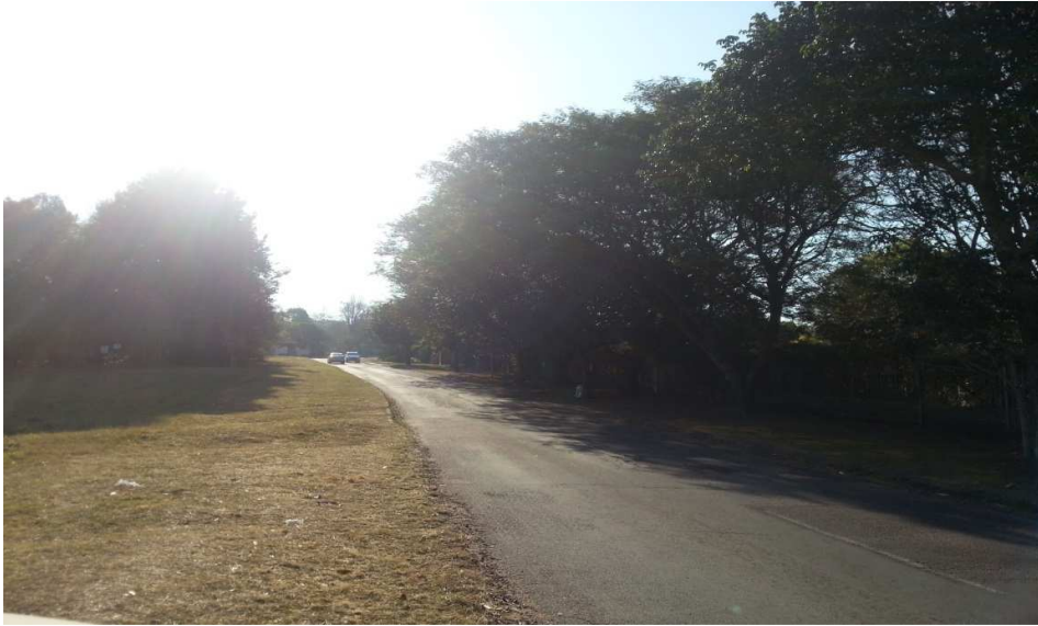
Looking North West, Showing the proposed pipeline route which goes up along Elizabeth Road.