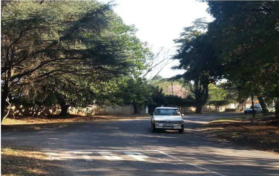
Looking in a Southerly direction showing the intersection of Galloway and Ashley Road.