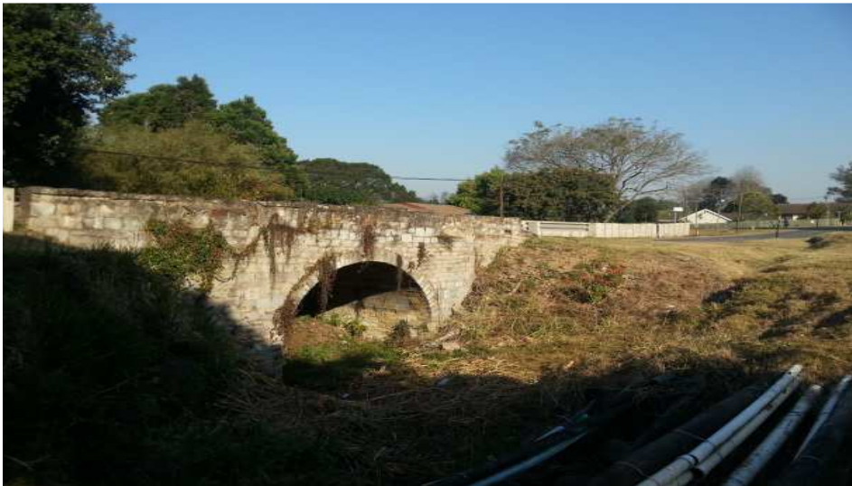
Showing type of vegetation located below the bridge at Elizabeth road.