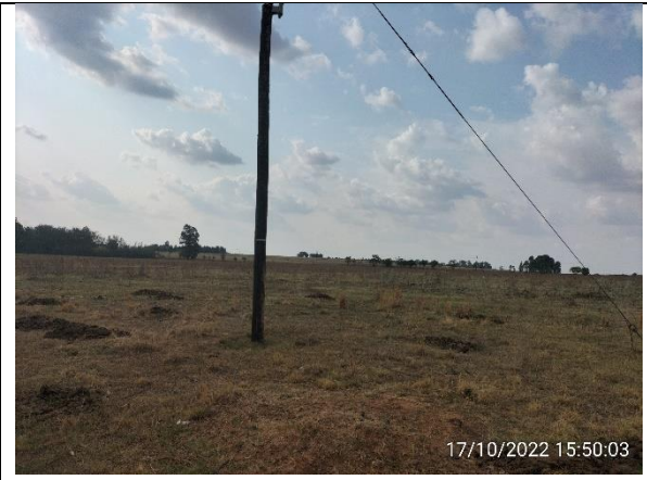
Figure 2: General site