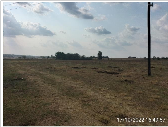
Figure 1: General site