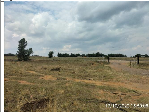
Figure 5: Entrance to site adjacent to the R25