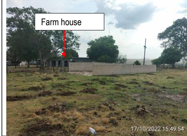
Figure: Farm house