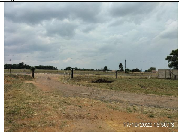
Figure 6: Entrance to site adjacent to the R25