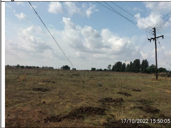
Figure 3: General site