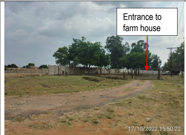
Figure: Entrance to farm house