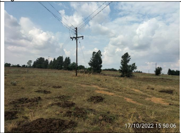
Figure 4: General site