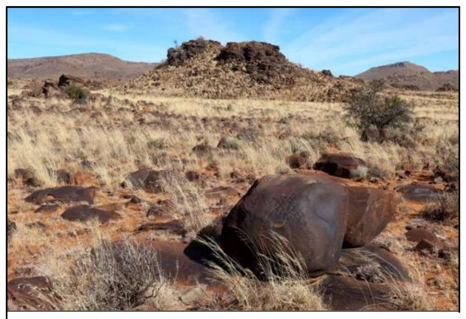
Dolerite boulders along the Gamma-Omega powerline route, Phaisantkraal 1