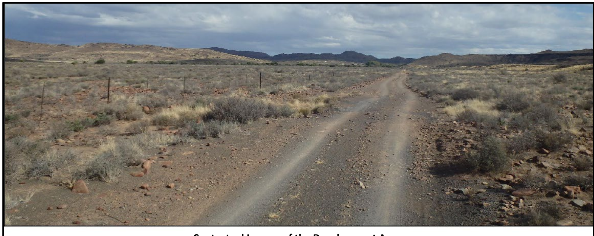
Contextual Images of the Development Area