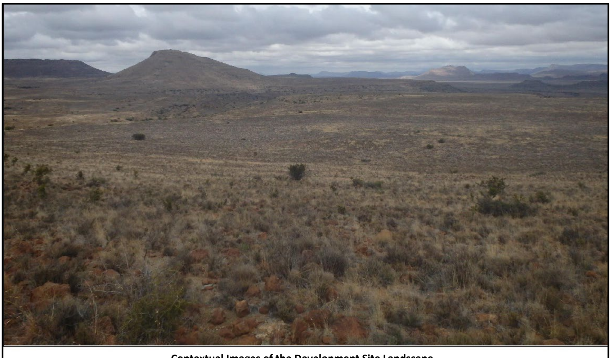
Contextual Images of the Development Site Landscape