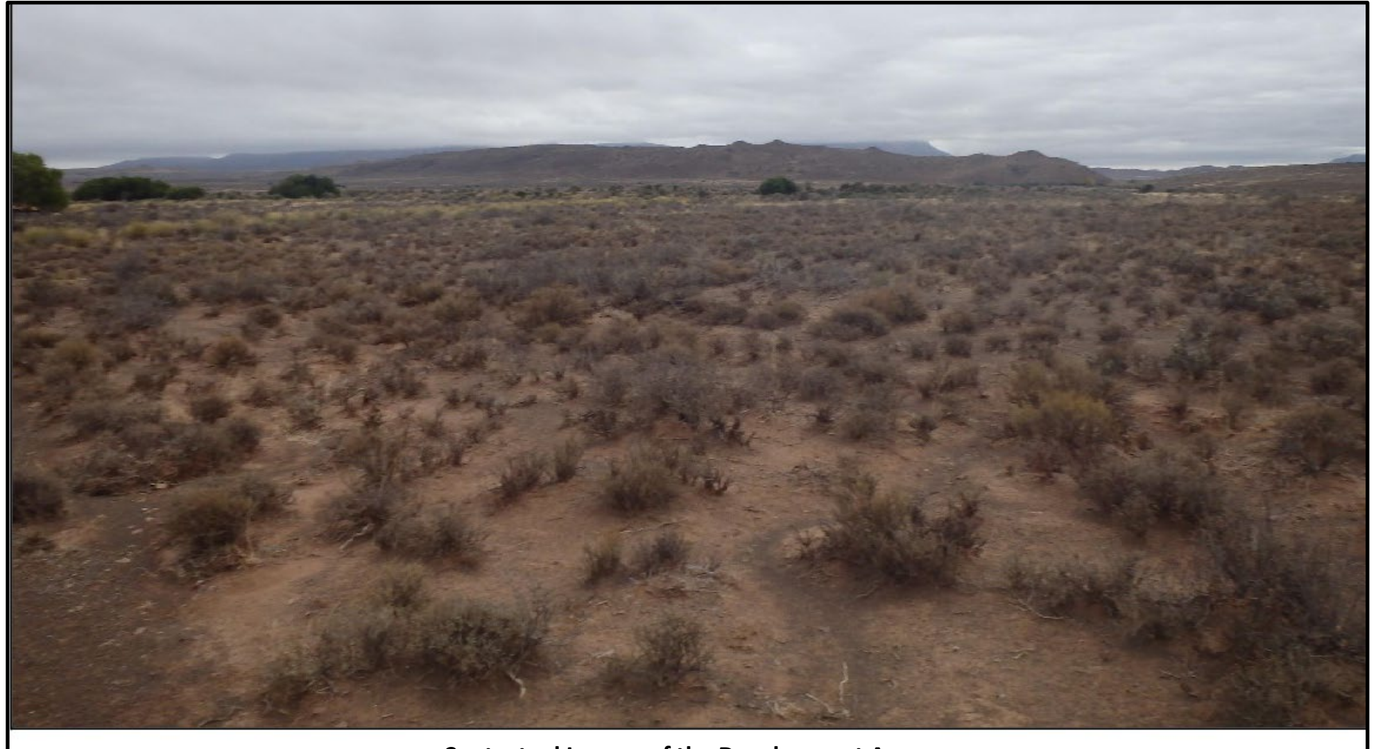
Contextual Images of the Development Area