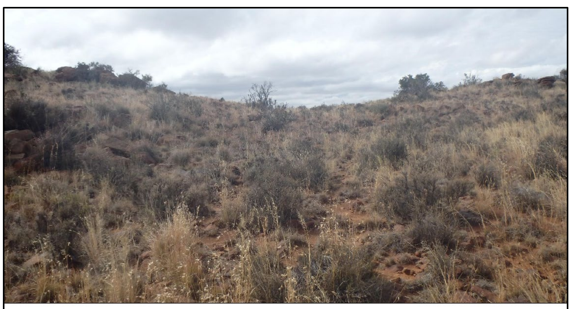
Contextual Images of the Development Site Landscape