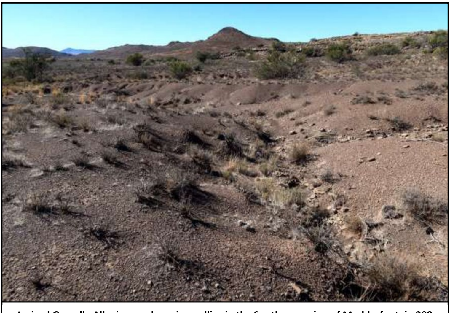
Incised Gravelly Alluvium and erosion gullies in the Southern region of Modderfontein 288