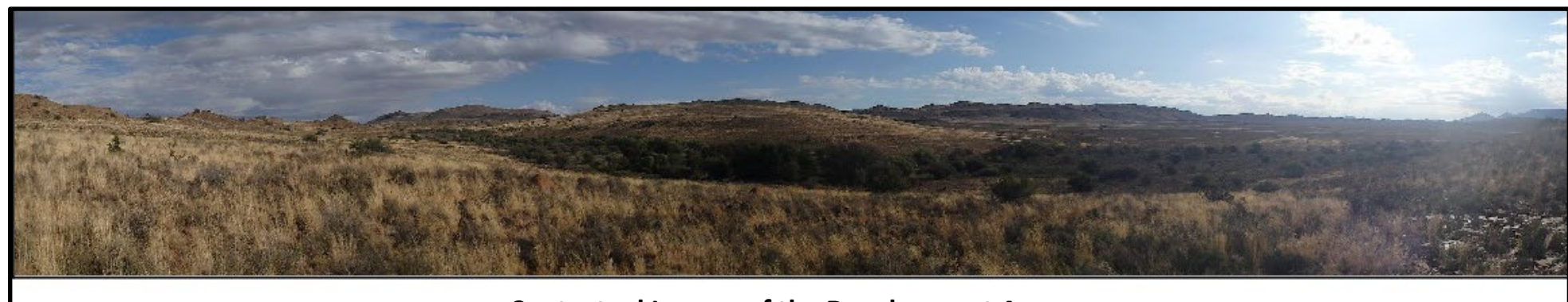
Contextual Images of the Development Area