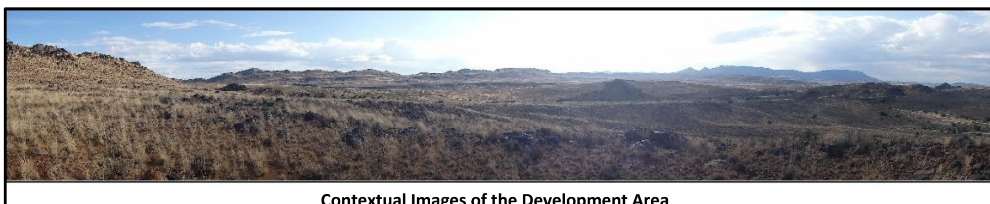
Contextual Images of the Development Area