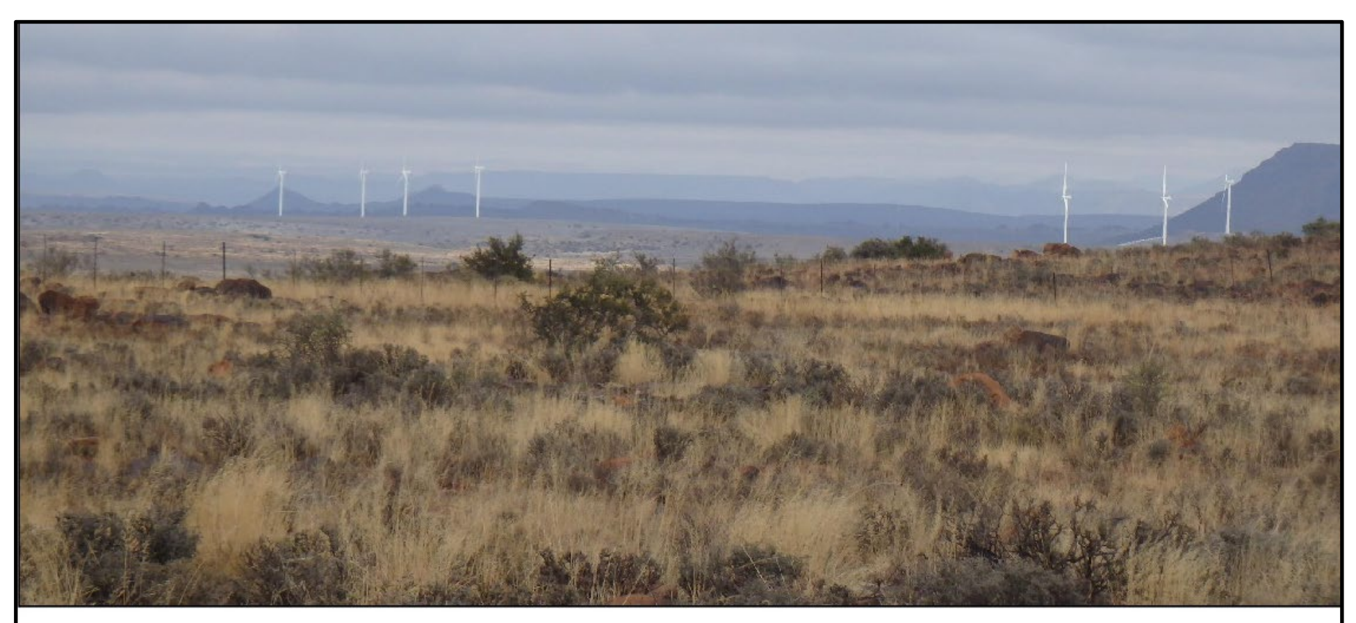
Contextual Images of the Development Area, looking towards existing turbines on the neighbouring Noblesfontein WEF