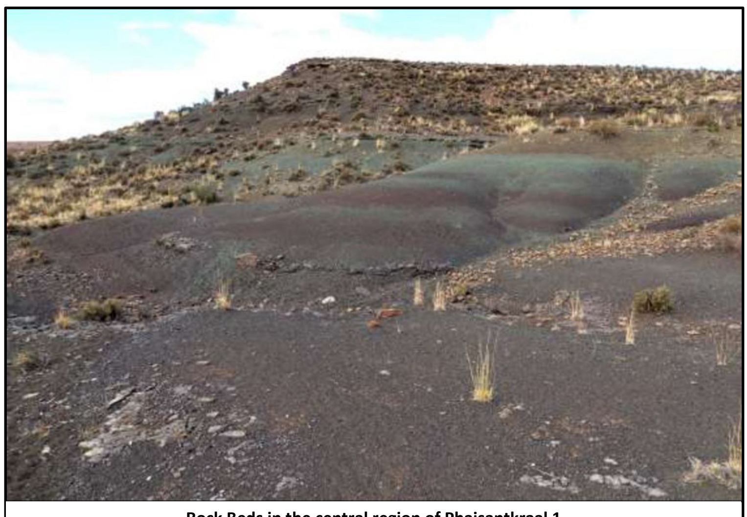
Rock Beds in the central region of Phaisantkraal 1