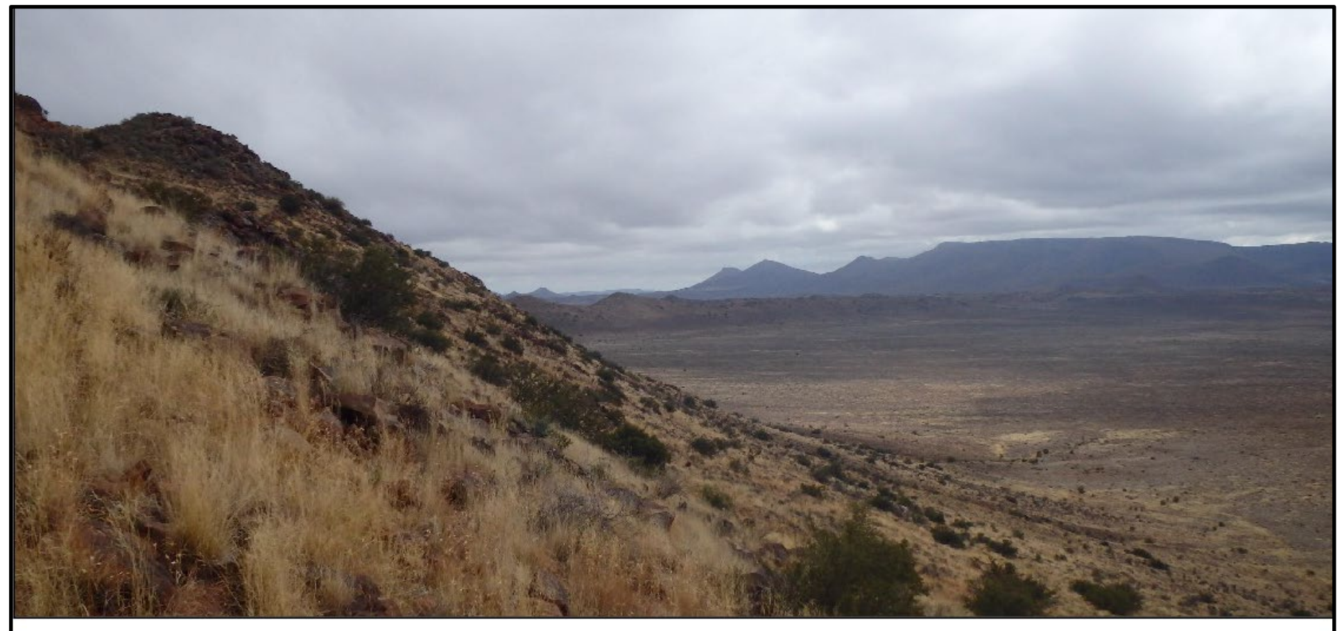
Contextual Images of the Development Area, showing the area of the proposed powerline route