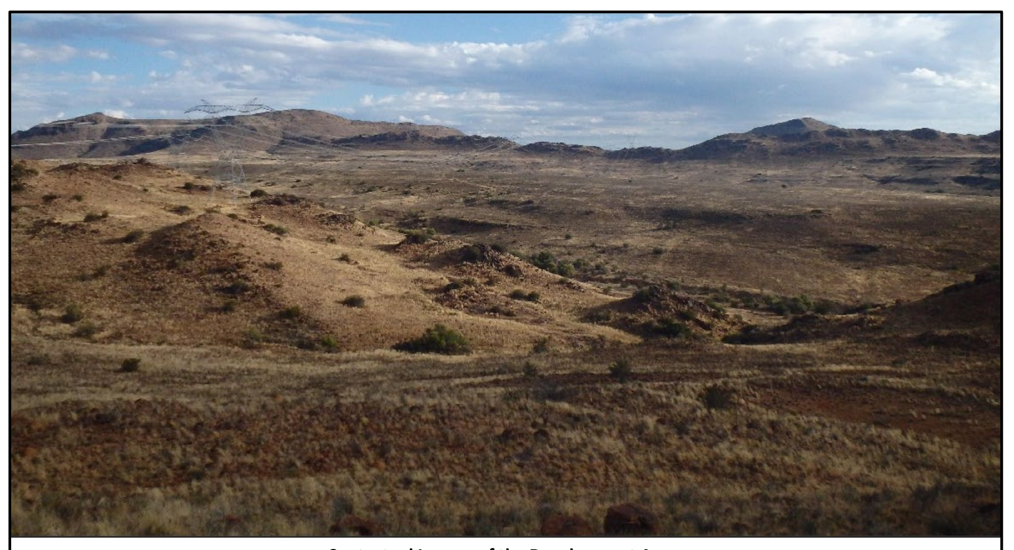
Contextual Images of the Development Area