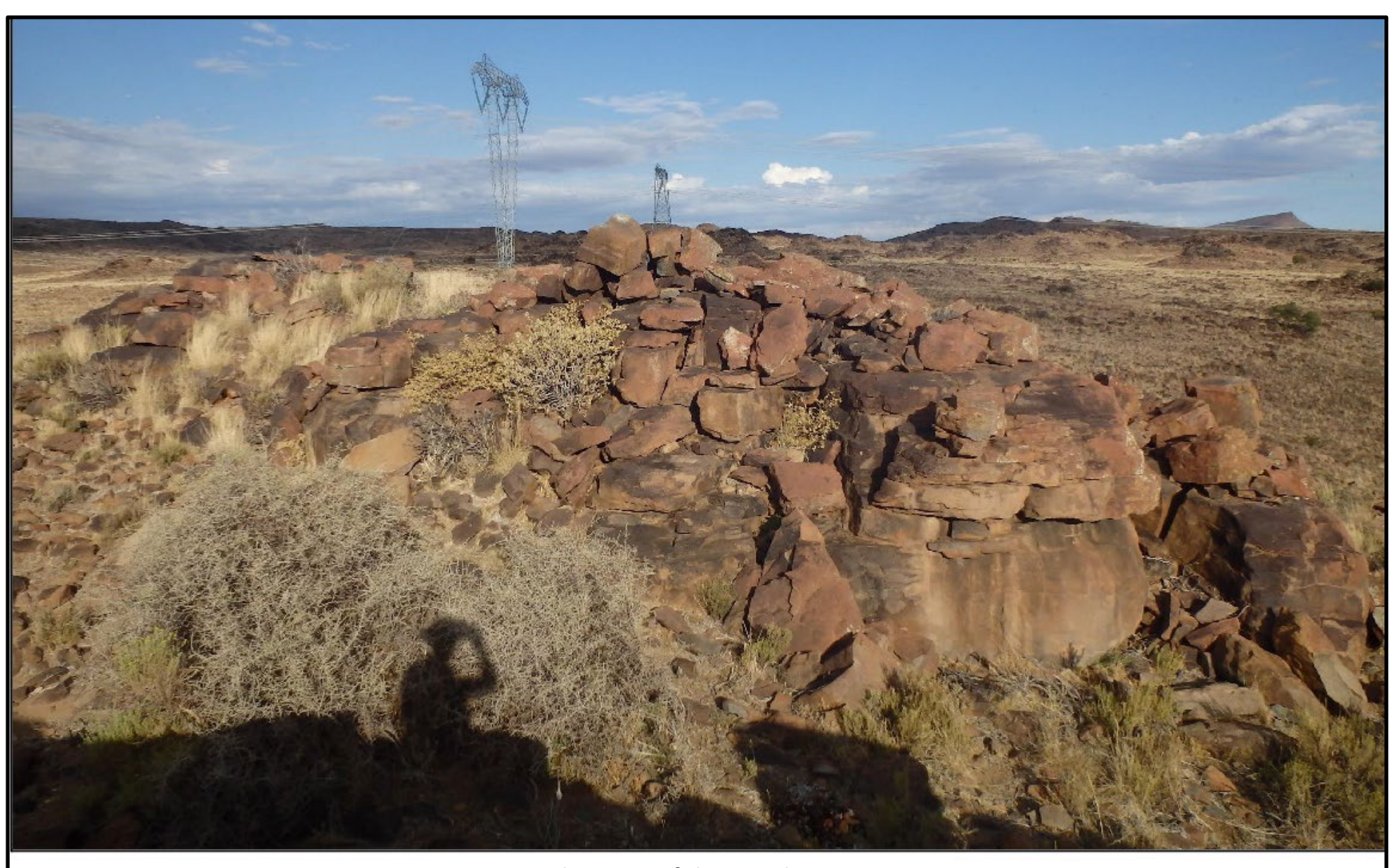
Contextual Images of the Development Area