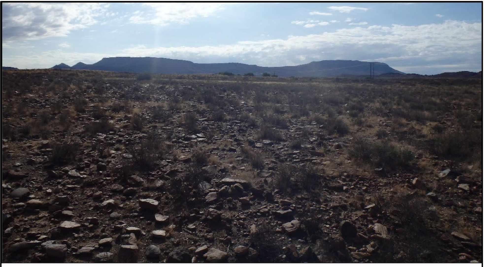
Contextual Images of the Development Area