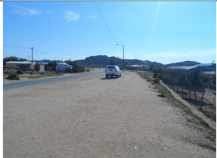
Figure 8: The area immediately north of the proposed site, looking in a northern direction as viewed from the proposed site.