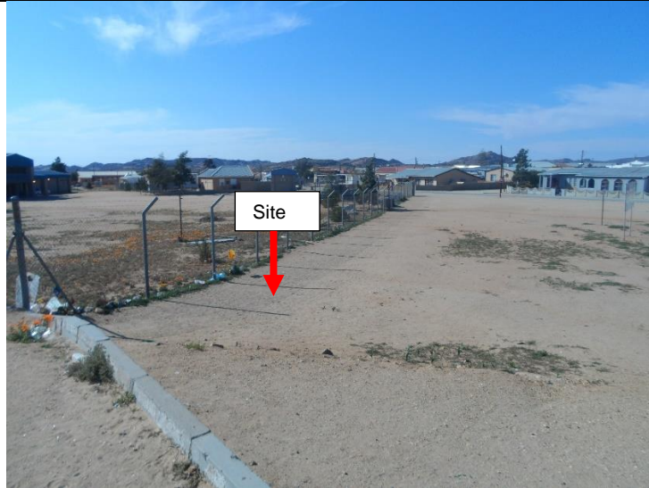
Figure 1: Looking towards the site (red arrow) as viewed from Goodhouse St. Looking in an eastern direction. The site has no natural vegetation.