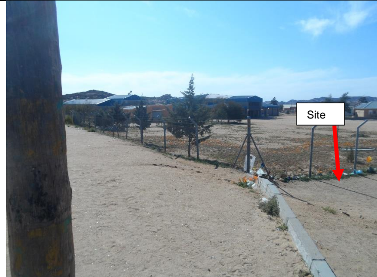
Figure 2: A view of the proposed site (red arrow) as viewed from the corner of Goodhouse St. Looking in a north-eastern direction. The site has no natural vegetation.