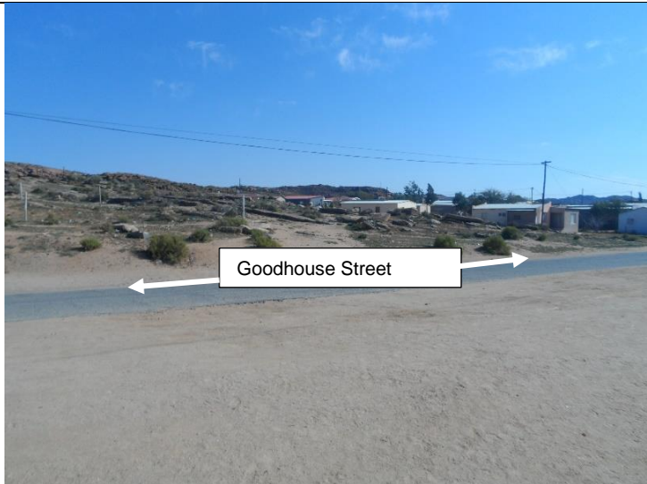
Figure 7: The area immediately north-west of the proposed site, looking in a western direction as viewed from the proposed site.