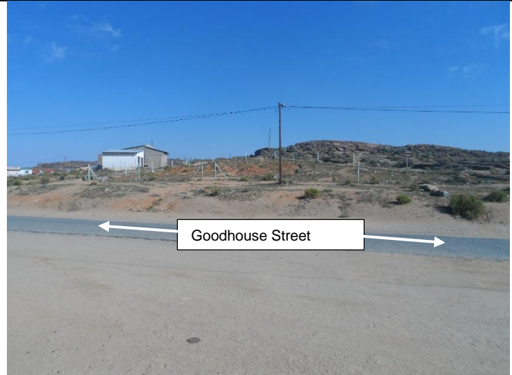
Figure 6: The area immediately north of the proposed site, looking in a western direction as viewed from the proposed site.