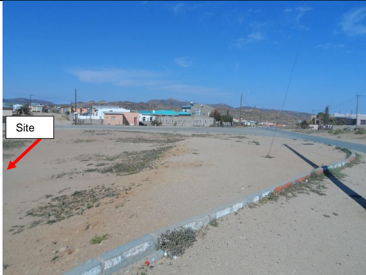
Figure 5: The site (red arrow) is located on a flat surface area and has no vegetation present. Looking in a south-western direction as viewed from Goodhouse Street.