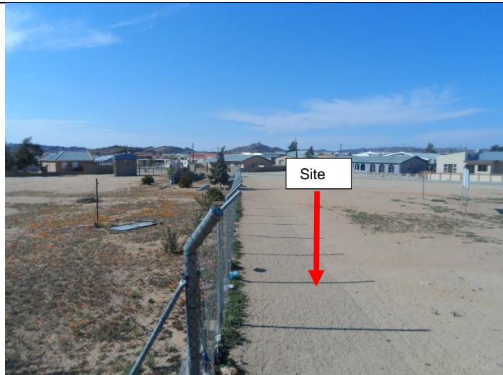
Figure 3: Looking towards the site (red arrow) as viewed from Goodhouse St. Looking in an eastern direction. The site has no natural vegetation.