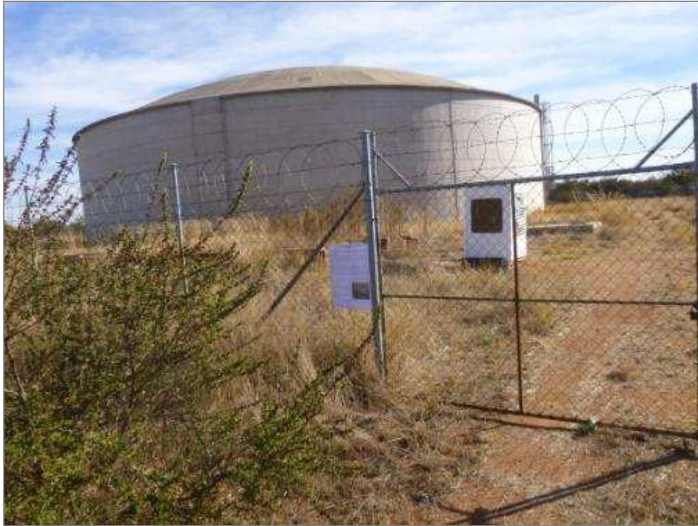
The proposed bulk water pipeline will be constructed from the Hammanskraal West Reservoir. Photo taken in a western direction towards the reservoir.