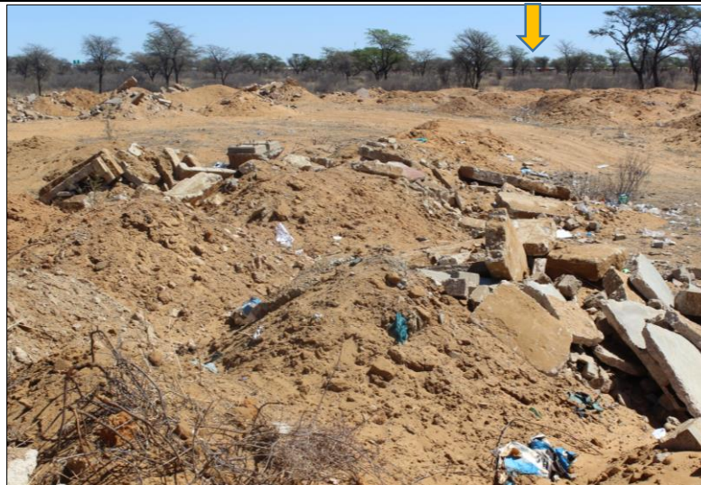
Figure 8: View towards the northwest showing the rubble in the foreground and houses in the background (yellow arrow)