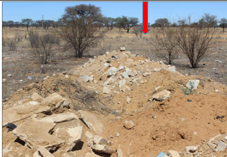
Figure 6: View south with the R377 in the background (red arrow)