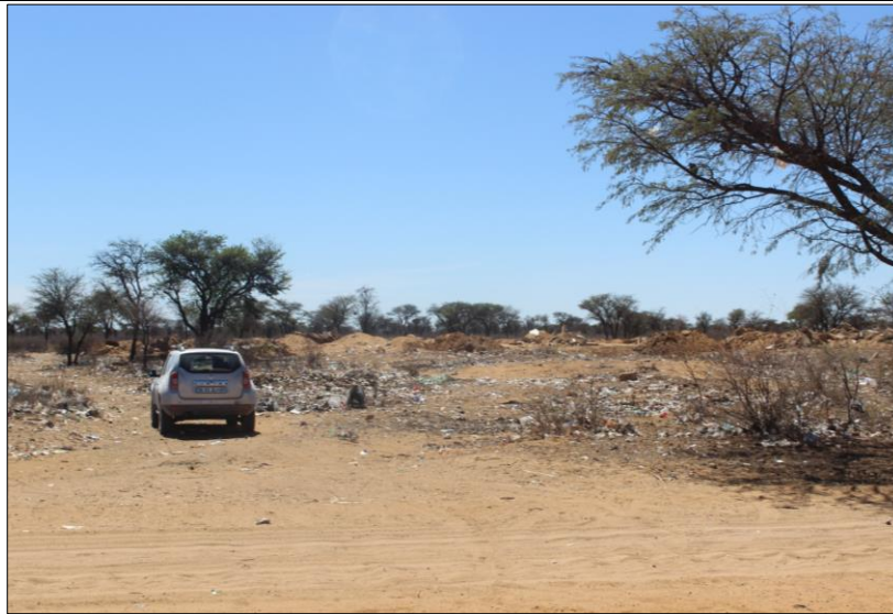
Figure 3: View north towards the entrance to the site