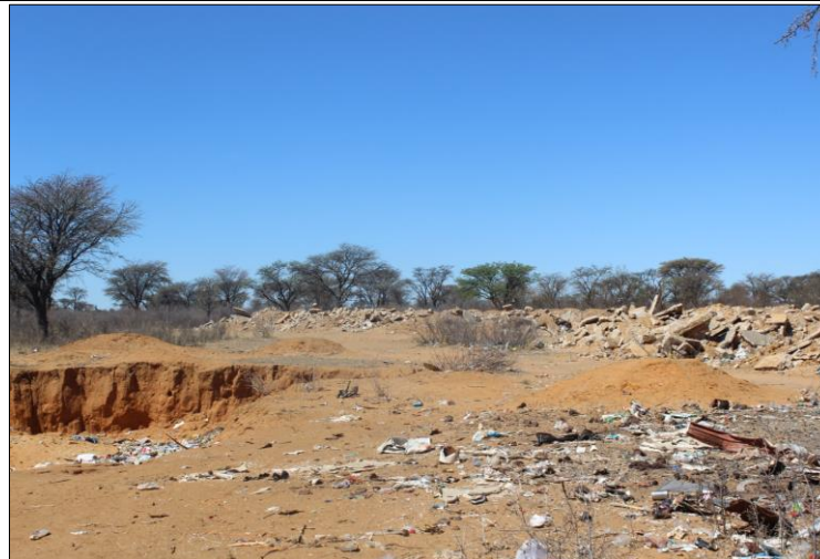
Figure 10: View East towards the quarry