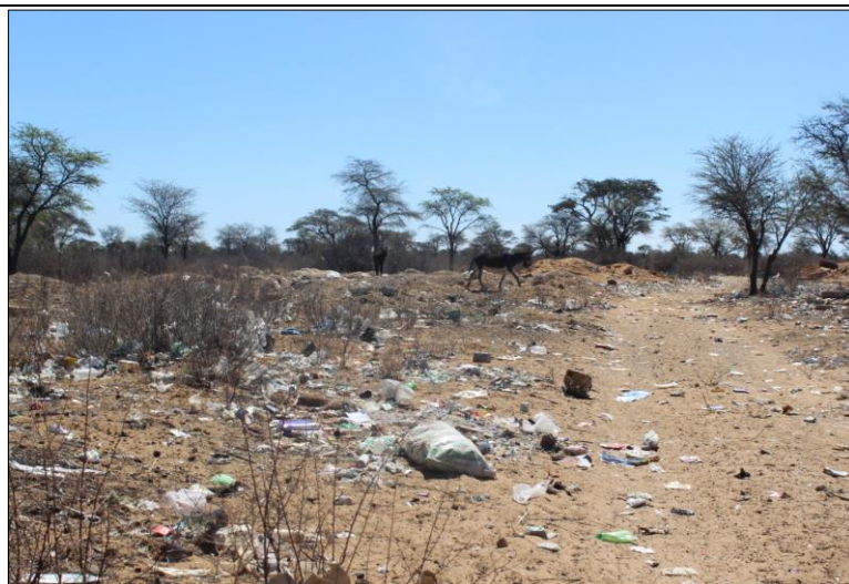
Figure 21: View north towards the access road from the site towards the housing development in close proximity to the site