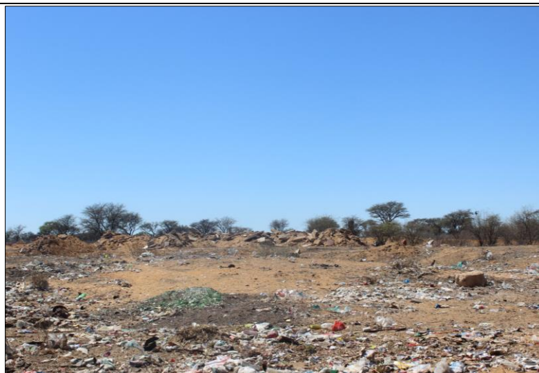
Figure 22: View towards the east showing the waste body on the site