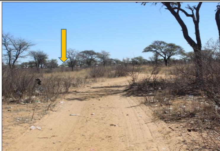
Figure 14: View north toward the new housing area in close proximity to the site. Note the roofs of the housing development indicated by the yellow arrow