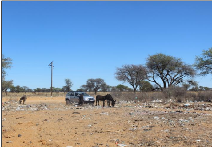
Figure 17: Additional view towards the entrance to the site, note the donkeys feeding on waste