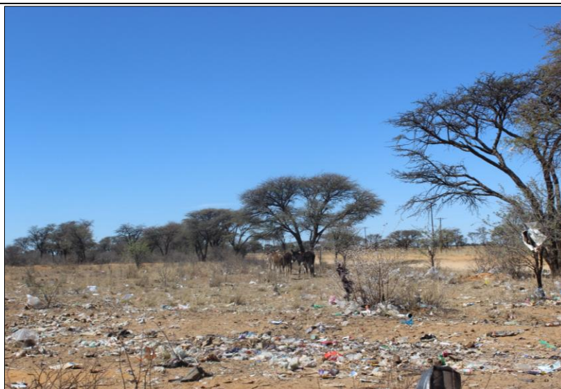
Figure 23: View south east toward the R377