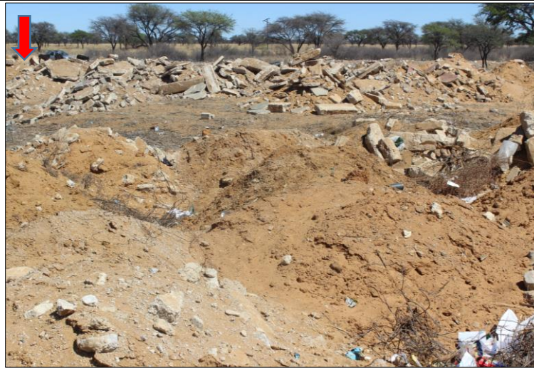
Figure 7: View south west towards the site entrance (red arrow) . Note large volumes of rubble on site