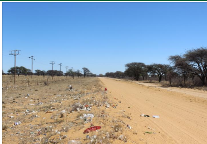
Figure 1: View towards the west along the R377 towards Piet Plessis. The site is located on the left. Note windblown litter across the road

SITE: PIET PLESSIS- KAGISANO MOLOPO LOCAL MUNICIPALITY Site photos taken on the 02 nd SEPTEMBER 2015