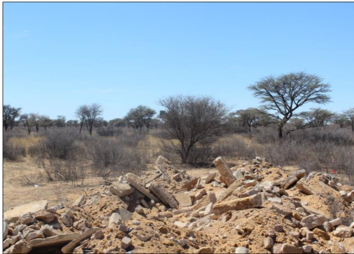
Figure 5: North East showing vegetation on site