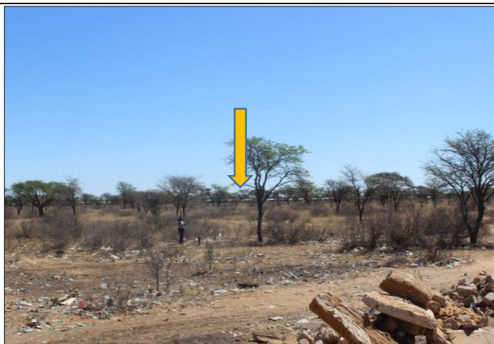
Figure 19: View north towards the access road from the site towards the housing development in the background indicated by the yellow arrow