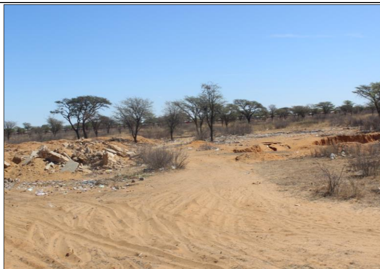
Figure 12: View west towards showing the quarry on the right and the rubble on the left