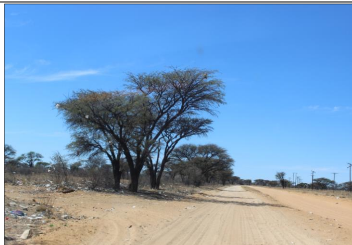
Figure 2: View east towards the R377 towards Stella with the site entrance on the left