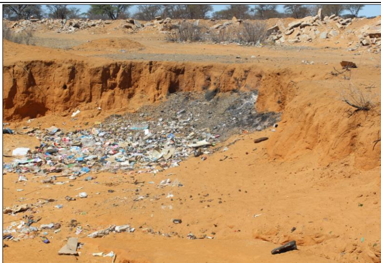
Figure 11: View towards the east showing the close up of the quarry within the landfill site