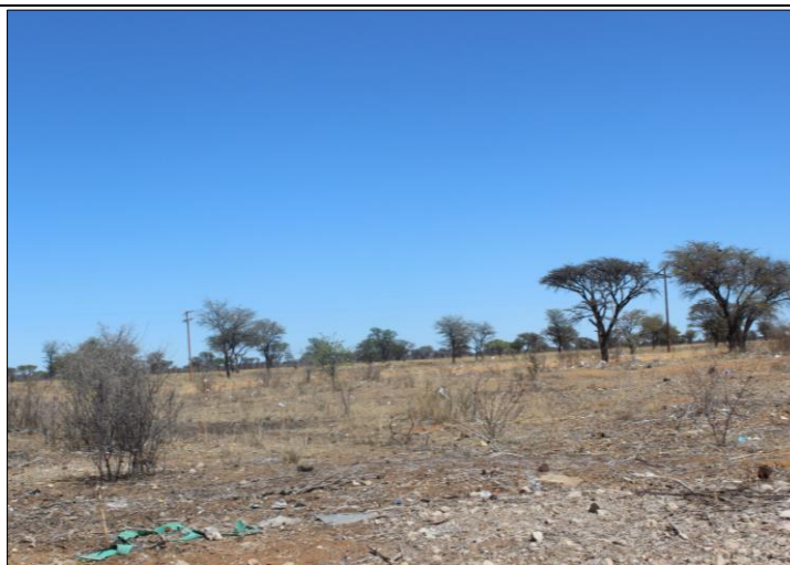
Figure 15: View south towards the south towards the R377