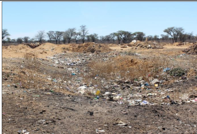
Figure 18: View towards the north east. Photo taken close to the entrance of the site