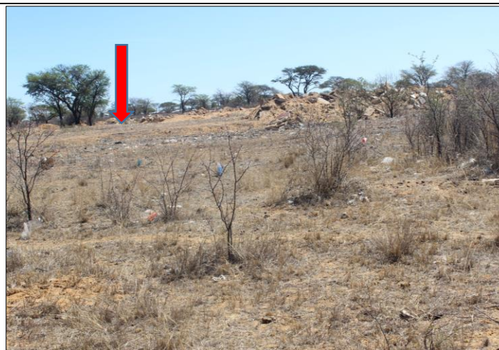
Figure 16: View towards the northwest showing the access road on the left indicated by the red arrow