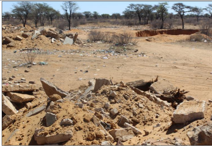
Figure 9: View towards the northwest showing the quarry and houses in the background and rubble in the foreground