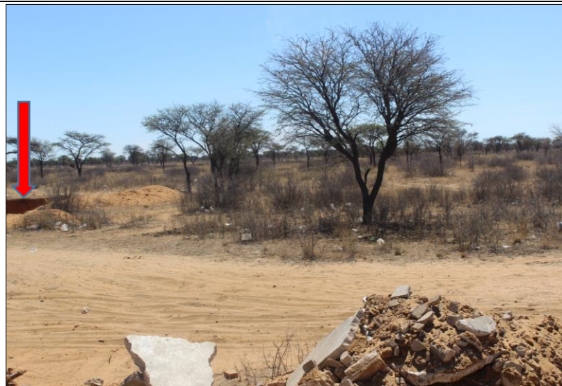
Figure 4: View towards the North showing an excavation (red arrow)in the background and rubble in the foreground