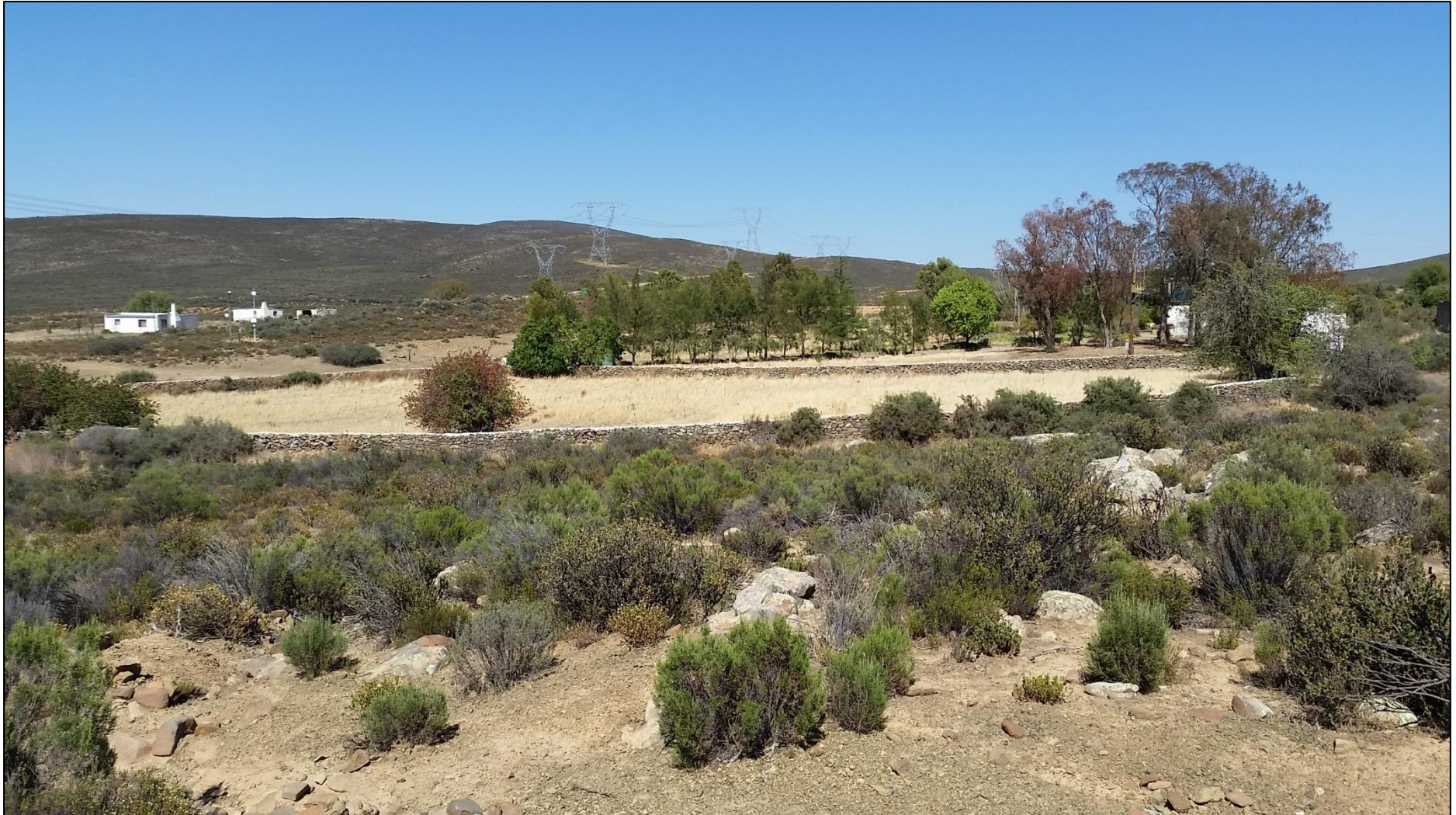
Homestead at: 32°57'10.21"S ; 20°30'21.68"E.