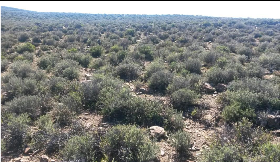
Plate 1: Photographs of the Proposed Location for Substation Alternative 6.