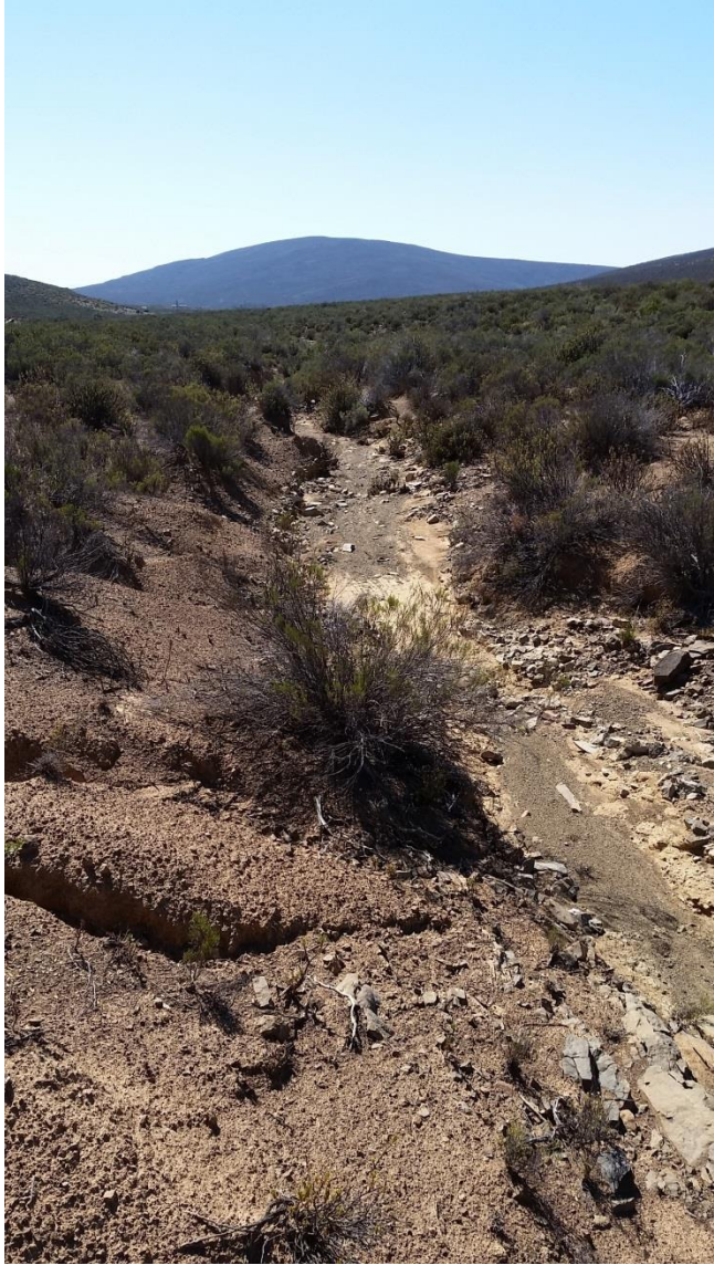
Dry drainage lines, typical of this region.