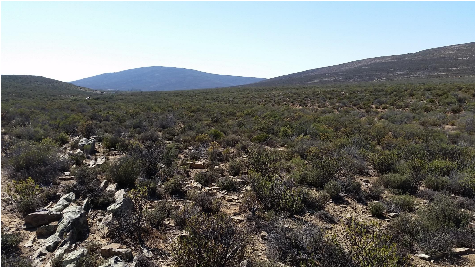
Typical vegetation of this region.