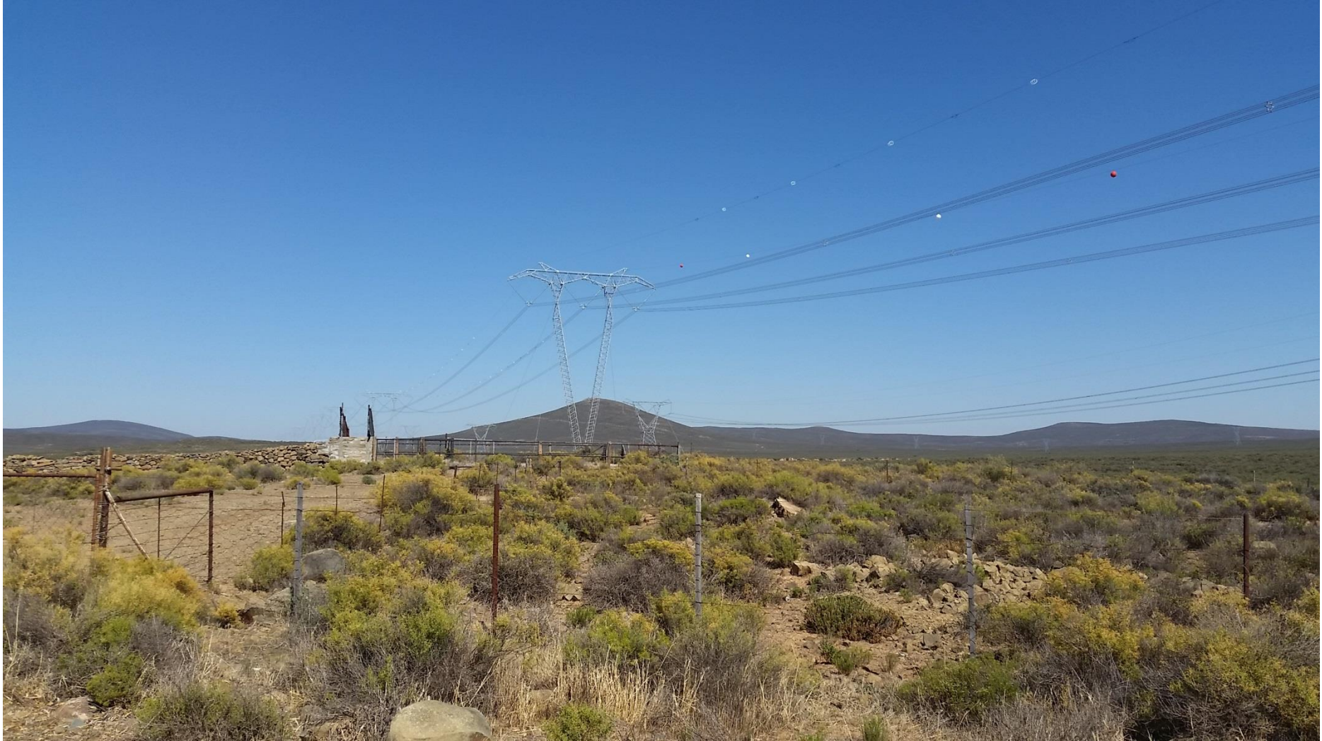
Existing Eskom 400kV and 765kV transmission lines.