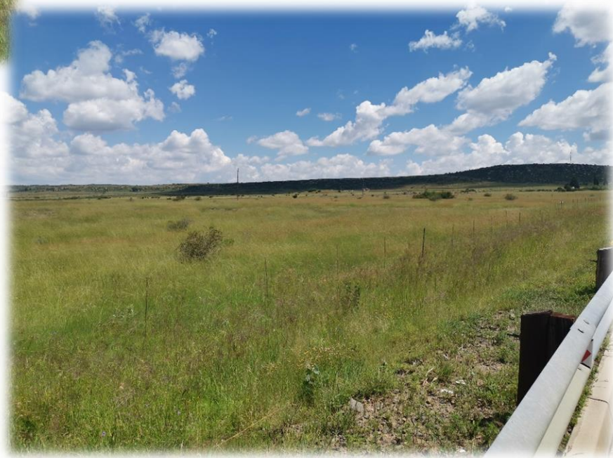
Photo 2: View of the typical vegetation along the pipeline route (South-eastern View)