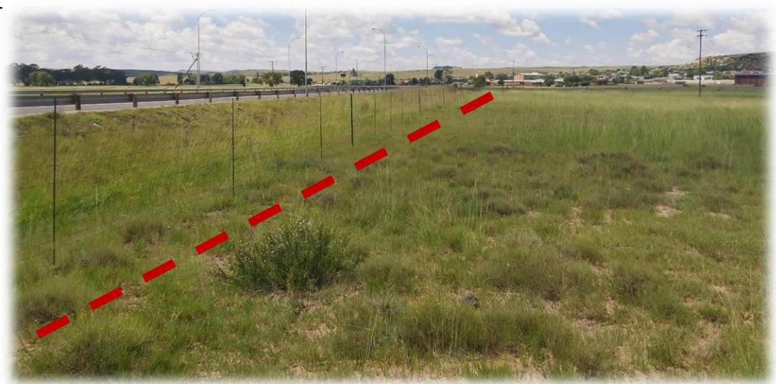
Photo 4: View of the Pipeline route across the wetland section towards the outfall sewer connection point