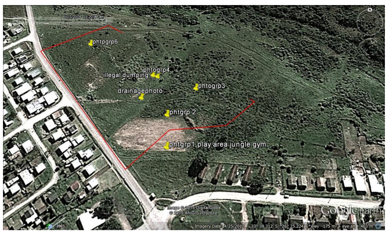
Figure 1. Google Earth © 2015 image showing points ( referred to below ) at which site photographs were taken at the proposed Alexandria Community Health Centre site.