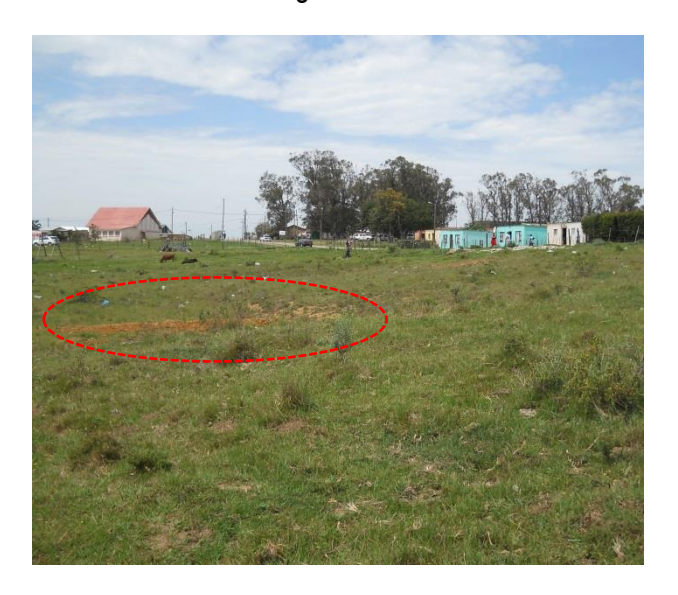
Exposed clayey soil seen towards centre of site (Facing south).