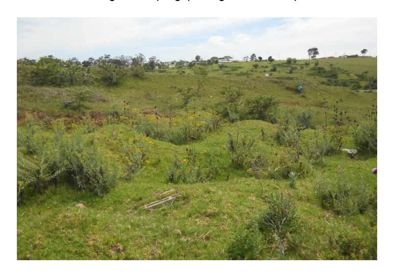
Rubble heaps – evidence of past disturbance (facing west).