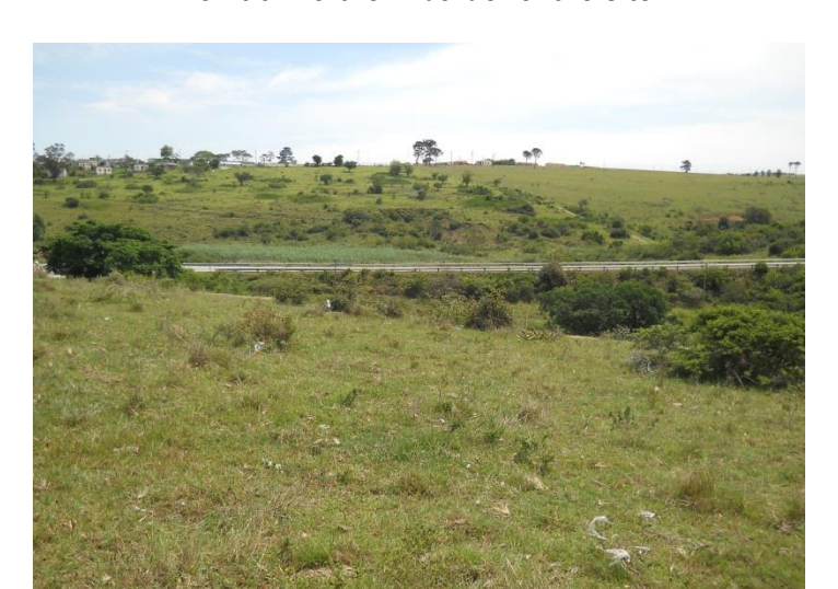
Point 6. Northern border of the site.

View of the vegetated stream / drainage line along the north-eastern site boundary (facing south-east). Informal settlement in the background).