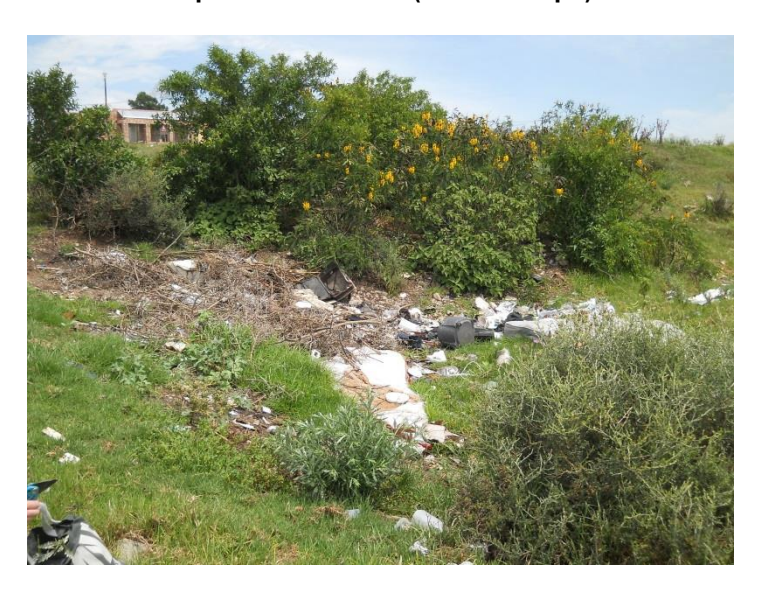
Illegal dumping (facing south-west).

Illegal dumping and evidence of past disturbance (rubble heaps) towards the centre of the site.