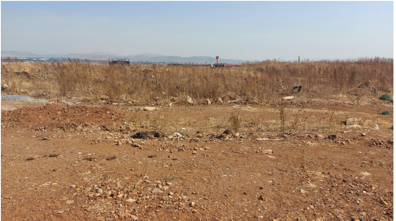
View from centre of the development site taken in a north-westerly direction with an extension of Sky City residential development in the background