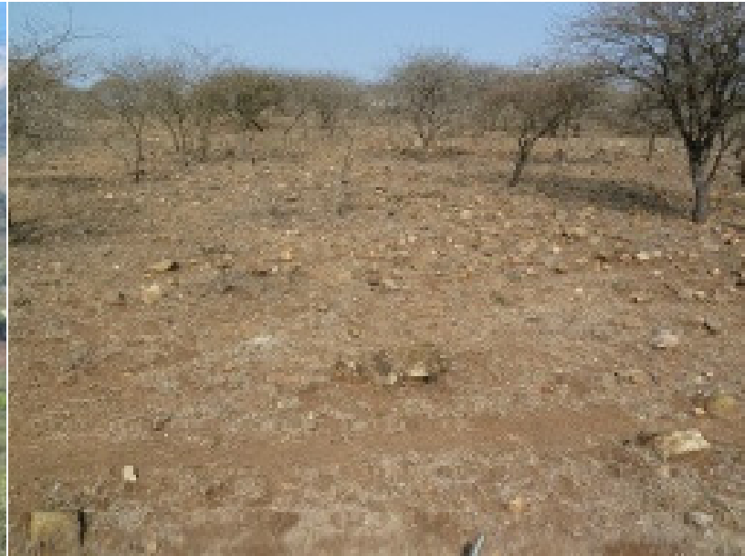
Plate 6: Photo of Plot 28 (degraded)