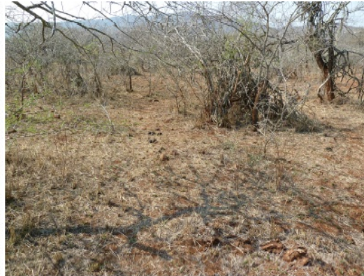
Plate 2: Photo of Plot 5 (degraded)