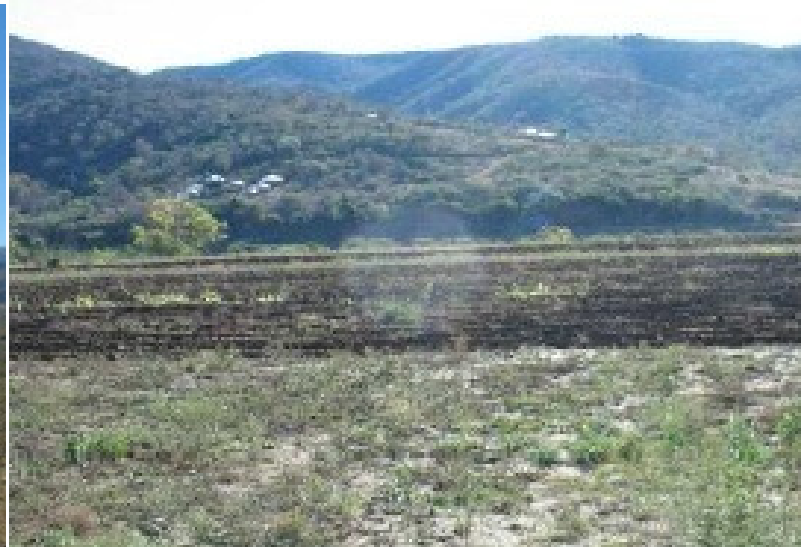
Plate 8: Photo of Plot 31 (currently cultivated)