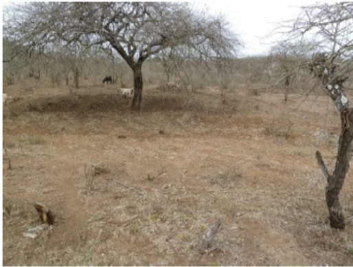
Plate 1: Photo of Plot 1 (degraded)