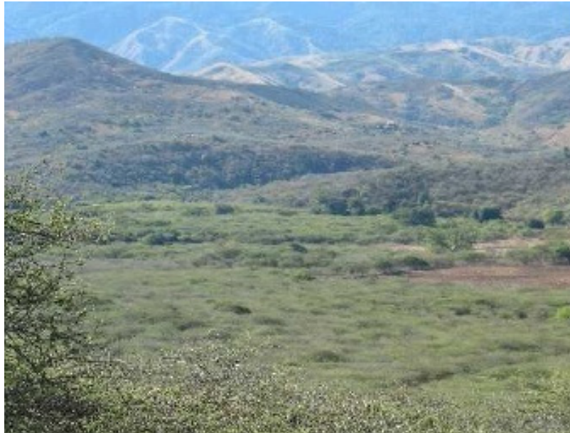
Plate 5: Photo of Plot 18 (currently cultivated)