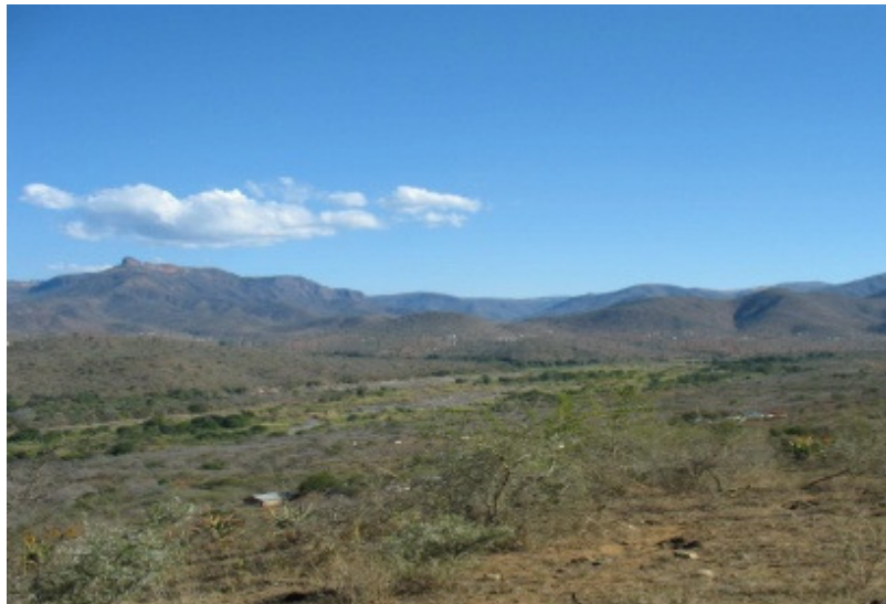
Plate 7: Photo of Plot 29 (currently cultivated)