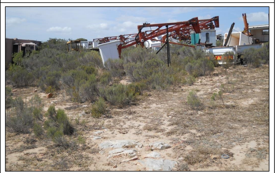
Figure 13: South Easterly View (Position 2)