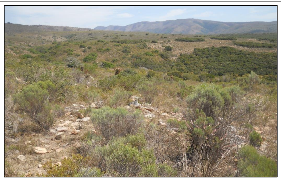
Figure 5: North Westerly View (Position 1)