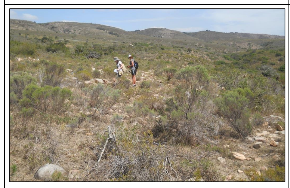
Figure 4: Westerly View (Position 1)