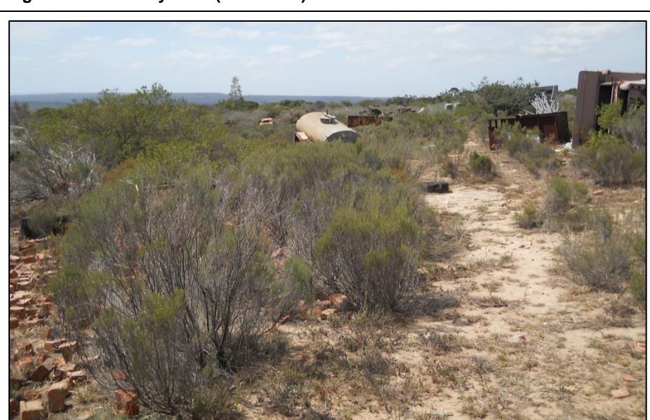
Figure 12: Easterly View (Position 2)