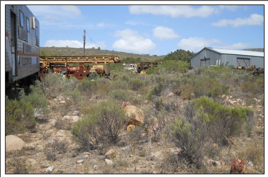
Figure 15: South Westerly View (Position 2)