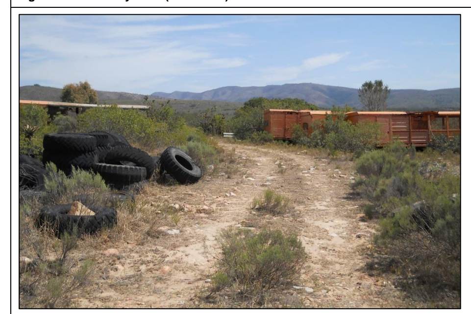
Figure 16: Westerly View (Position 2)