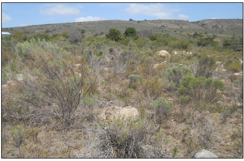
Figure 3: South Westerly View (Position 1)