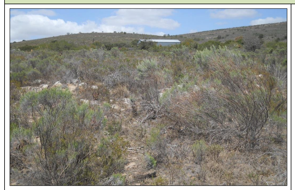
Figure 2: Southerly View (Position 1)