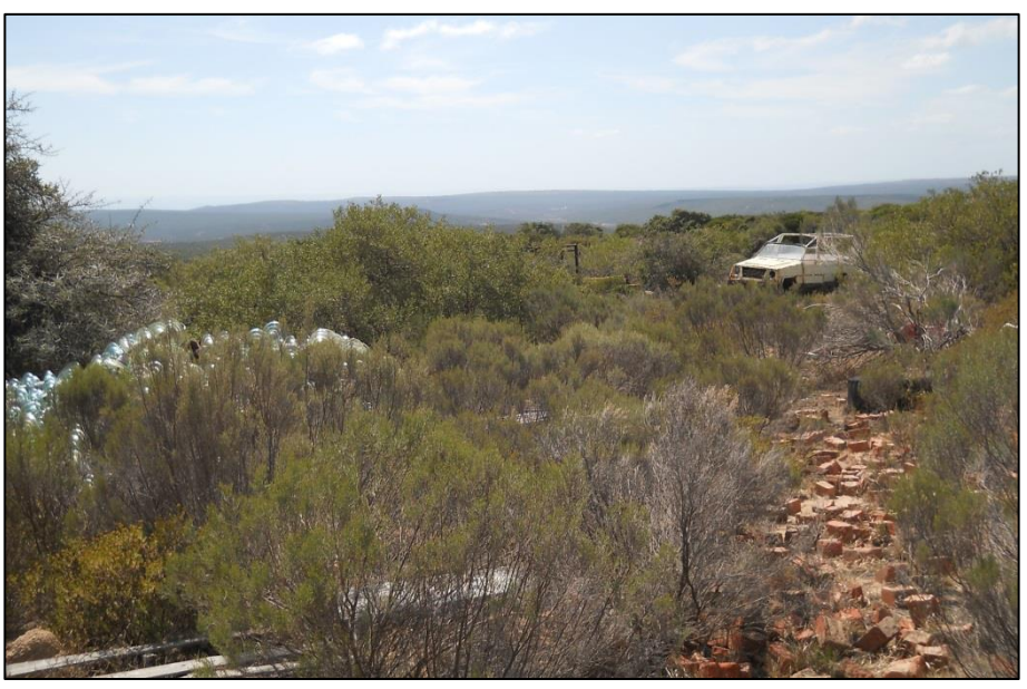
Figure 11: North Easterly View (Position 2)