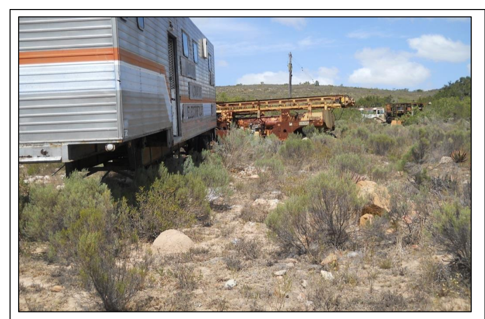
Figure 14: Southerly View (Position 2)