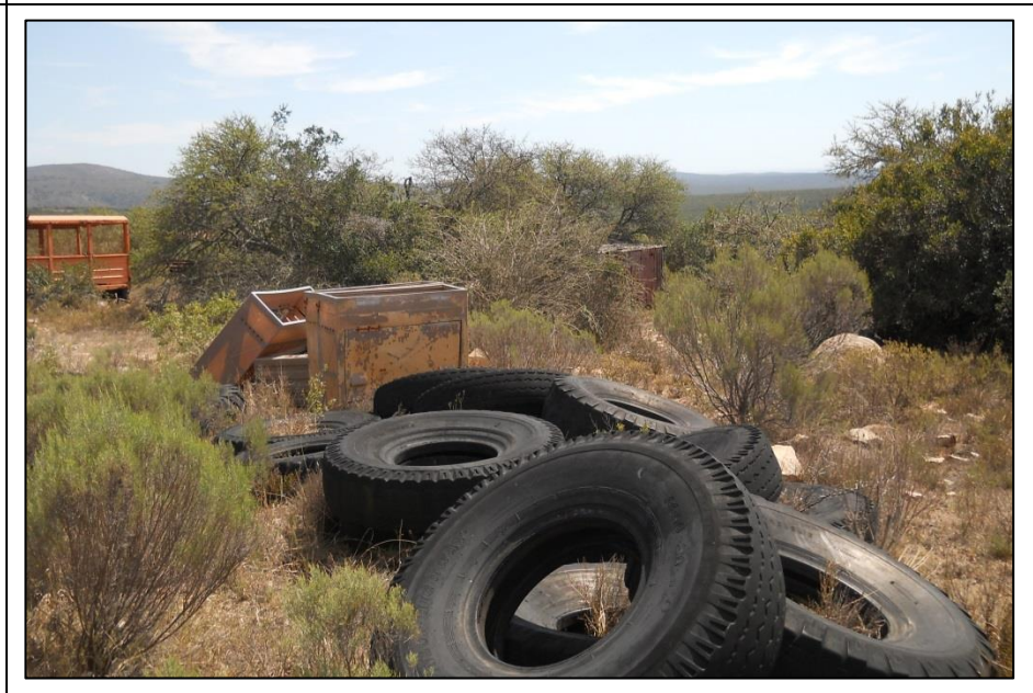
Figure 17: North Westerly View (Position 2)