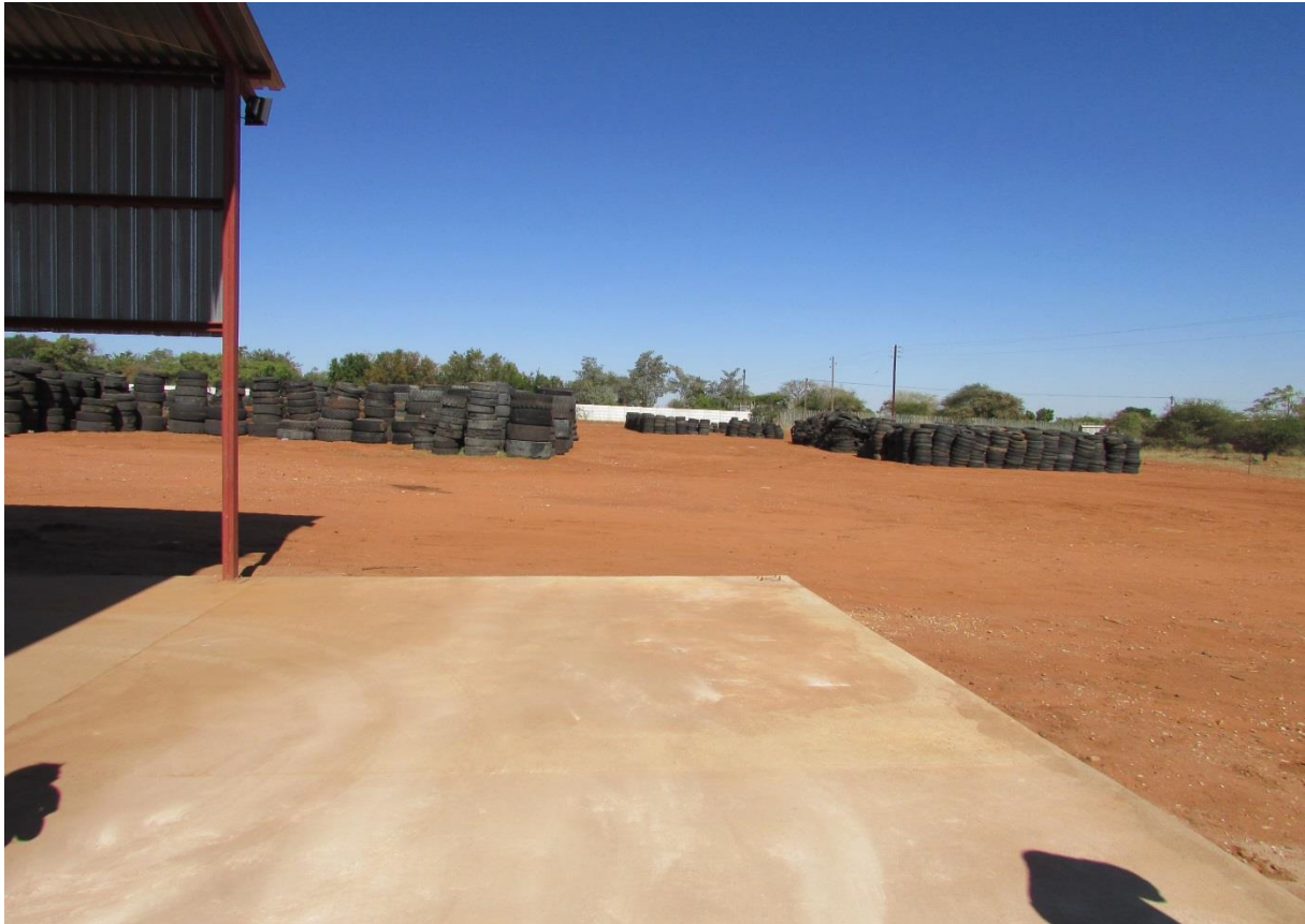
Figure 5: The majority (95%) of the site is exposed bare grounds with only paved surface where bailing is housed.