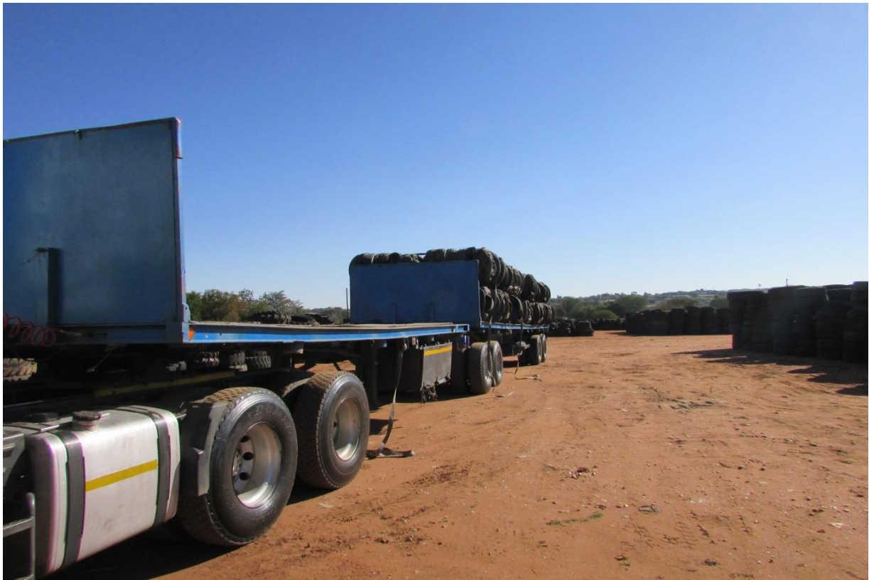
Figure 7: Haulage truck used to deliver tyres to site and from site