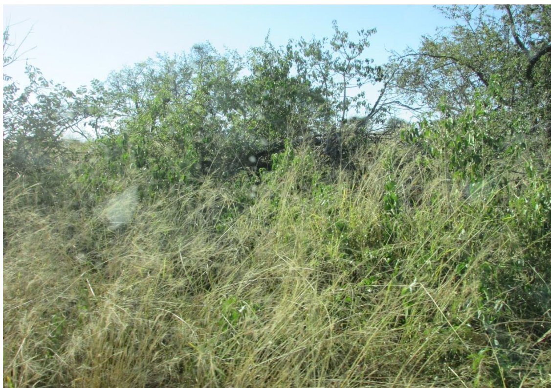
Figure 11: Overview of the land cover within the project area