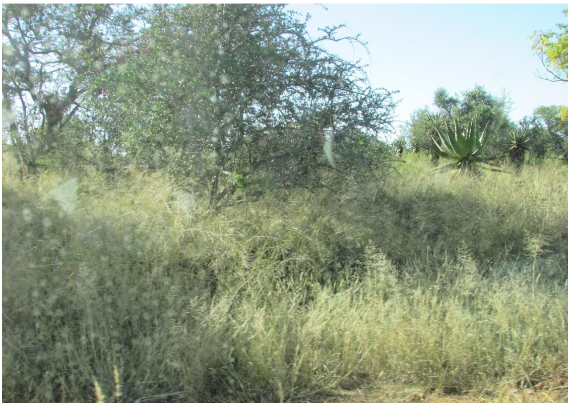
Figure 10: Overview of vegetation in the immediate environment (occurring in the East and northern boundaries of the site)