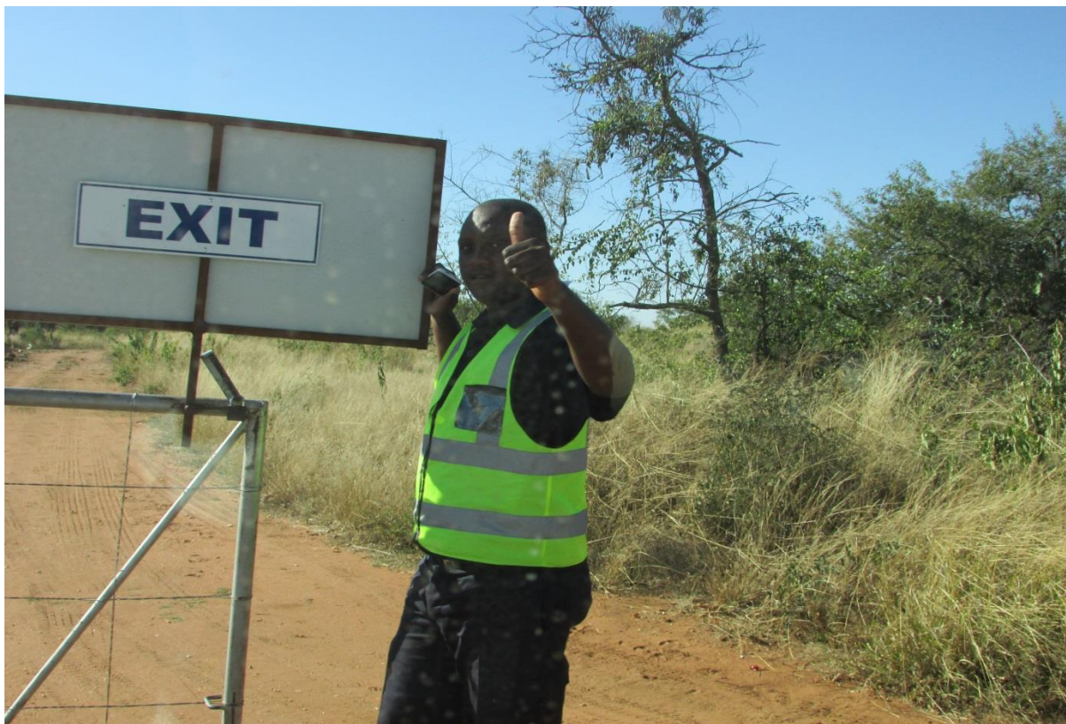
Figure 8 and 9: Entry and Exit point to Depot with security