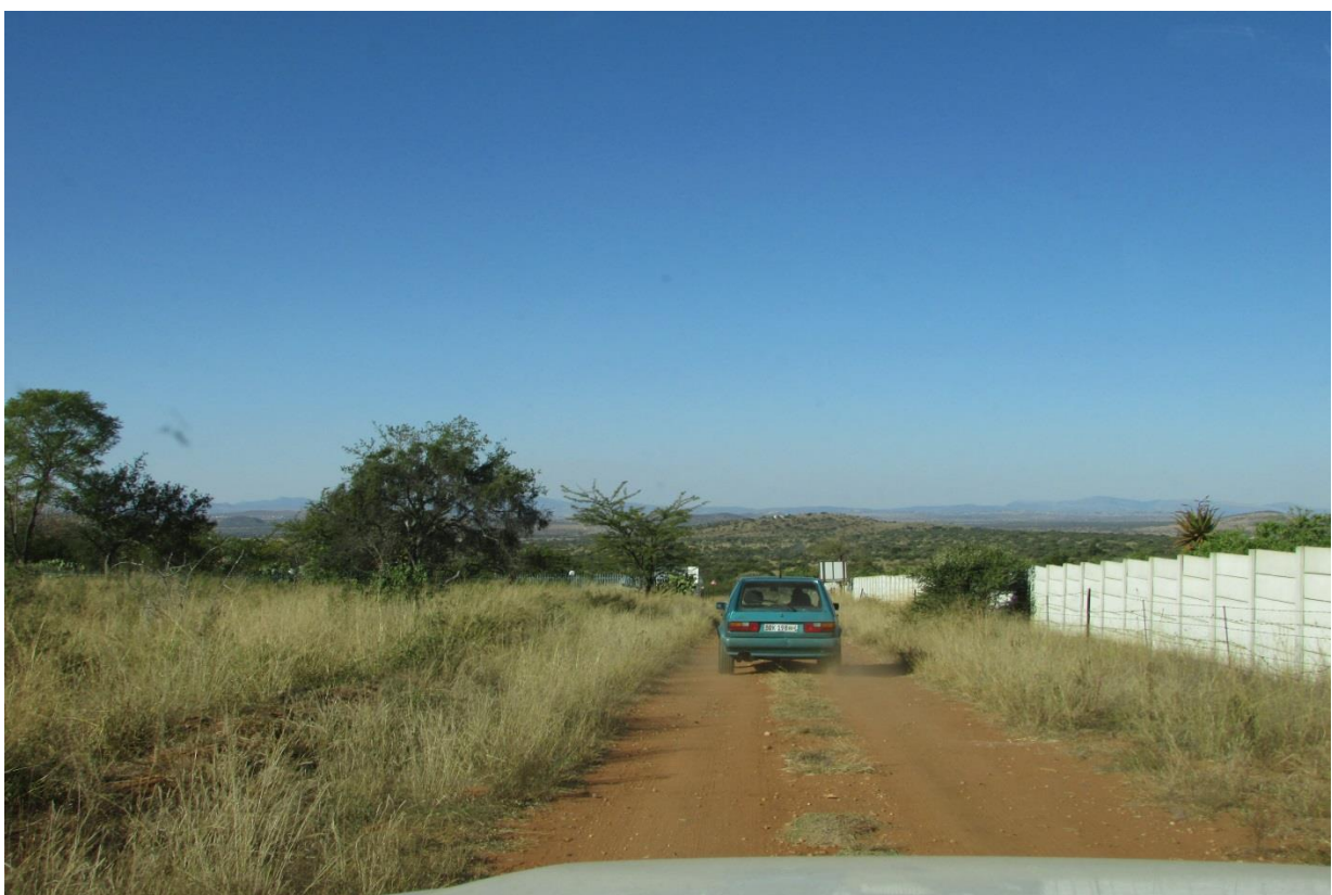
Figure 8: Already existing access road to site