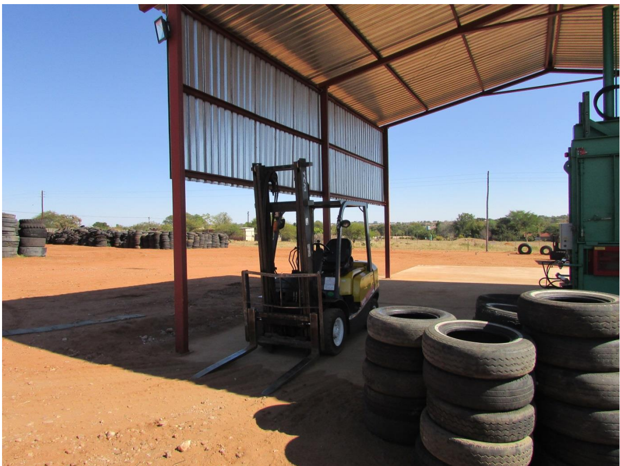
Figure 1 and 2: View to the baler and additional machinery used on site