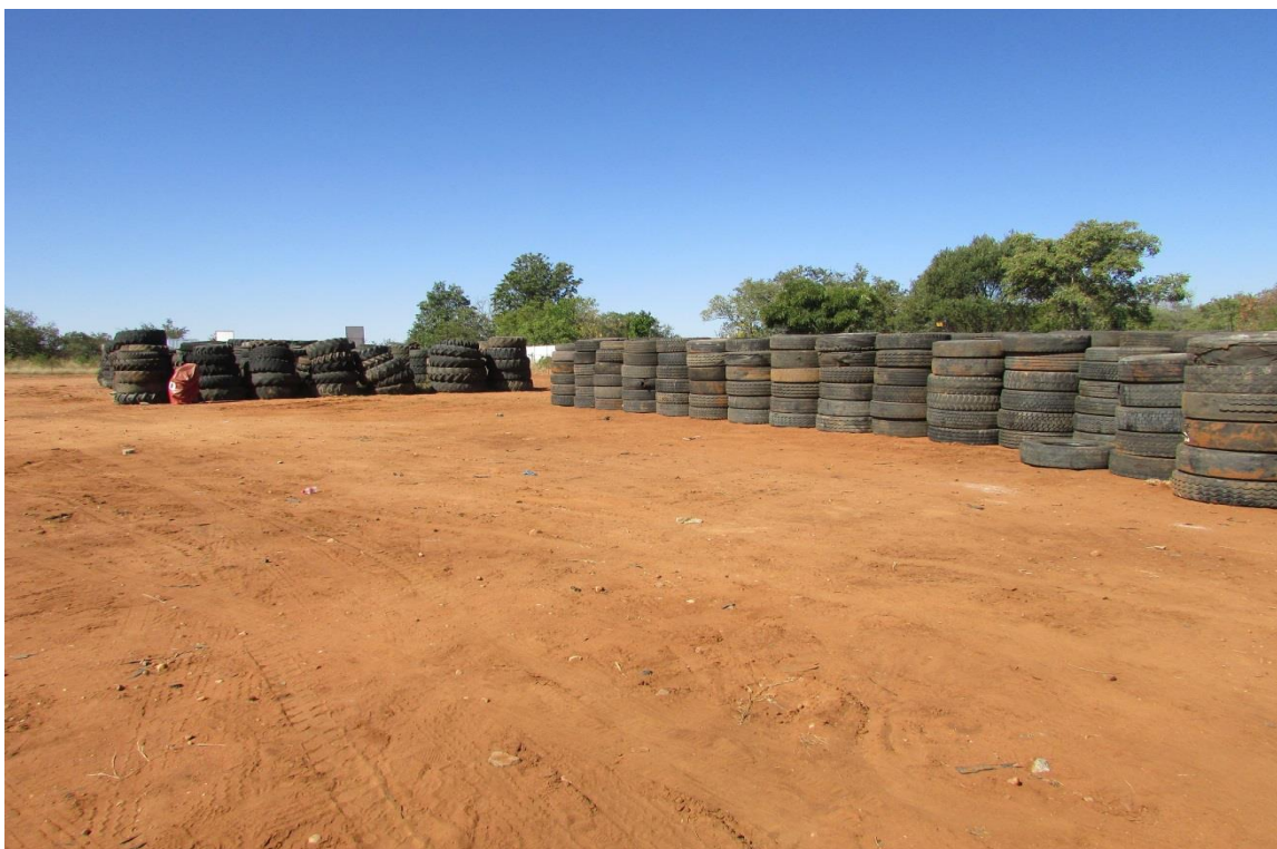
Figure 3 and 4: Storage of tyres prior to bailing and transportation to recyclers