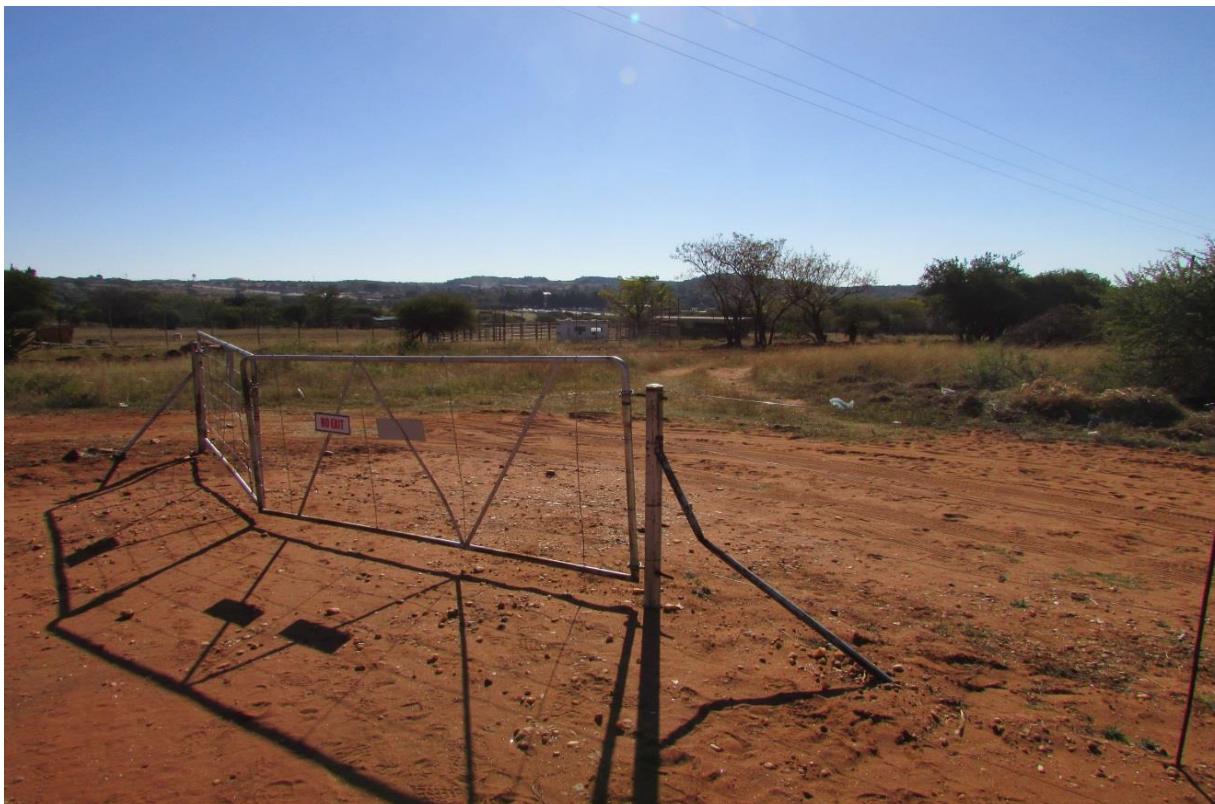
Figure 6: Fencing on site