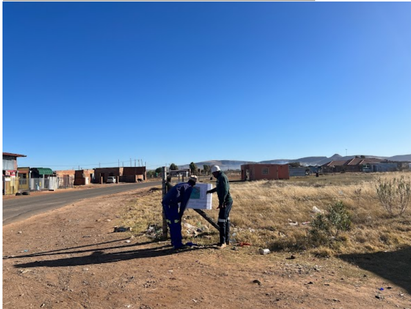
Site Notice 9

A1 Notice: 04/10/2022 14:39:25; GPS Coordinates: -27.369420, 23.402850