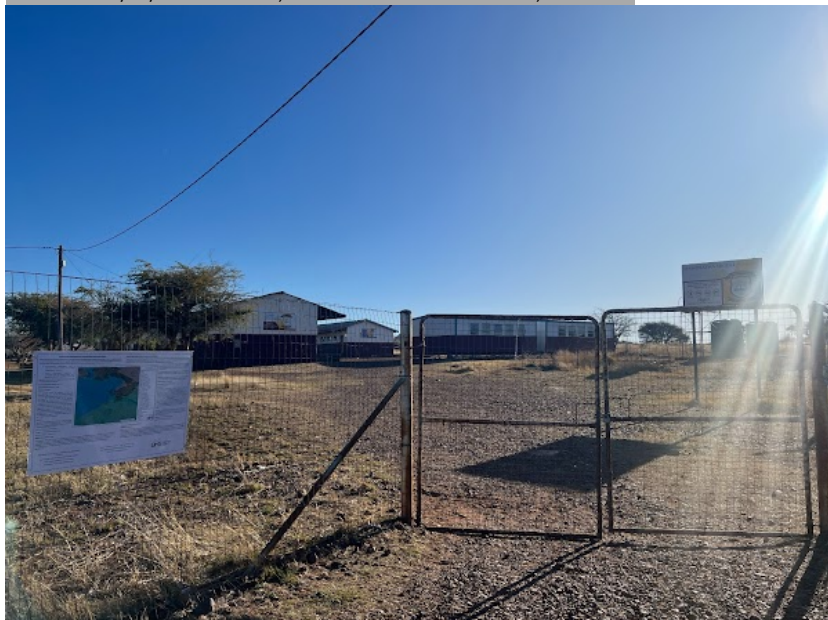
Site Notice 12

A1 Notice: 04/10/2022 14:57:13; GPS Coordinates: -27.378380, 23.390080