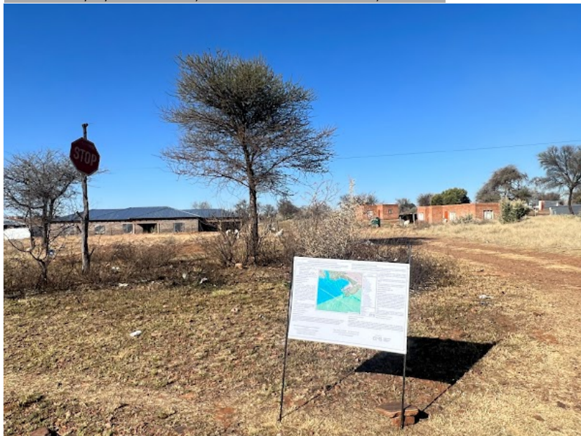
Site Notice 3

A1 Notice: 04/10/2022 14:24:39; GPS Coordinates: -27.384100, 23.383540