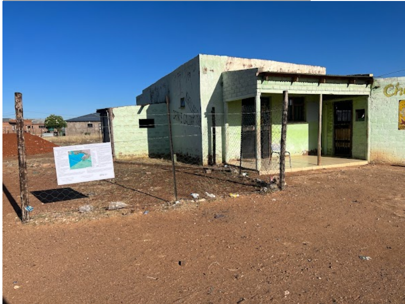
Site Notice 10

A1 Notice: 04/10/2022 14:52:44; GPS Coordinates: -27.371690, 23.400060