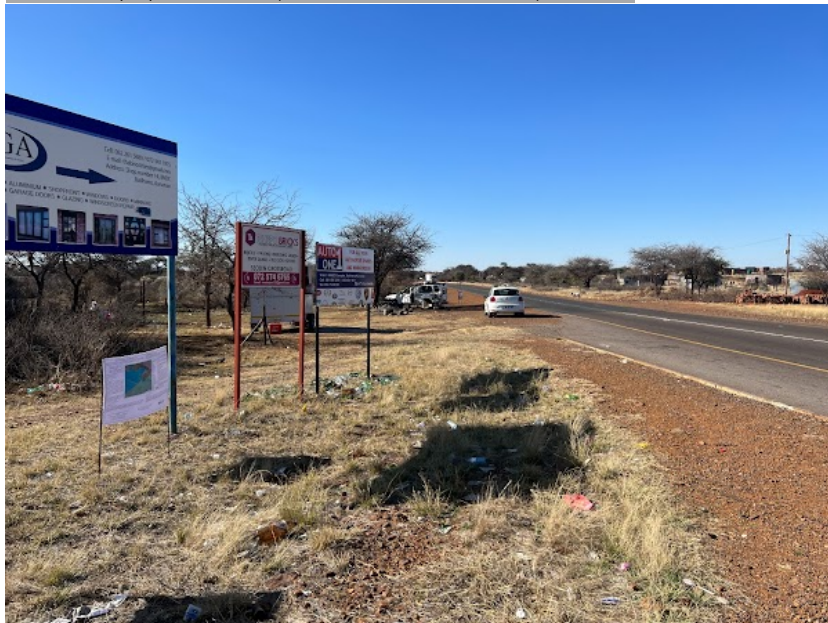
Site Notice 2

A1 Notice: 04/10/2022 14:21:52; GPS Coordinates: -27.386590, 23.383360