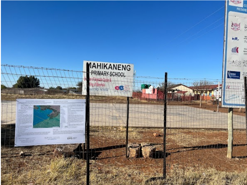
Site Notice 6

A1 Notice: 04/10/2022 14:33:06; GPS Coordinates: -27.379340, 23.389640