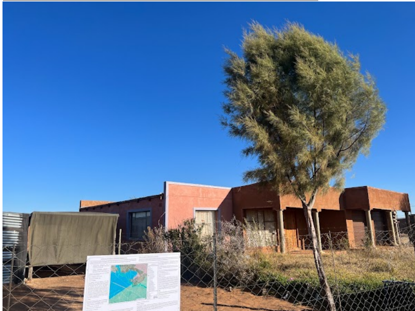
Site Notice 8

A1 Notice: 04/10/2022 14:51:06; GPS Coordinates: -27.370280, 23.402200