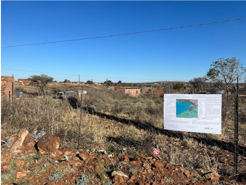
Site Notice 5

A1 Notice: 04/10/2022 14:29:07; GPS Coordinates: -27.379840, 23.386810