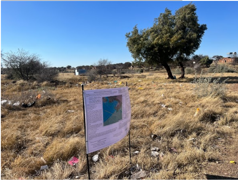
Site Notice 4

A1 Notice: 04/10/2022 14:27:02; GPS Coordinates: -27.380450, 23.382320