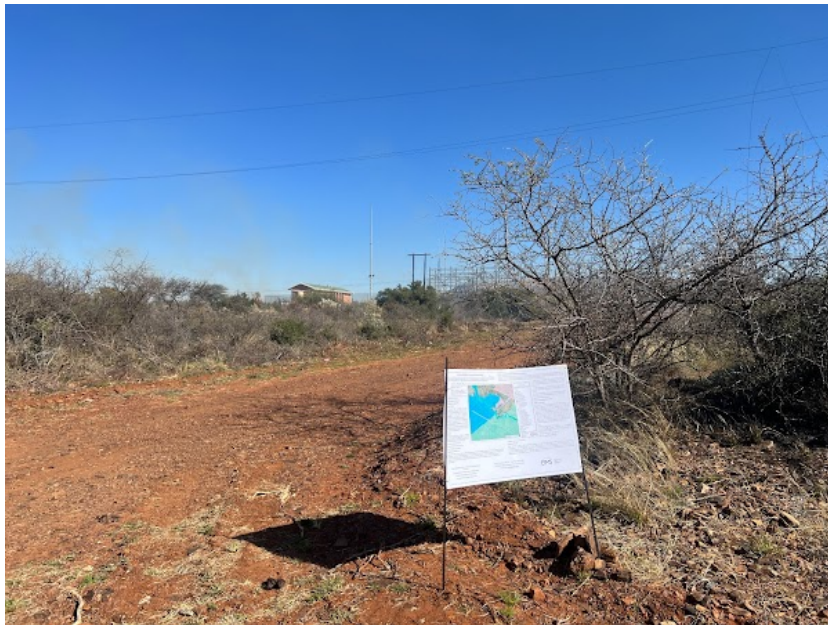
Site Notice 1

A1 Notice: 04/10/2022 14:21:52; GPS Coordinates: -27.386590, 23.383360