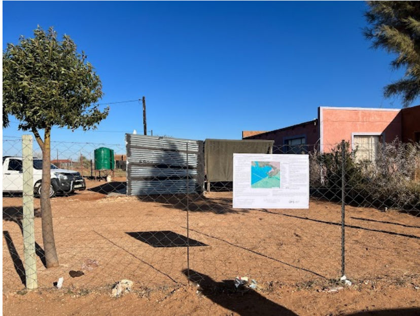
Site Notice 7

A1 Notice: 04/10/2022 14:34:53; GPS Coordinates: -27.370330, 23.402280