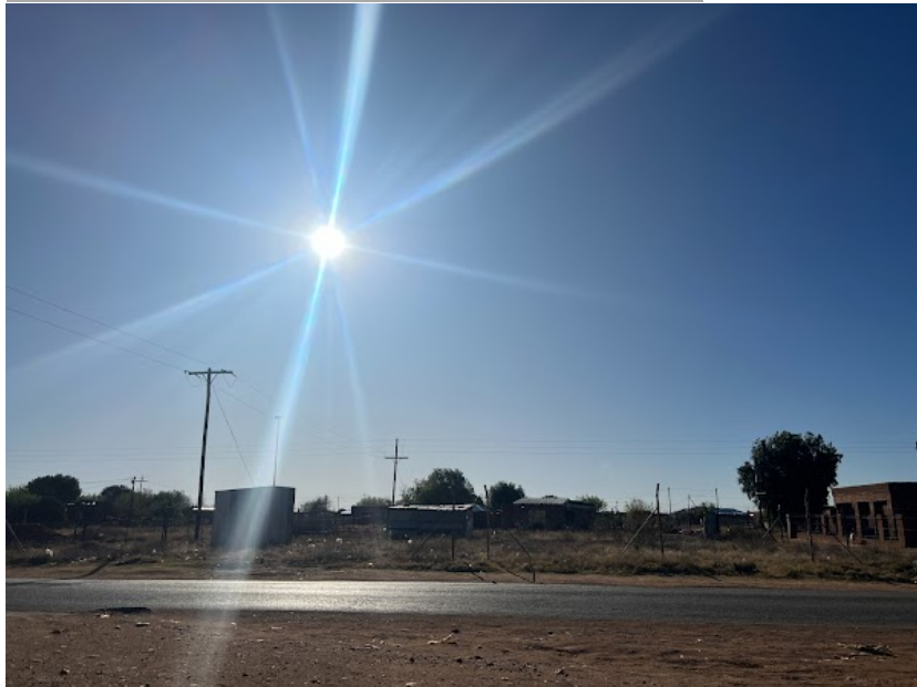
Site Notice 11

A1 Notice: 04/10/2022 14:54:38; GPS Coordinates: -27.371870, 23.399820