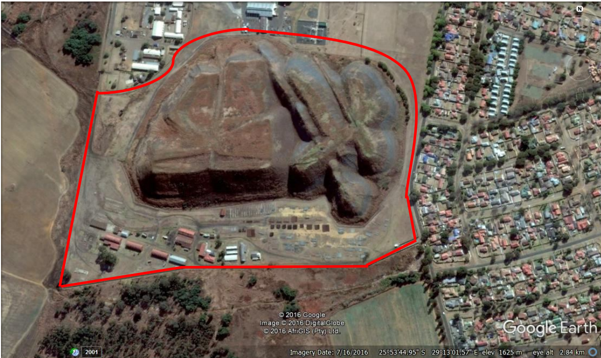
Figure 2: Picture showing the location of dump and its boundaries