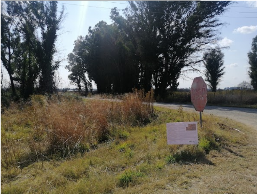
Site Notice 60

Site Notice: 17/05/2022 12:12:56; GPS Coordinates: -28.132930, 26.585377