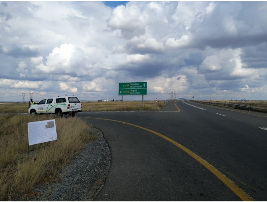
Site Notice 12

Site Notice: 18/05/2022 13:58:37; GPS Coordinates: -28.199309, 26.776521