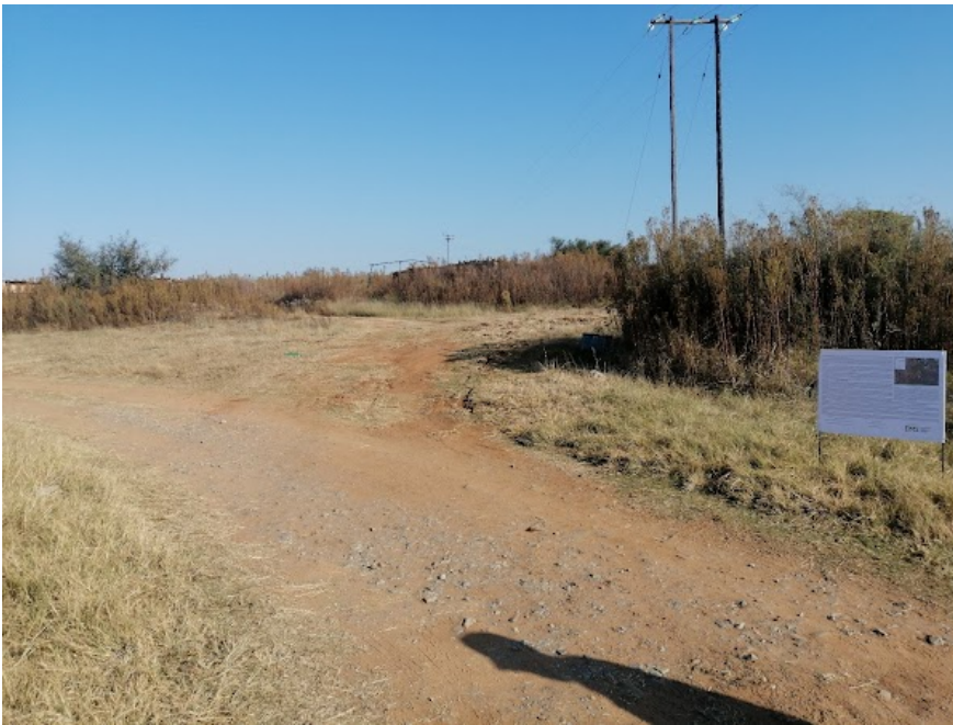
Site Notice 66

Site Notice: 17/05/2022 09:16:38; GPS Coordinates: -28.109479, 26.715651