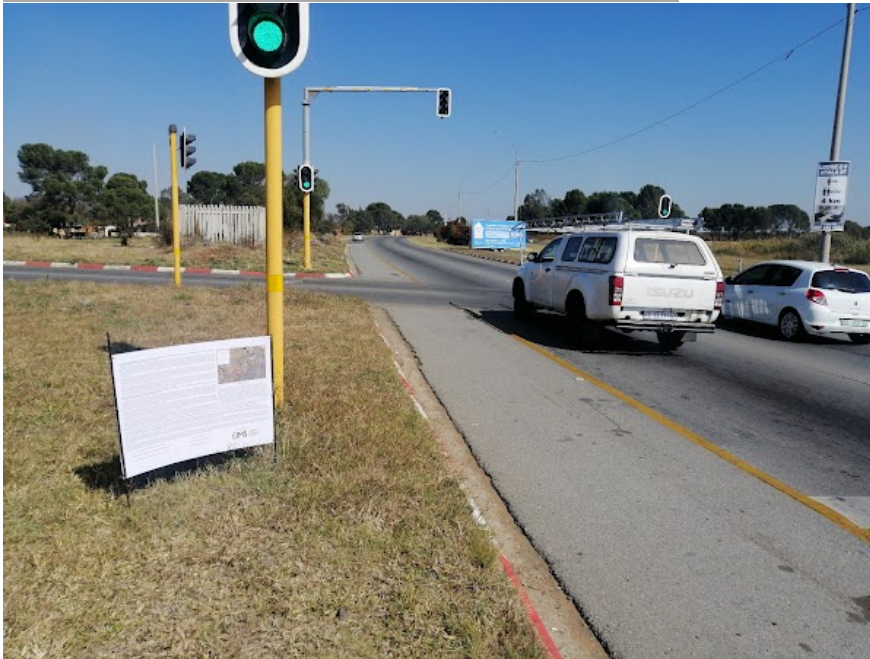
Site Notice 73

Site Notice: 16/05/2022 11:50:25; GPS Coordinates: -27.962702, 26.771810