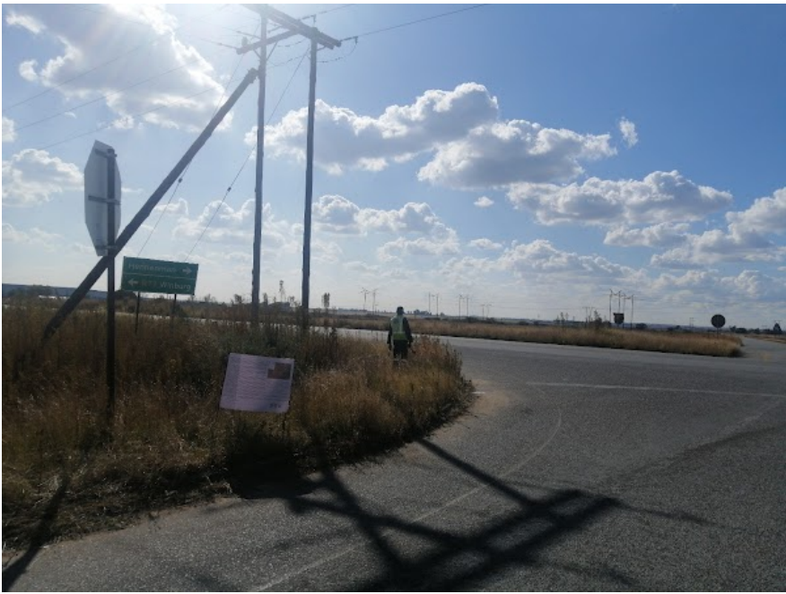
Site Notice 62

Site Notice: 16/05/2022 14:25:57; GPS Coordinates: -28.106508, 26.867134