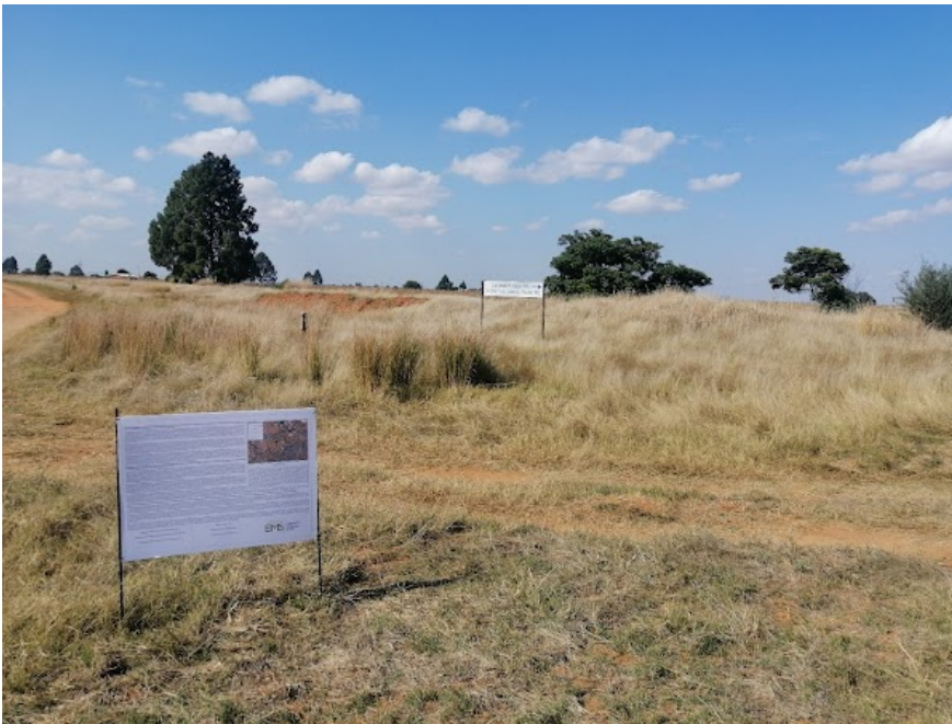
Site Notice 34

Site Notice: 17/05/2022 11:34:08; GPS Coordinates: -28.114032, 26.640276