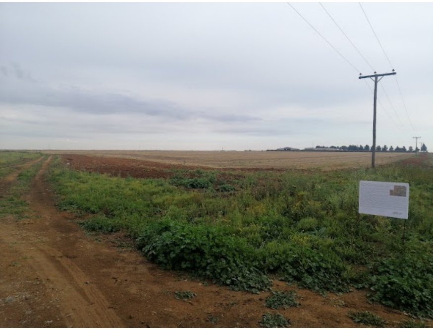
Site Notice 28

Site Notice: 18/05/2022 09:20:11; GPS Coordinates: -28.244722, 26.707151