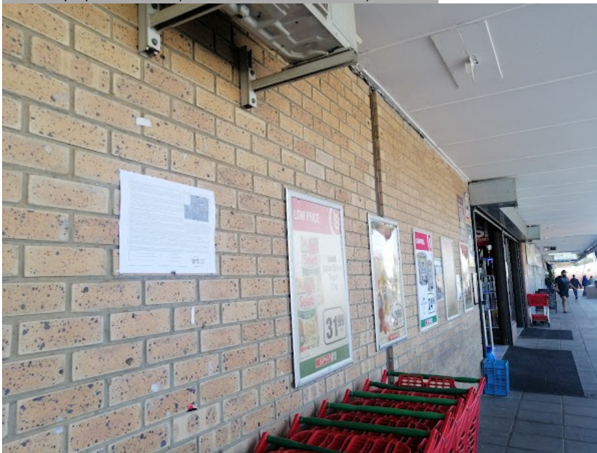
Welkom Spar Poster

Poster: 16/05/2022 12:52:12; GPS Coordinates: -27.993630, 26.747201