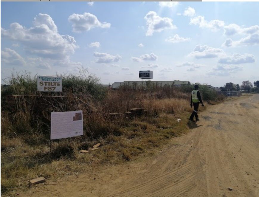
Site Notice 70

Site Notice: 17/05/2022 13:11:40; GPS Coordinates: -28.153757, 26.712795