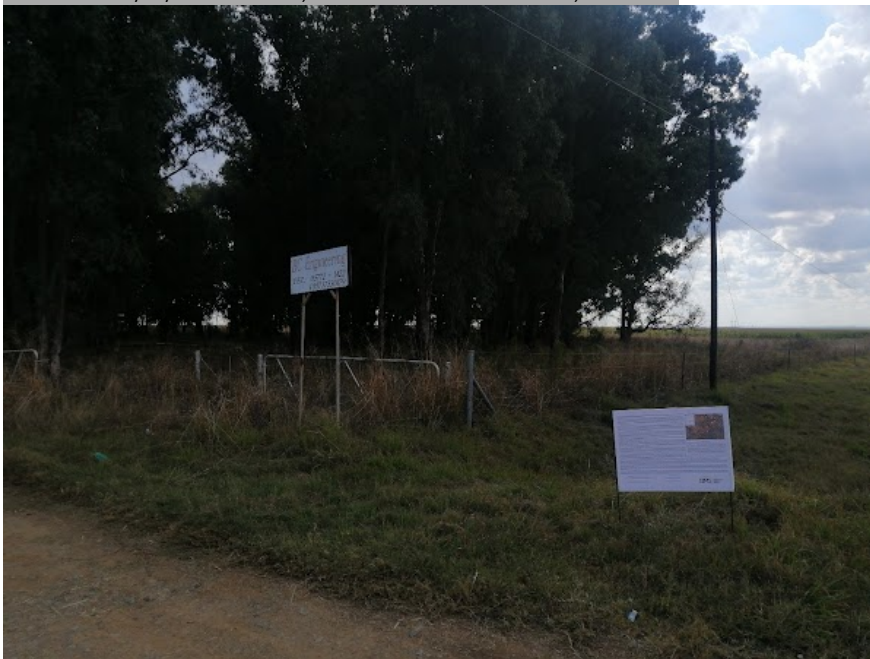
Site Notice 78

Site Notice: 18/05/2022 12:36:58; GPS Coordinates: -28.255366, 26.760867