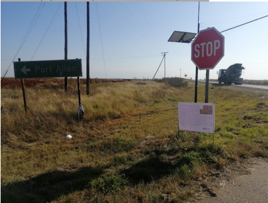
Site Notice 9

Site Notice: 17/05/2022 09:16:38; GPS Coordinates: -28.109479, 26.715651