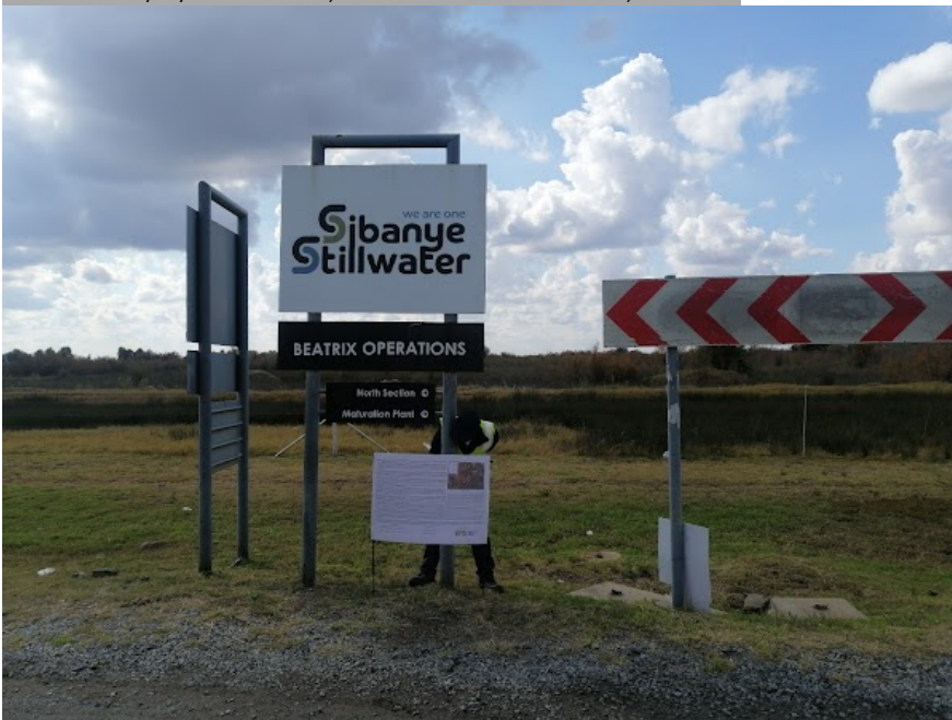
Site Notice 18

Site Notice: 18/05/2022 13:00:57; GPS Coordinates: -28.254984, 26.782281