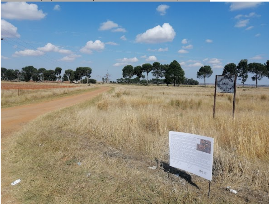
Site Notice 5

Site Notice: 17/05/2022 11:34:08; GPS Coordinates: -28.114032, 26.640276