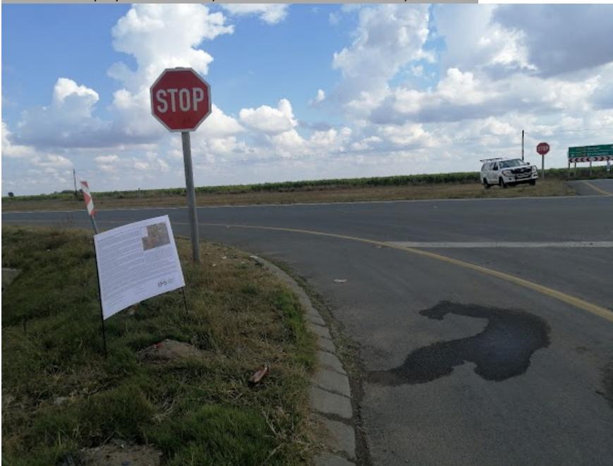
Site Notice 45

Site Notice: 18/05/2022 12:46:54; GPS Coordinates: -28.245680, 26.763871