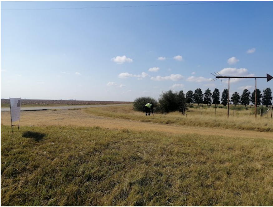
Site Notice 71