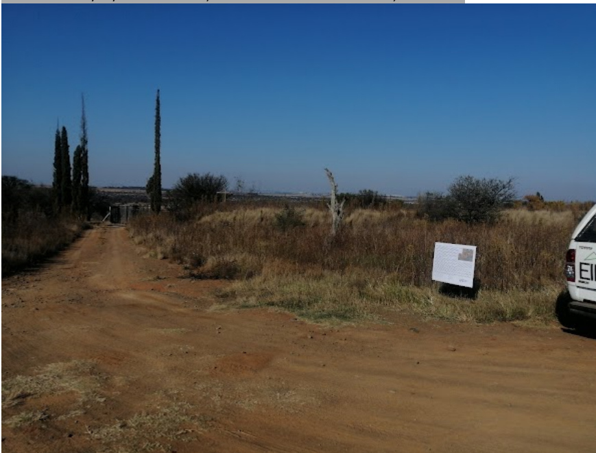
Site Notice 58

Site Notice: 17/05/2022 09:35:32; GPS Coordinates: -28.097363, 26.753122