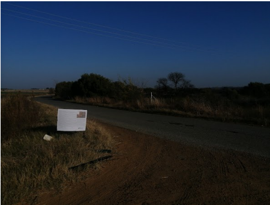
Site Notice 39

Site Notice: 17/05/2022 08:37:10; GPS Coordinates: -28.115835, 26.757307