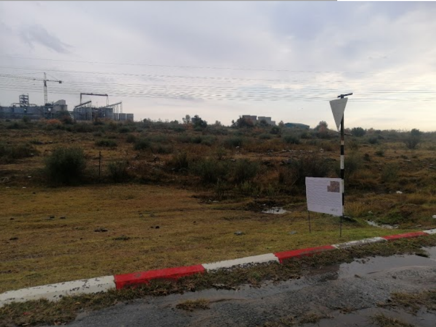
Site Notice 44

Site Notice: 18/05/2022 08:33:40; GPS Coordinates: -28.190316, 26.727897