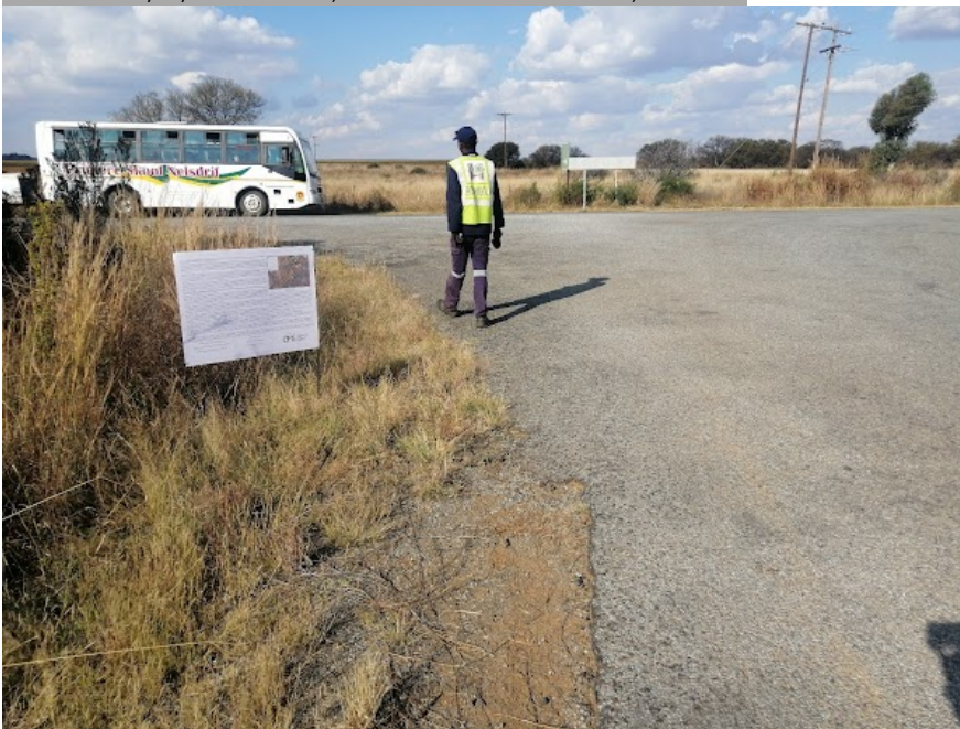
Site Notice 59

Site Notice: 17/05/2022 14:44:07; GPS Coordinates: -28.285618, 26.646025