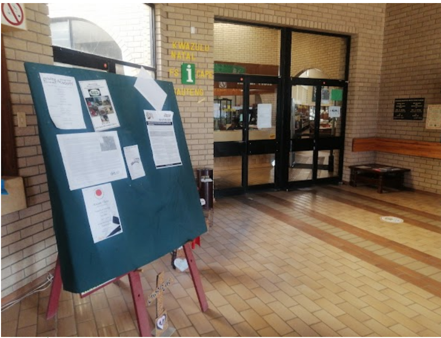
Virginia Library Poster

Poster: 16/05/2022 14:55:18; GPS Coordinates: -28.107466, 26.864040