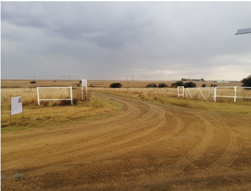
Site Notice 69