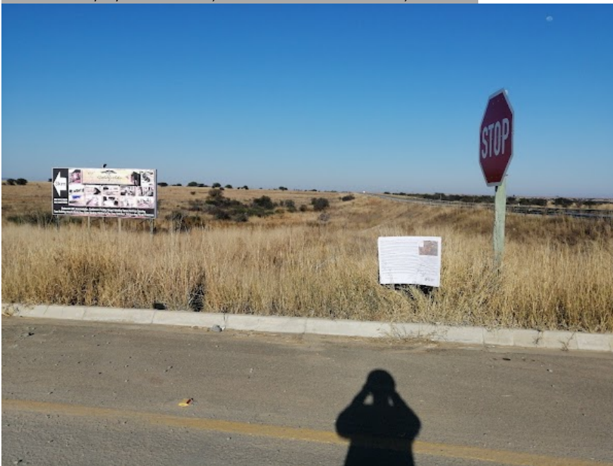
Site Notice 36

Site Notice: 19/05/2022 08:44:24; GPS Coordinates: -28.179992, 26.810402