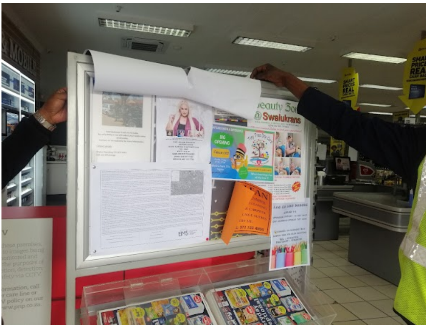
Virginia Pick 'n Pay

Poster: 16/05/2022 14:42:46; GPS Coordinates: -28.107096, 26.869040