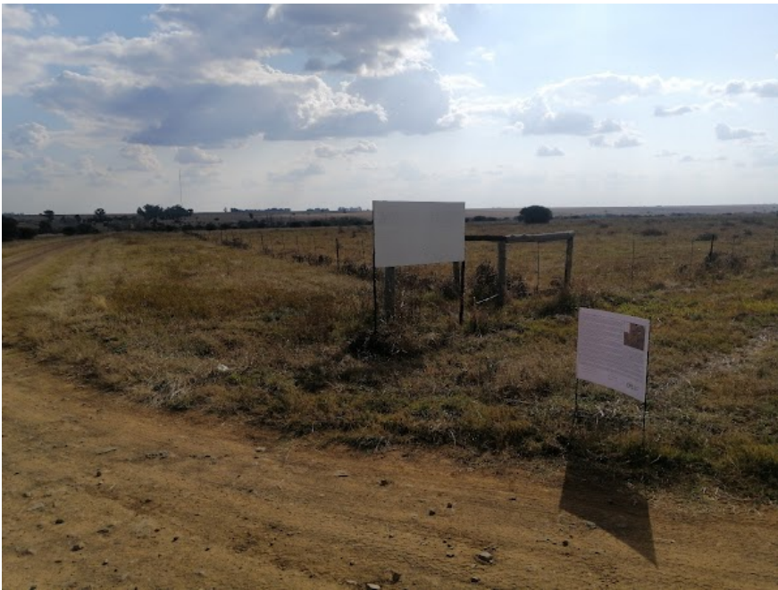
Site Notice 75

Site Notice: 17/05/2022 14:44:07; GPS Coordinates: -28.285618, 26.646025