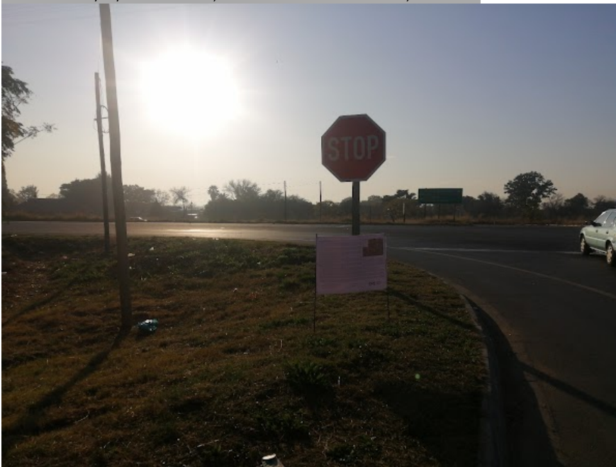
Site Notice 1

Site Notice: 17/05/2022 07:56:45; GPS Coordinates: -28.121425, 26.836078