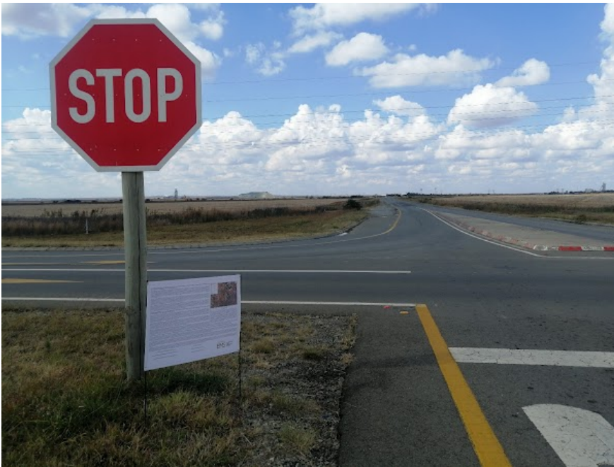
Site Notice 46

Site Notice: 18/05/2022 12:46:54; GPS Coordinates: -28.245680, 26.763871