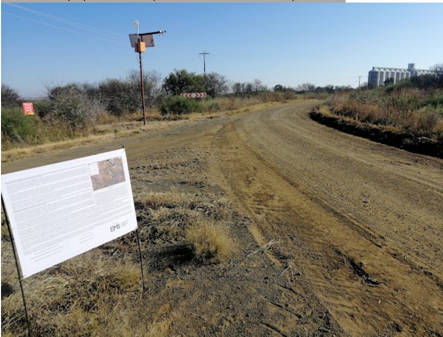
Site Notice 61

Site Notice: 19/05/2022 09:02:04; GPS Coordinates: -28.219207, 26.824884