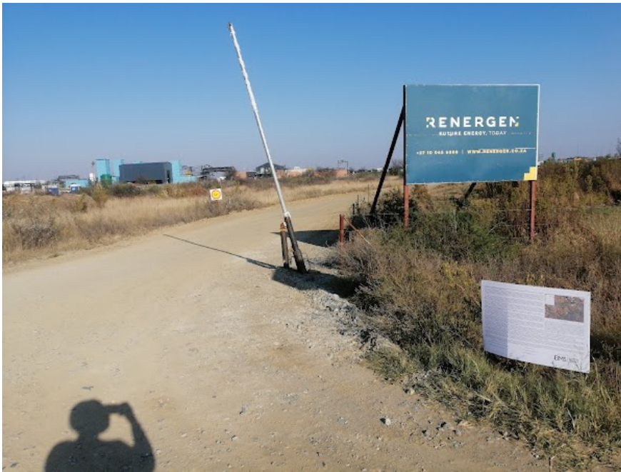
Site Notice 63 Tetra4 Entrance

Site Notice: 17/05/2022 09:05:06; GPS Coordinates: -28.119965, 26.721433