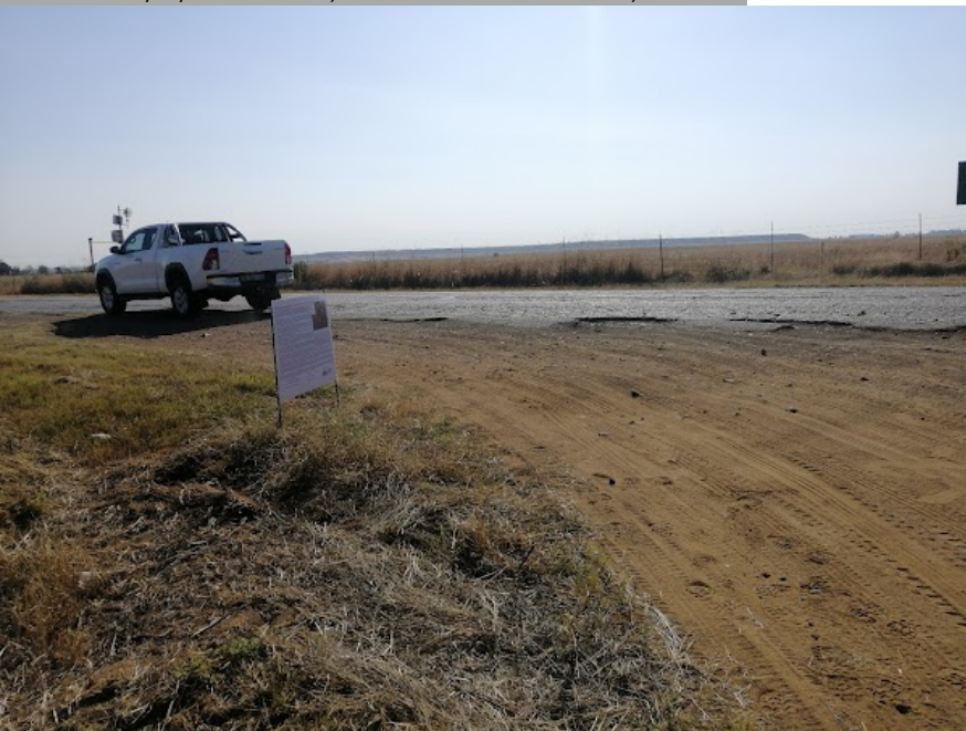
Site Notice 3

Site Notice: 17/05/2022 10:17:41; GPS Coordinates: -28.057363, 26.696523