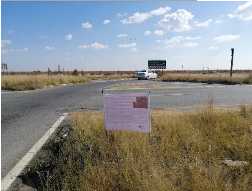
Site Notice 64

Site Notice: 16/05/2022 13:28:45; GPS Coordinates: -28.070246, 26.827244