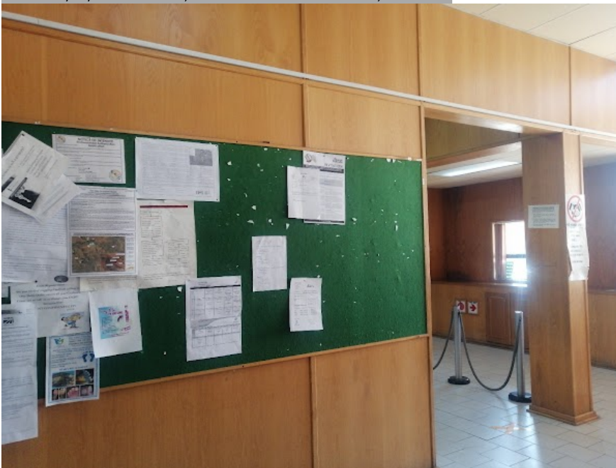
Virginia Municipality Poster

Poster: 16/05/2022 14:55:18; GPS Coordinates: -28.107466, 26.864040