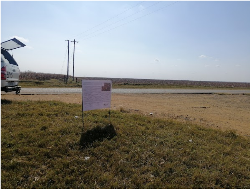
Site Notice 71 - angle

Site Notice: 17/05/2022 11:26:17; GPS Coordinates: -28.117739, 26.642116