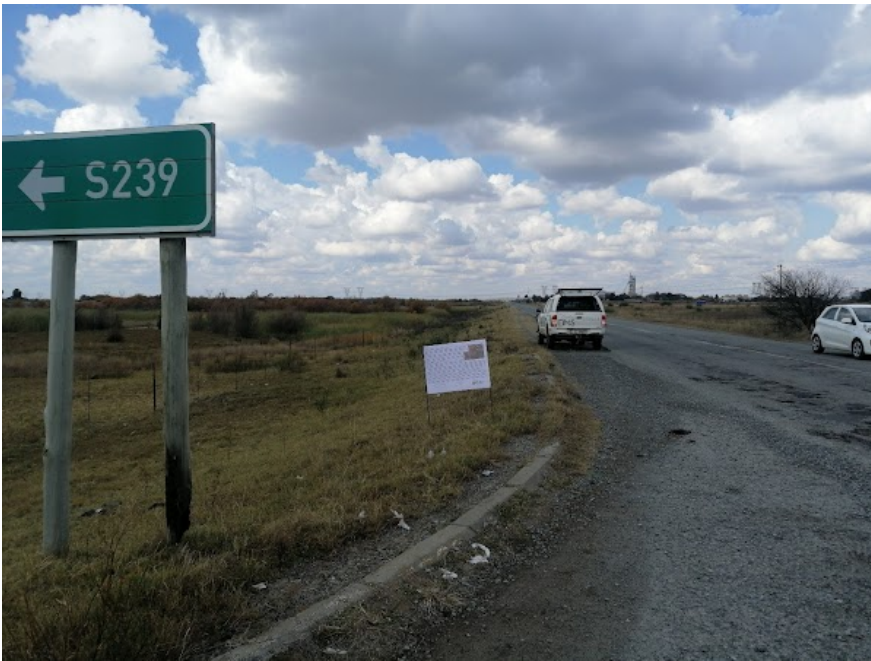
Site Notice 16

Site Notice: 18/05/2022 13:00:57; GPS Coordinates: -28.254984, 26.782281