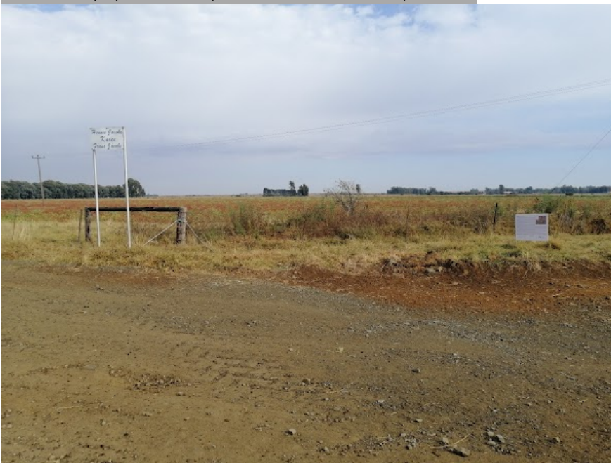
Site Notice 22

Site Notice: 18/05/2022 09:50:40; GPS Coordinates: -28.273560, 26.718454