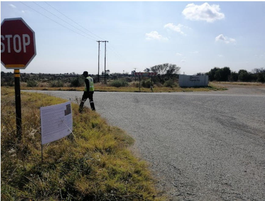
Site Notice 31

Site Notice: 17/05/2022 12:12:56; GPS Coordinates: -28.132930, 26.585377