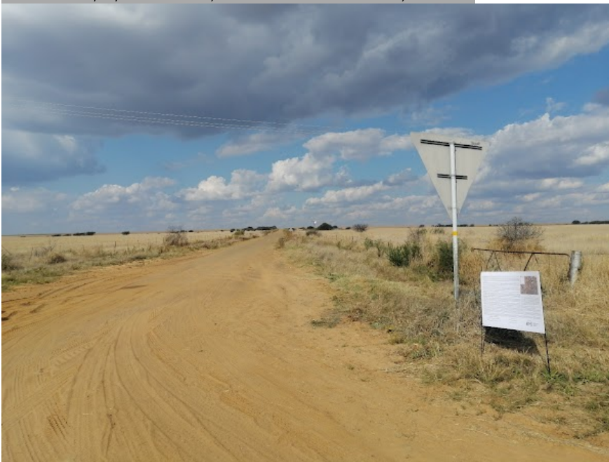
Site Notice 30

Site Notice: 17/05/2022 14:16:02; GPS Coordinates: -28.180543, 26.619509