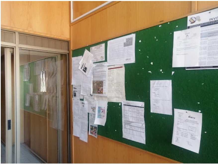
Virginia Municipality Poster - Entrance

Poster: 18/05/2022 11:07:45; GPS Coordinates: -28.410084, 26.707423