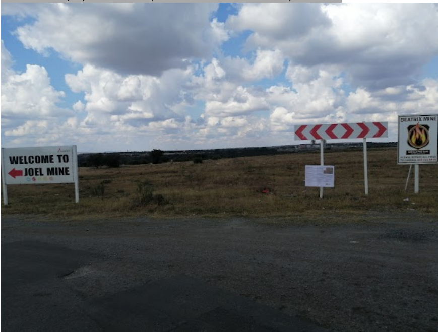
Site Notice 19

Site Notice: 18/05/2022 13:18:52; GPS Coordinates: -28.266278, 26.800603