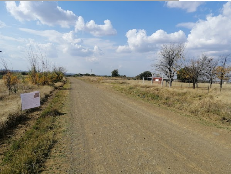
Site Notice 50

Site Notice: 17/05/2022 14:02:43; GPS Coordinates: -28.169073, 26.633108