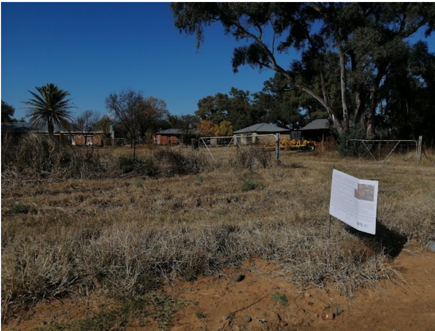
Site Notice 15

Site Notice: 19/05/2022 10:13:26; GPS Coordinates: -28.236600, 26.792107