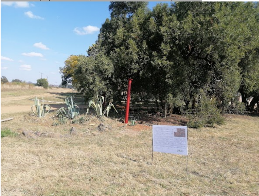
Site Notice 32

Site Notice: 17/05/2022 11:50:25; GPS Coordinates: -28.107256, 26.620189