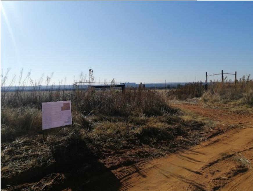
Site Notice 67

Site Notice: 19/05/2022 09:23:03; GPS Coordinates: -28.217665, 26.796763