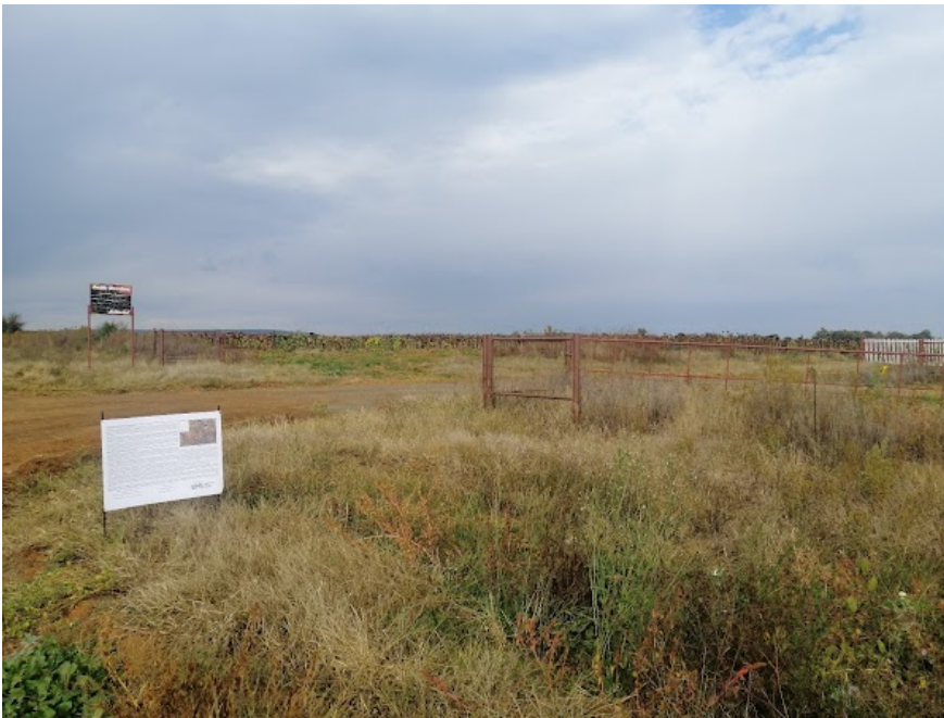
Site Notice 24

Site Notice: 18/05/2022 09:50:40; GPS Coordinates: -28.273560, 26.718454