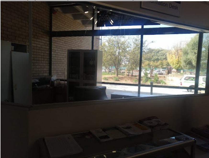
Handouts in Welkom library

Handout: 16/05/2022 12:12:19; GPS Coordinates: -27.978798, 26.737546