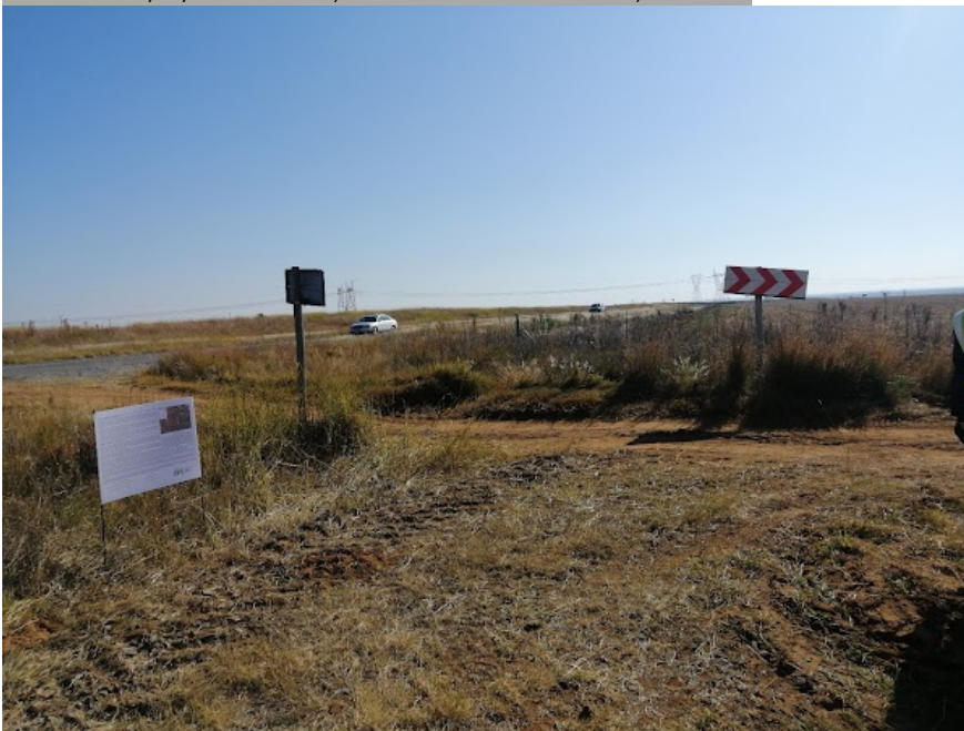
Site Notice 68

Site Notice: 19/05/2022 09:48:41; GPS Coordinates: -28.204543, 26.775050