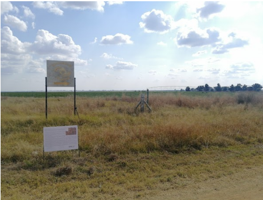
Site Notice 77

Site Notice: 17/05/2022 13:11:40; GPS Coordinates: -28.153757, 26.712795