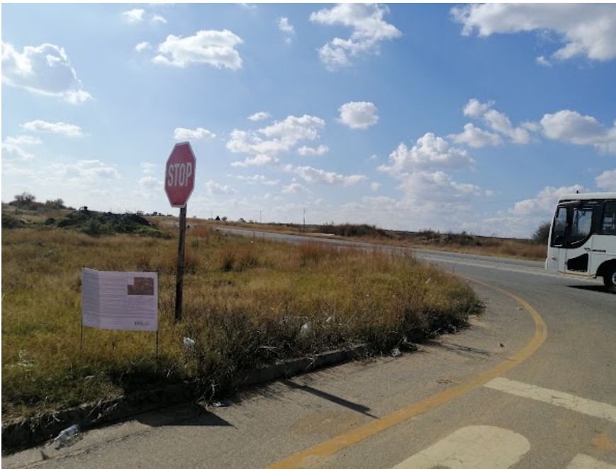
Site Notice 2 South angle

Background Information Document: 18/05/2022 11:10:01; GPS Coordinates: -28.399980, 26.712322