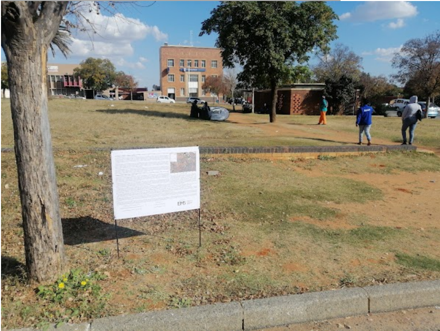
Site Notice 6

Site Notice: 16/05/2022 14:25:57; GPS Coordinates: -28.106508, 26.867134