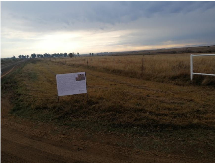
Site Notice 69 - angle

Site Notice: 18/05/2022 08:51:11; GPS Coordinates: -28.227245, 26.712720