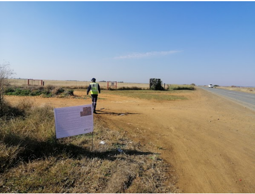
Site Notice 76

Site Notice: 17/05/2022 10:17:41; GPS Coordinates: -28.057363, 26.696523