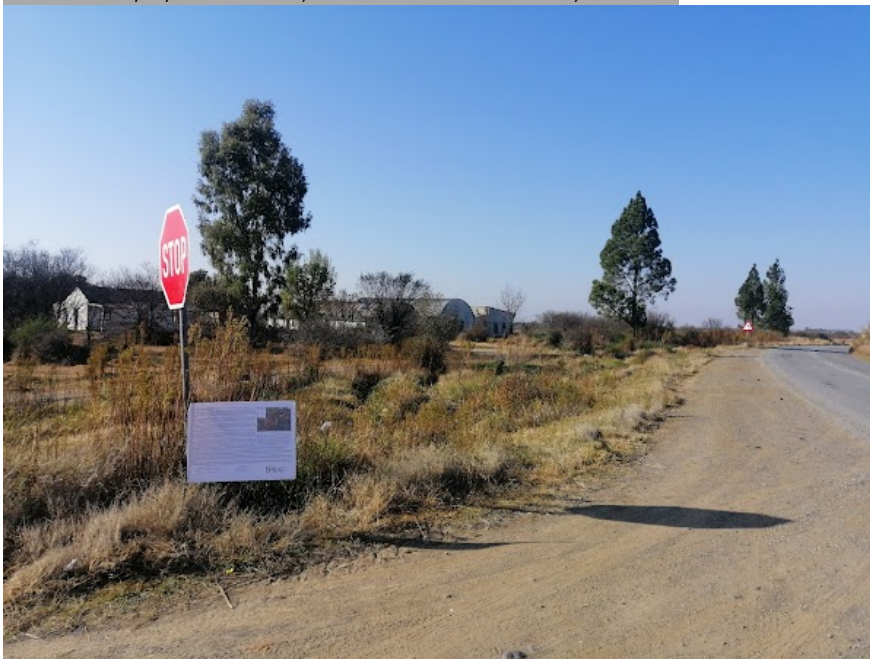
Site Notice 54

Site Notice: 17/05/2022 09:05:06; GPS Coordinates: -28.119965, 26.721433