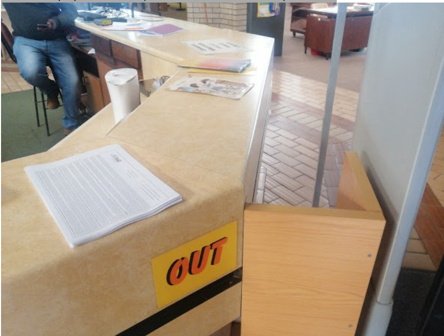
Virginia Library Handouts

Handout: 16/05/2022 14:41:23; GPS Coordinates: -28.107232, 26.869204