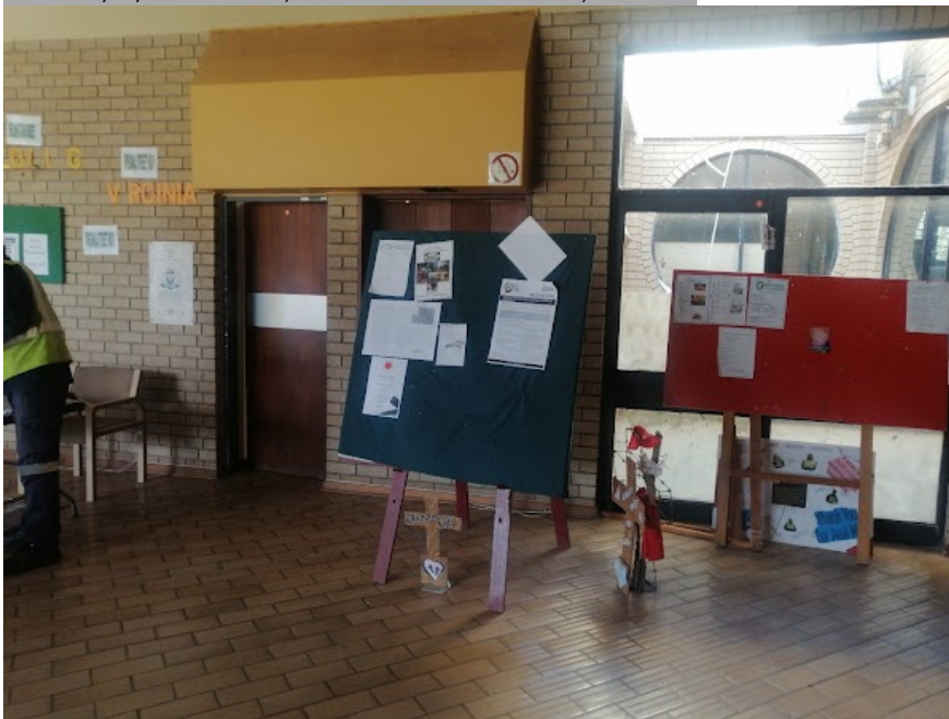
Virginia Library Poster

Poster: 16/05/2022 14:42:46; GPS Coordinates: -28.107096, 26.869040