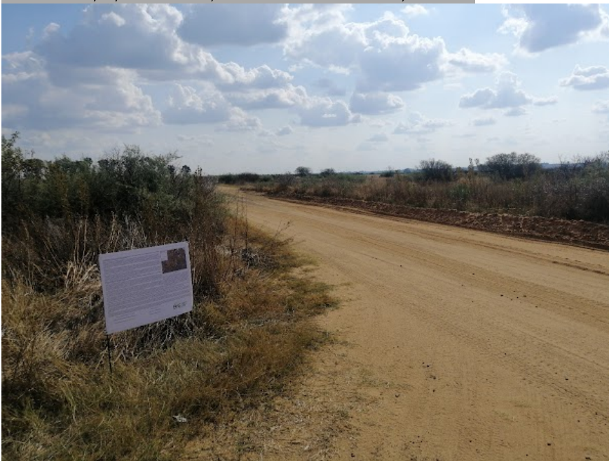
Site Notice 51

Site Notice: 17/05/2022 13:40:49; GPS Coordinates: -28.159365, 26.668827