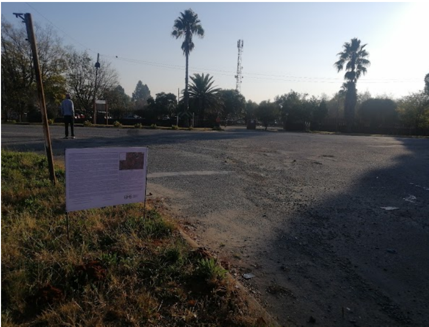
Site Notice 7

Site Notice: 17/05/2022 08:09:11; GPS Coordinates: -28.119428, 26.814031