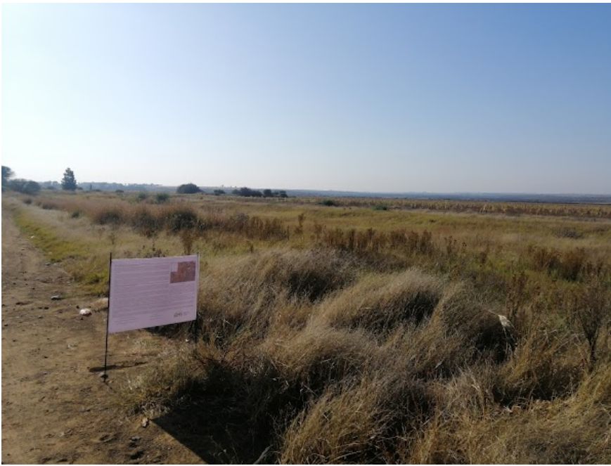
Site Notice 55

Site Notice: 17/05/2022 09:35:32; GPS Coordinates: -28.097363, 26.753122