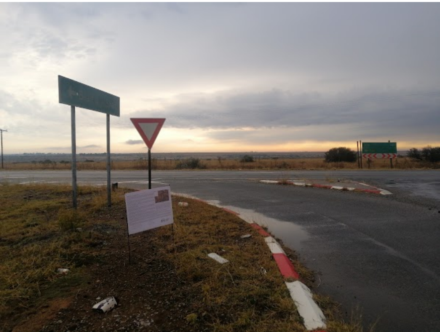
Site Notice 11

Site Notice: 18/05/2022 08:33:40; GPS Coordinates: -28.190316, 26.727897