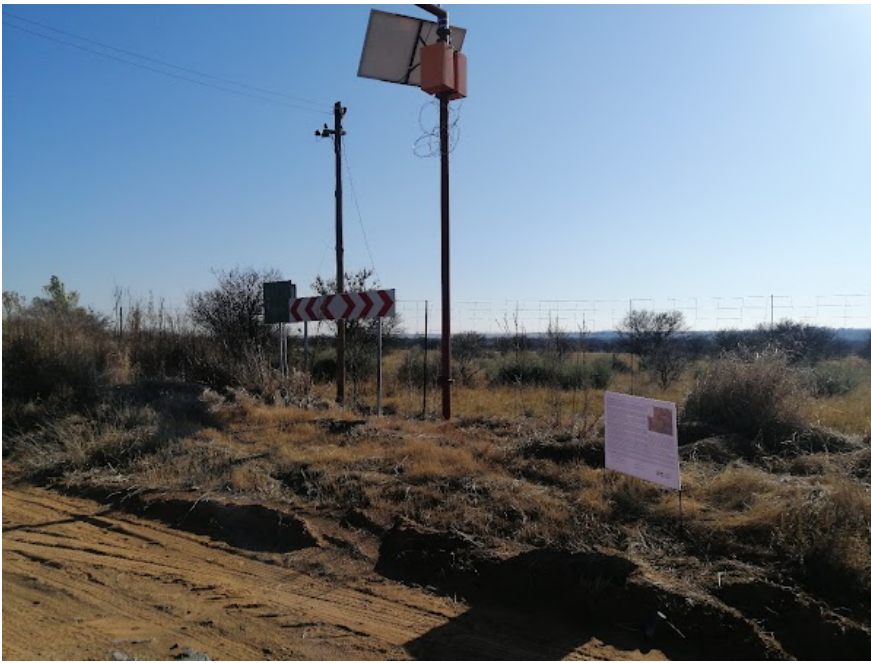
Site Notice 66

Site Notice: 19/05/2022 09:23:03; GPS Coordinates: -28.217665, 26.796763