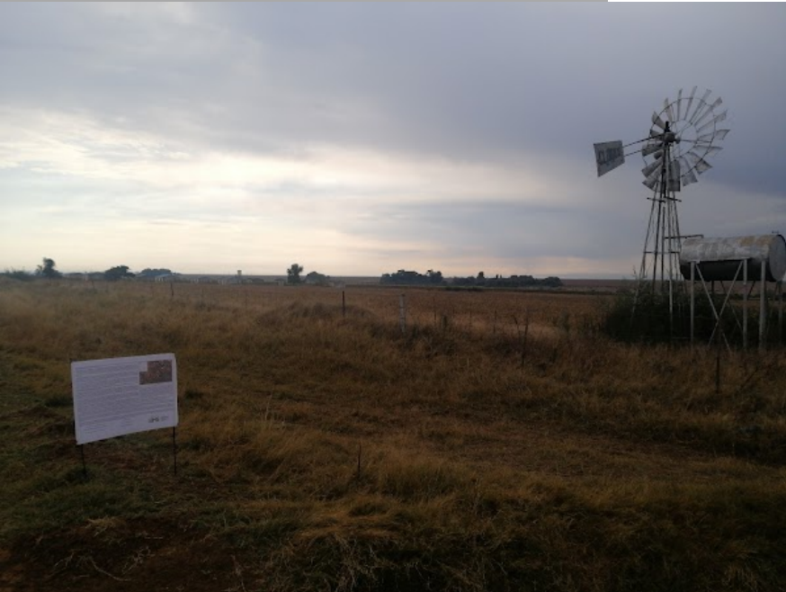
Site Notice 26

Site Notice: 18/05/2022 09:20:11; GPS Coordinates: -28.244722, 26.707151