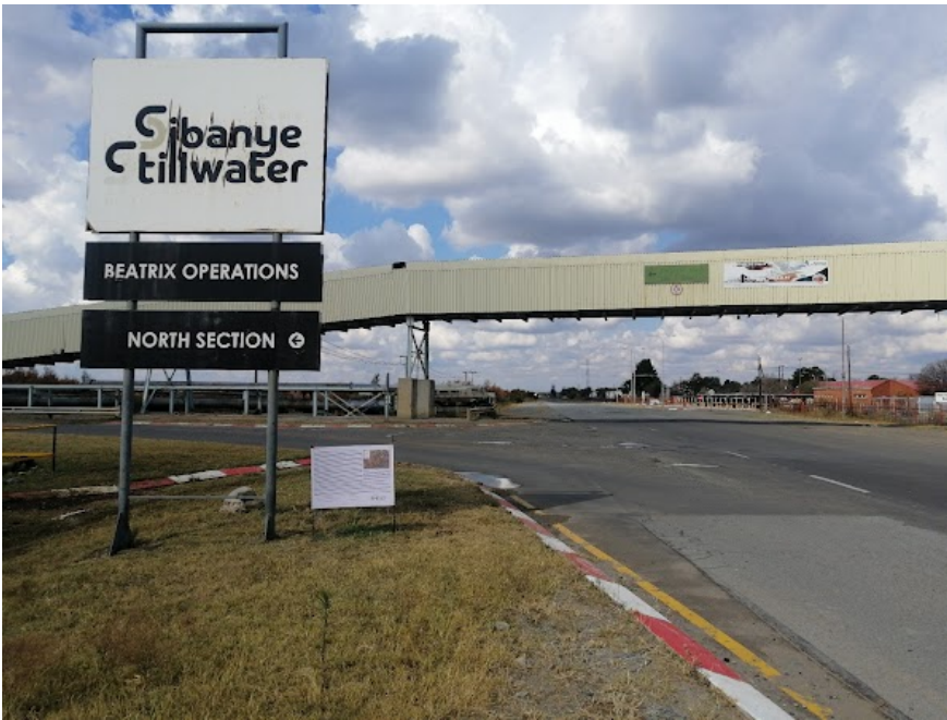
Site Notice 17

Site Notice: 18/05/2022 13:18:52; GPS Coordinates: -28.266278, 26.800603