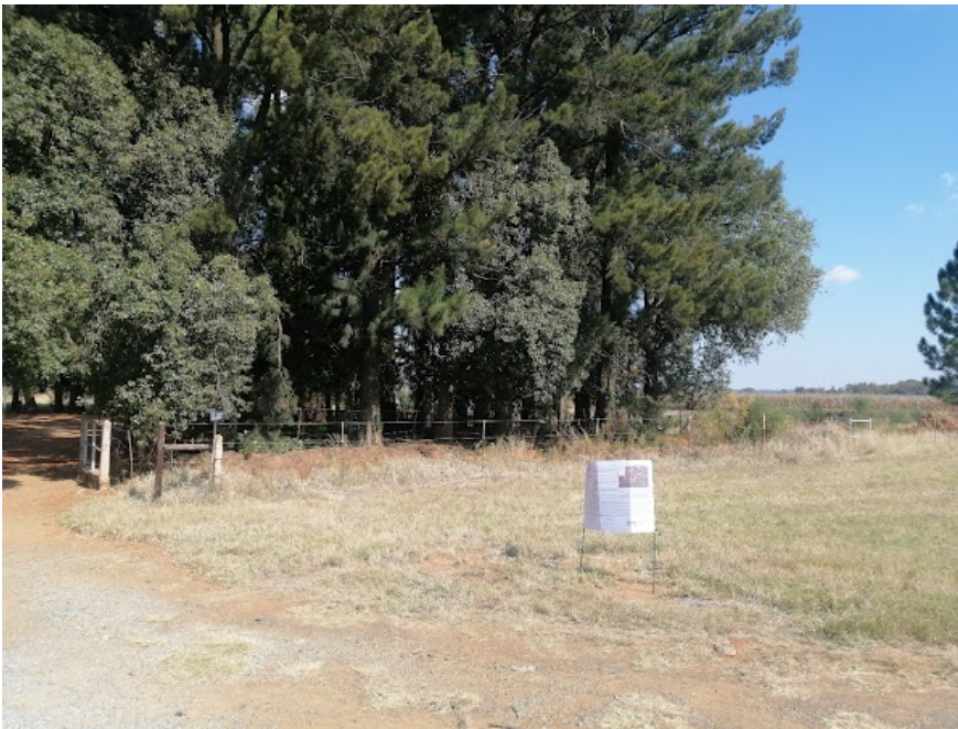
Site Notice 33

Site Notice: 17/05/2022 11:50:25; GPS Coordinates: -28.107256, 26.620189