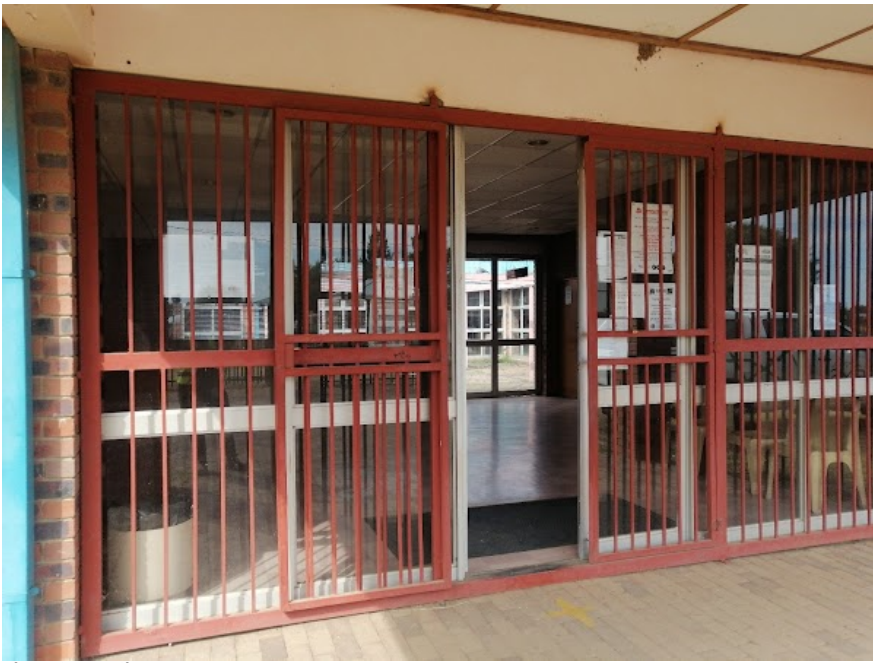
Theunissen Library Entrance

Handout: 16/05/2022 12:12:19; GPS Coordinates: -27.978798, 26.737546