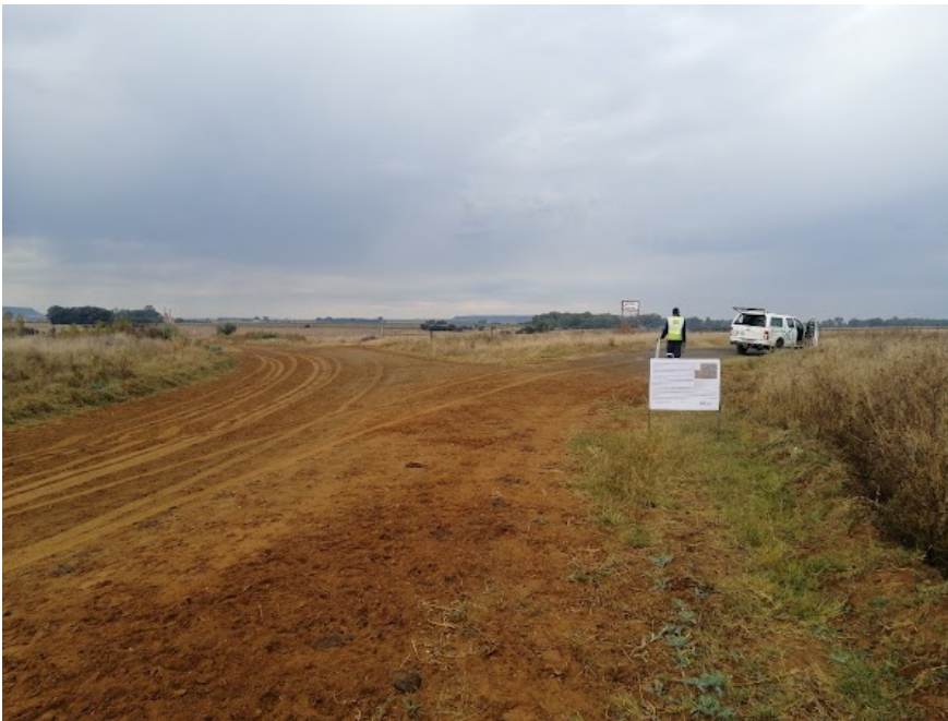
Site Notice 25

Site Notice: 18/05/2022 09:33:48; GPS Coordinates: -28.247793, 26.687415