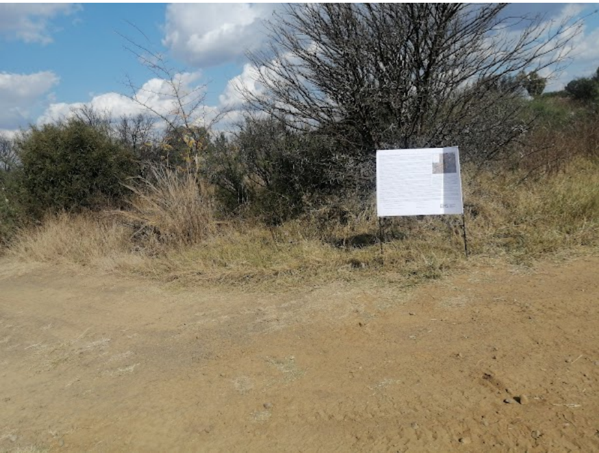
Site Notice 49

Site Notice: 17/05/2022 14:02:43; GPS Coordinates: -28.169073, 26.633108