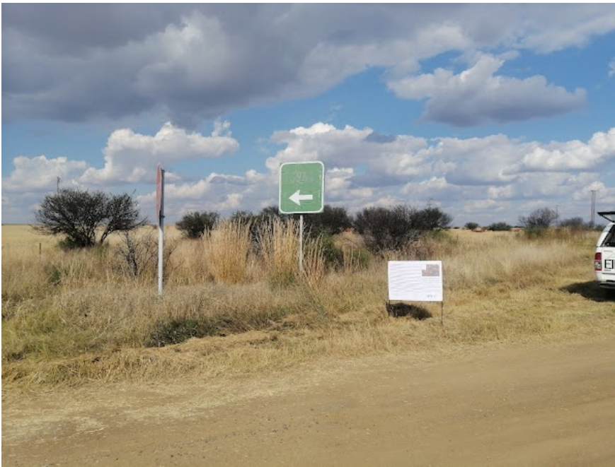
Site Notice 29

Site Notice: 17/05/2022 14:16:02; GPS Coordinates: -28.180543, 26.619509