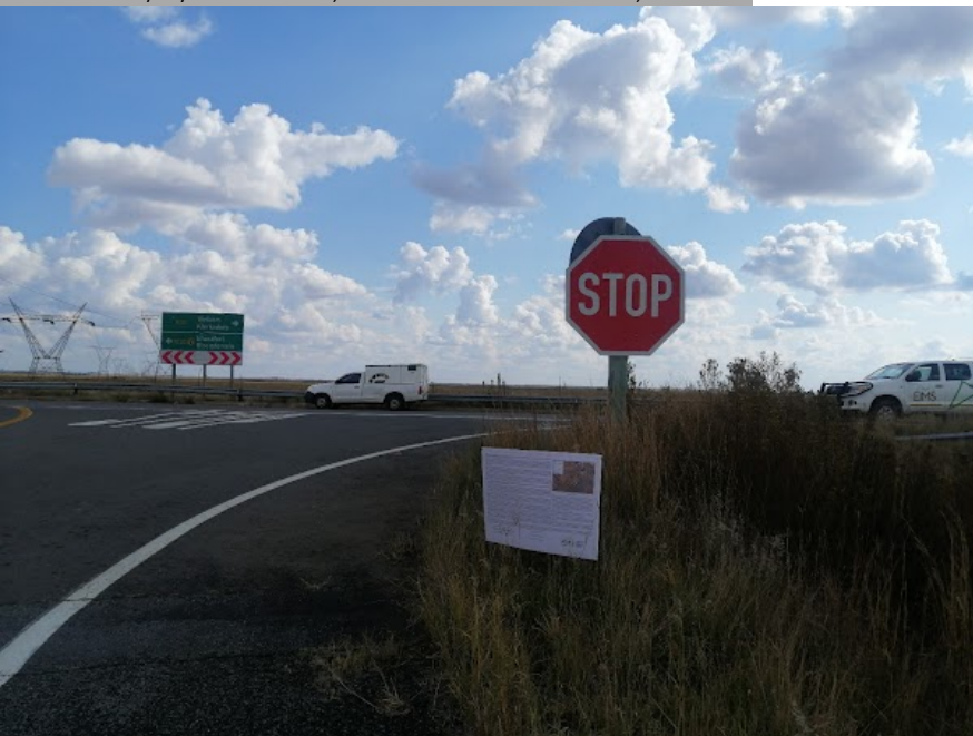
Site Notice 13

Site Notice: 18/05/2022 13:58:37; GPS Coordinates: -28.199309, 26.776521