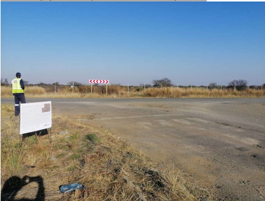
Site Notice 10

Site Notice: 17/05/2022 08:49:43; GPS Coordinates: -28.130928, 26.725532