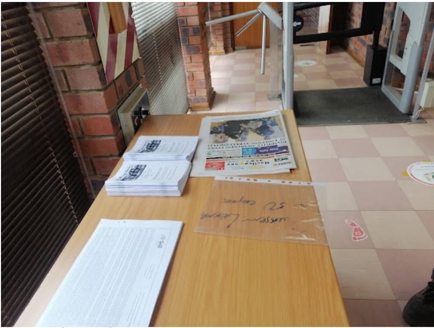
Theunissen Library Handouts

16/05/2022 13:39:16; GPS Coordinates: -28.079535, 26.828191