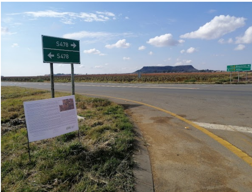
Site Notice 20

Site Notice: 18/05/2022 12:36:58; GPS Coordinates: -28.255366, 26.760867