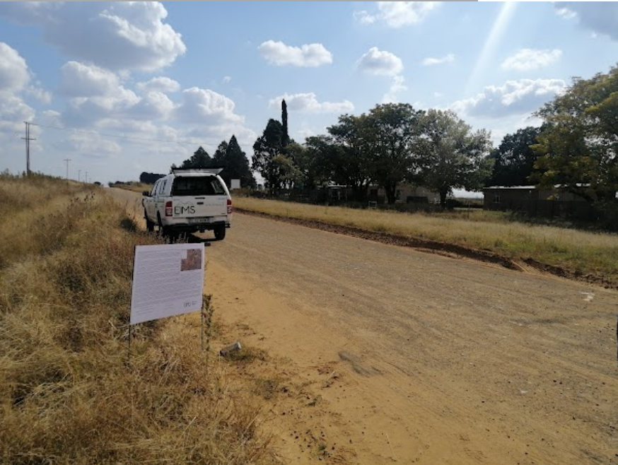
Site Notice 43

Site Notice: 17/05/2022 12:54:43; GPS Coordinates: -28.154356, 26.733451