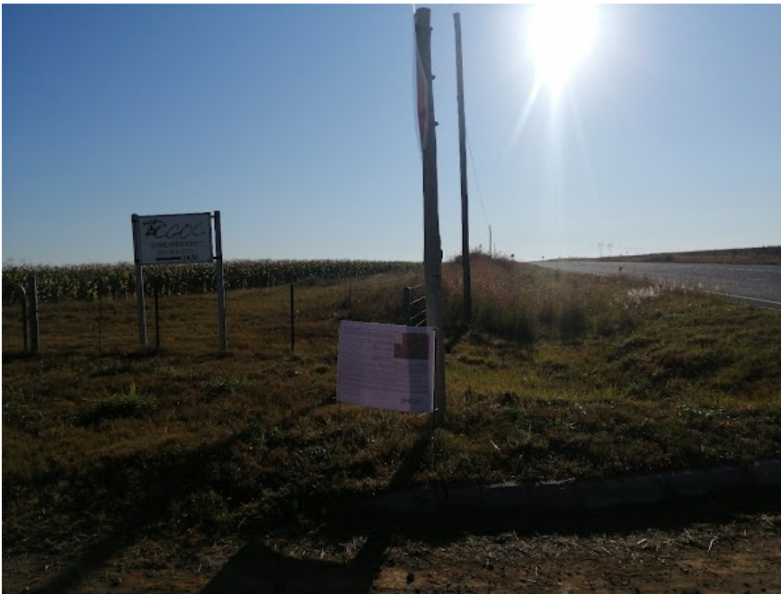
Site Notice 37

Site Notice: 19/05/2022 08:44:24; GPS Coordinates: -28.179992, 26.810402