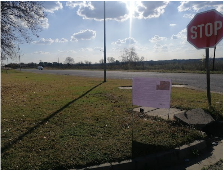
Site Notice 8

Site Notice: 17/05/2022 07:56:45; GPS Coordinates: -28.121425, 26.836078