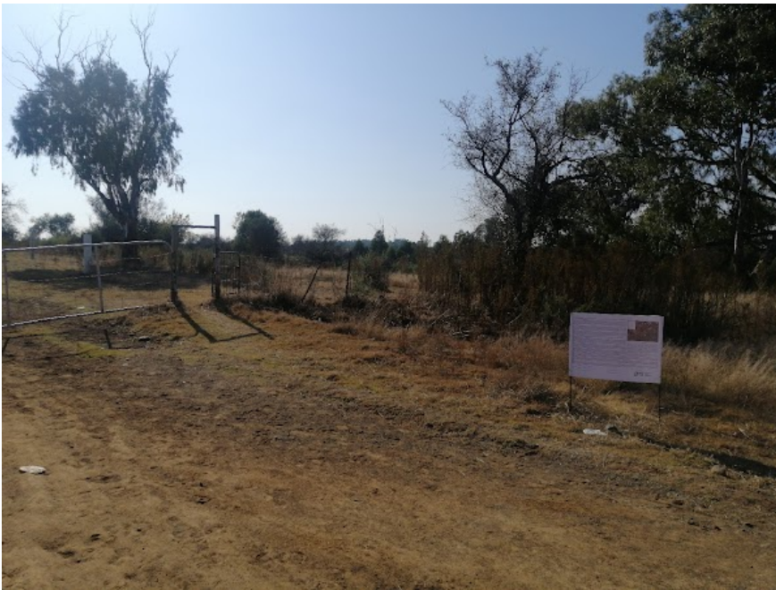
Site Notice 57

Site Notice: 17/05/2022 09:51:08; GPS Coordinates: -28.095193, 26.732233