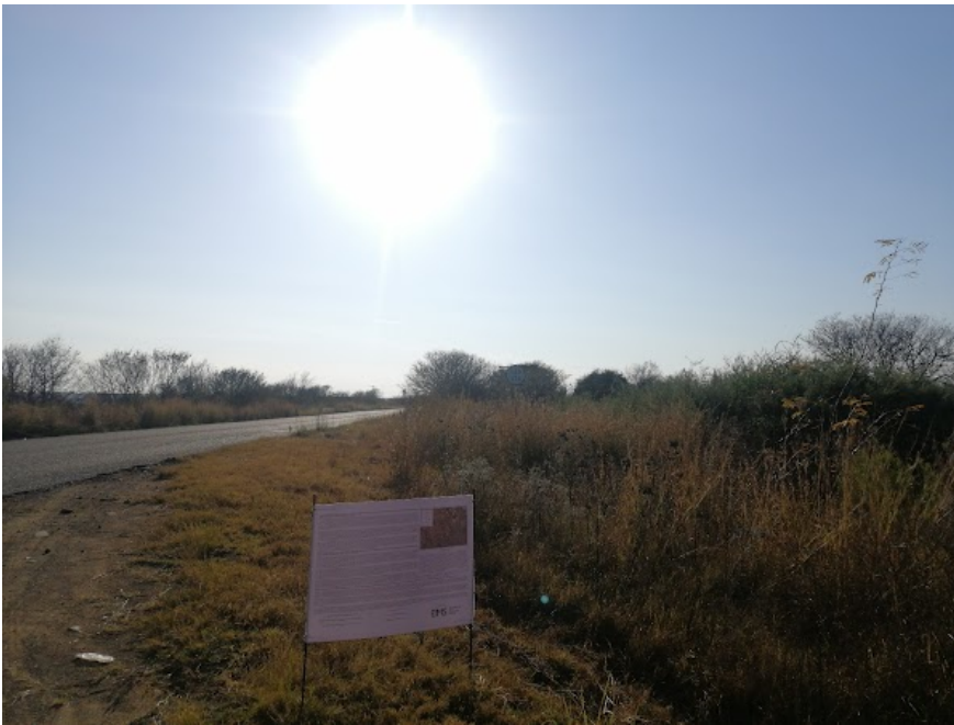
Site Notice 41

Site Notice: 17/05/2022 08:49:43; GPS Coordinates: -28.130928, 26.725532