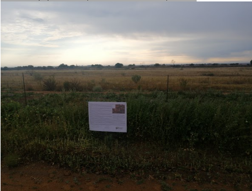
Site Notice 27

Site Notice: 18/05/2022 08:56:48; GPS Coordinates: -28.217026, 26.703317