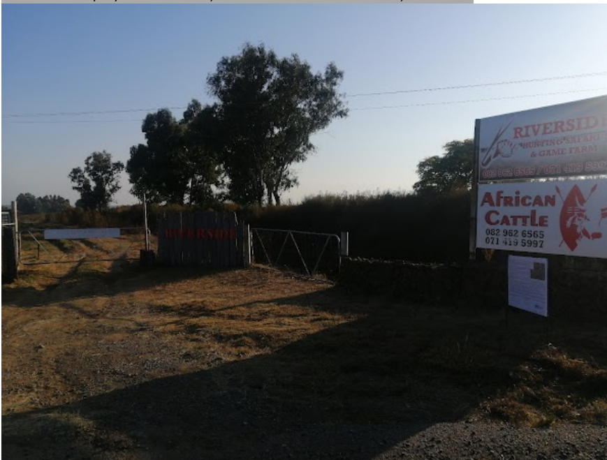
Site Notice 38

Site Notice: 17/05/2022 08:09:11; GPS Coordinates: -28.119428, 26.814031