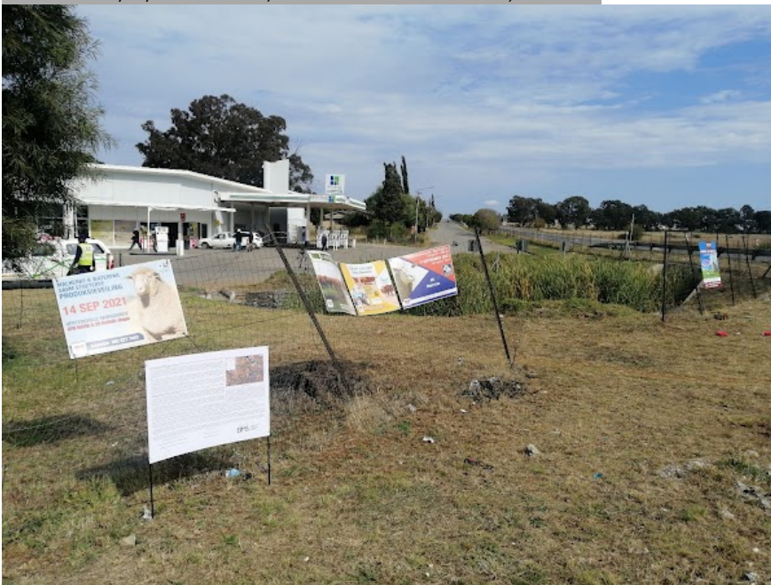
Site Notice 65

Site Notice: 18/05/2022 11:26:52; GPS Coordinates: -28.394600, 26.712065