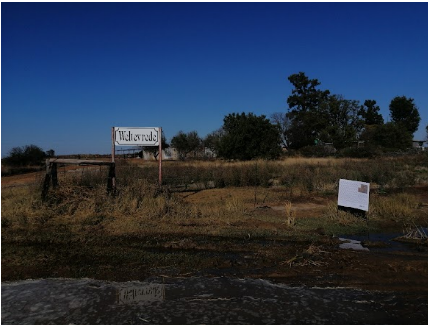
Site Notice 14

Site Notice: 19/05/2022 09:48:41; GPS Coordinates: -28.204543, 26.775050