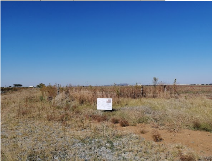
Site Notice 5

Site Notice: 19/05/2022 10:13:26; GPS Coordinates: -28.236600, 26.792107