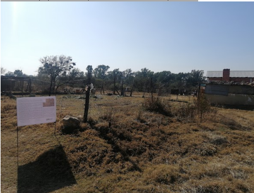
Site Notice 57

Site Notice: 17/05/2022 09:51:08; GPS Coordinates: -28.095193, 26.732233