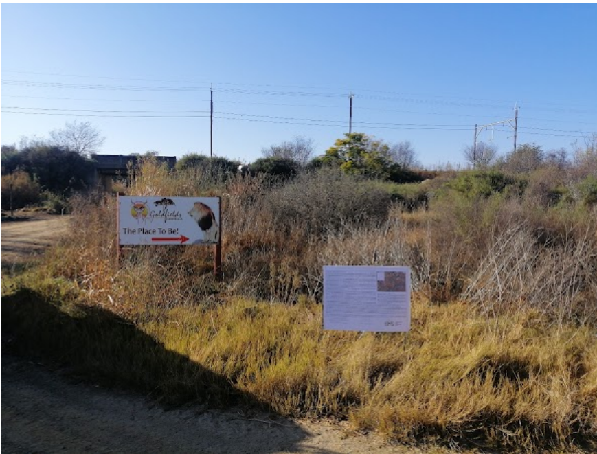
Site Notice 35

Site Notice: 19/05/2022 09:02:04; GPS Coordinates: -28.219207, 26.824884