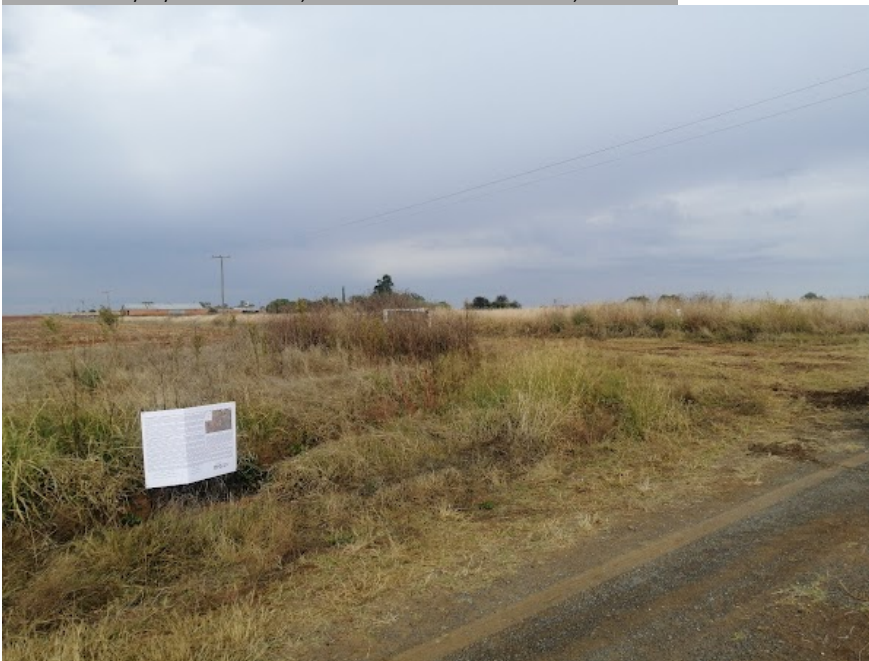
Site Notice 48

Site Notice: 18/05/2022 09:33:48; GPS Coordinates: -28.247793, 26.687415