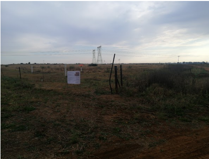
Site Notice 53

Site Notice: 18/05/2022 08:56:48; GPS Coordinates: -28.217026, 26.703317