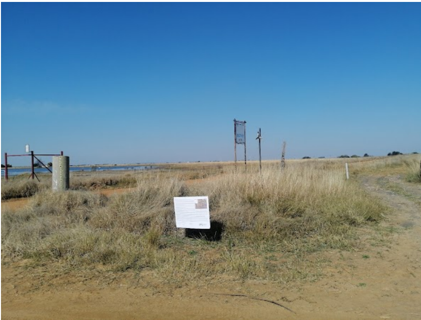
Site Notice 4

Site Notice: 17/05/2022 10:35:30; GPS Coordinates: -28.056892, 26.665857