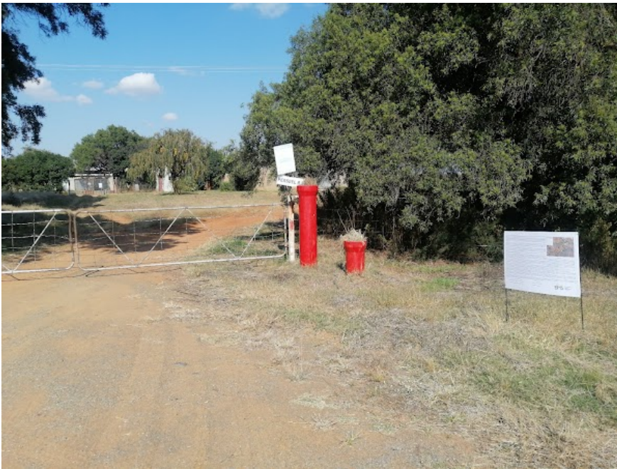
Site Notice 47

Site Notice: 17/05/2022 11:08:36; GPS Coordinates: -28.113907, 26.660943