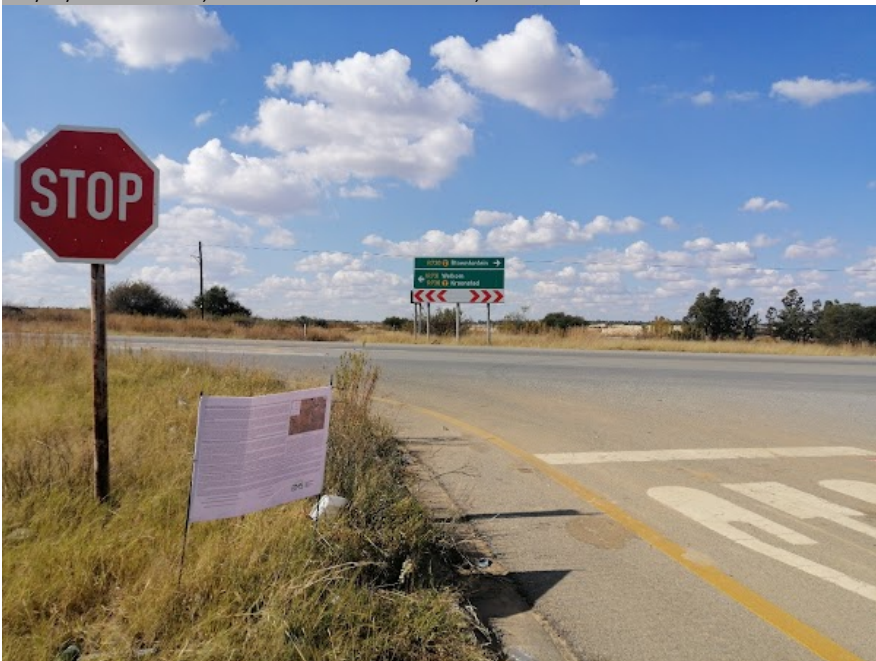
Site Notice 2

16/05/2022 13:39:16; GPS Coordinates: -28.079535, 26.828191