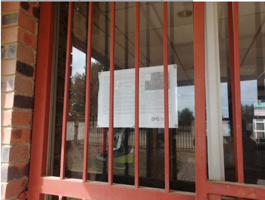
Theunissen Library Poster

Poster: 18/05/2022 11:07:45; GPS Coordinates: -28.410084, 26.707423