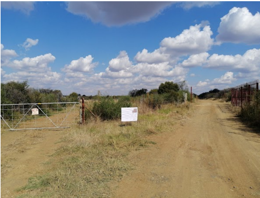
Site Notice 52

Site Notice: 17/05/2022 13:40:49; GPS Coordinates: -28.159365, 26.668827