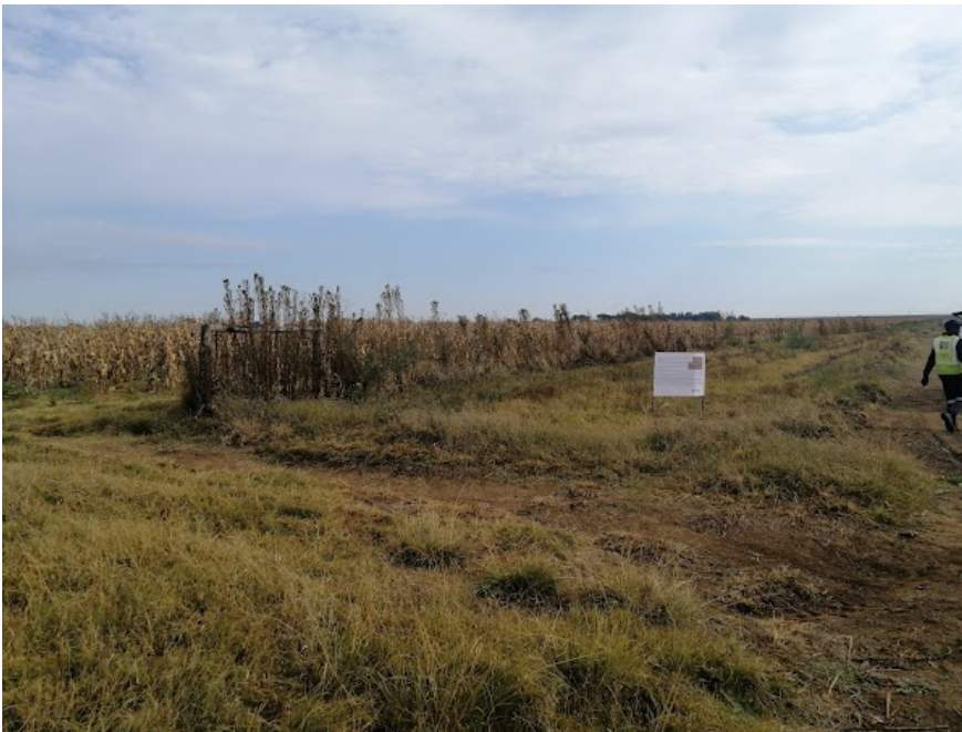
Site Notice 23

Site Notice: 18/05/2022 11:26:52; GPS Coordinates: -28.394600, 26.712065