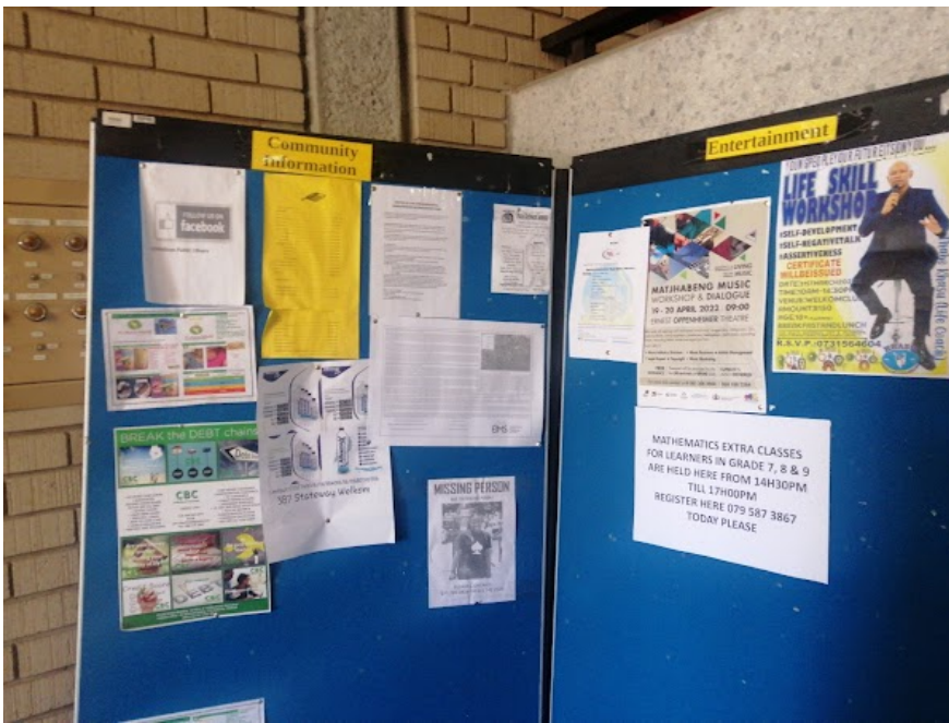
Welkom library poster

Poster: 16/05/2022 12:52:12; GPS Coordinates: -27.993630, 26.747201