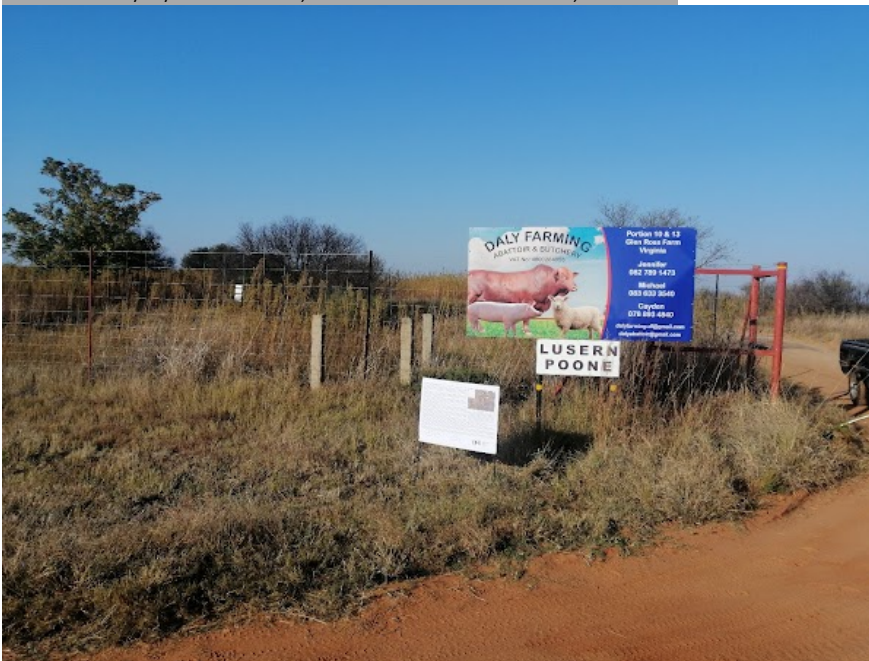
Site Notice 40

Site Notice: 17/05/2022 08:37:10; GPS Coordinates: -28.115835, 26.757307