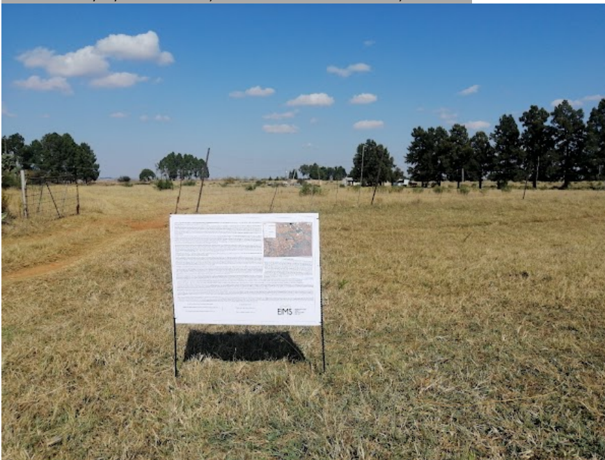
Site Notice 72

Site Notice: 17/05/2022 11:08:36; GPS Coordinates: -28.113907, 26.660943