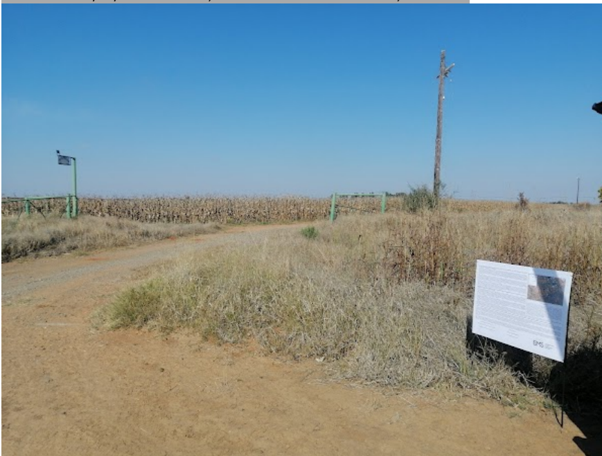
Site Notice 74

Site Notice: 17/05/2022 10:35:30; GPS Coordinates: -28.056892, 26.665857