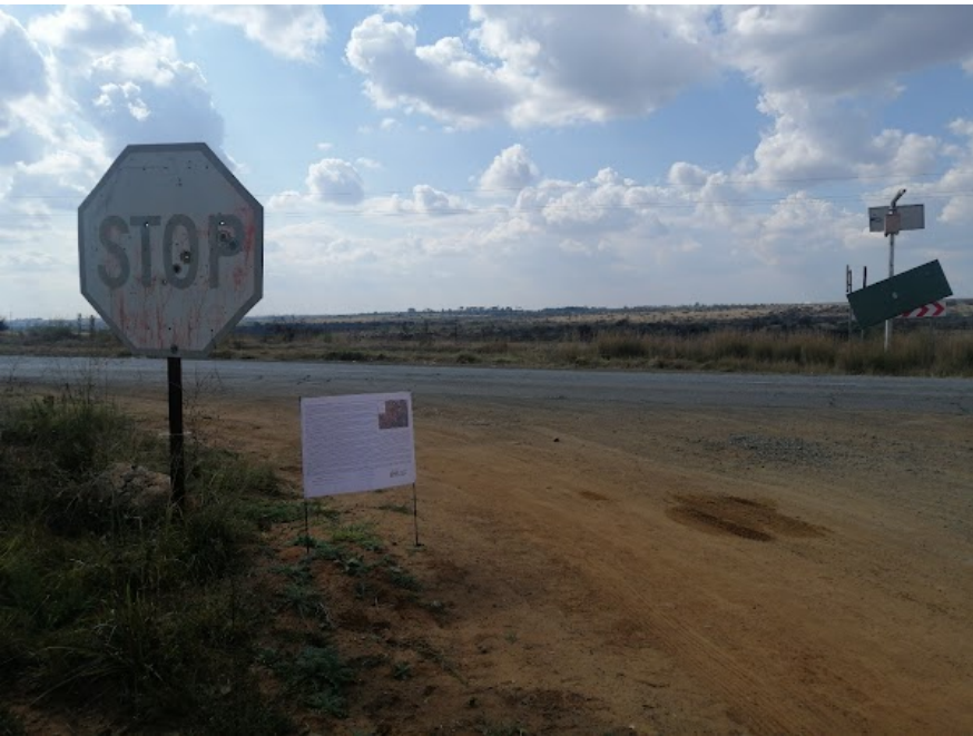
Site Notice 42

Site Notice: 17/05/2022 12:54:43; GPS Coordinates: -28.154356, 26.733451