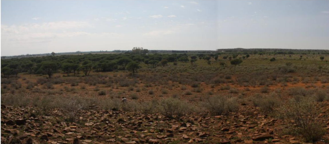
Figure 1: View of the site and towards the eastern adjacent areas. Note the low percentage vegetation cover, highly rocky terrain and the adjacent woodland area adjacent to the site. Large specimens of the protected Camel Thorn ( Vachellia erioloba ) is clearly visible in this area.