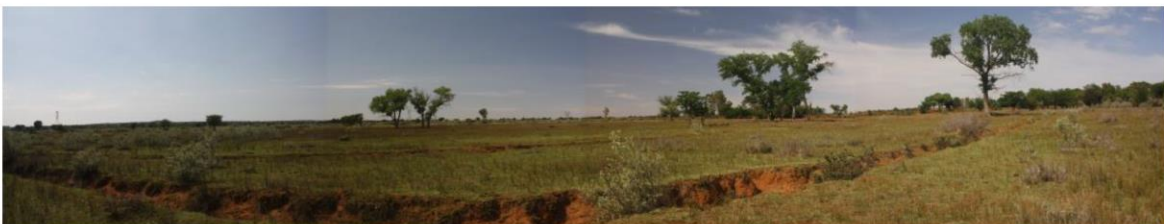
Figure 3: Panorama of the drainage area to the south of the site. Note drainage gullies forming in the area.