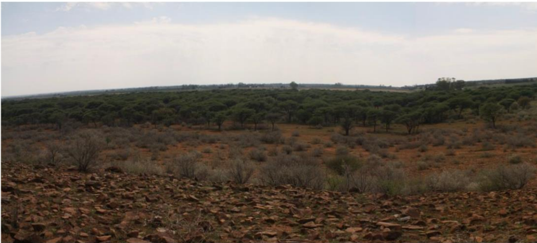
Figure 5: Panorama of the site. Note the dense woodland to the east of the site which will be excluded from the footprint.