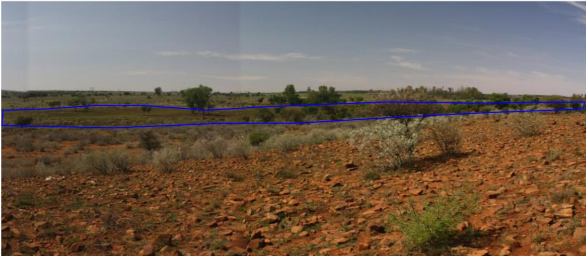
Figure 2: Panorama of the site and toward the south of the site. Note the rocky terrain and slope on the site. The drainage area to the south of the site is indicated.