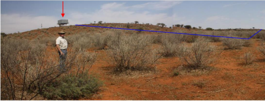
Figure 4: Panorama of the site (blue) as seen from the south. The topography and profile of the low hill is clearly visible. The small water treatment plant and reservoir is also visible (red arrow).