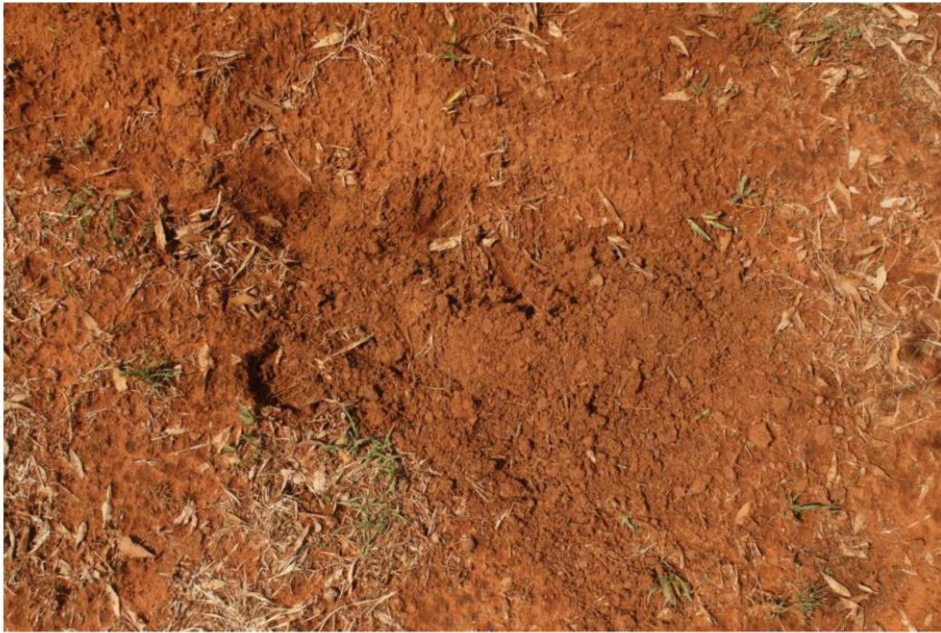
Figure 8: Shallow foraging excavations made by a small unidentified mammal.