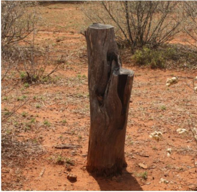
Figure 7: A sizable stump from a tree which was cut down for firewood.