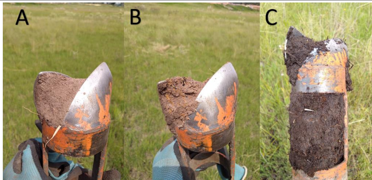
A) E horizon, B) G horizon, C) Katspruit

Colour photographs of soil forms and soils wetness considered for the study