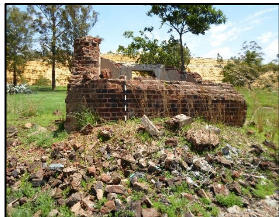
Remains of a built structure.

Colour photographs of archaeological findings