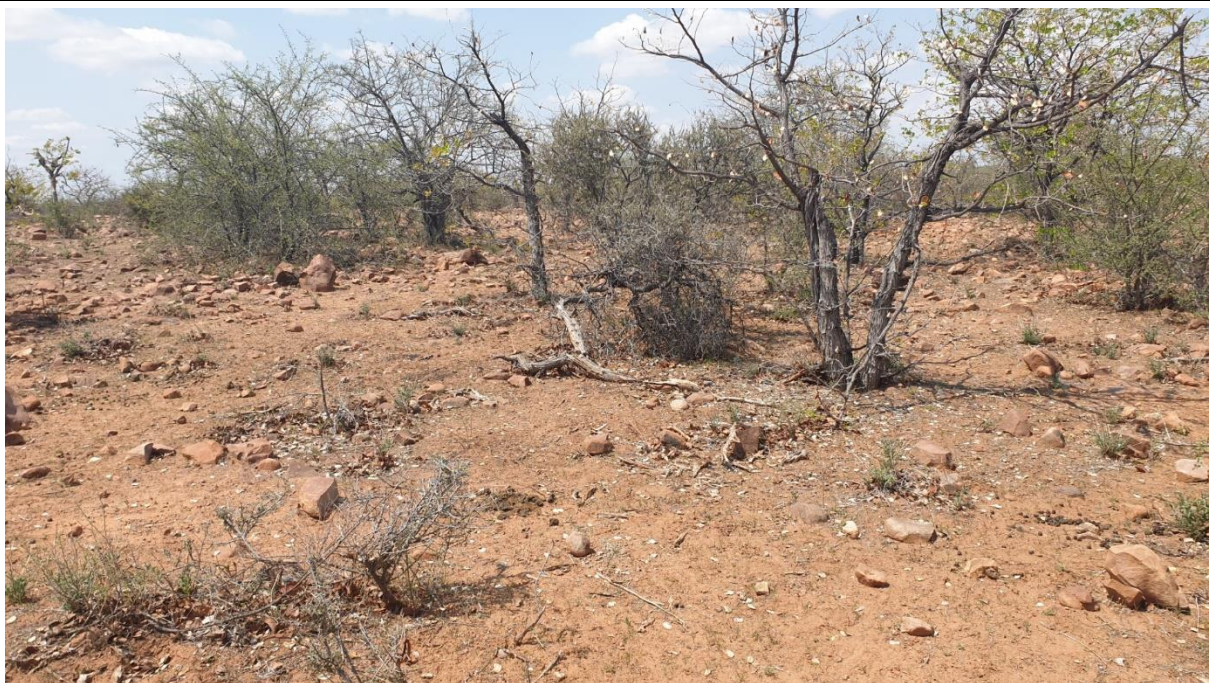
Examples of the Limpopo Ridge Bushveld habitat type