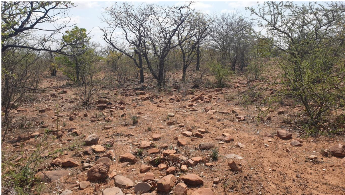
Examples of the Limpopo Ridge Bushveld habitat type