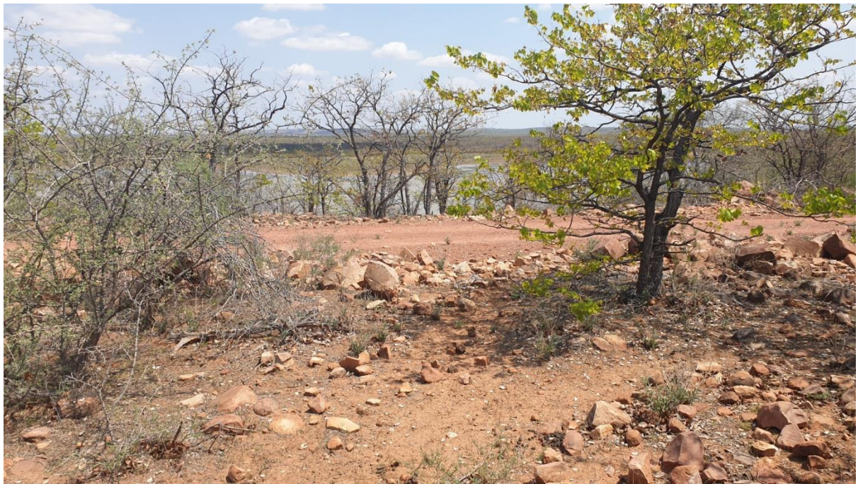
Examples of the Limpopo Ridge Bushveld habitat type. The Lizzulea Dam is visible in the background.