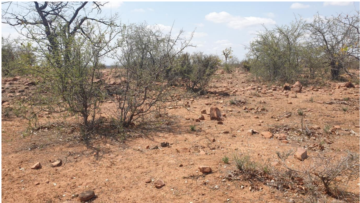
Examples of the Limpopo Ridge Bushveld habitat type