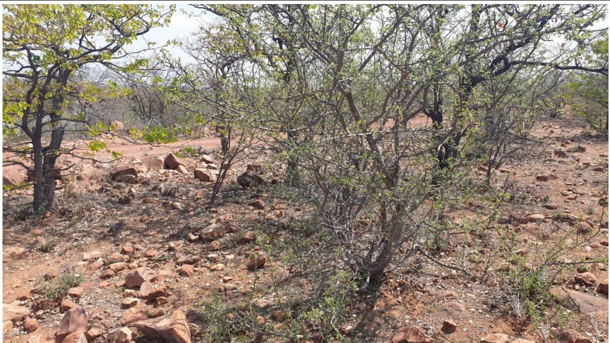
Examples of the Limpopo Ridge Bushveld habitat type