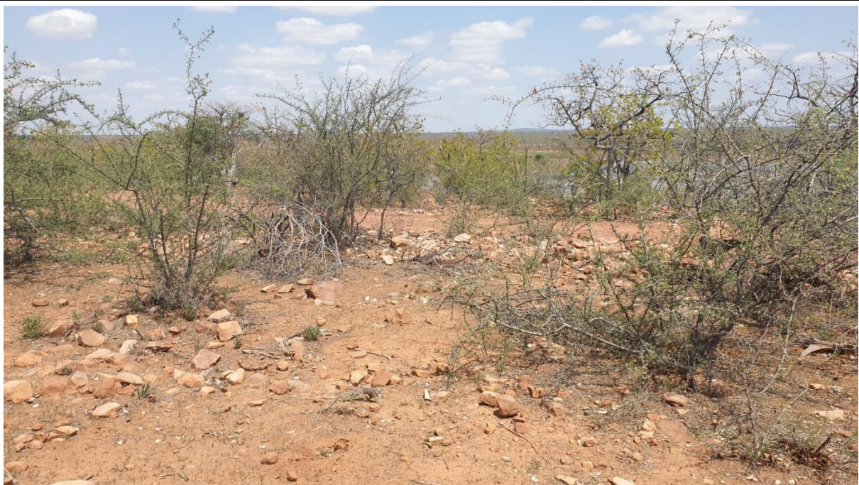
Examples of the Limpopo Ridge Bushveld habitat type