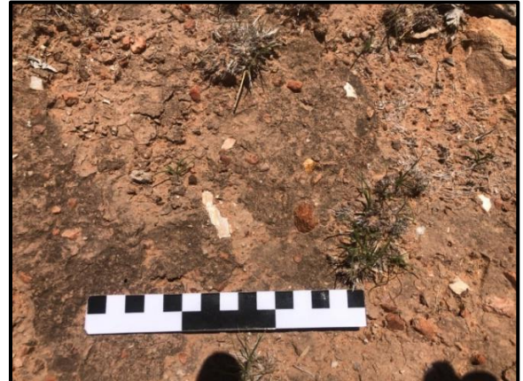
Bone and ostrich egg shell fragments (site 2229AD 296)