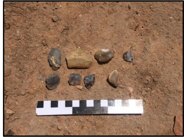
MSA broken point on the left and LSA backed blade on the right. Recorded at Waypoint 172