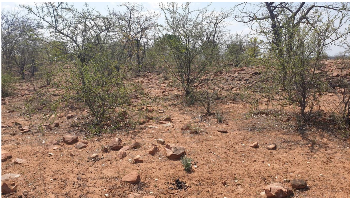
Examples of the Limpopo Ridge Bushveld habitat type