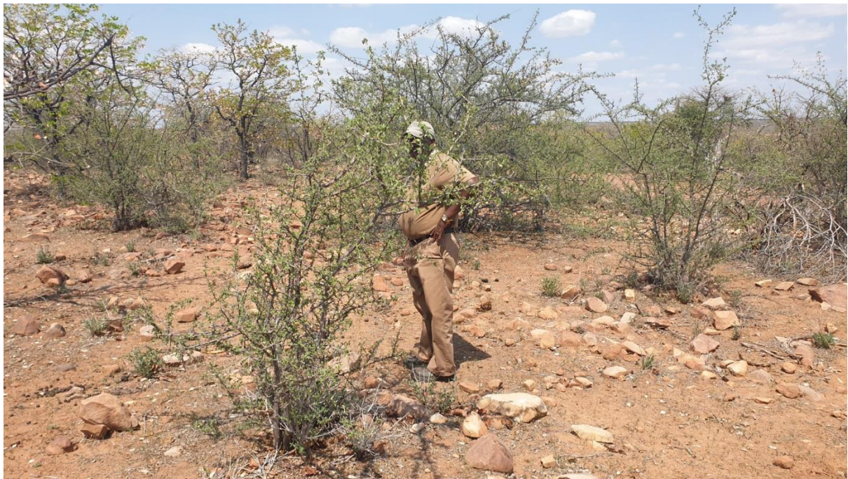
Examples of the Limpopo Ridge Bushveld habitat type