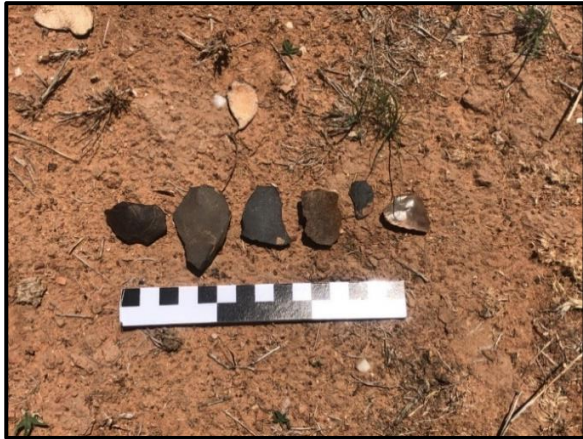
Dorsal and ventral views of lithics illustrating the range of raw material used at Waypoint 172.