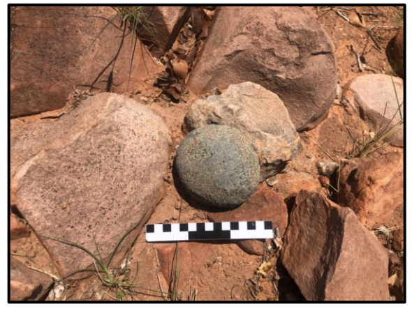
Upper grinding stone on wall at Waypoint 178.