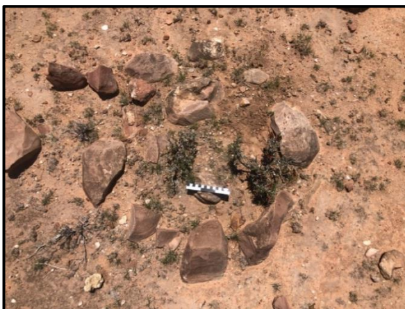
Possible grain bin foundation (site 2229AD 296)