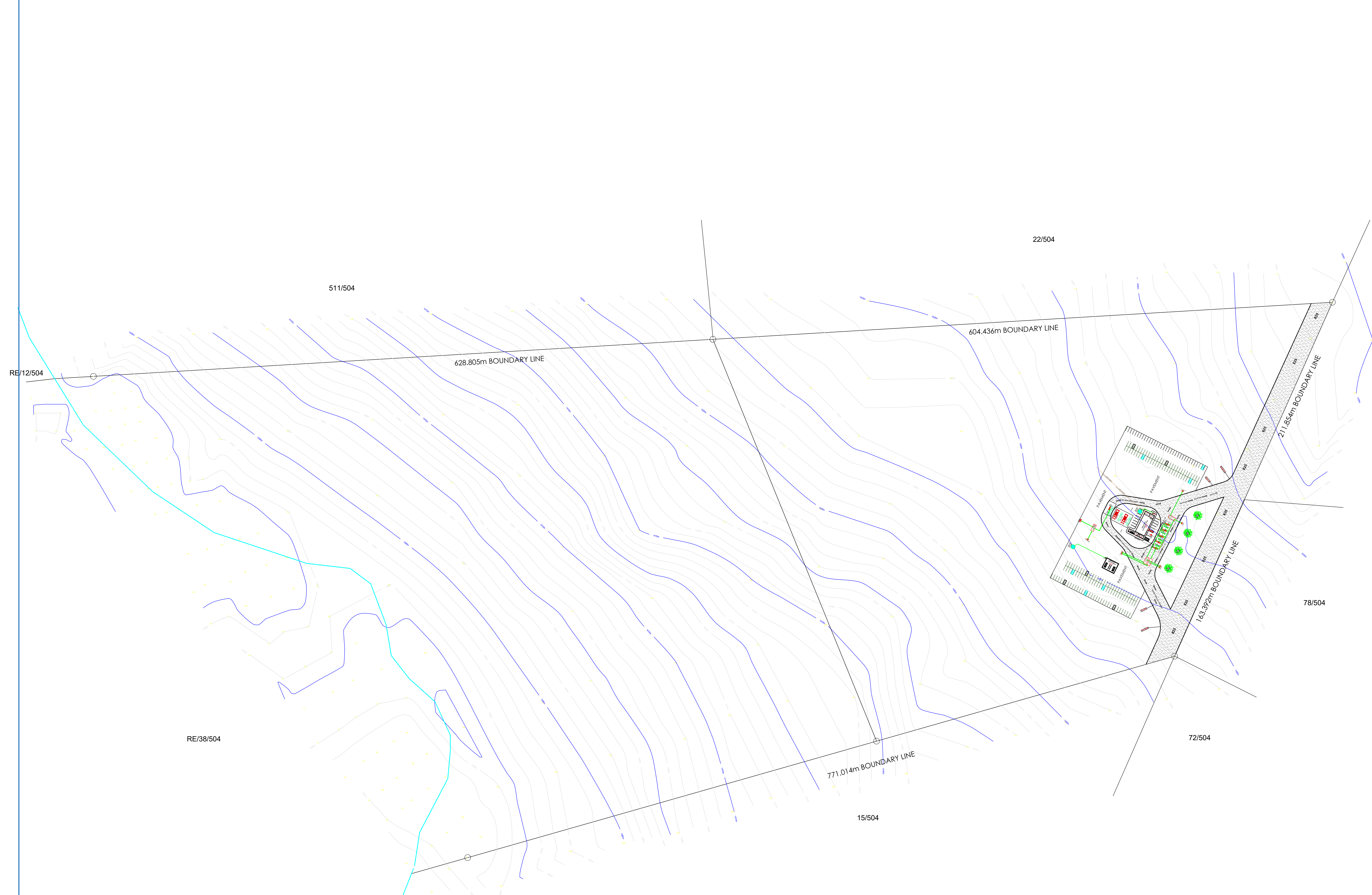
PRELIMINARY SURVEY LAYOUT AND SITE PLAN SCALE 1:1250

PROJECT NO.: MTS/28 DRAWING NO.: MTS/28/01/2022