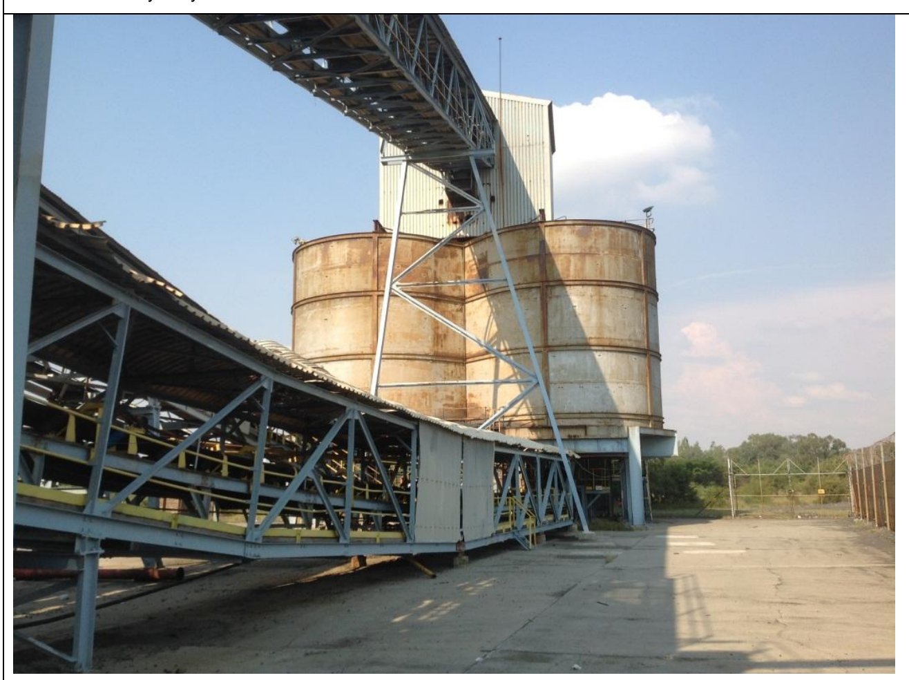
Primary and Secondary Crushers