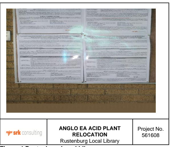
Figure 4 Rustenburg Local Library