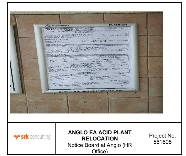
Figure 3 Southern Site of the Proposed RO Plant (HR Office)