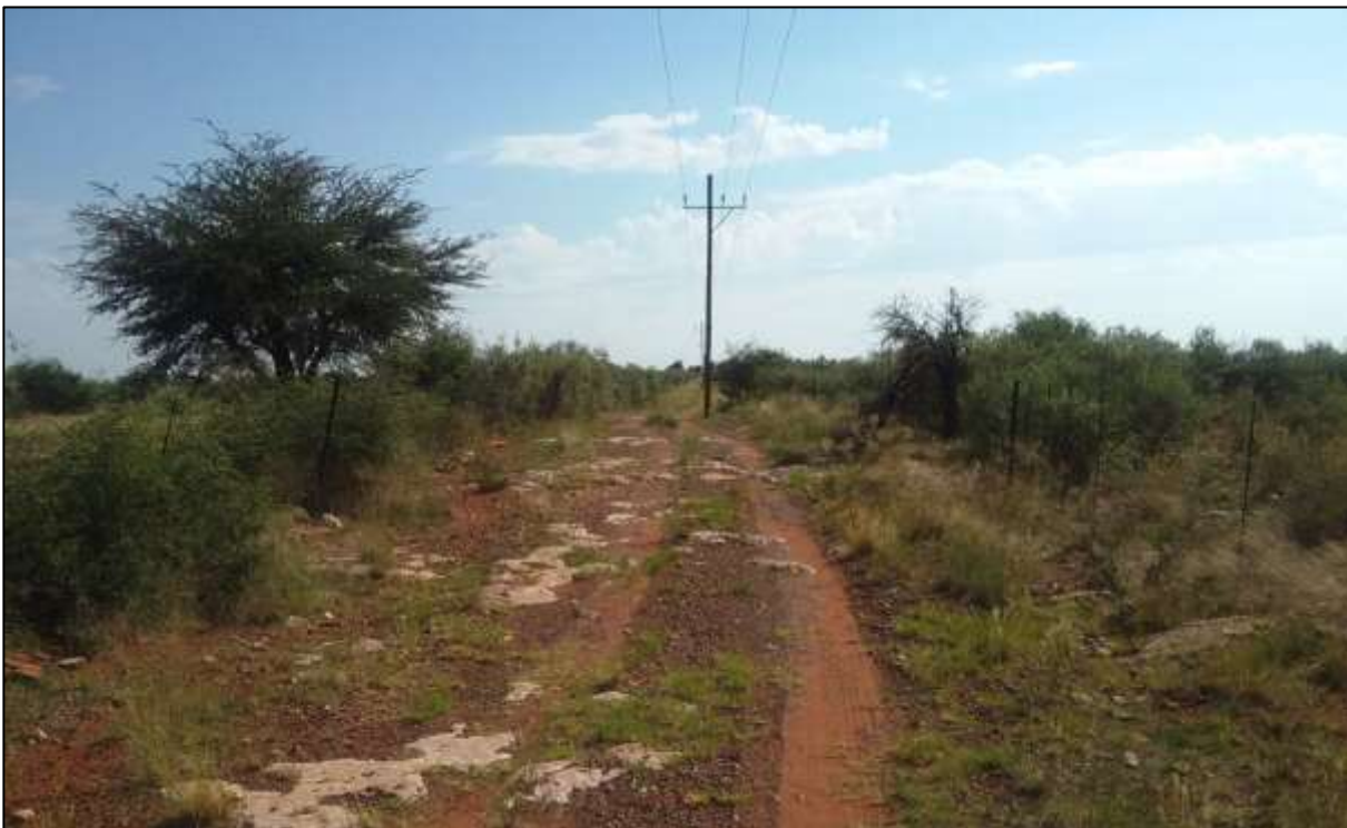
Figure 6: View from Photo 5 of the 88kV power line alongside which the proposed PV power line would be routed.