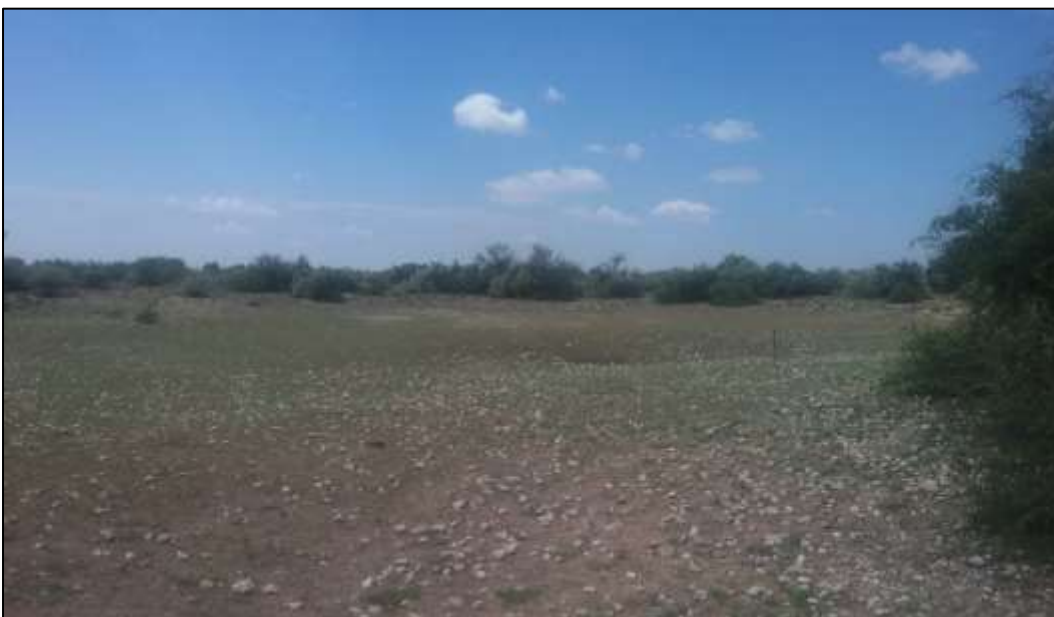
Figure 2: View southeast from Photo 1 of the pan that is located outside the proposed site but would be enclosed on three sides by the PV fencing. This area could be used for landscape enhancement if this area was set aside as an informal conservation area (Source: D. Holder Cape EAPrac 2018).