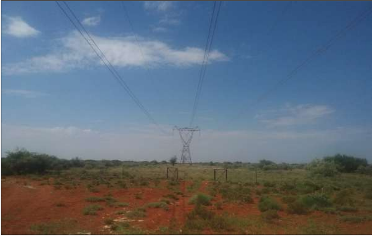
Figure 5: View from Photo 4 of the 400kV power line routed along the south-western boundary of the proposed site.