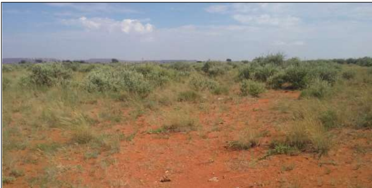
Figure 10: View west from Photo 1 of the low bush and the Shishen waste rock dumps visible in the background. (Source: D. Holder Cape EAPrac 2018).