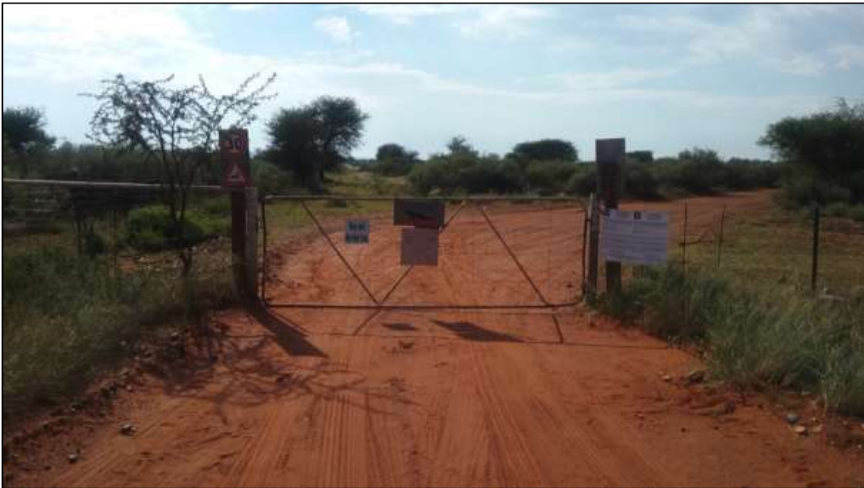
Figure 12: View from Photo 3 toward the north of the typical farm tracks used to enter into the site and the medium sized bushveld vegetation.