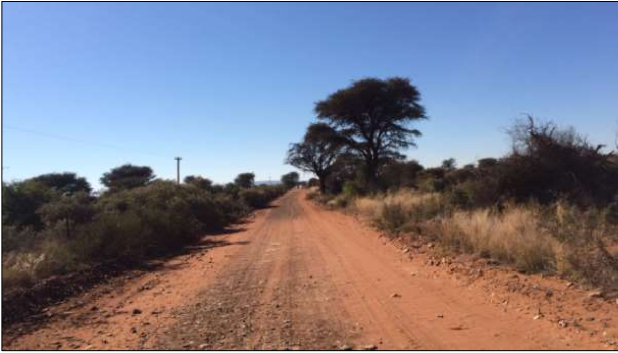
Figure 7: View from Photo 6 location to the west of the existing gravel road where the PV project would be accessed.