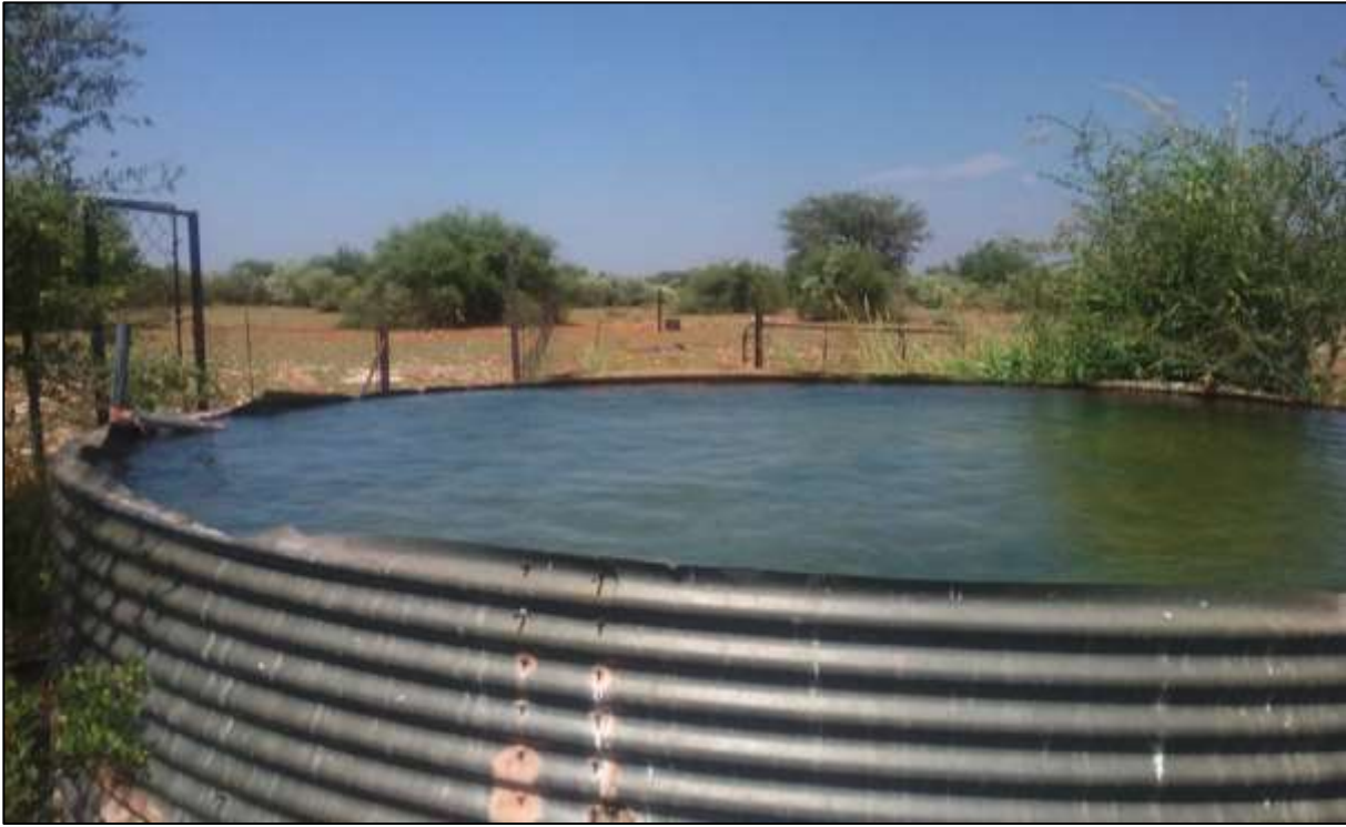
Figure 3: View east from Photo 2 of typical cattle farming reservoir surrounded by Kathu Bushveld vegetation.