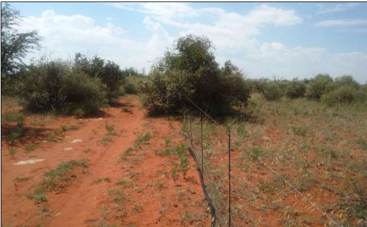
Figure 4: View from Photo 3 of typical farming tracks alongside an internal fence, and bushveld vegetation (Source: D. Holder Cape EAPrac 2018).