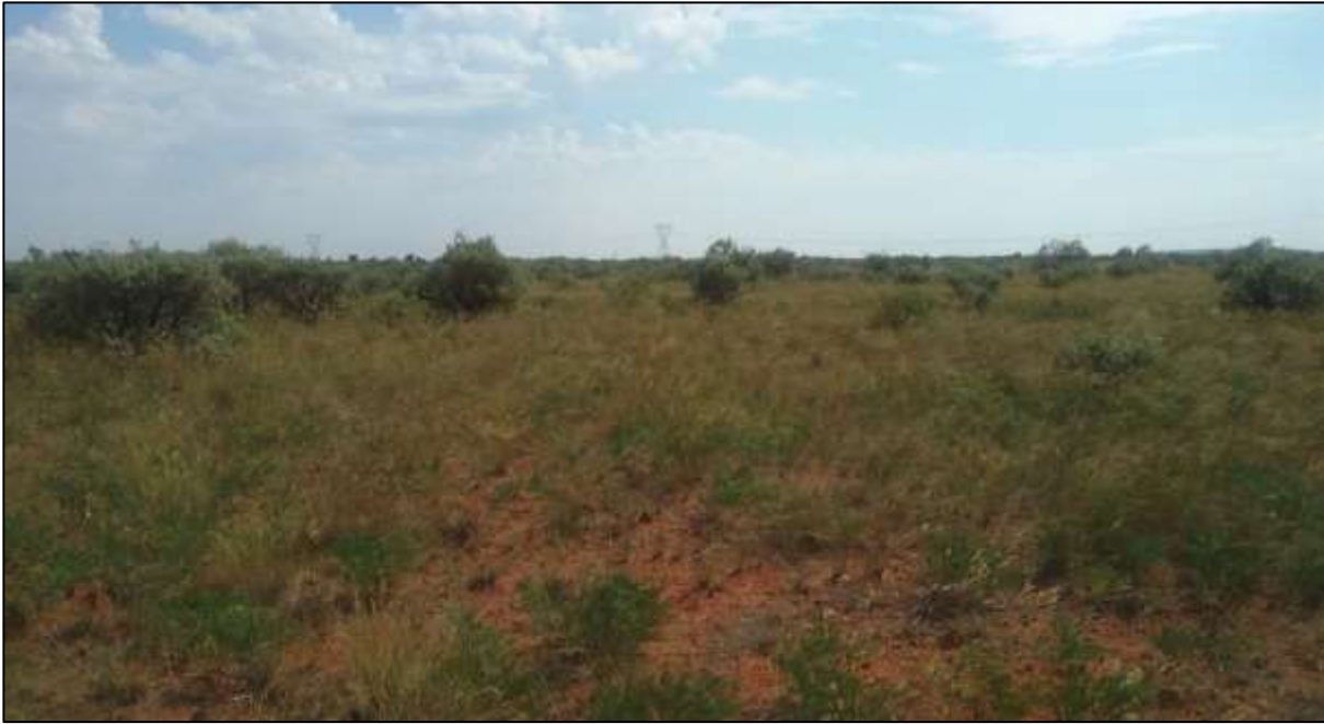
Figure 11: View east from Photo 2 of veld grasses and low vegetation with the Eskom powerline in the background (Source: D. Holder Cape EAPrac 2018).