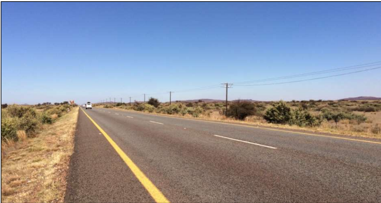
Figure 8: View south from Photo 7 showing the N14 national road crossing point.