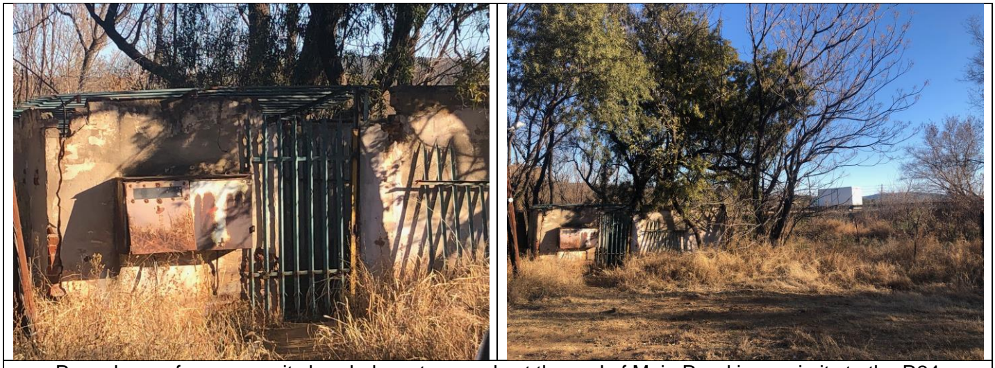
Pump house for community borehole water supply at the end of Main Road in proximity to the R24