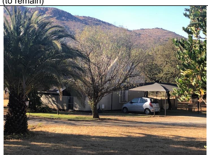
Housing for staff