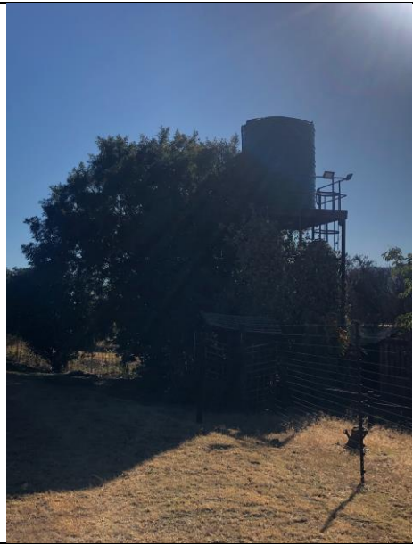
Water storage and supply to houses