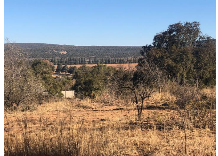
View of the R24 from the property (pre-cast walling is property boundary)