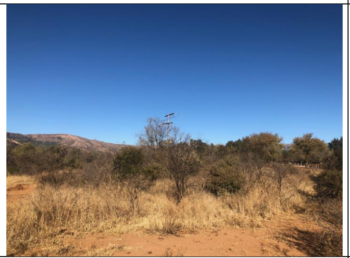
Looking south - disturbed areas on site