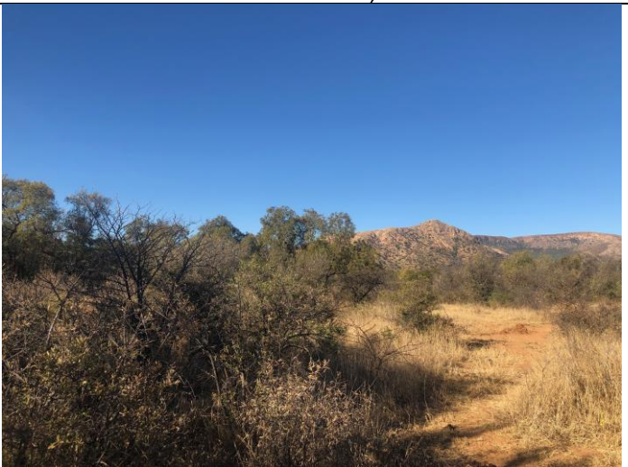
Looking south east (Magaliesberg Mountain visible in distance) – signs of disturbance on site – foot paths