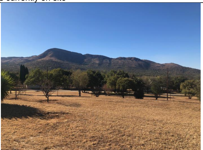
Views of the Magaliesberg Mountain from the property (houses along Third Avenue can be seen on left)