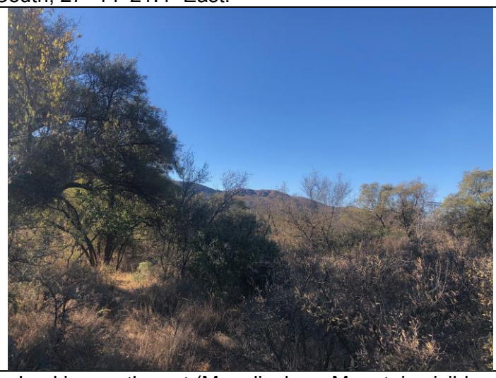
Looking north east (Magaliesberg Mountain visible in distance)