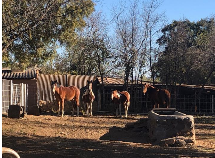
Equestrian activities currently on site