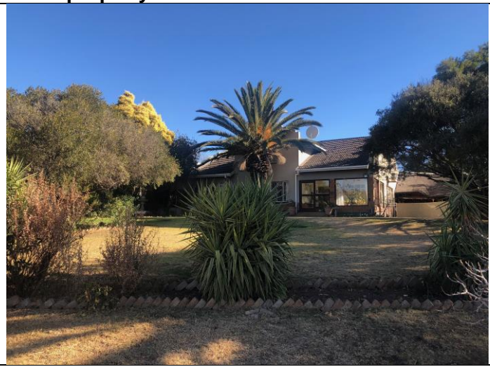
Main house (to remain)