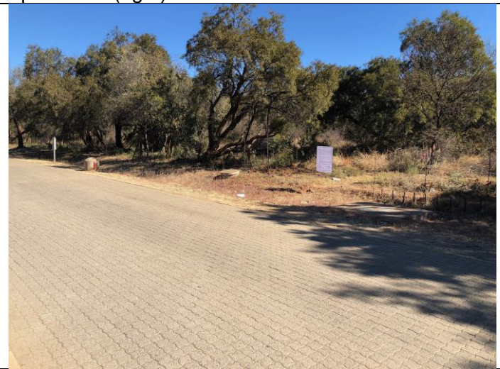
Third Avenue (paved road) – site entrance (existing for houses and in future for school) is located along this road