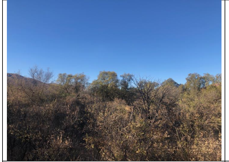
Looking east (Magaliesberg Mountain visible in distance)