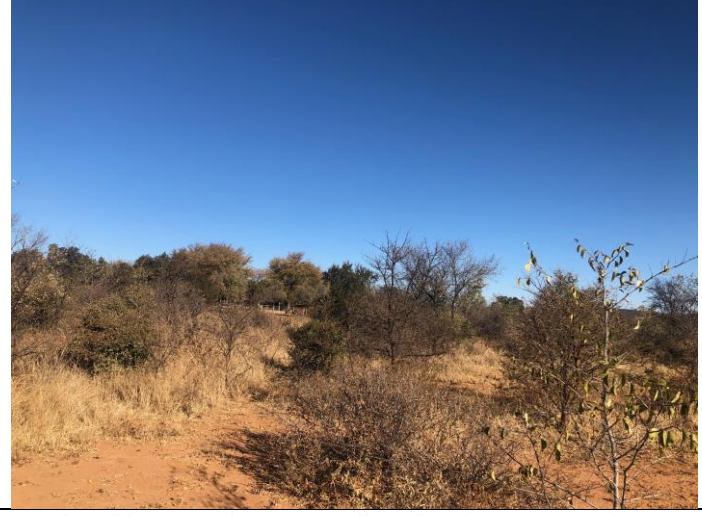
Looking south west - disturbed areas on site