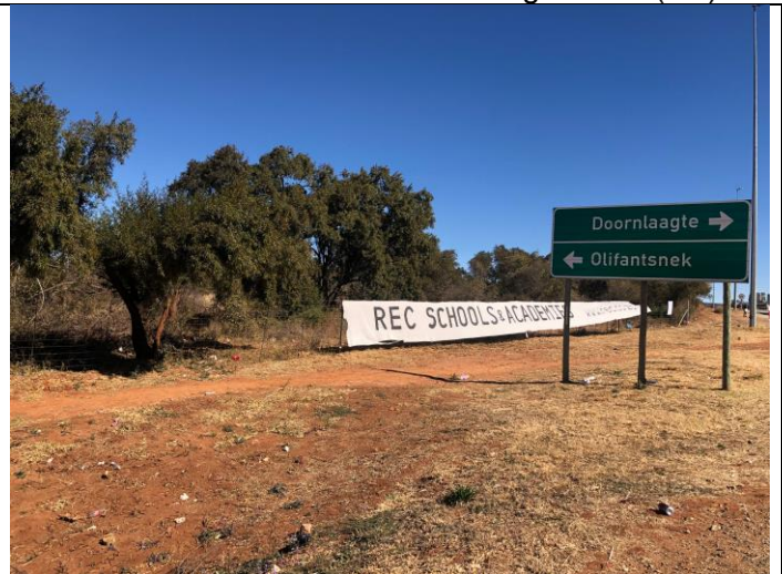
Entrance to Olifantsnek area from R24; site is on this corner of the R24 and Third Avenue

Olifantsnek Filling station (left) and liquor store (right) west of the R24