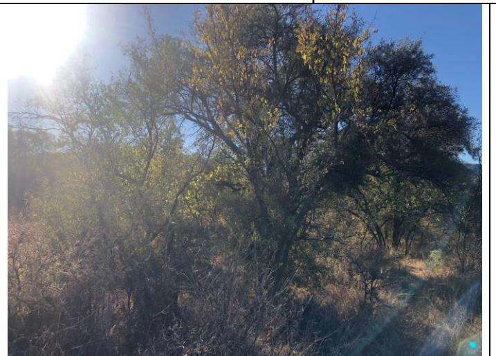
Looking north (vegetation on property)

Views from a centre point in eight (8) major wind directions GPS point: 25° 47' 24.5" South; 27° 14' 21.4" East.