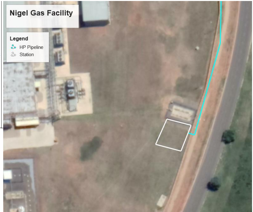
Figure 2: Aerial View of the Station location on the Consol Property