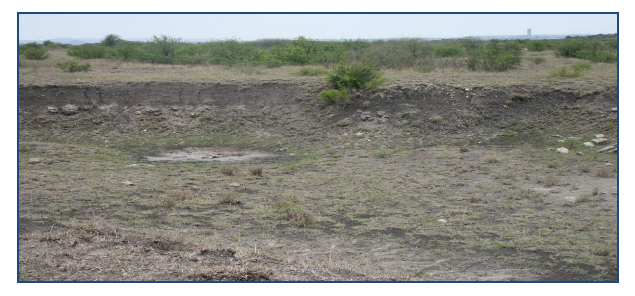
Figure 4: Evidence of soil mining in the centre of the substation site