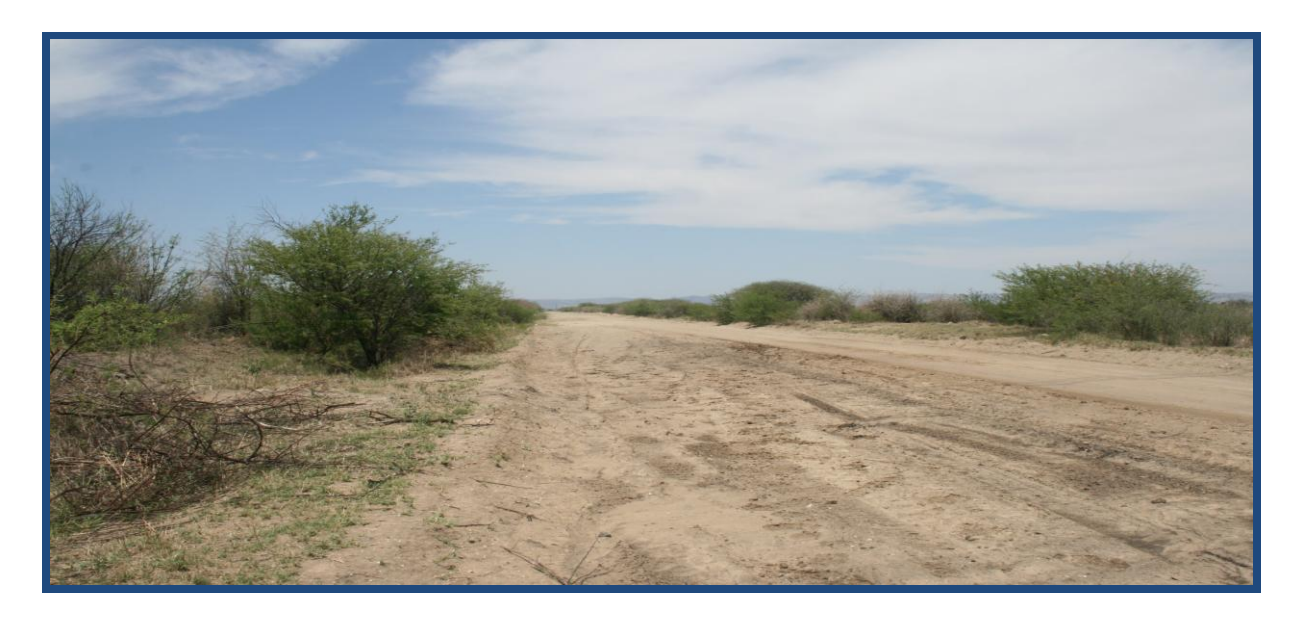
Figure 21: Gravel road that traverses across the substation and corridor site

SUBSTATION SITE AND CORRIDOR ALTERNATIVE 3