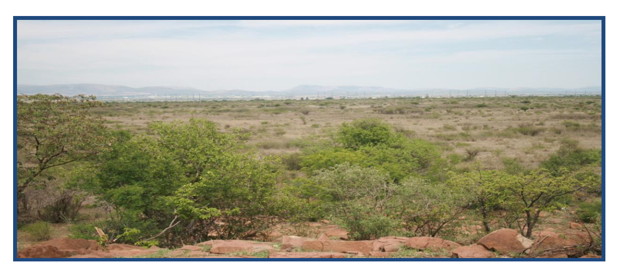
Figure 16: View of the western substation site from the koppie