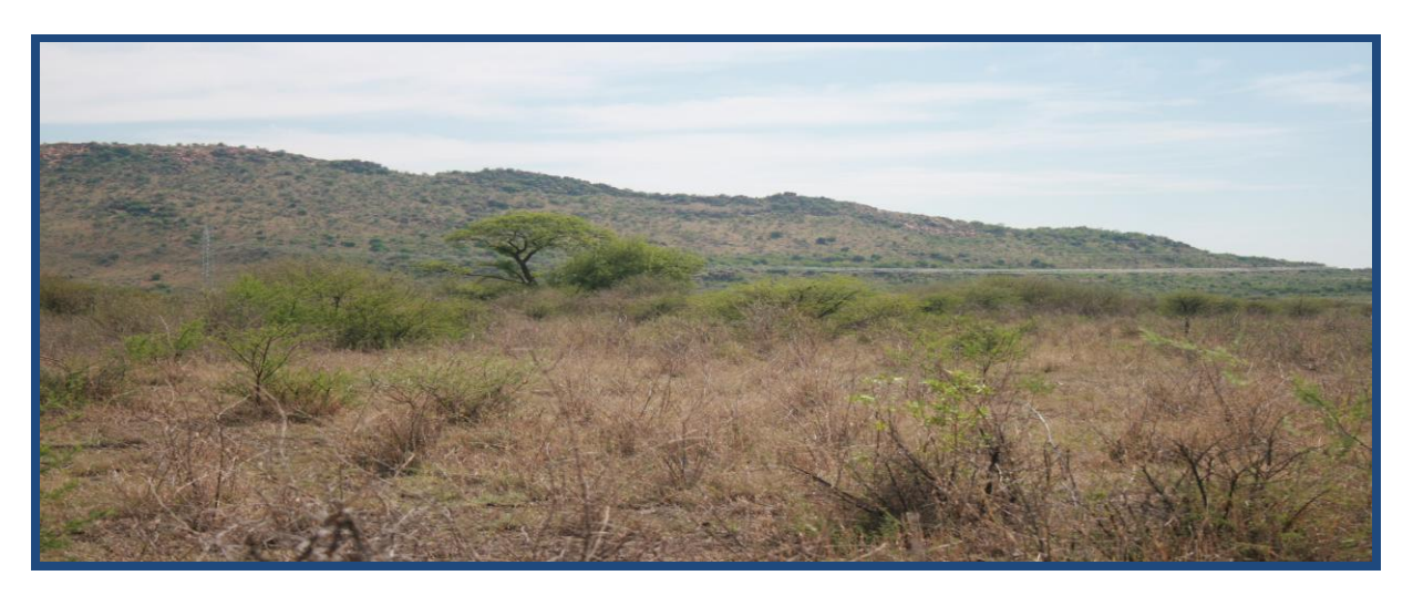
Figure 11: Presence of few large trees within the substation site