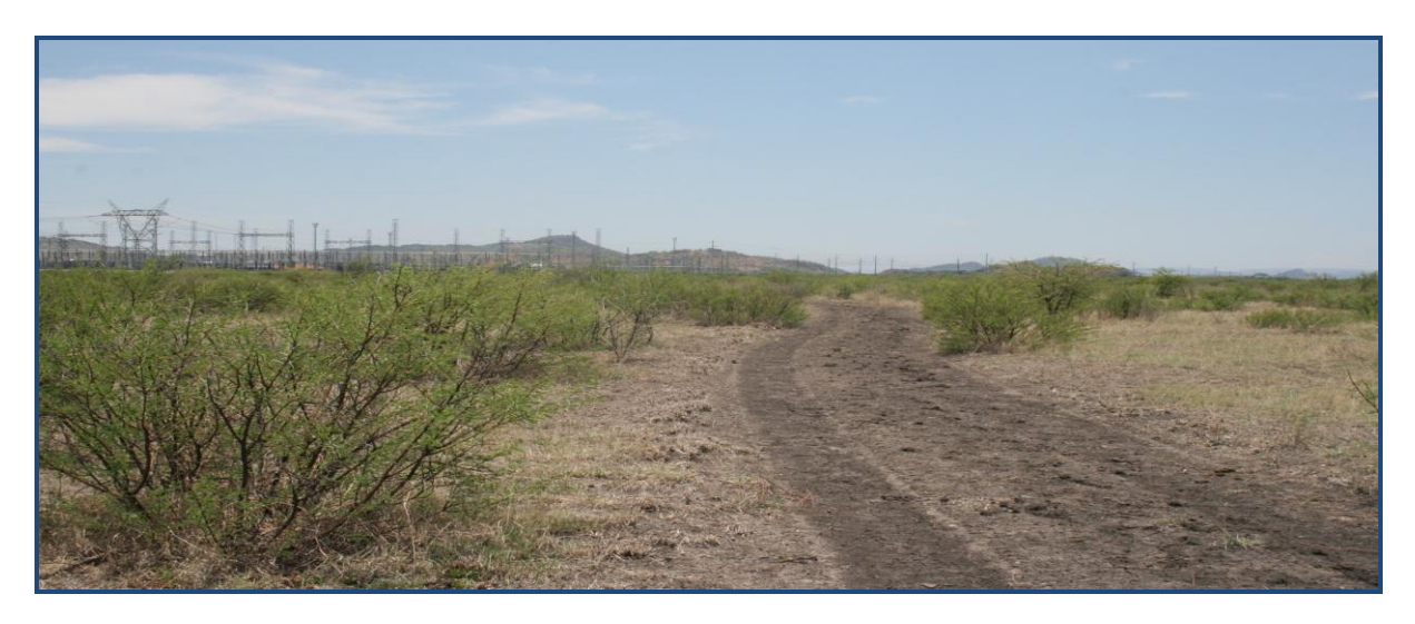
Figure 7: Presence of access tracks to Boitekong within the site