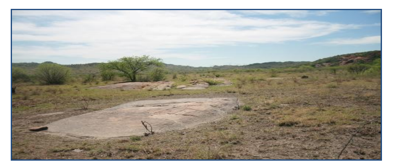
Figure 19: Rocky outcrops in the south western border of the substation site