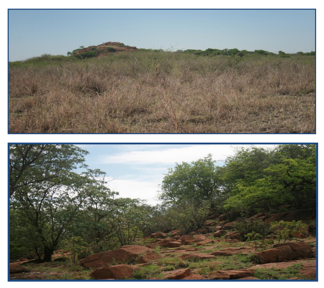
Figure 13 and 14: Koppie and vegetation in the south western border of the substation site