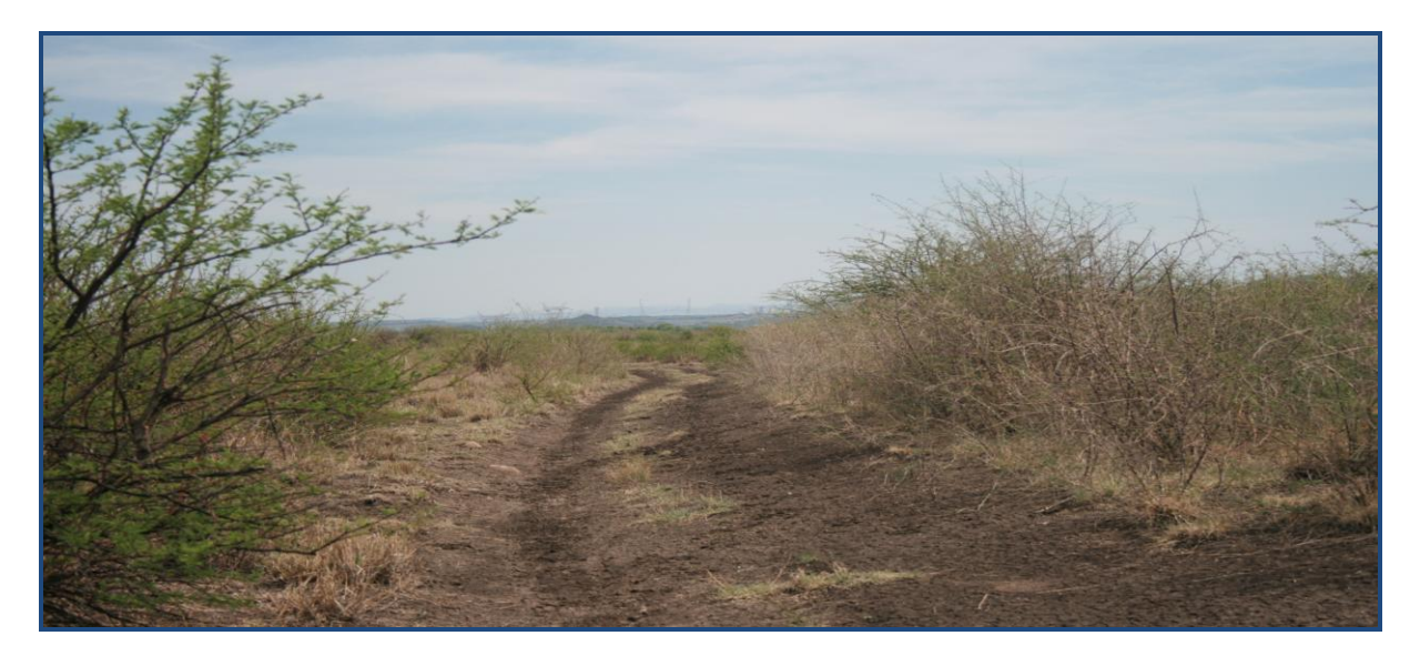
Figure 15: Access track within the site