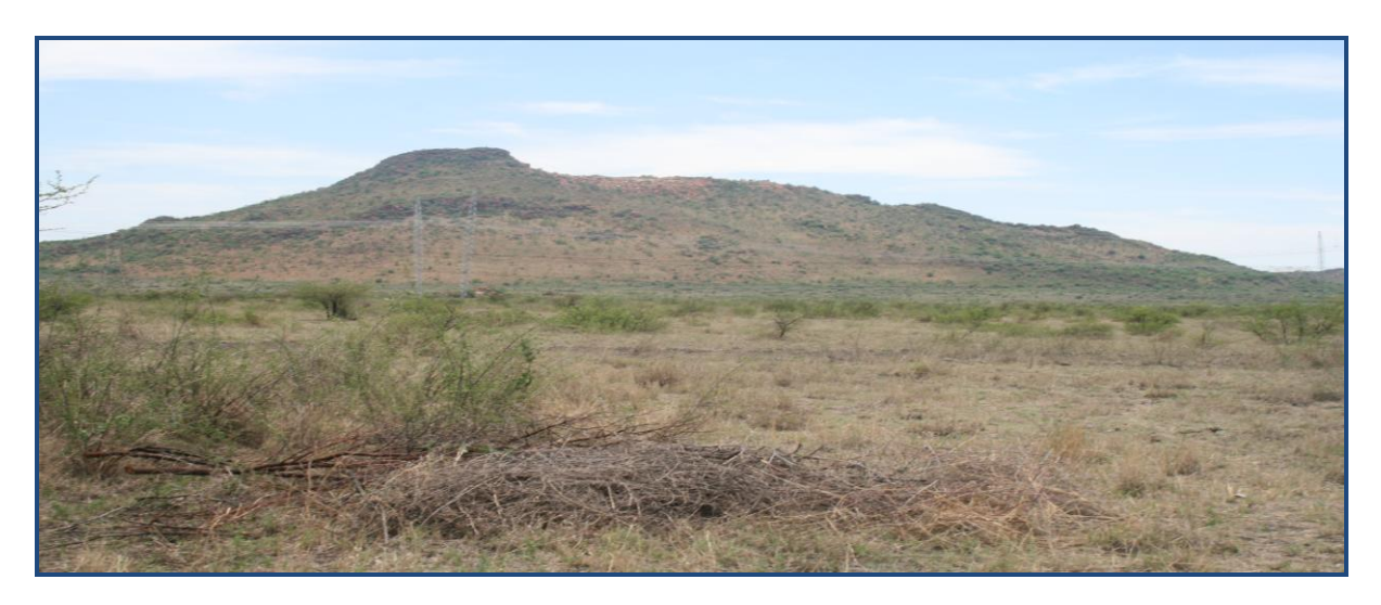
Figure 25: View of the corridor from the substation site