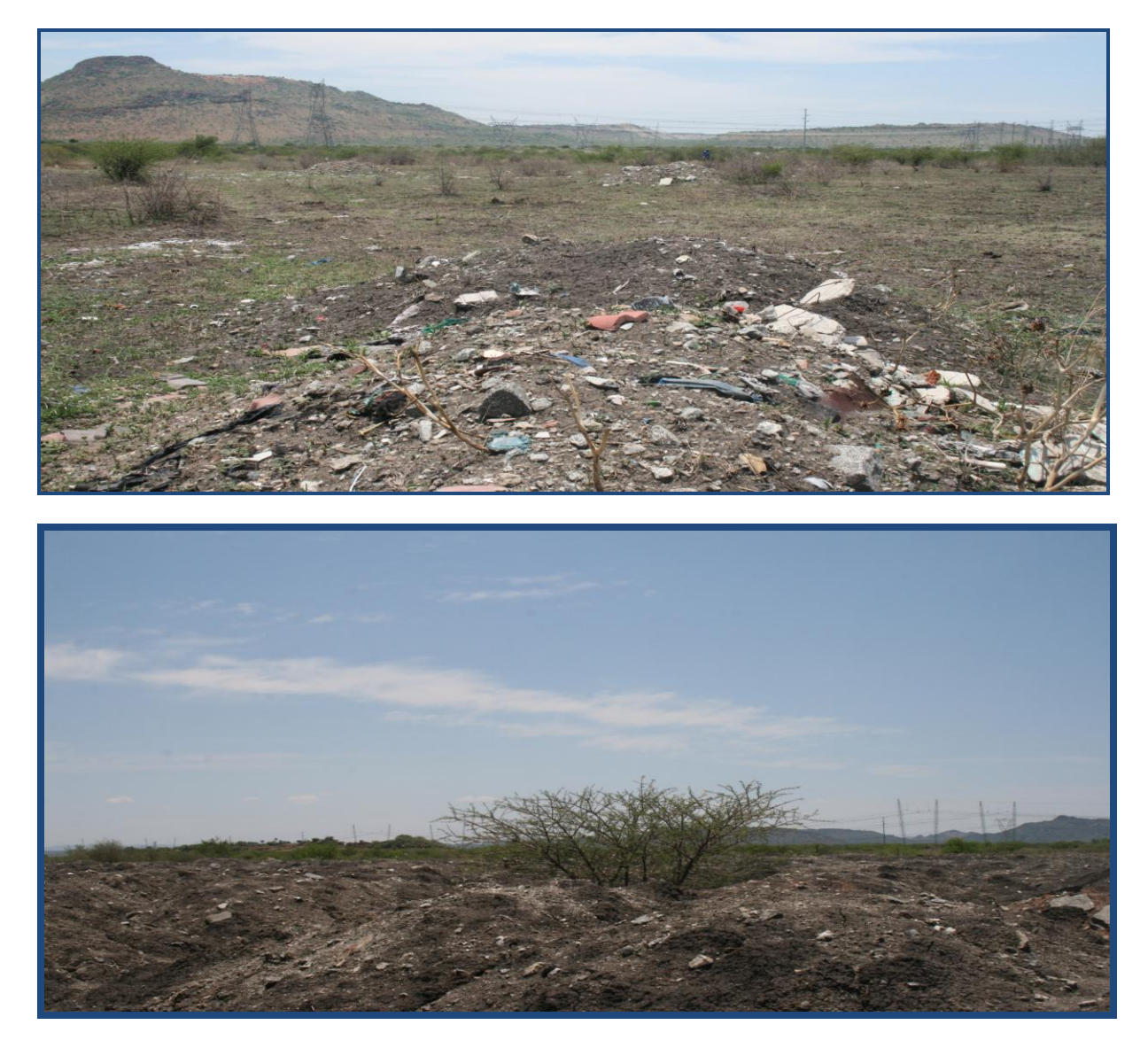
Figure 8 and 9: Some areas within the corridor are used as dumping grounds