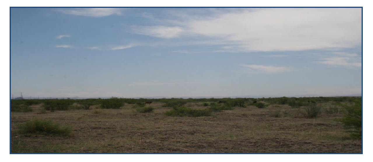
Figure 5: Alternative 1 is also used as grazing land