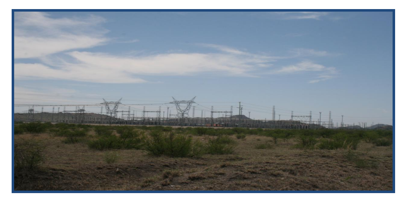
Figure 1 and 2: View of the existing Marang MTS from substation site alternative 1