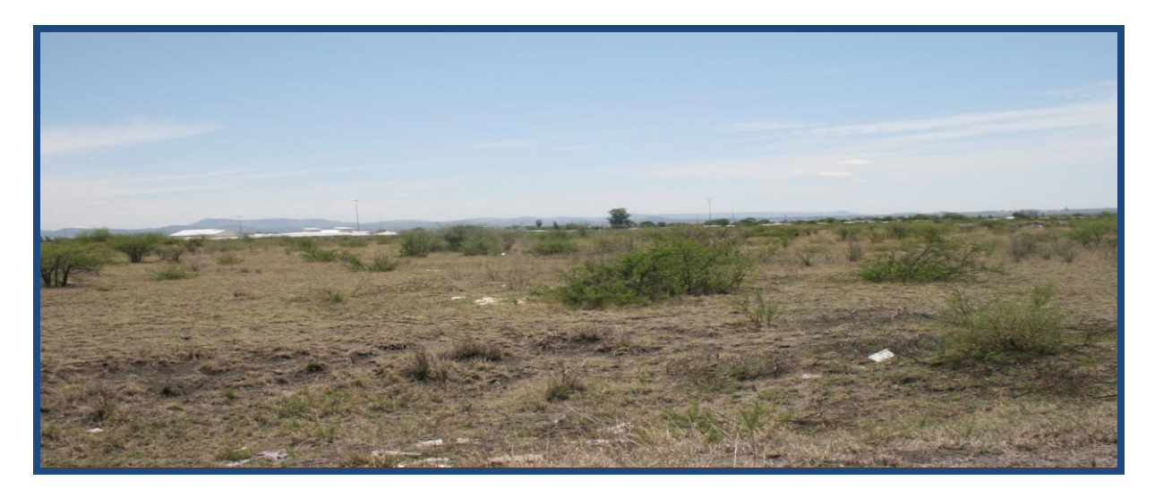
Figure 10: Vegetation within the site is sparse