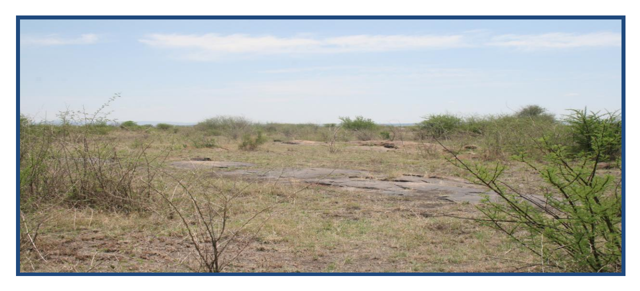
Figure 6: Rocky outcrops in the western side of the substation site