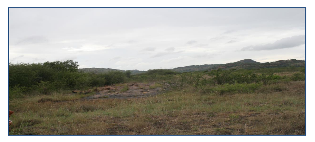
Figure 26: Rocky oucrops north of site