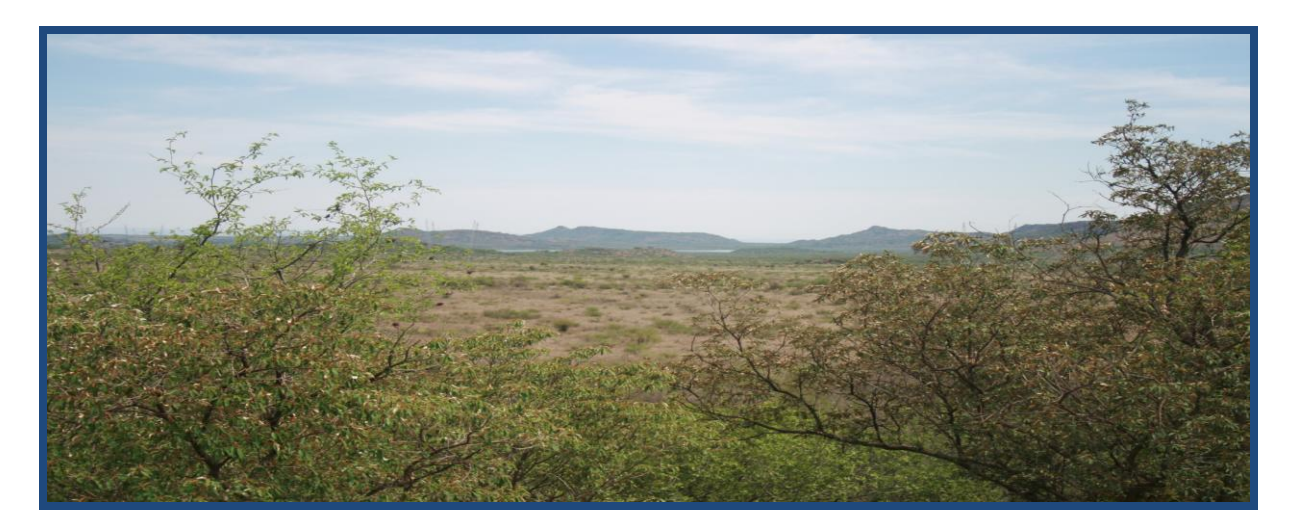
Figure 17: View of the north western side of the substation