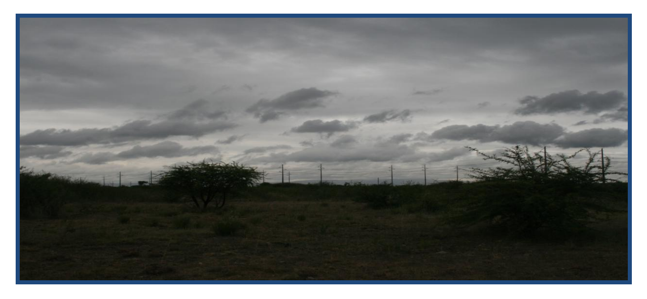
Figure 24: 88kV power lines traverse across the corridor from the existing Marang MTS