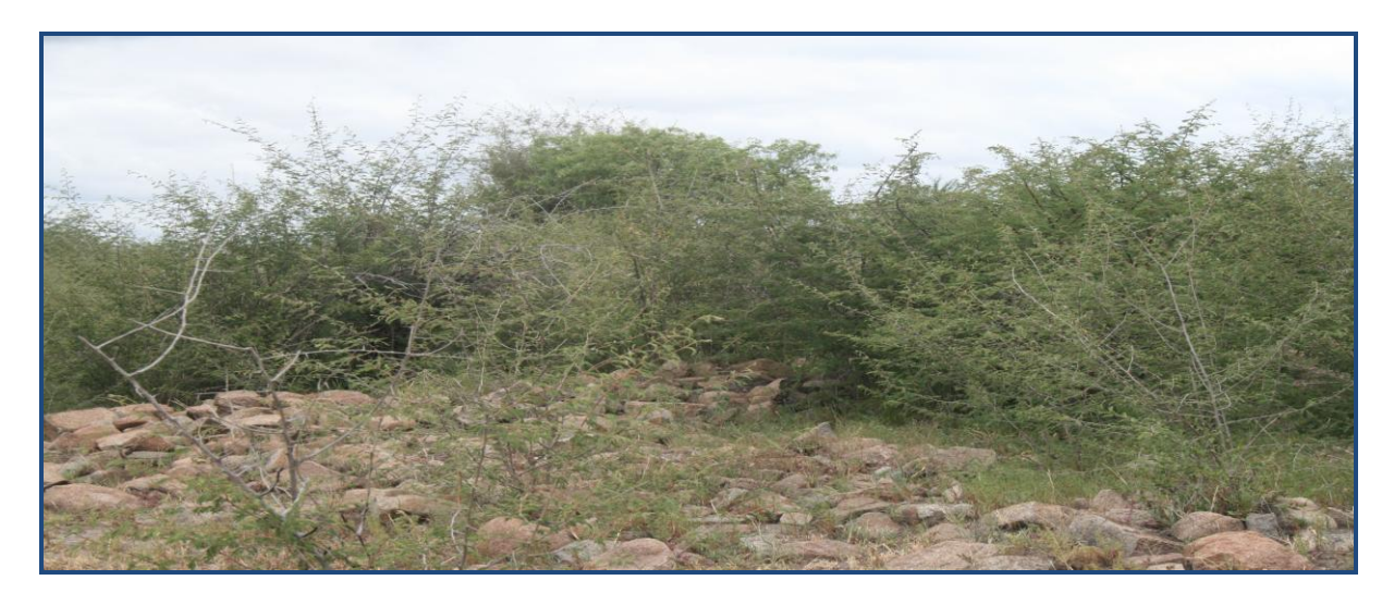
Figure 28: A collection of stones which might have archaeological significance