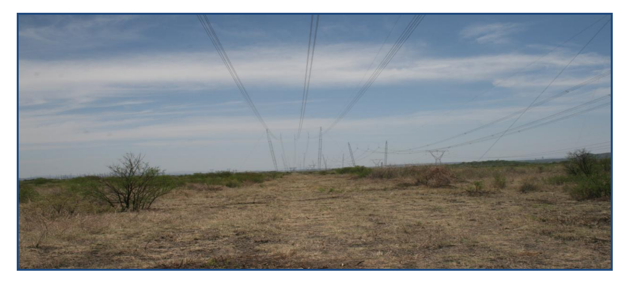
Figure 22: Servitude for the existing 400kV power lines within corridor alternative 2

SUBSTATION SITE AND CORRIDOR ALTERNATIVE 3