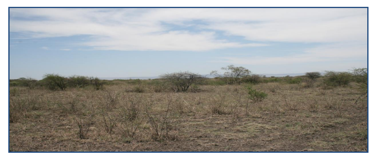
Figure 23: vegetation within the corridor is modified north east of D522 road