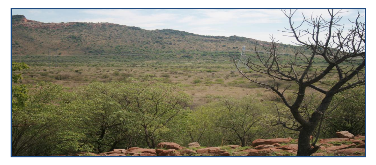
Figure 18: View of the eastern side of the corridor