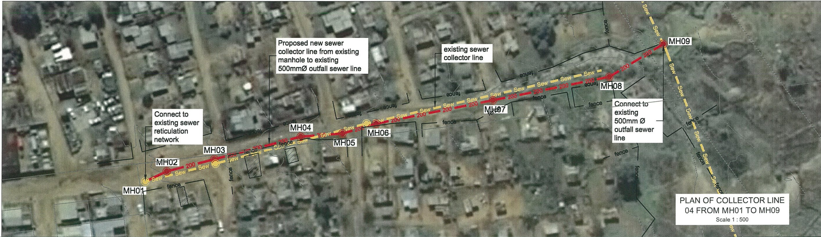
PLAN OF COLLECTOR LINE 04 FROM MH01 TO MH09 Scale 1 : 500

Drawn: I J van Rensburg Date: April 2013 Scale: 1 : 1 000 Drawing Number: NEL 12-31 / 00 / 00 Rev.: 0