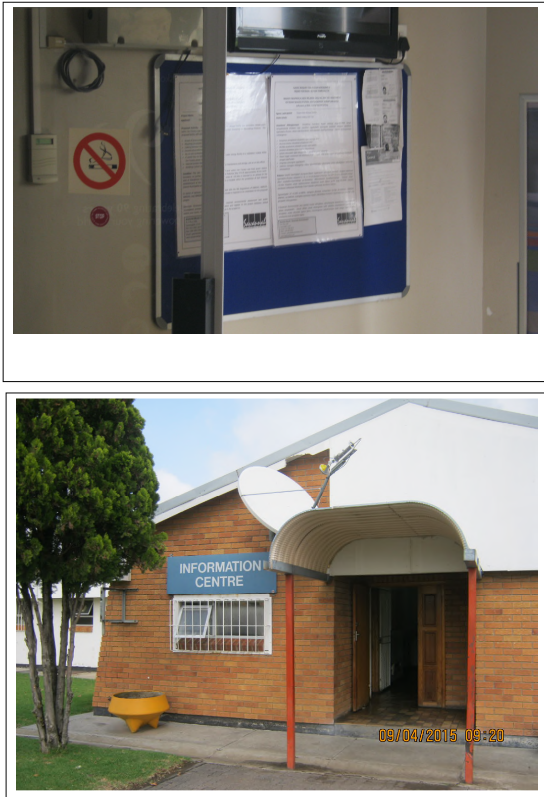
Figure 1: A2 Site notices placed at the Tutuka Power Station Information Centre