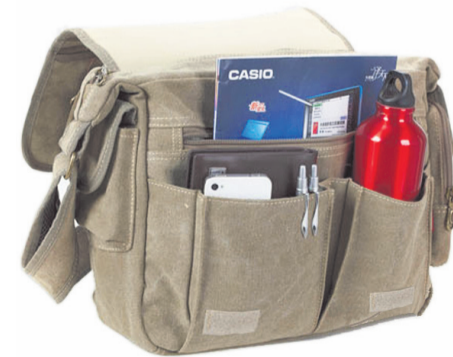
Solidariteit Helpende Hand Bethal-tak bied vir die eerste keer die skooltassieprojek aan.