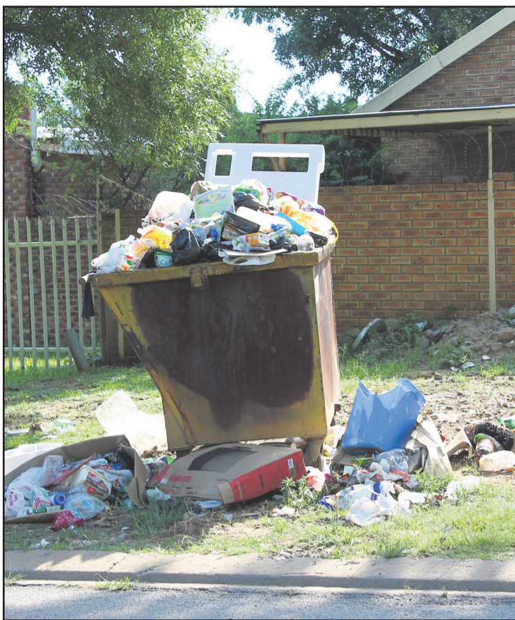
A skip overflows with rubbish in Berg Street.

If you advertise for someone else - bring your ID and their ID