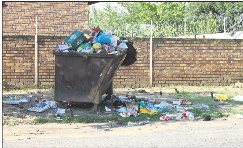
A skip in Handel Street during the festive season.

The municipality said that there was no problem and the skips had been emptied.