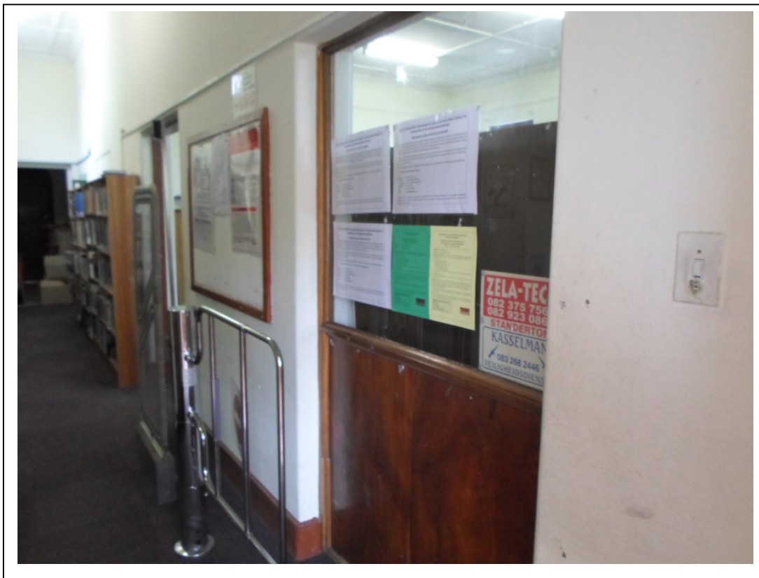
Figure 3: A4 Site notices placed at the Standerton Public Library