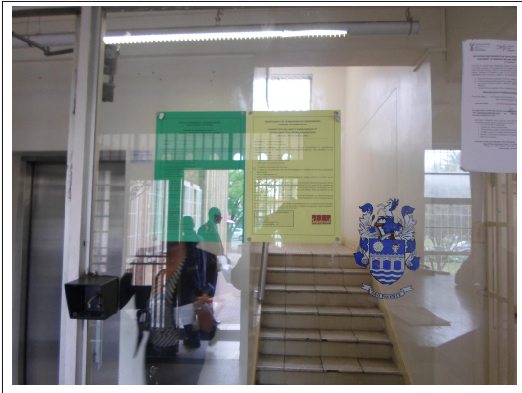
Figure 2: A4 Site notices placed at the Lekwa Local Municipality