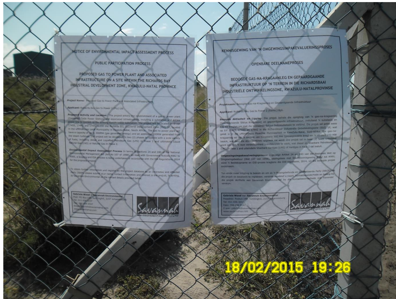
Figure 1: Site Notices Placed at Erven 17455, 17443 and 17442 Coordinates N -28° 44'51.7" E 32° 1'32.84"