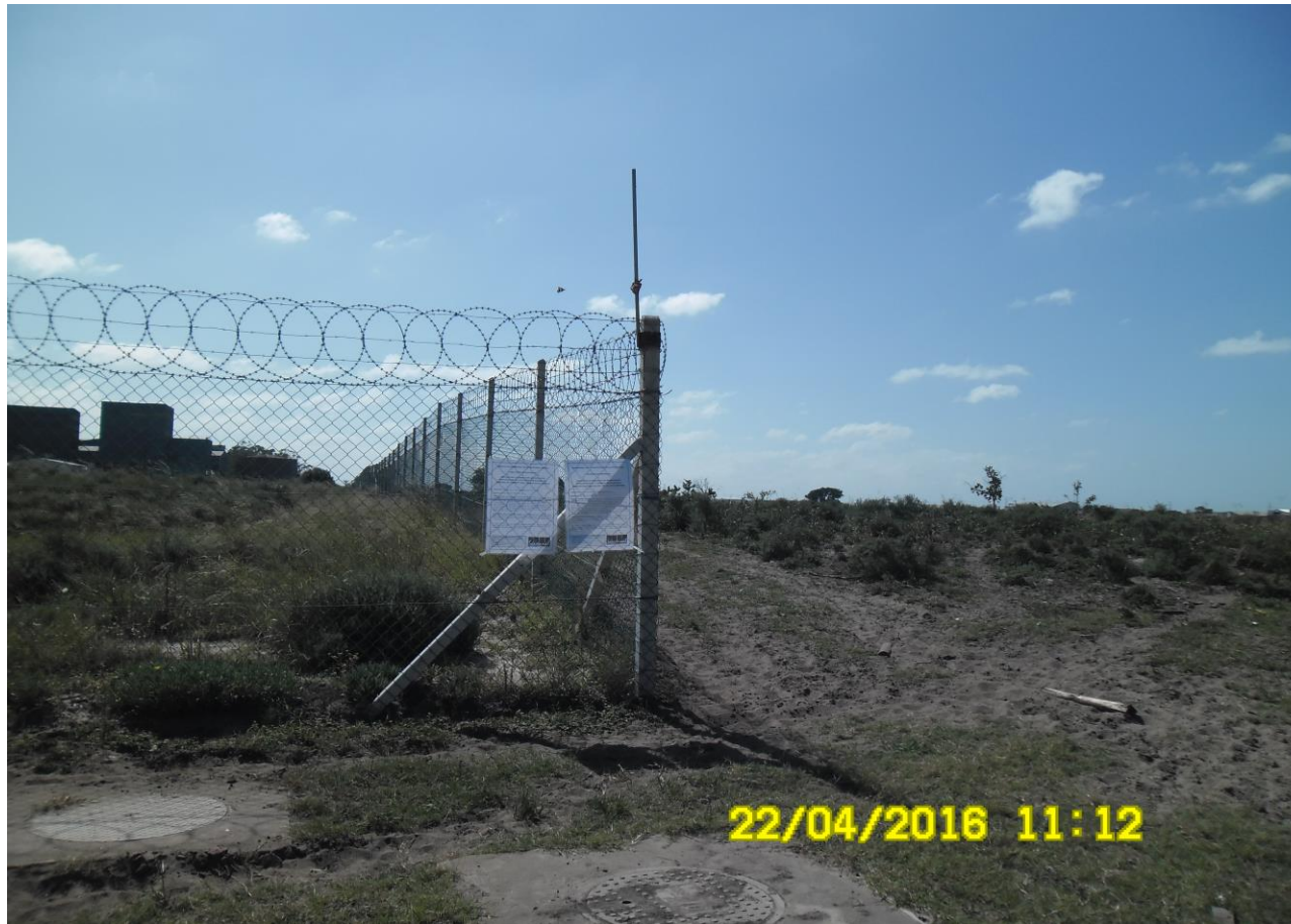
Figure 2: Site Notices placed at 17455, 17443 and 17442 Coordinates N -280 44'51.7" E 320 1'32.84"