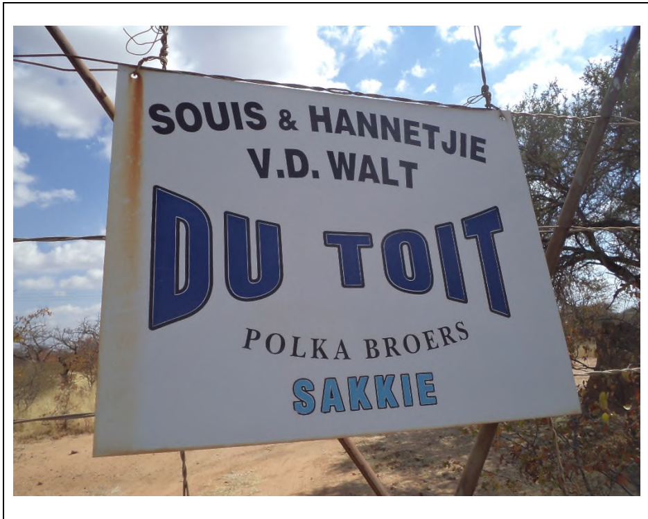
Figure 1: Site Notice placed on the farm boundary of the Farm Du Toit 563 (22° 40' 56.3" S; 29° 48' 32.8" E).