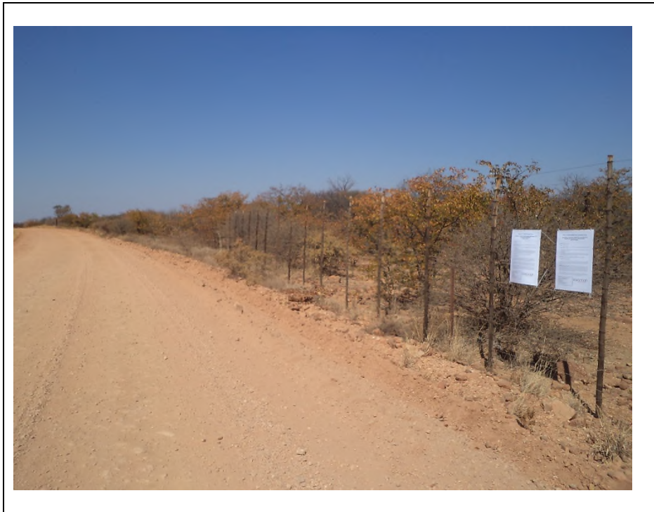
Figure 2: Site notice placed on the farm boundary of the Farm Vrienden 589 (22° 41' 17" S; 29° 48' 24.5" E).