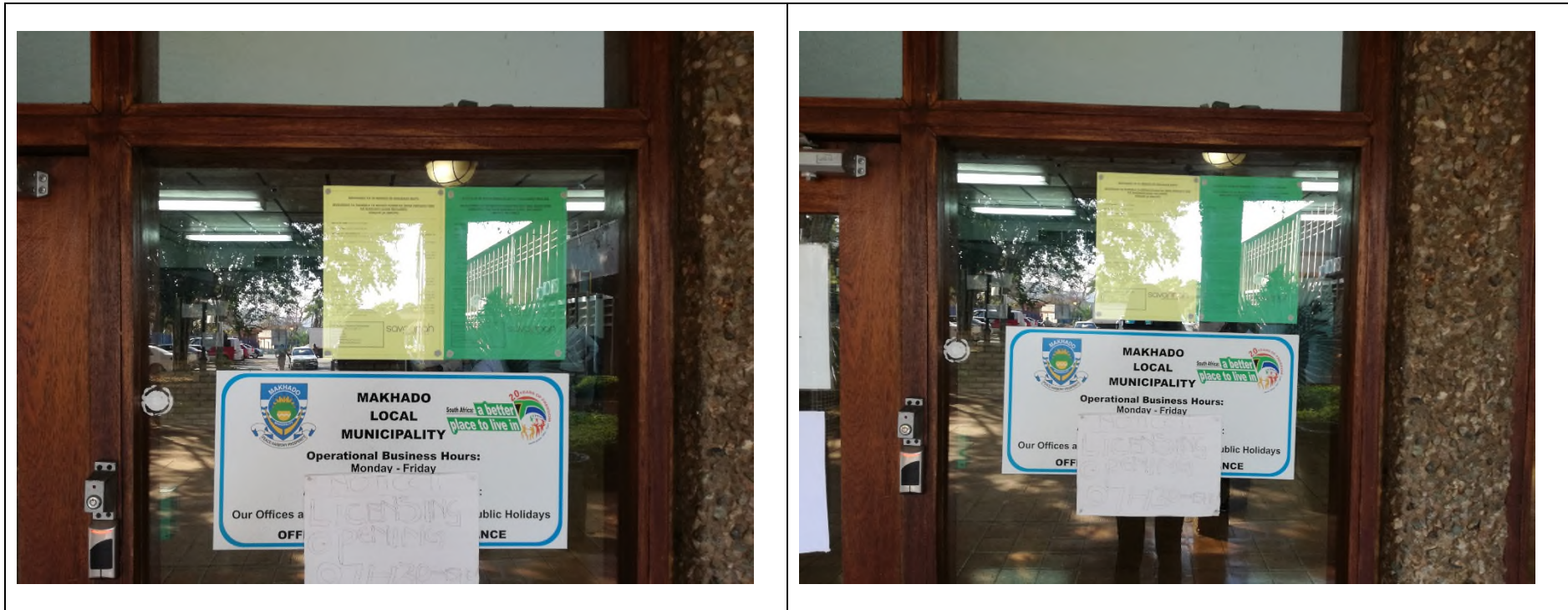
Figure 4: Notices placed at the entrance to the Makhado Local Municipality.