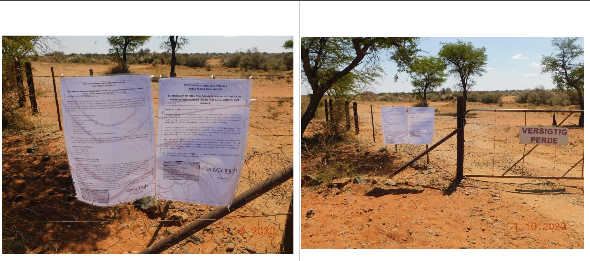
Co-ordinates: 26° 2'43.32"S / 26° 6'38.24"E (At the entrance to the Remainder of the Farm Lyndoch 432)