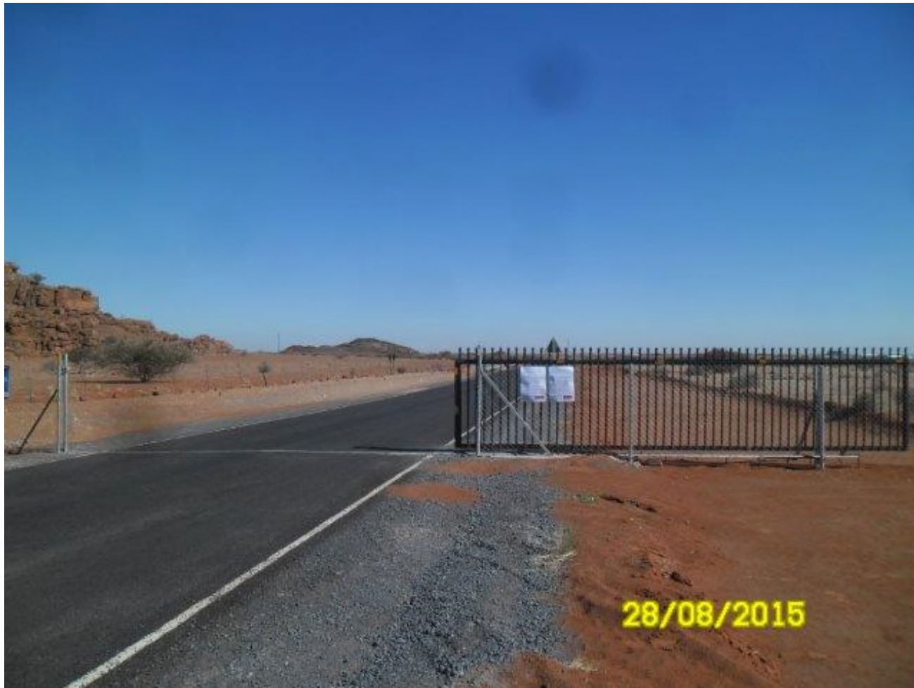
Figure 2: Site Notices placed at Paulputs Transmission Substation. Coordinates; S 28° 51' 47.2"; N 19° 37' 15.6"