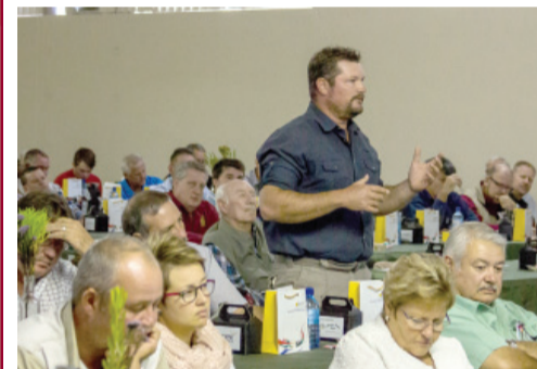
Die oggend is bygewoon deur belangstellendes uit die omgewing. Daar was ook geleentheid vir vroeë vrag wat die aanbieding baie interessant gemaak het.

Die organiseerders wil baie dankie sê aan die IDC, Landbank, ORC, KKK en Kaap Agri wat gehelp het om die aanbieding moontlik te maak.