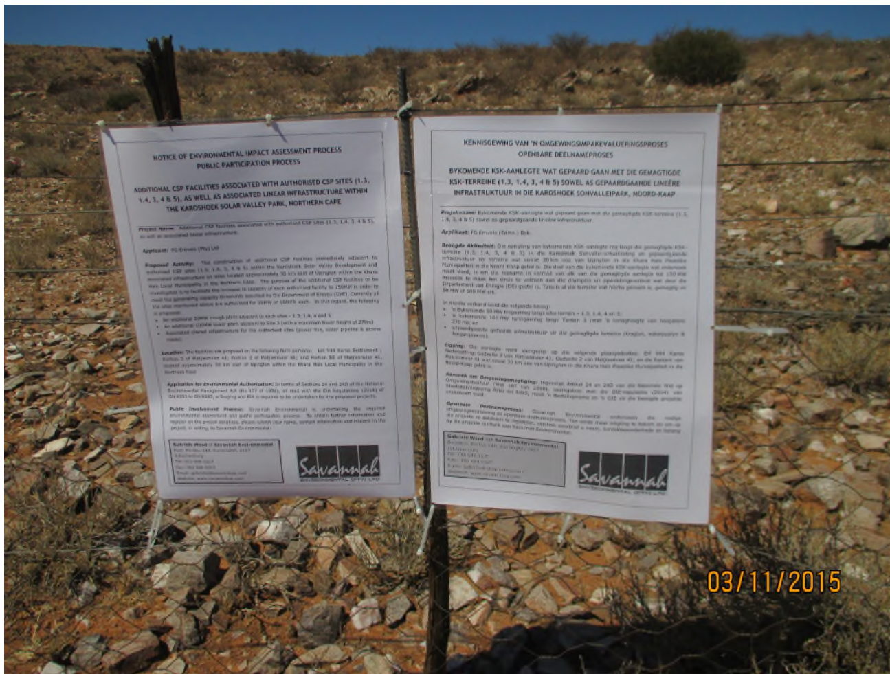
Figure 2: Site Notices placed on the boundary fence of Farm Matjesrivier 2/41