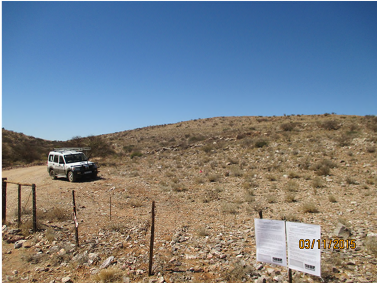
Figure 3: Site Notices placed on the boundary fence of Farm Majesrivier 3/41