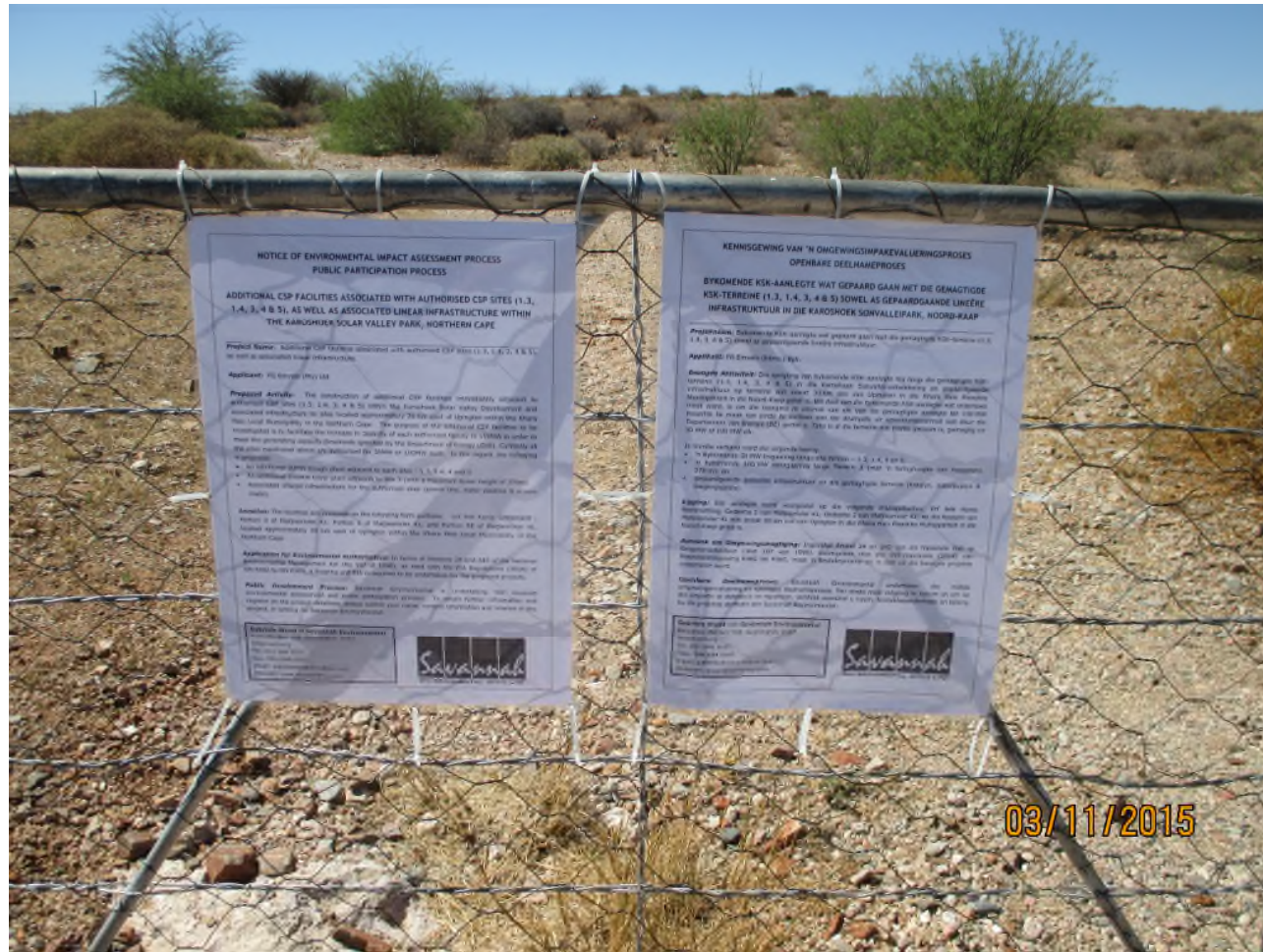
Figure 1: Site Notice placed on the boundary fence of Matjesrivier RE/41