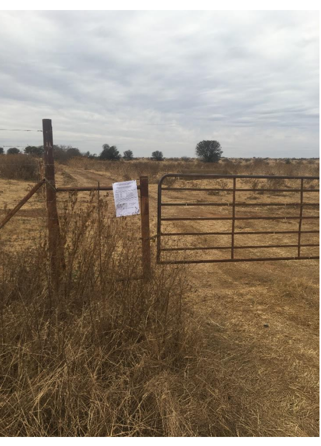
Location: 26 1' 16" S 26 11' 33" E