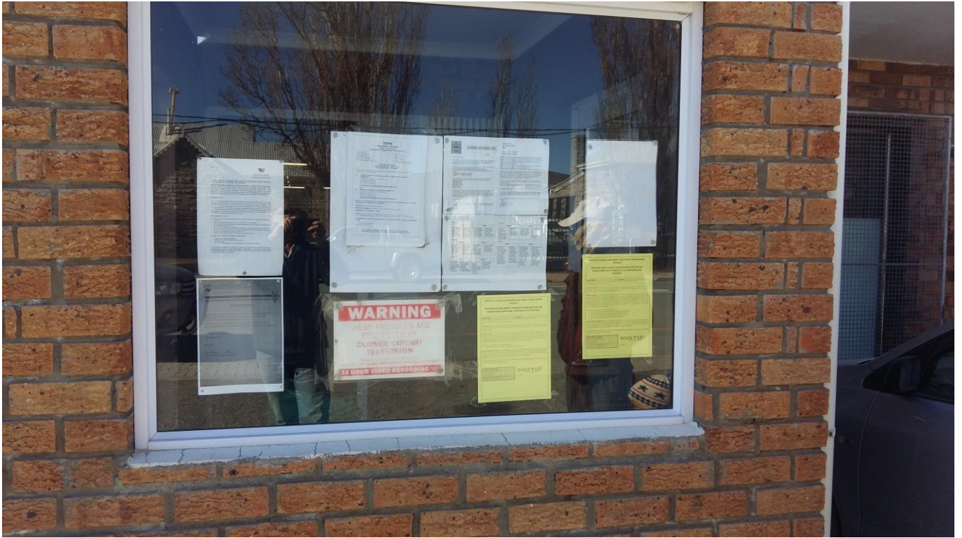
Figure 5: Process Notice 2 placed at the entrance to Sutherland Food Store, Northern Cape (32°23'44.65"S; 20°39'40.09"E)