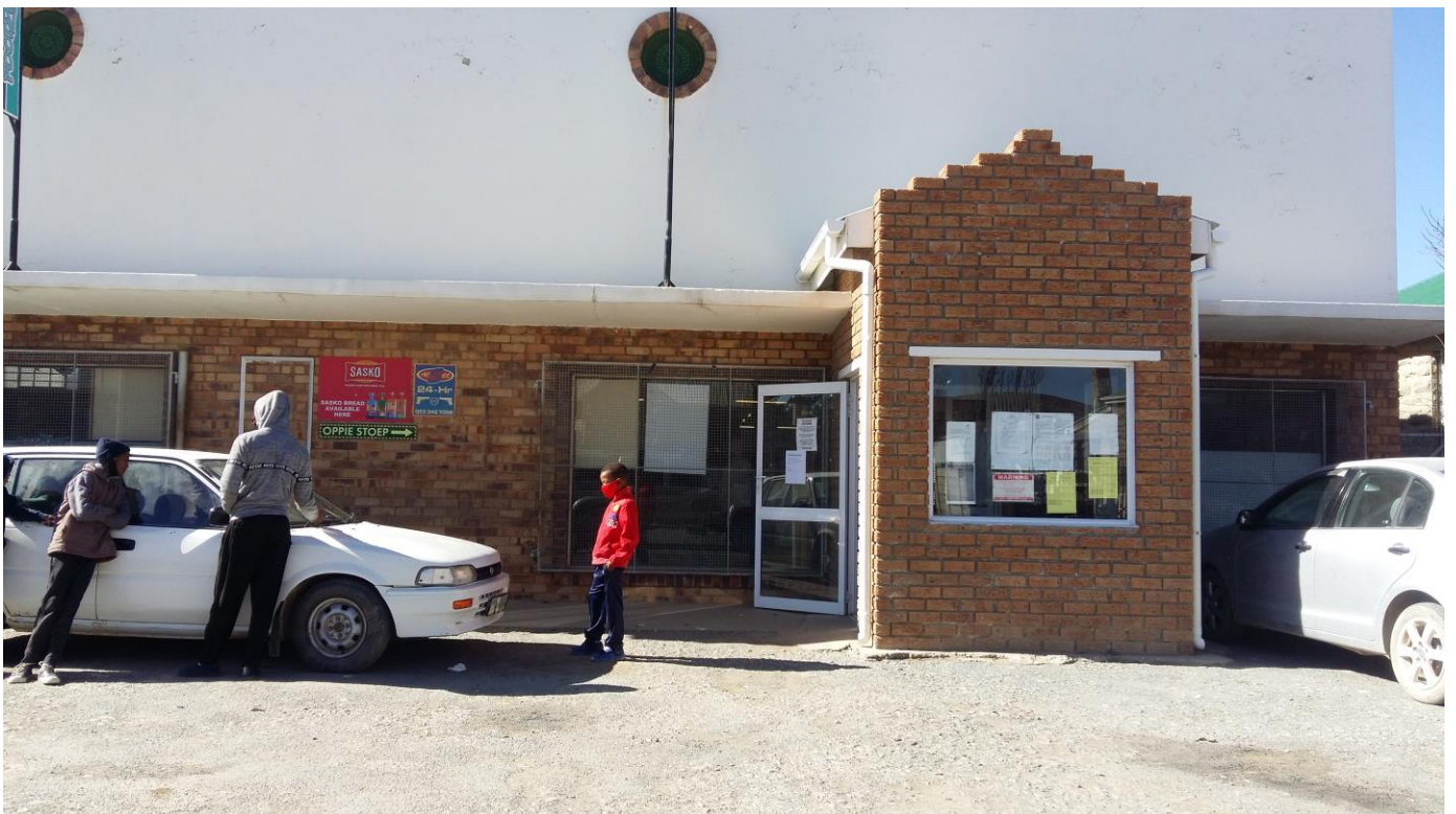
Figure 6: Process Notice 2 placed at the entrance to Sutherland Food Store, Northern Cape (32°23'44.65"S; 20°39'40.09"E)