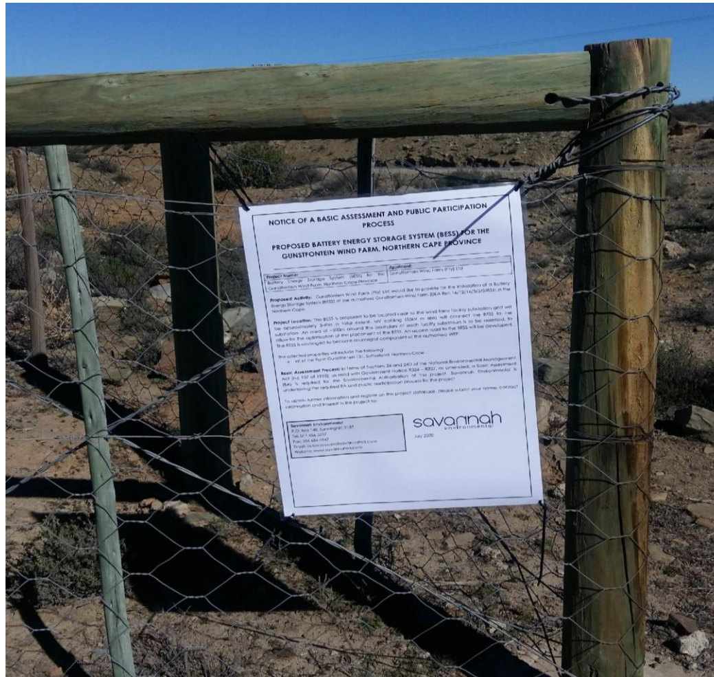
Figure 3: Site notice 2 placed along the turn off to Gunstfontein Wind Farm along Klein Roggeveld Road (32°31'26.94"S; 20°38'11.44"E).