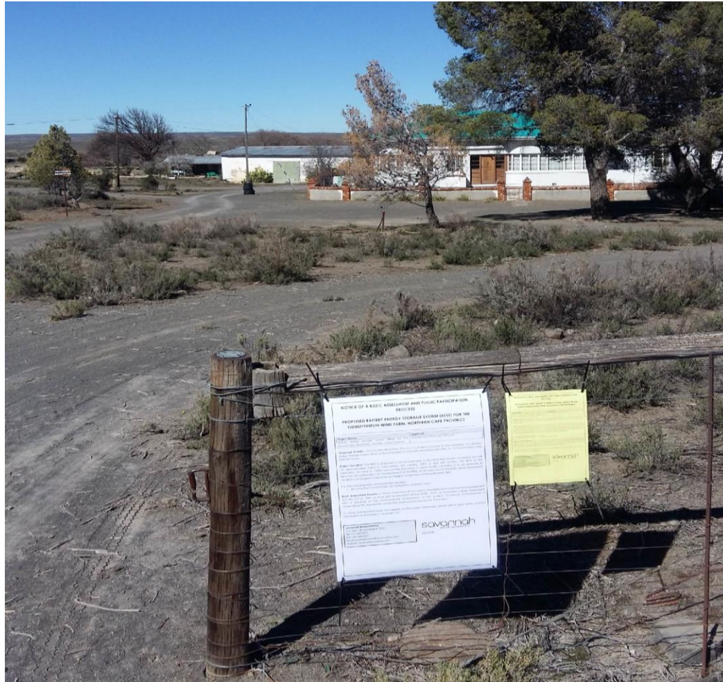
Figure 1: Site notice and Process Notice 1 placed at the site entrance off Klein Roggeveld Road, Northern Cape (32°33'57.59"S; 20°40'57.22"E)