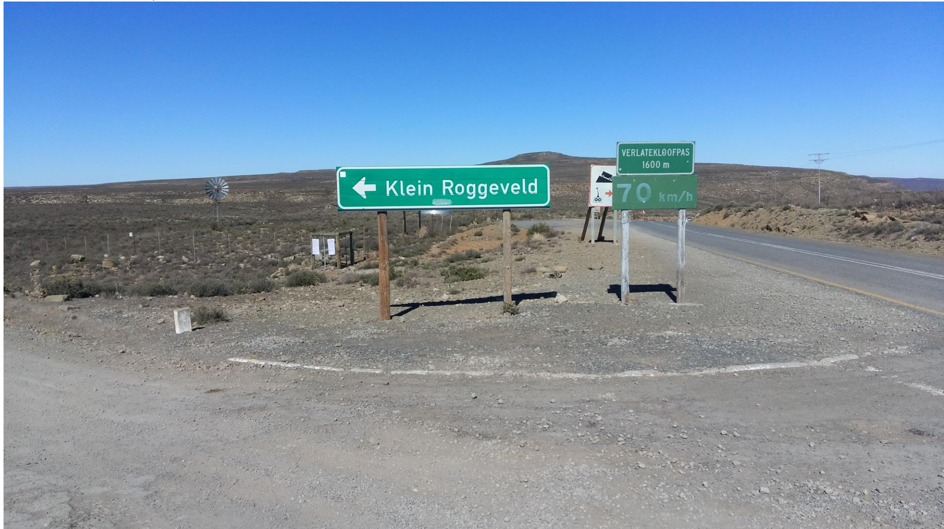
Figure 4: Site notice 2 placed along the turn off to Gunstfontein Wind Farm along Klein Roggeveld Road (32°31'26.94"S; 20°38'11.44"E).