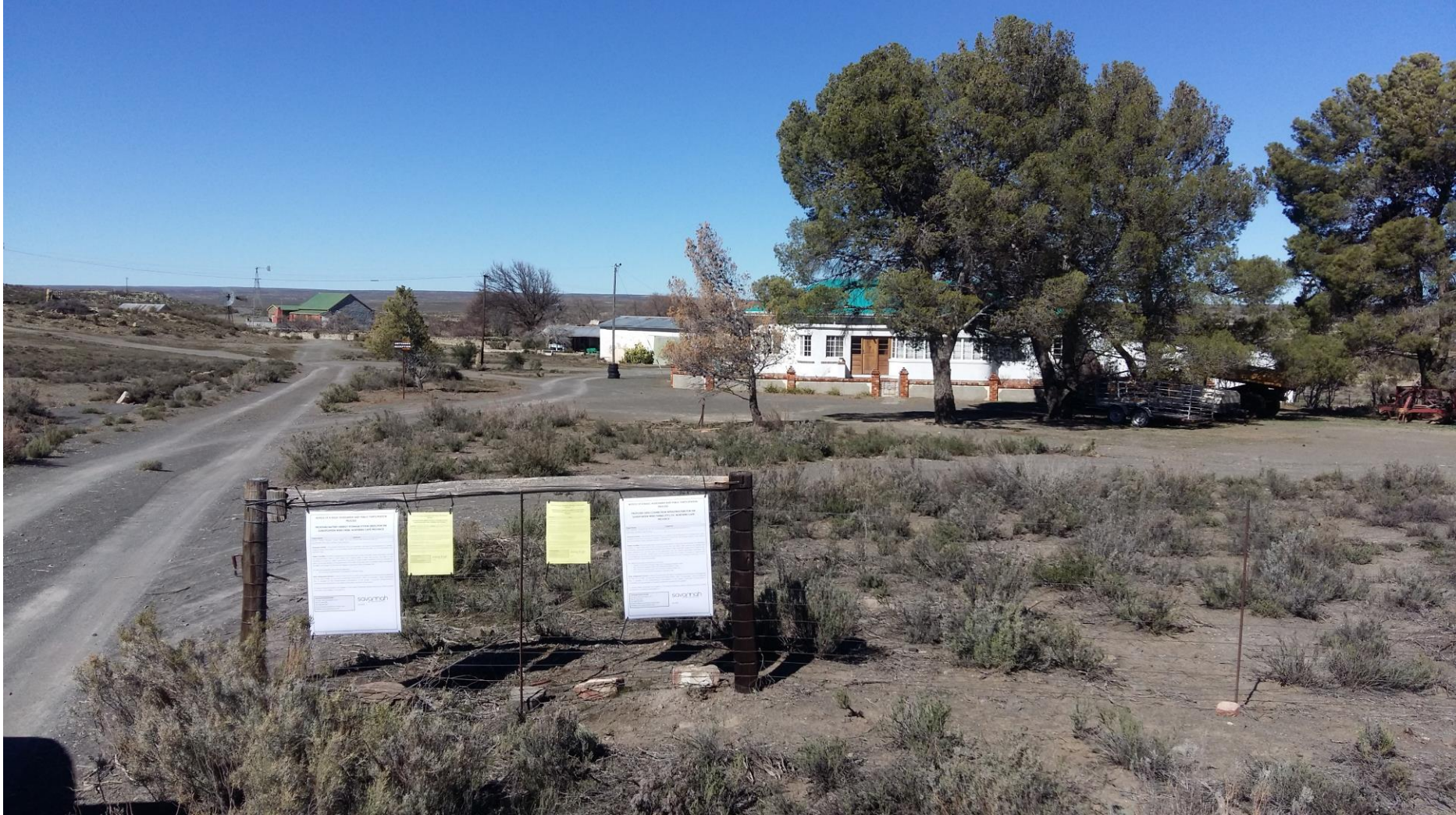
Figure 2: Site notice and Process Notice 1 placed at the site entrance off Klein Roggeveld Road, Northern Cape (32°33'57.59"S; 20°40'57.22"E)