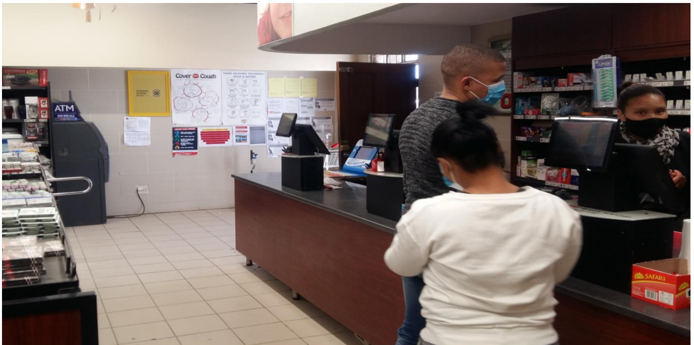
Figure 8: Process Notice 3 placed at the entrance to Sutherland OK Foods, Northern Cape (32°23'31.50"S; 20°39'44.34"E)