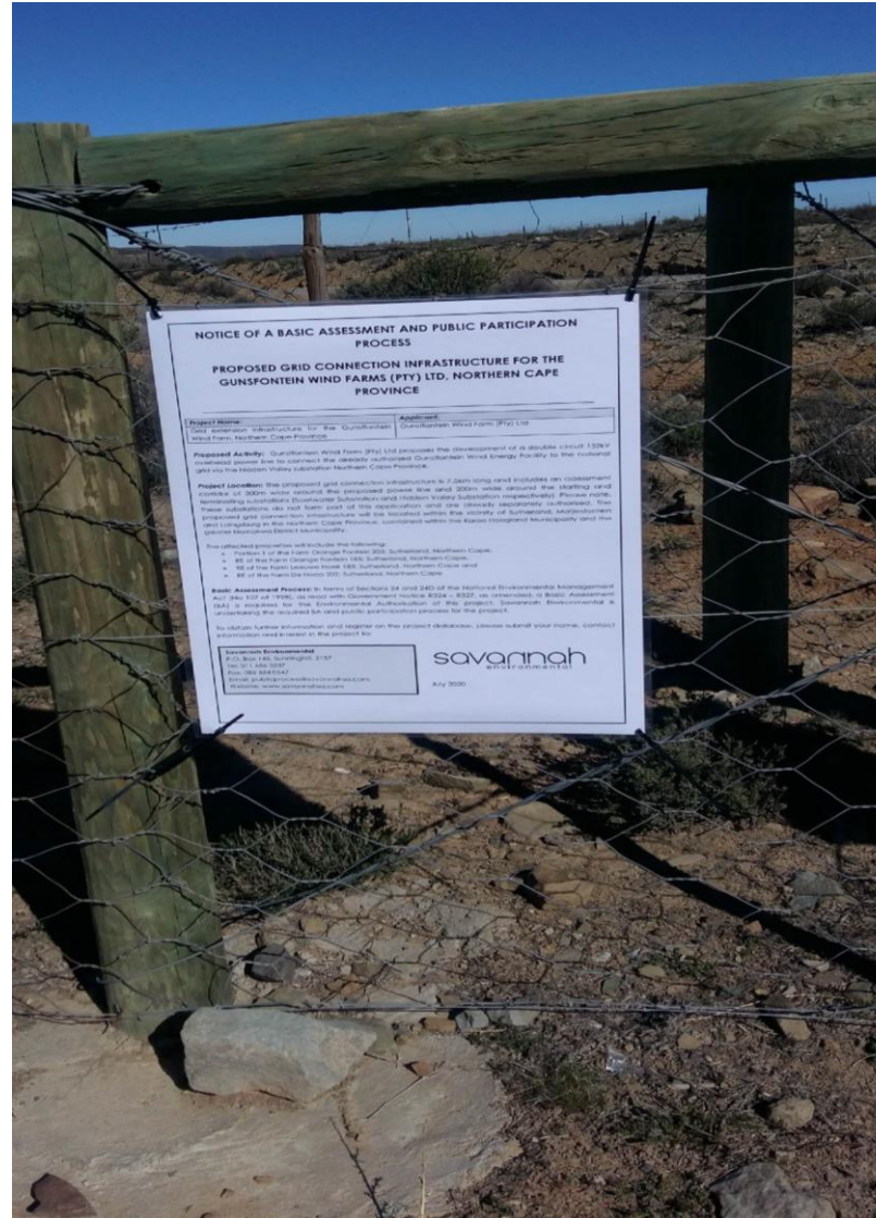
Figure 3: Site Notice placed along the turn off to Gunstfontein Wind Farm along Klein Roggeveld Road (32°31'26.94"S; 20°38'11.44"E).