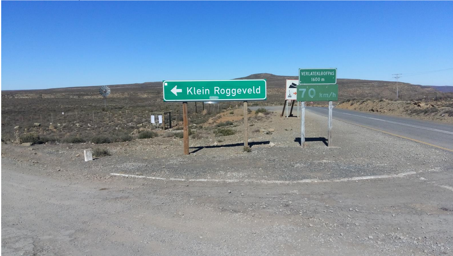
Figure 4: Site Notice placed along the turn off to Gunstfontein Wind Farm along Klein Roggeveld Road (32°31'26.94"S; 20°38'11.44"E).