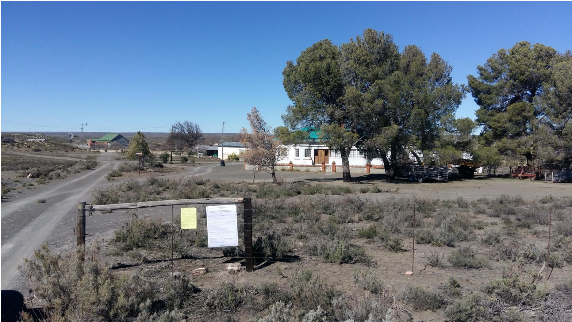
Figure 2: Site Notice and Process Notice placed at the site entrance off Klein Roggeveld Road, Northern Cape (32°33'57.59"S; 20°40'57.22"E)