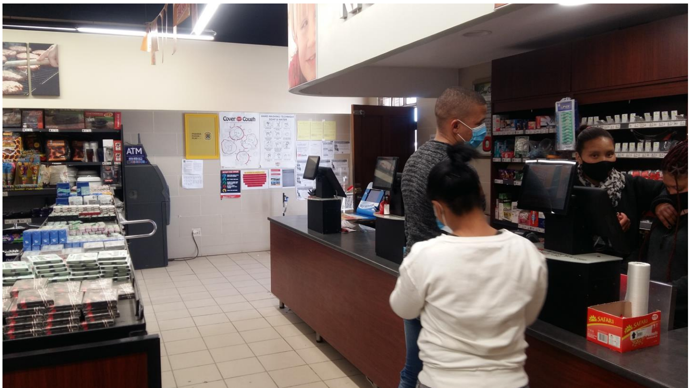
Figure 3: Process Notices placed at the entrance to Sutherland OK Foods, Northern Cape (32°23'31.50"S; 20°39'44.34"E)