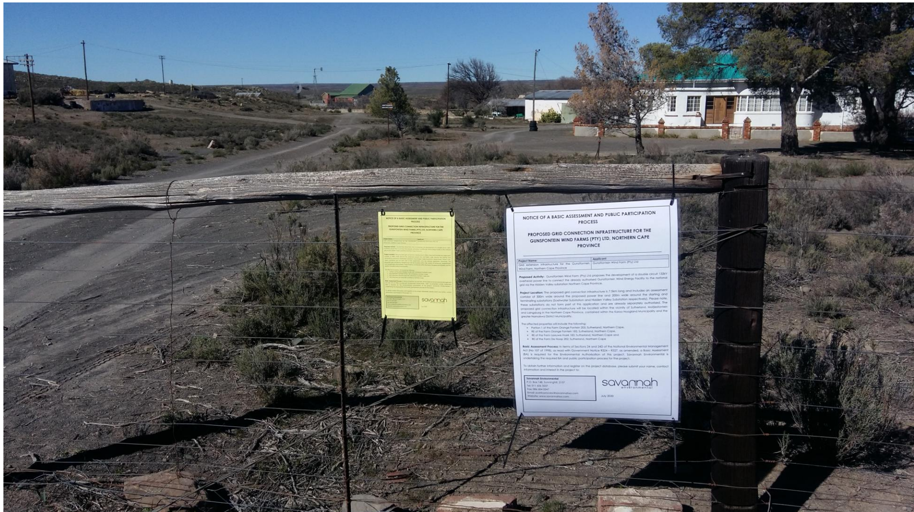
Figure 1: Site Notice and Process Notice placed at the site entrance off Klein Roggeveld Road, Northern Cape (32°33'57.59"S; 20°40'57.22"E)