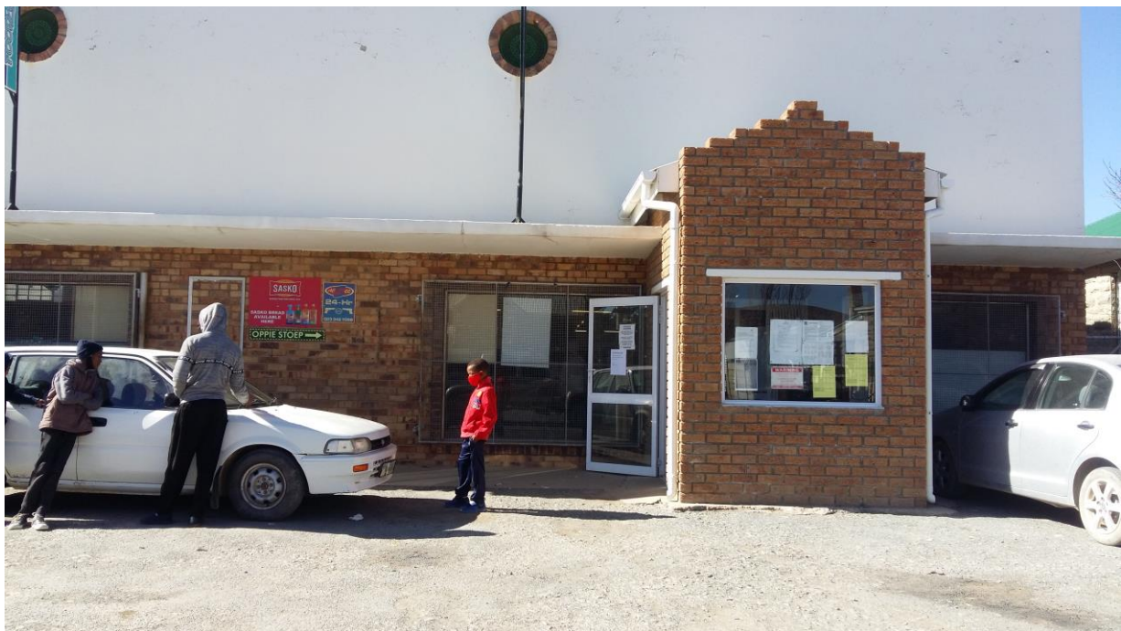
Figure 1: Process Notices placed at the entrance to Sutherland Food Store, Northern Cape (32°23'44.65"S; 20°39'40.09"E)