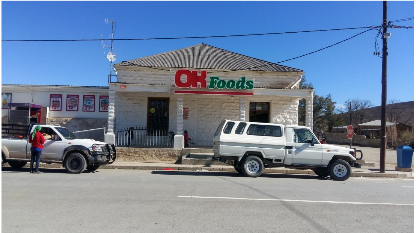
Figure 4: Entrance to Sutherland OK Foods, Northern Cape (32°23'31.50"S; 20°39'44.34"E) where Process Notice 3 is placed.