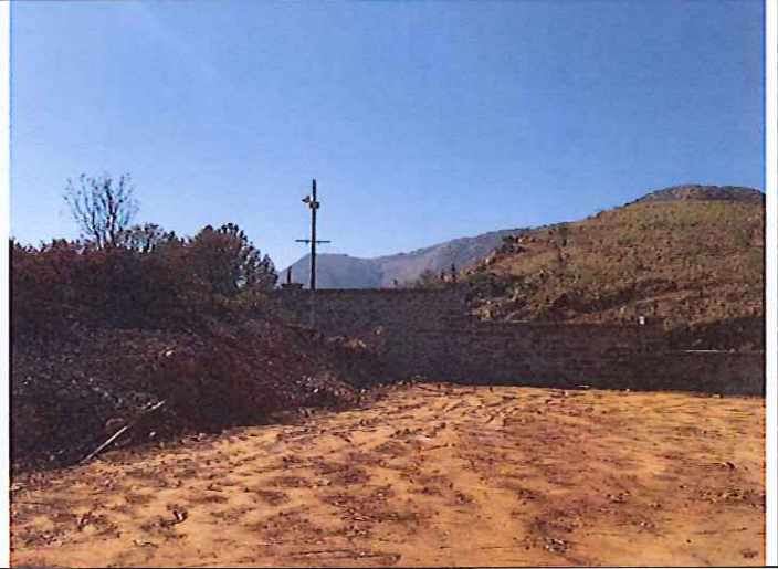
Looking south east towards boundary wall and R24