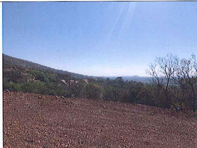
Looking east towards existing structures / facilities