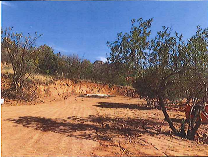
Looking north towards Magaliesberg

Expansion Area 1 destined for new accommodation block (Accommodation block 5). Area is cleared because it is currently used for parking (overflow parking) 25° 46' 50.8" South, 27° 15' 23.8" East