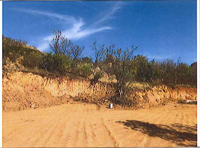
Looking north west

Expansion Area 2 destined for new accommodation block (Accommodation block 6). Area is cleared because it is currently used for parking (overflow parking) 25° 46' 46.1" South, 27° 15' 18.3" East