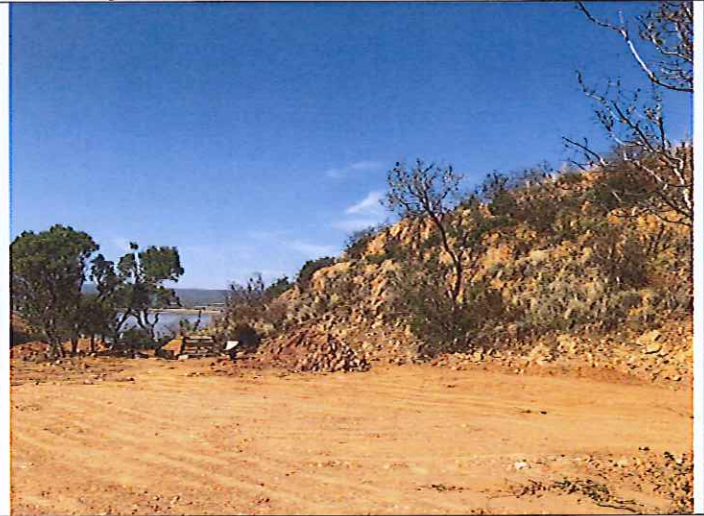
Looking south west towards R24 and Olifantsnek Dam