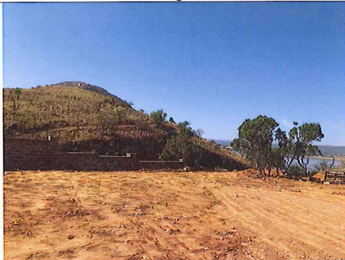
Looking south towards boundary wall, R24 and Olifantsnek Dam