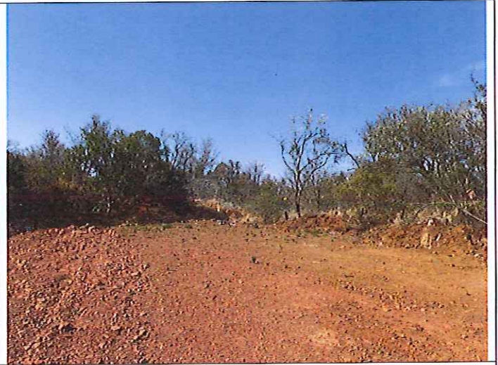
Looking south west towards property boundary