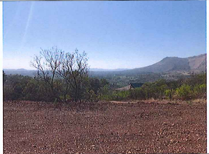
Looking south east towards roof of conference hall