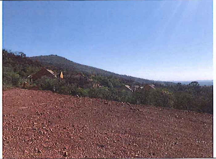
Looking north east towards existing structures / facilities