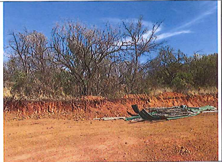
Looking north west