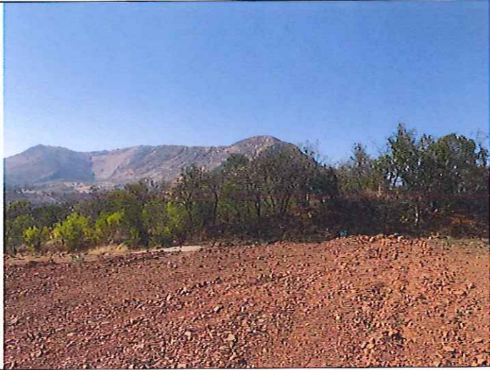
Looking south towards Magaliesberg (neck of elephant)