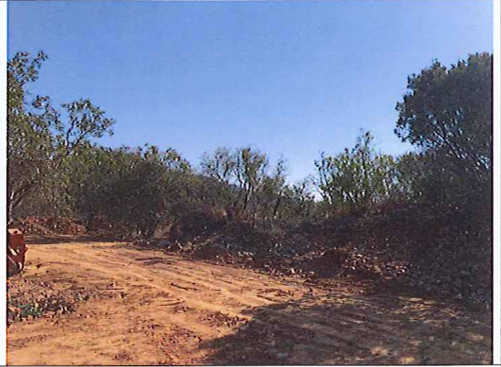
Looking north east towards road and conference hall