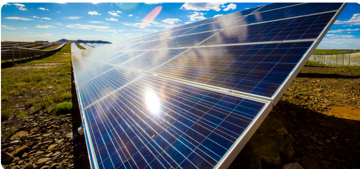
Figuur 1: FV-sonkragaanleg

Die FV-panele is ontwerp om vir meer as 20 jaar ononderbroke, onbeman en met min instandhouding bedryf te word.