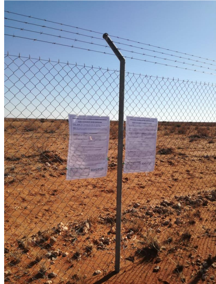
Co-ordinates: 28°31'47.90"S / 21° 4'4.50"E