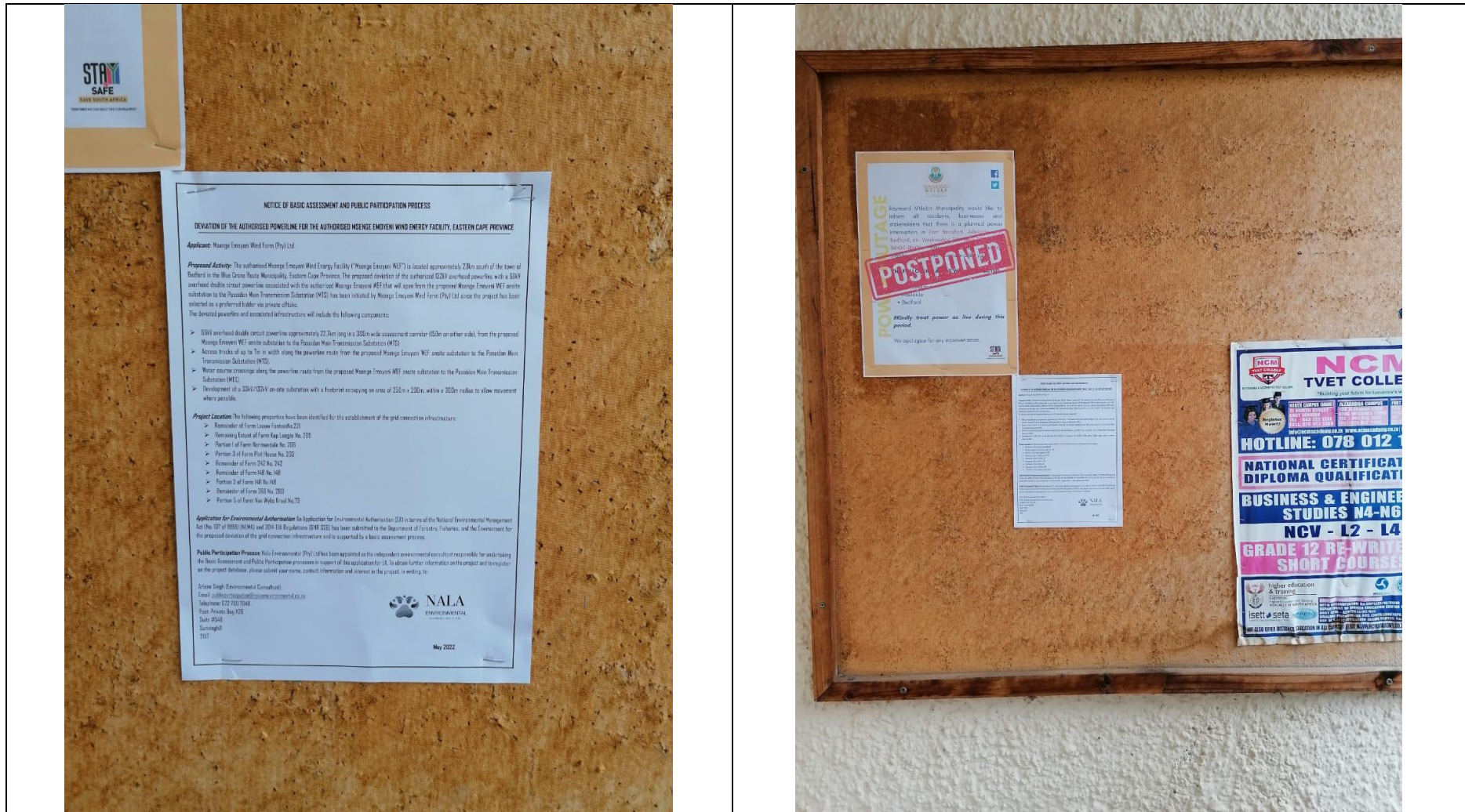
Process Notice in English placed at JG Farr Memorial Library, Bedford, Eastern Cape Province (32°40'41.61"S 26°05'18.32"E)