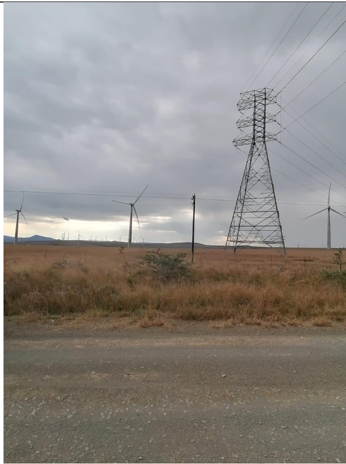
Near existing Poseidon Substation and Cookhouse wind farm in the vicinity (Remainder of Farm 242 No. 242)