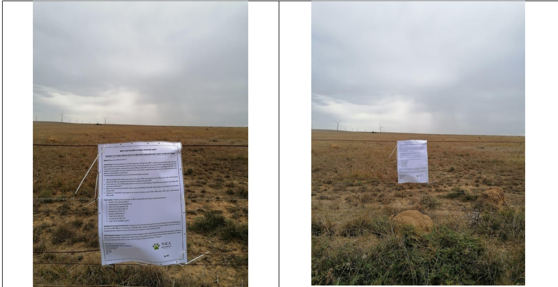
Site Notice in English placed at site Notice 2 (fencing of Remainder of Farm 260 No. 260), Eastern Cape Province (32°45'57.26"S 26°01'52.15"E)