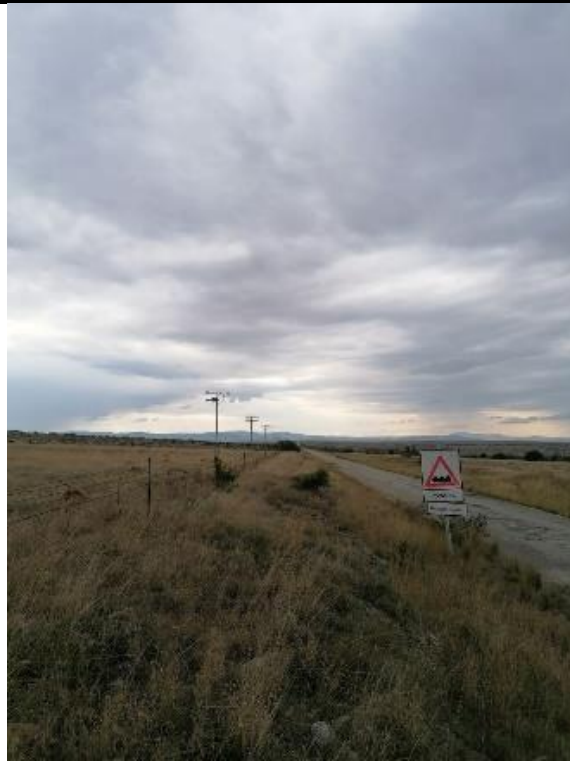
Near site notice 1 placement, Remainder of Farm Leeuw Fontein No.221, Facing North towards Bedford, Eastern Cape Province