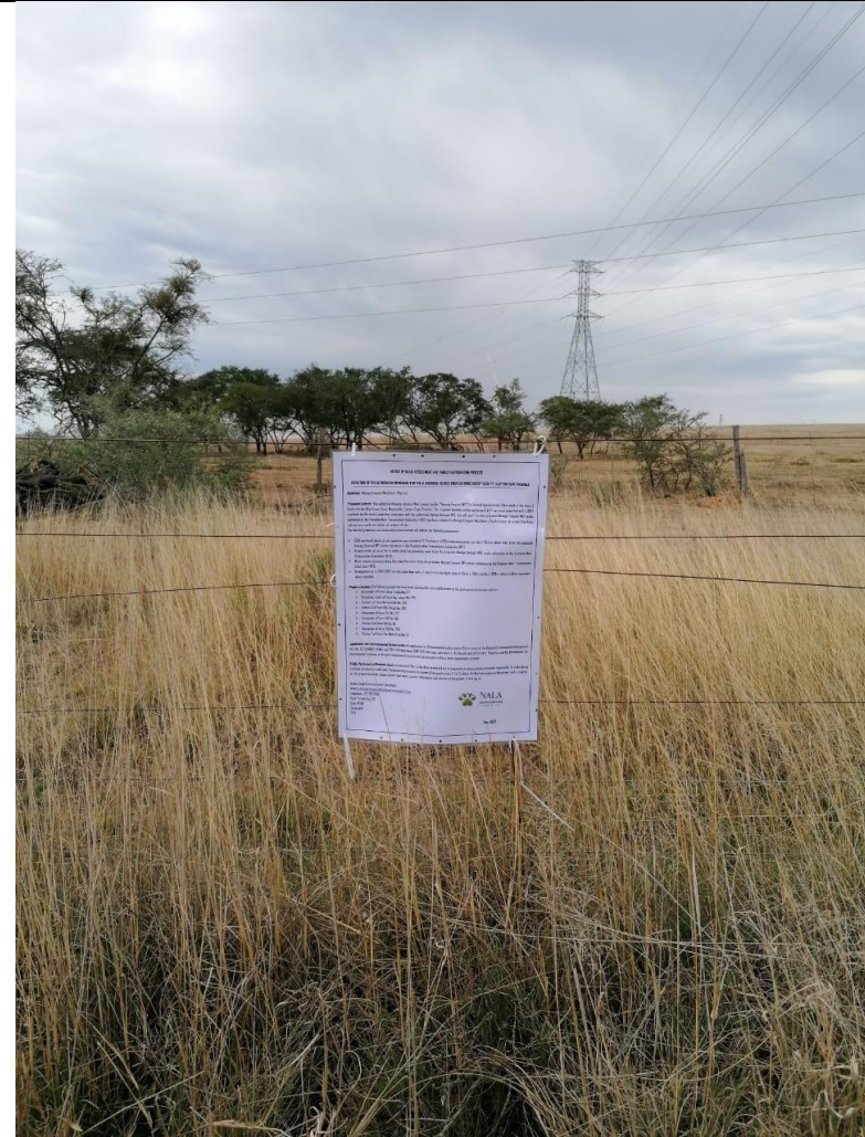
Site Notice in English placed at site Notice 3 (fencing of Remainder of Farm 242 No. 242), near Poseidon substation, Eastern Cape Province (32°44'57.92"S 25°56'12.39"E)