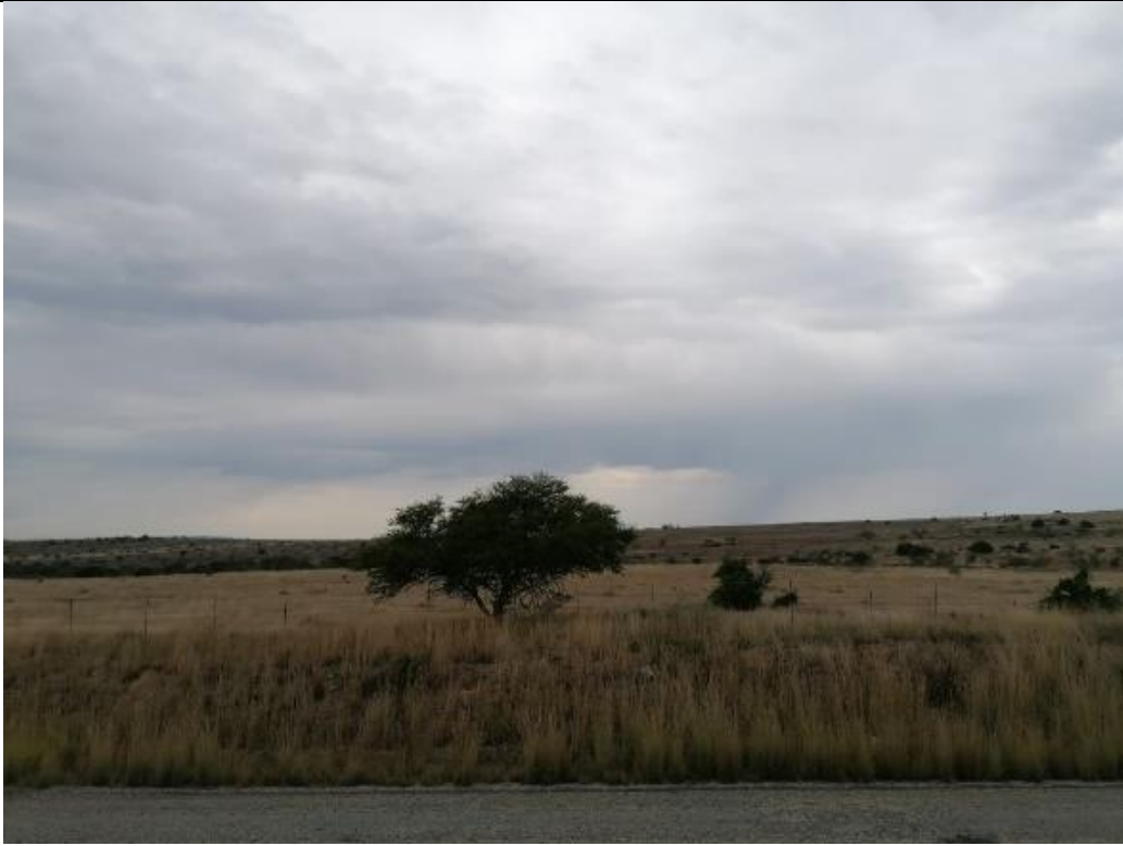
Near site notice 1 placement, Remainder of Farm Leeuw Fontein No.221, Facing North-west towards Cookhouse, Eastern Cape Province