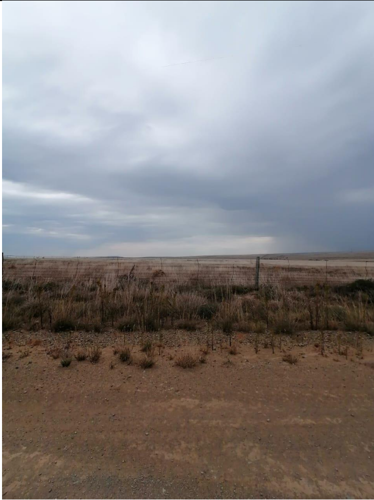
In the Remainder of Farm 260 No. 260 near site Notice 2 placement, Eastern Cape Province.