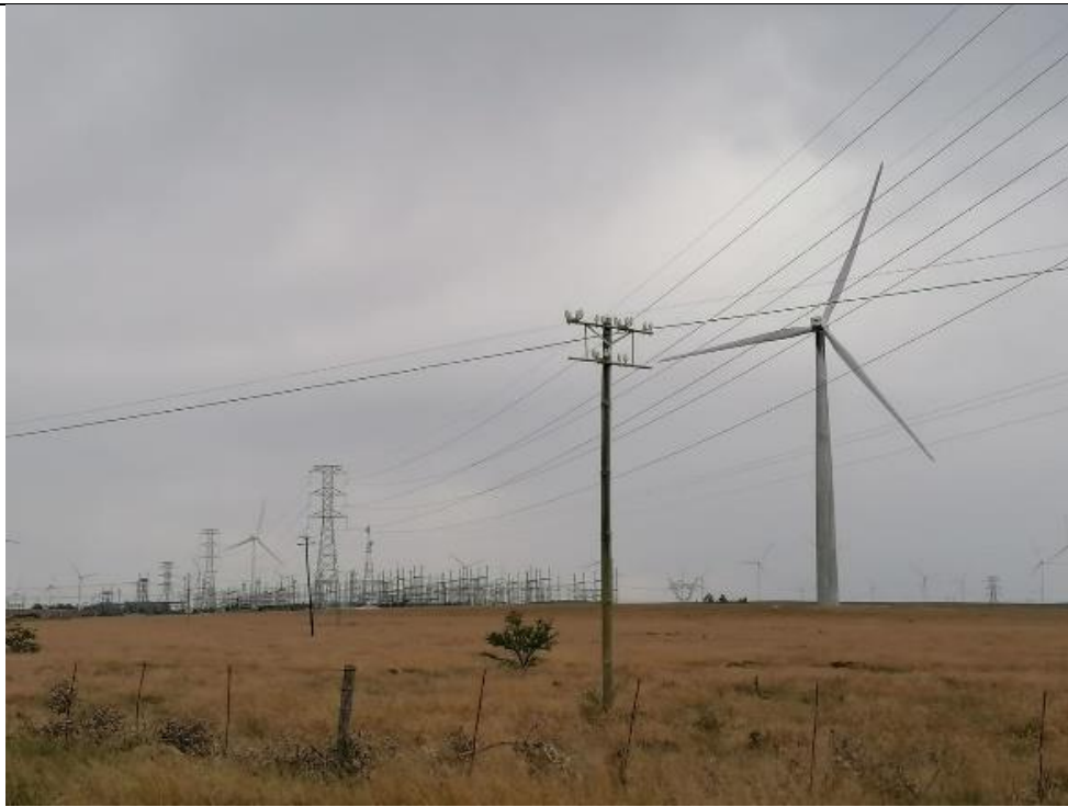
Near site notice 3 placement, Remainder of Farm 242 No. 242, Facing North-west towards Somerset East, Eastern Cape Province