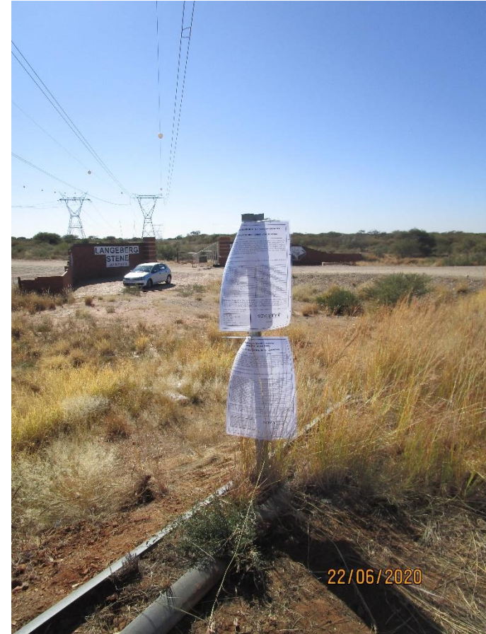
Co-ordinates: 27°55'09.4"S 22°48'42.7"E