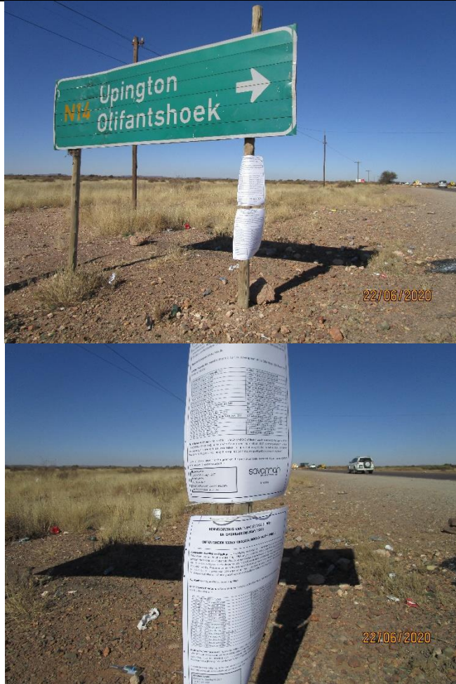
Co-ordinates: 27°53'54.9"S 22°57'46.5"E