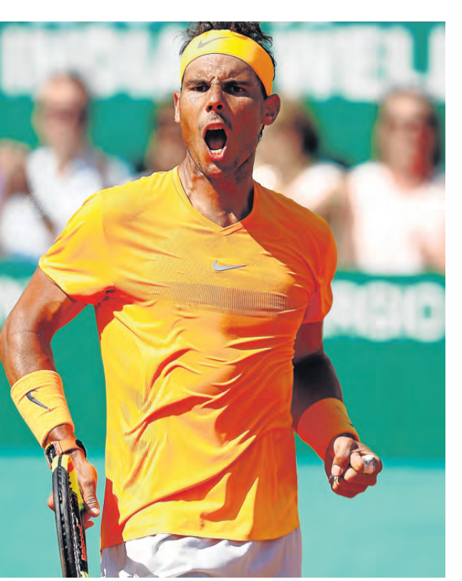
TRUE WINNER: Rafael Nadal just cannot go wrong in the Monte Carlo Masters after securing his 11th title.