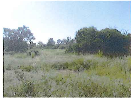
General view of disturbed vegetation in the surveyed area