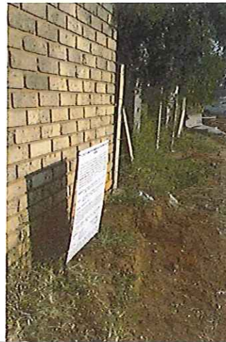
Notice 3 placed on North East boudary of the site (facing R24)