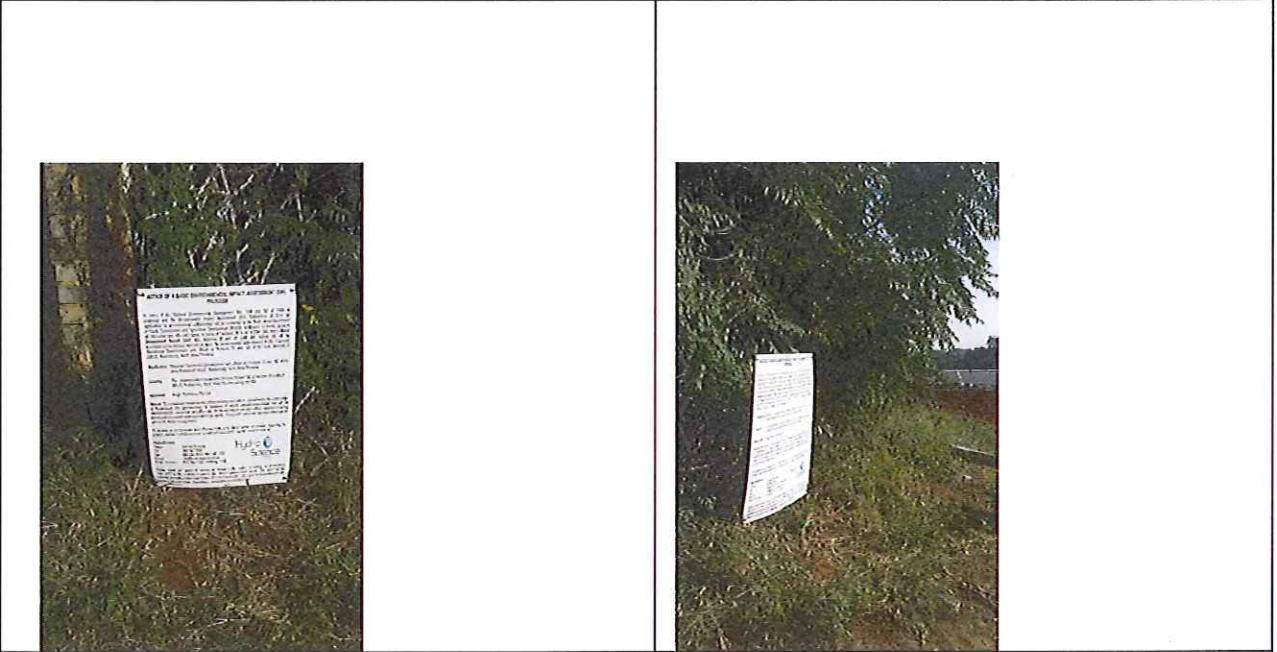
Notice 2 placed on South East boundary of property (facing R24)