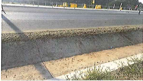
Existing Road (R24) on the Eastern side of property with storm water drainage