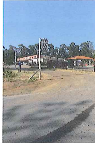
Neighbouring property on the Southern side of the property (Cynthiana Hotel)