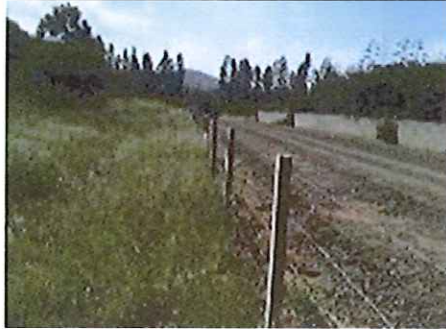
Road traversing property