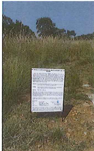
Notice 4 placed on Western boudary of the site (facing Waterberg Road)