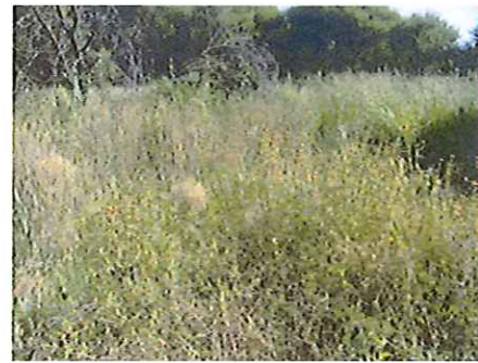
Weeds in the surveyed area