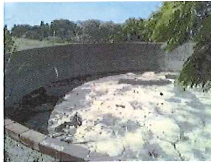
Cement Dam on property

Photographs from the centre of the site in eight (8) major wind directions were not taken since it only shows overgrown vegetation and nothing else is visible.