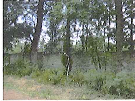
Wall on lower-lying southern side of Portion 162