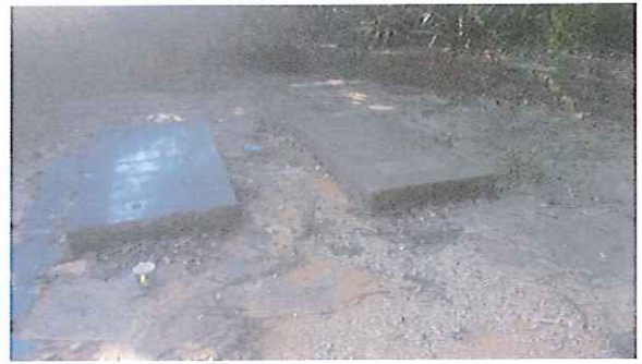
Graves on the site