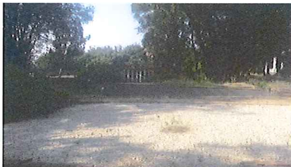
Existing structures on the site (fenced in area left with building and water feature in garden right)