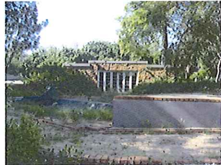
An outbuilding and other associated features