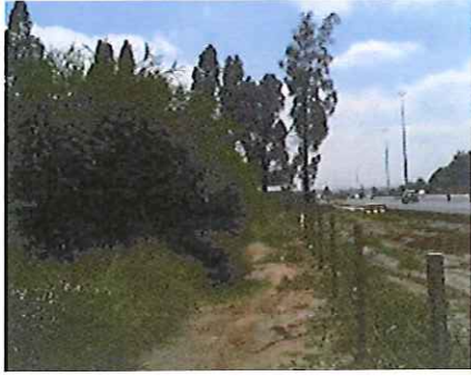
R24 road forms eastern boundary of site