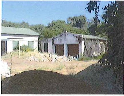
Garages on the property