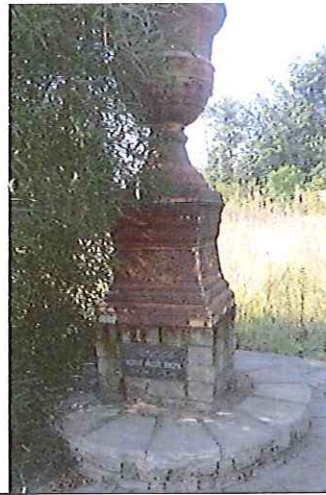
Two (2) memorials on the site (North East and South East corner)