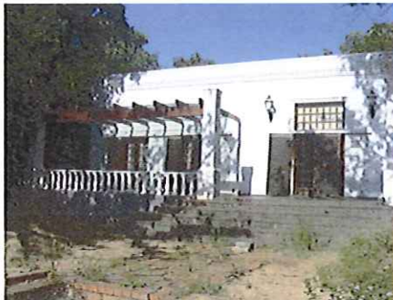
Second house on the property