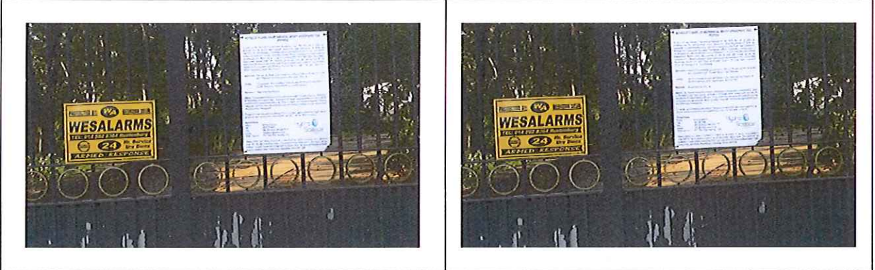
Notice 1 placed on the gate of the existing house/building on site