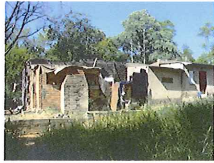
Workers dwelling on the edge of the property