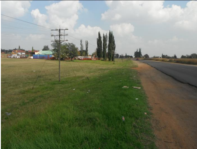
Figure 8: A view of the R547 Road to the southwest