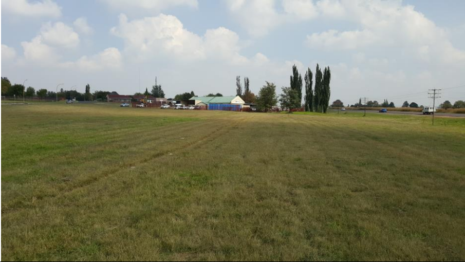
Figure 3: A view of the site towards the south