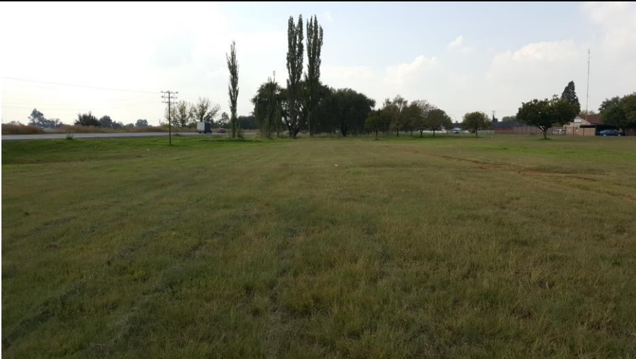
Figure 4: A view from the site towards the north