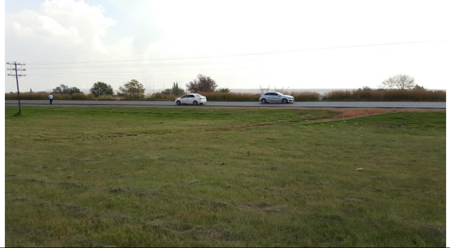
Figure 4: A view of the R547 Road towards the southwest