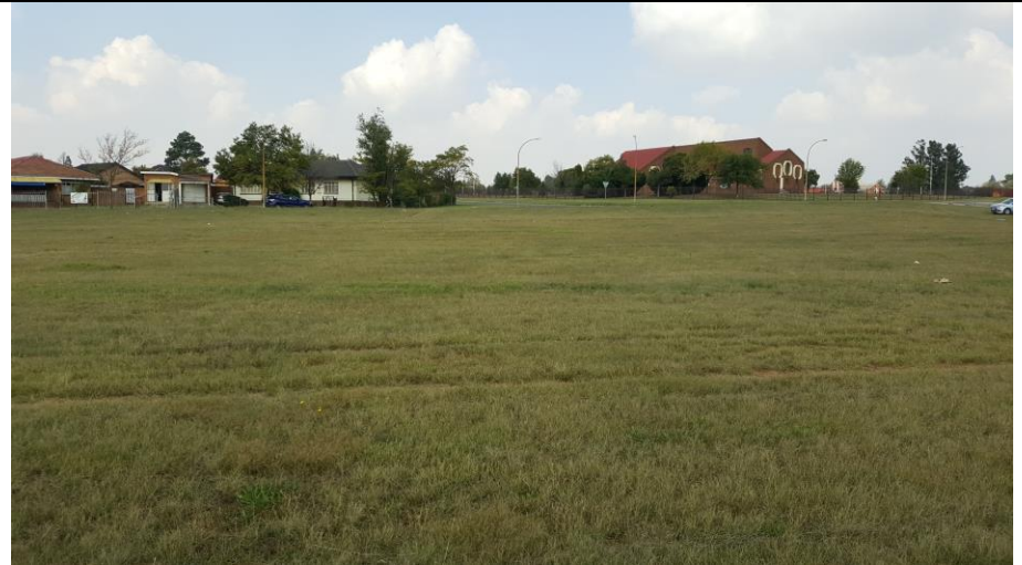
Figure 5: A view from the site towards the east