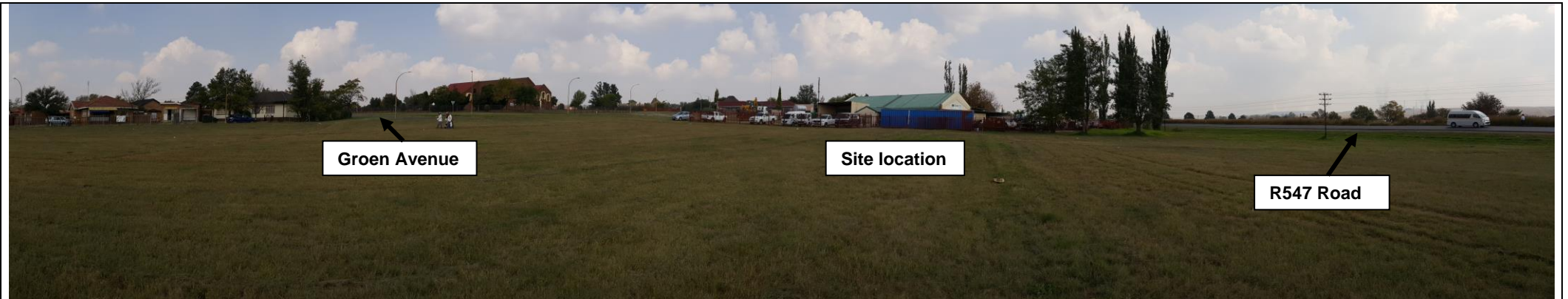
Figure 1: Panoramic view towards the south