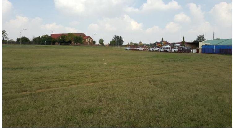
Figure 7: A view of the church to the east