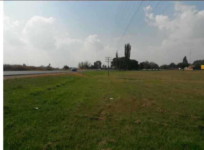
Figure 9: A view of the R547 Road to the northeast