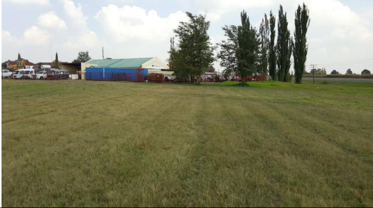
Figure 6: A closer view of the site towards the south