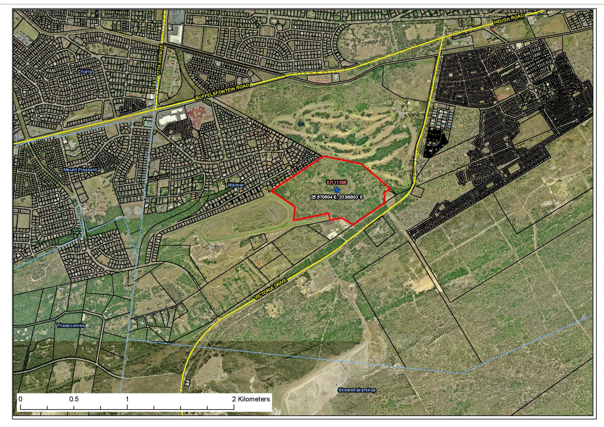
Figure 2: Location of the proposed Walmer Gqebera Housing development