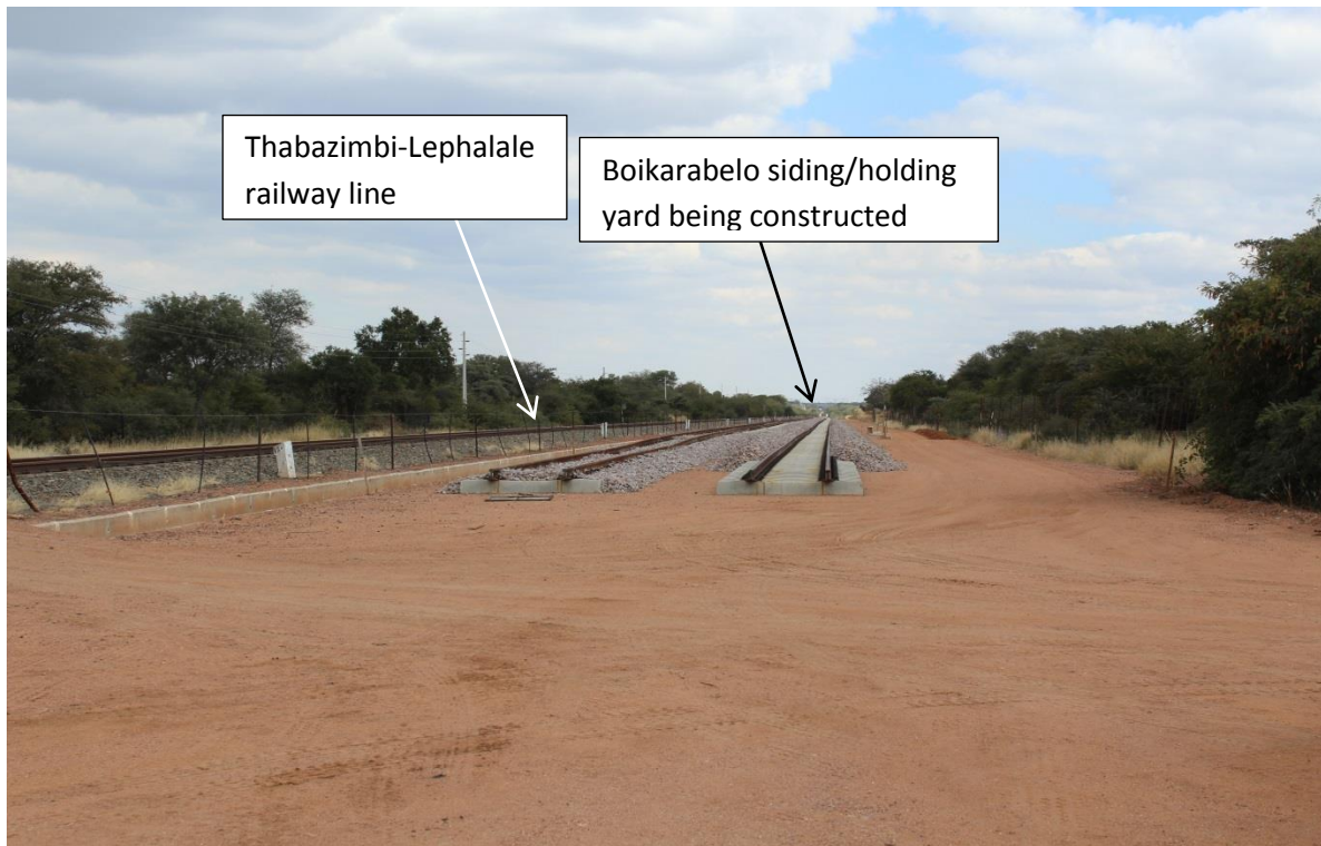
Figure 1: View of existing Thabazimbi-Lephalale single railway (left) and the first phase of the 100 wagon train holding yard being constructed by Boikarabelo Coal Mine (right). Photo taken facing south west towards Geelhoutkloof 359LQ