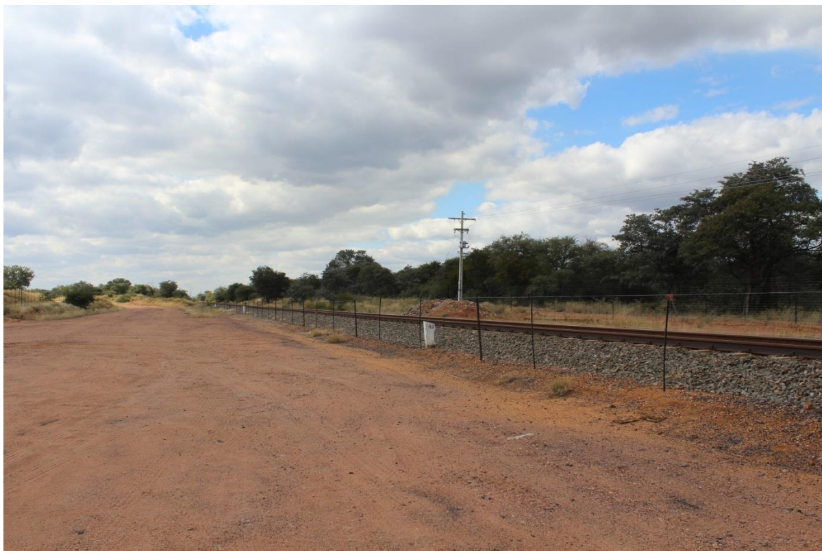
Figure 3: View of the existing railway track (right) and cleared servitude (left) for the completion of Boikarabelo holding yard