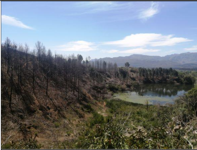
Figure 12: Quarry in Pniel adjacent to which external pipeline would be routed