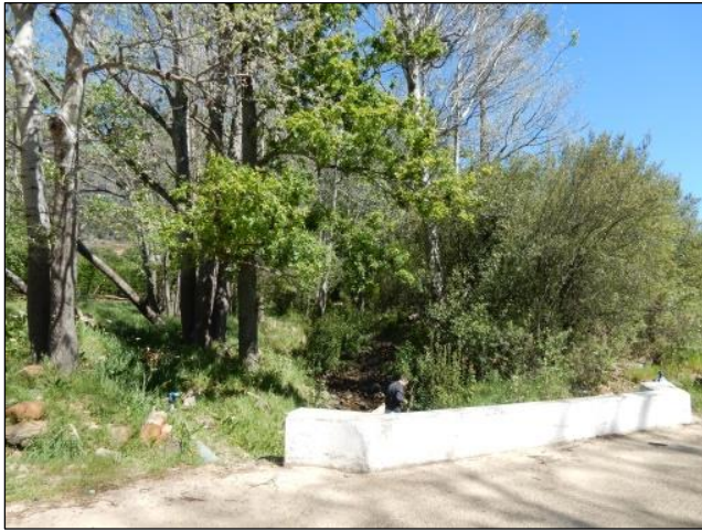
Figure 7: Crossing at lower stream 5, below FE16a