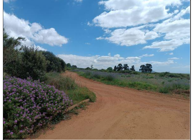
Figure 8: Existing roadway at Fe9 where services would be installed