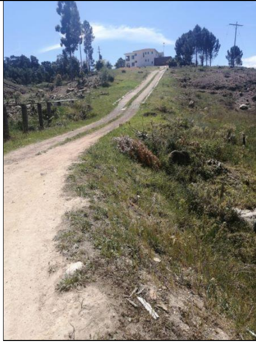
Figure 11: Existing road where external water pipeline would be routed