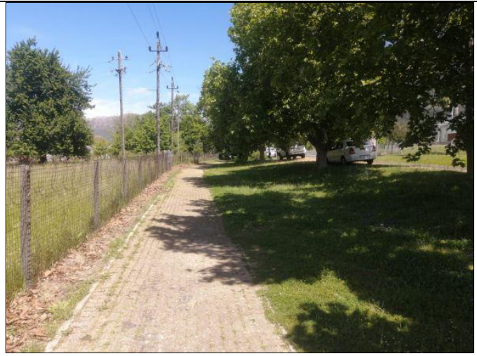
Figure 13: Position of existing external sewer line (along boundary of Pniel Primary School) which would be upgraded