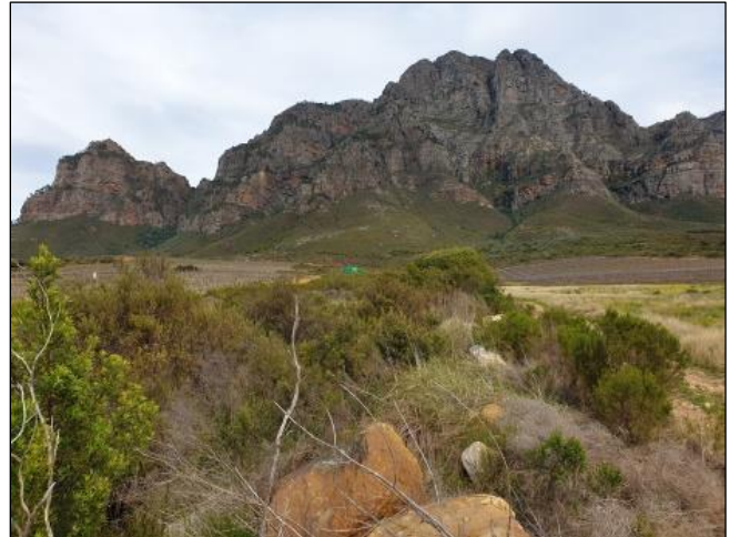
Figure 4: Vegetated channel of Upper Stream 2, to FE6 / Road B