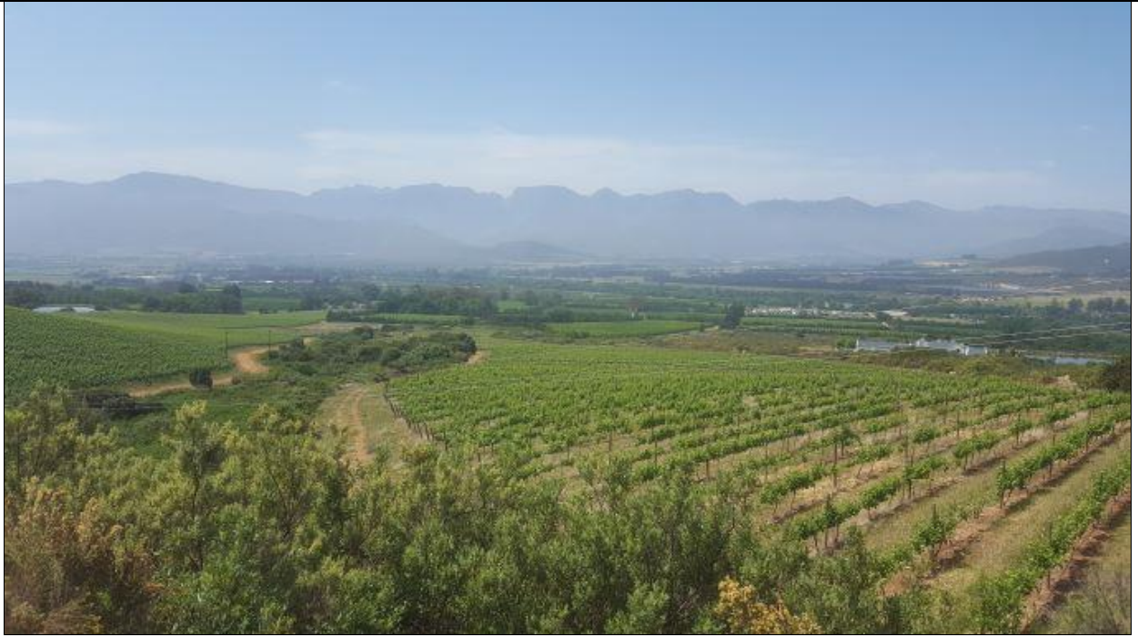
Figure 14: View of project site facing east showing existing roadways and farmland