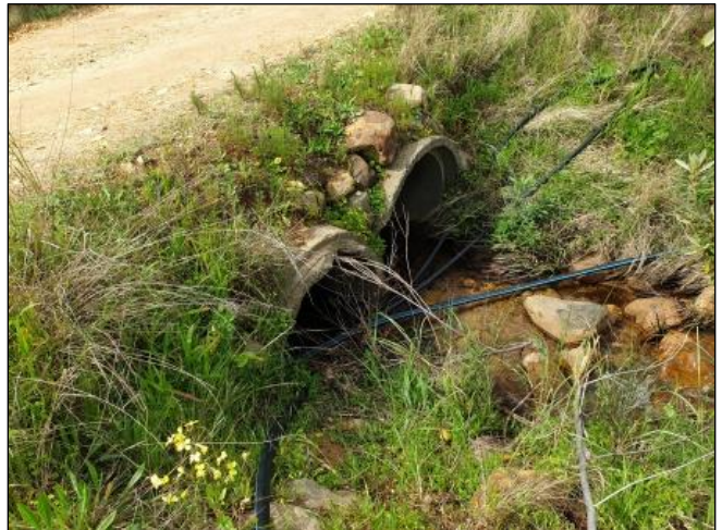
Figure 6: The site of culvert 3a at Lower Stream 2, as it flows under an existing gravel road