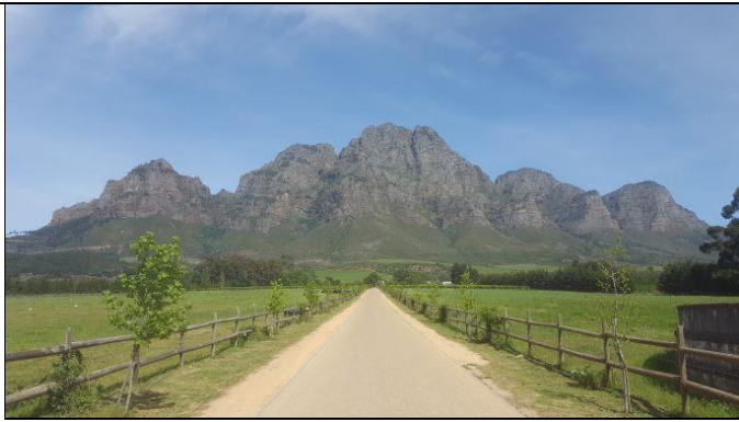
Figure 1: Paved entrance Road from Helshoogte Road (R310)