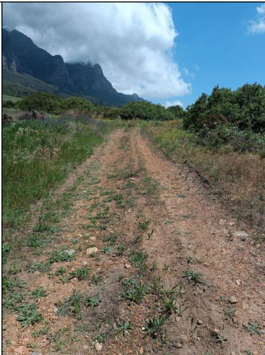
Figure 9: Existing gravel track at Fe9 where services would be installed