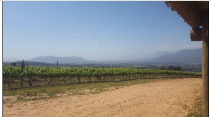
Figure 2: Typical gravel roadway in which most services would be routed