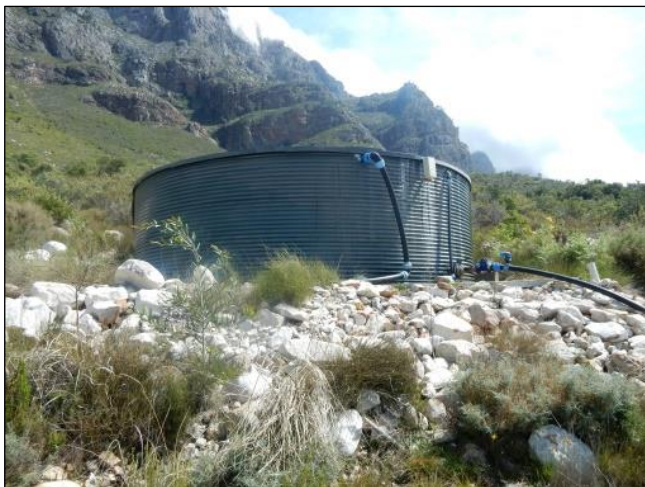
Figure 5: Current water supply reservoir in the upper catchment of Stream 2. New reservoir to be placed adjacent to this reservoir