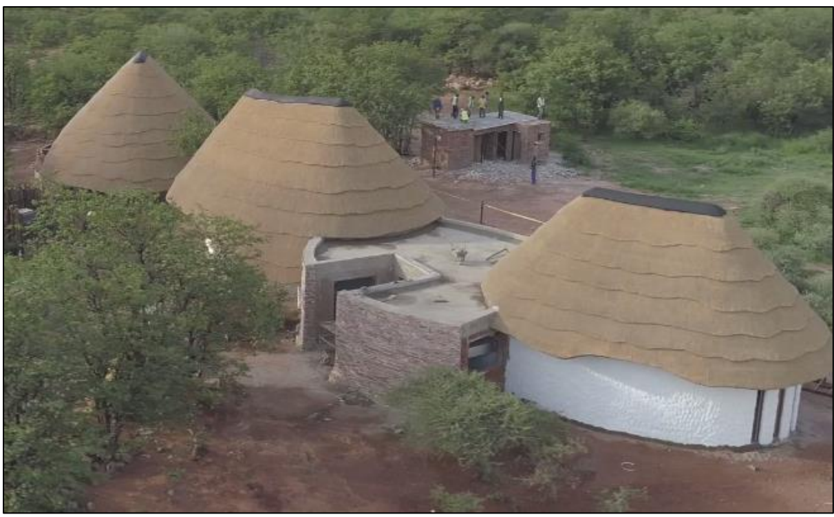
Sulphur Springs Day Spa (back view)