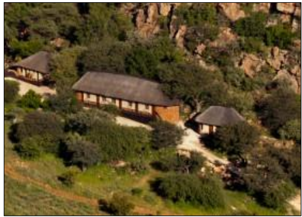
Back of house prior to upgrading