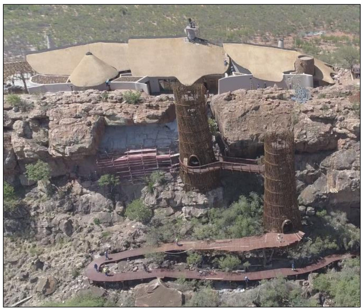
Presidential Villa and lifts to provide access other Villa's

Main lodge and facilities after upgrading and refurbishment: