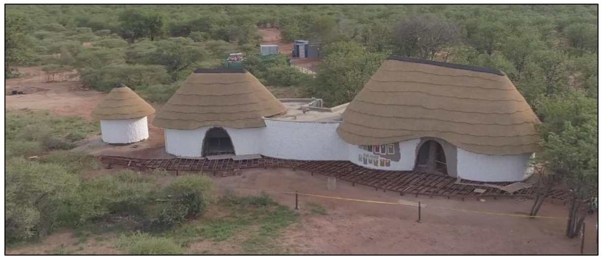
Sulphur Springs Day Spa (front view)