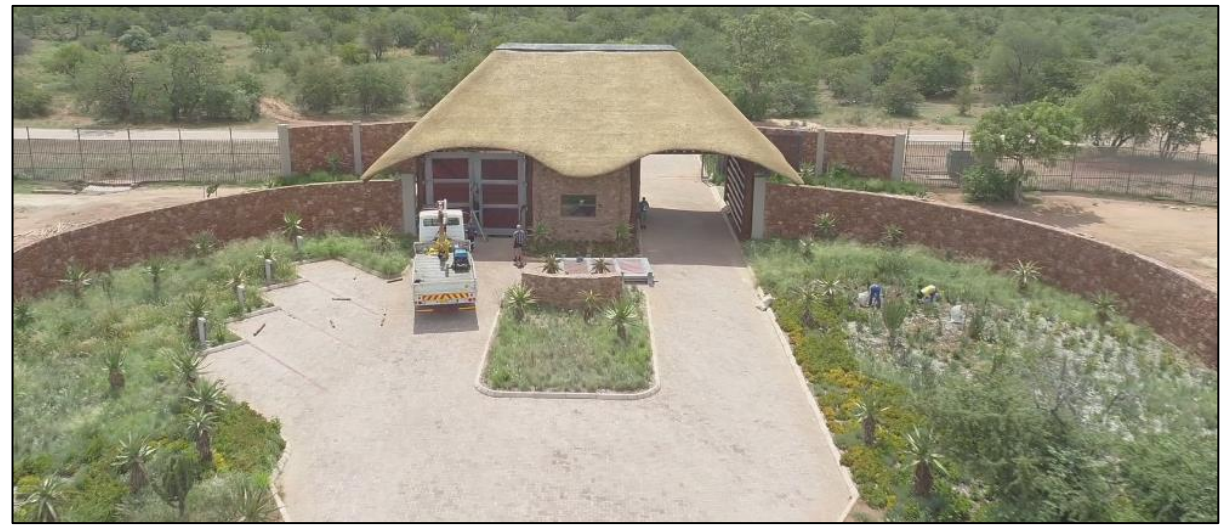
Main Gate along the N1 Highway