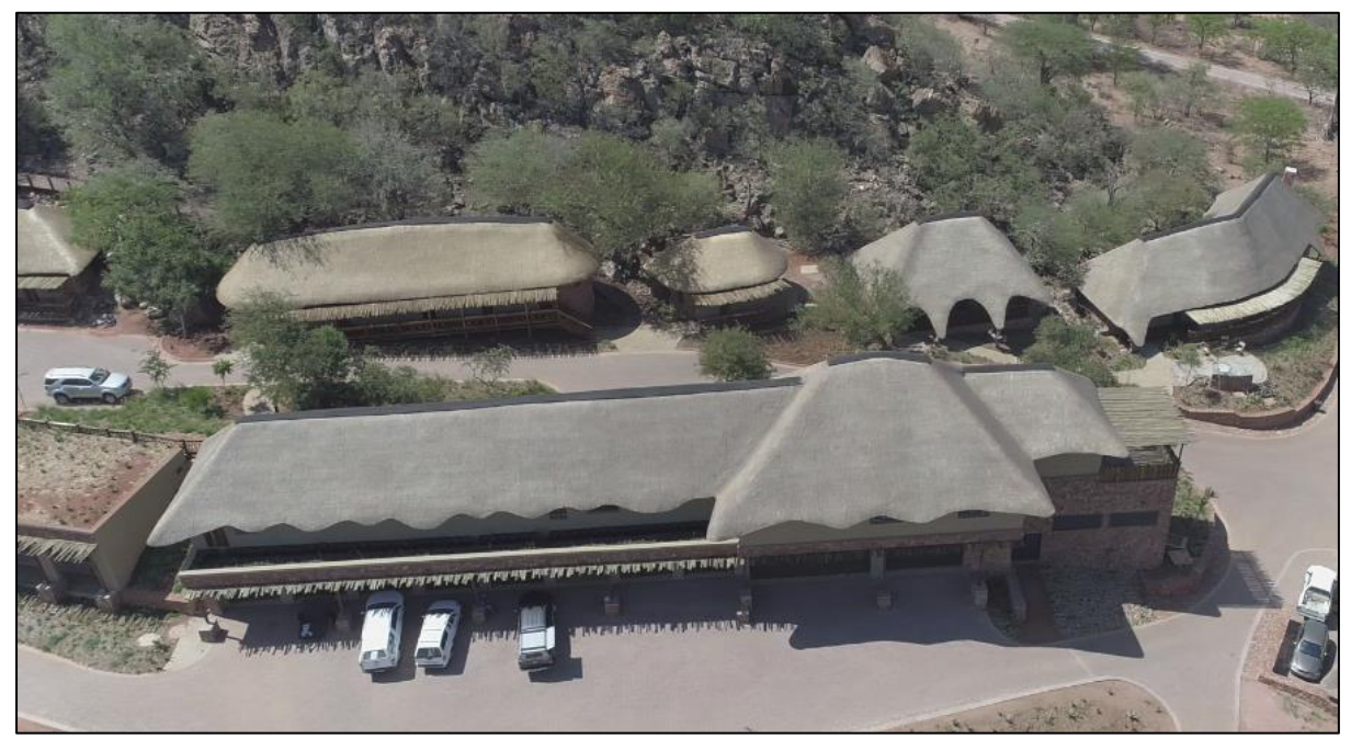
Back of House after upgrading and refurbishment