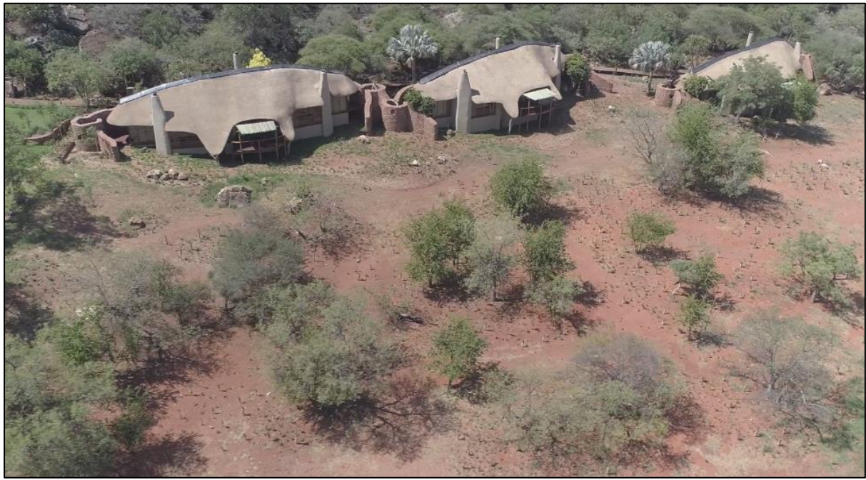
Three of the seven existing accommodation units at Main Lodge