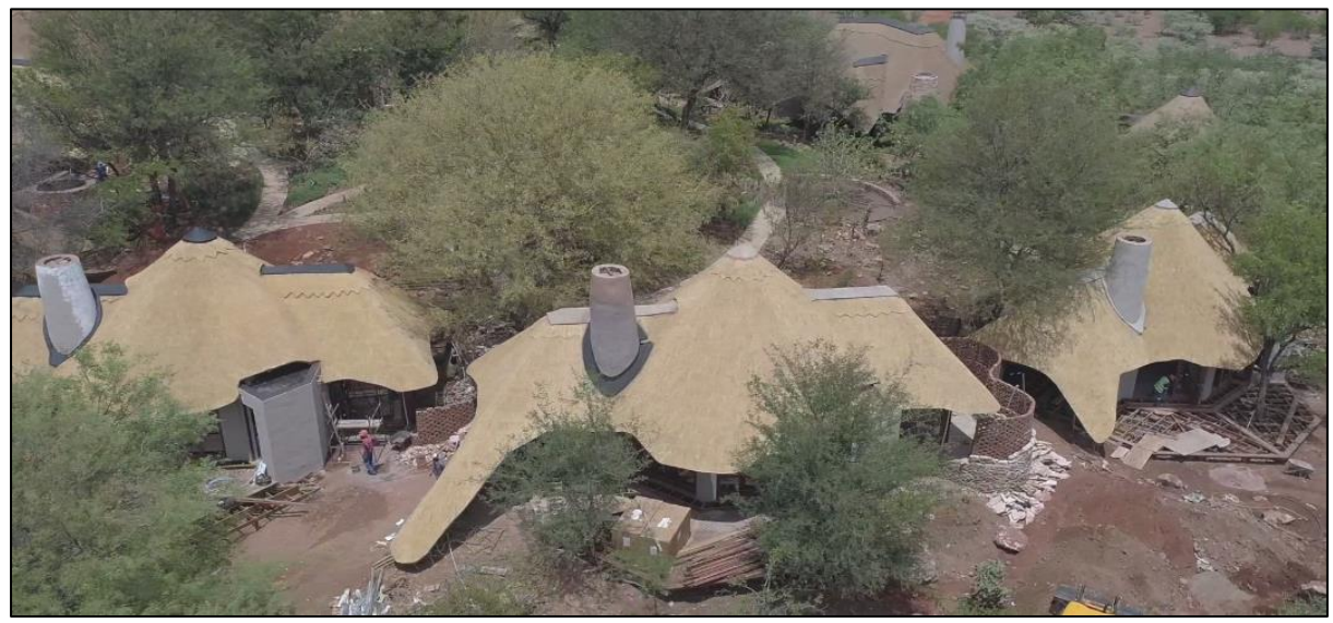
Upgraded accommodation units