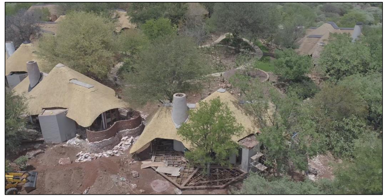
Pienaar Lodge after upgrading