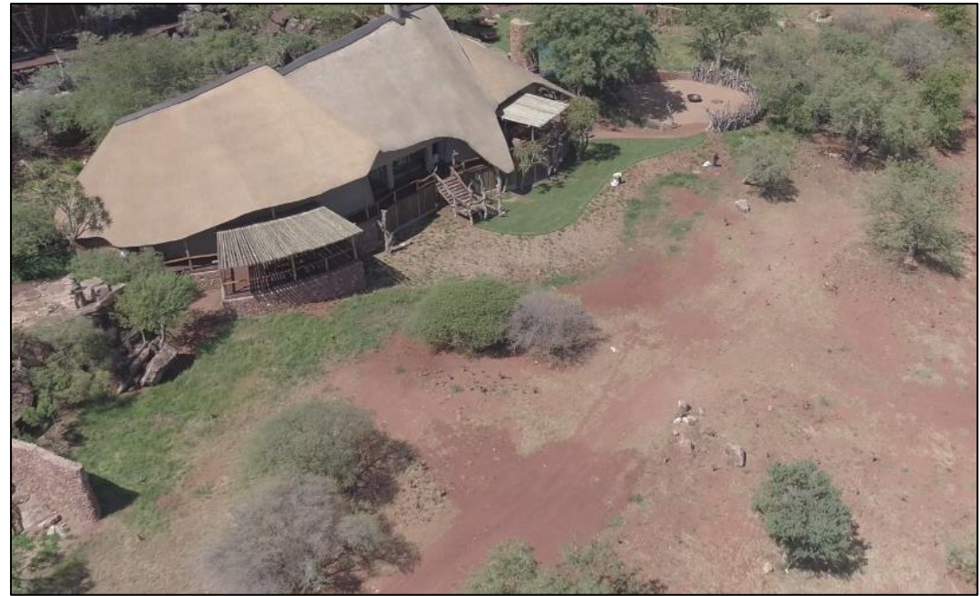
Upgraded central facility