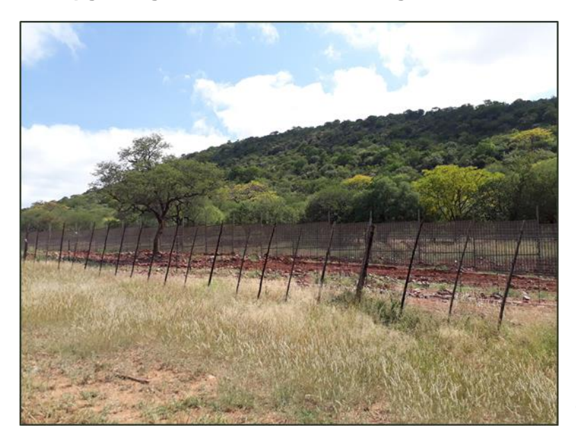
Fencing along the boundary of Ekland Safaris

1. Upgrading of the fence surrounding Ekland Safaris: