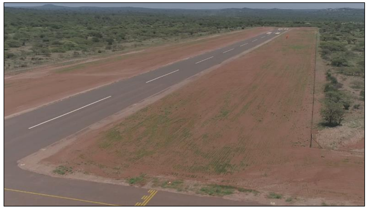
Hydroseeded edges being established