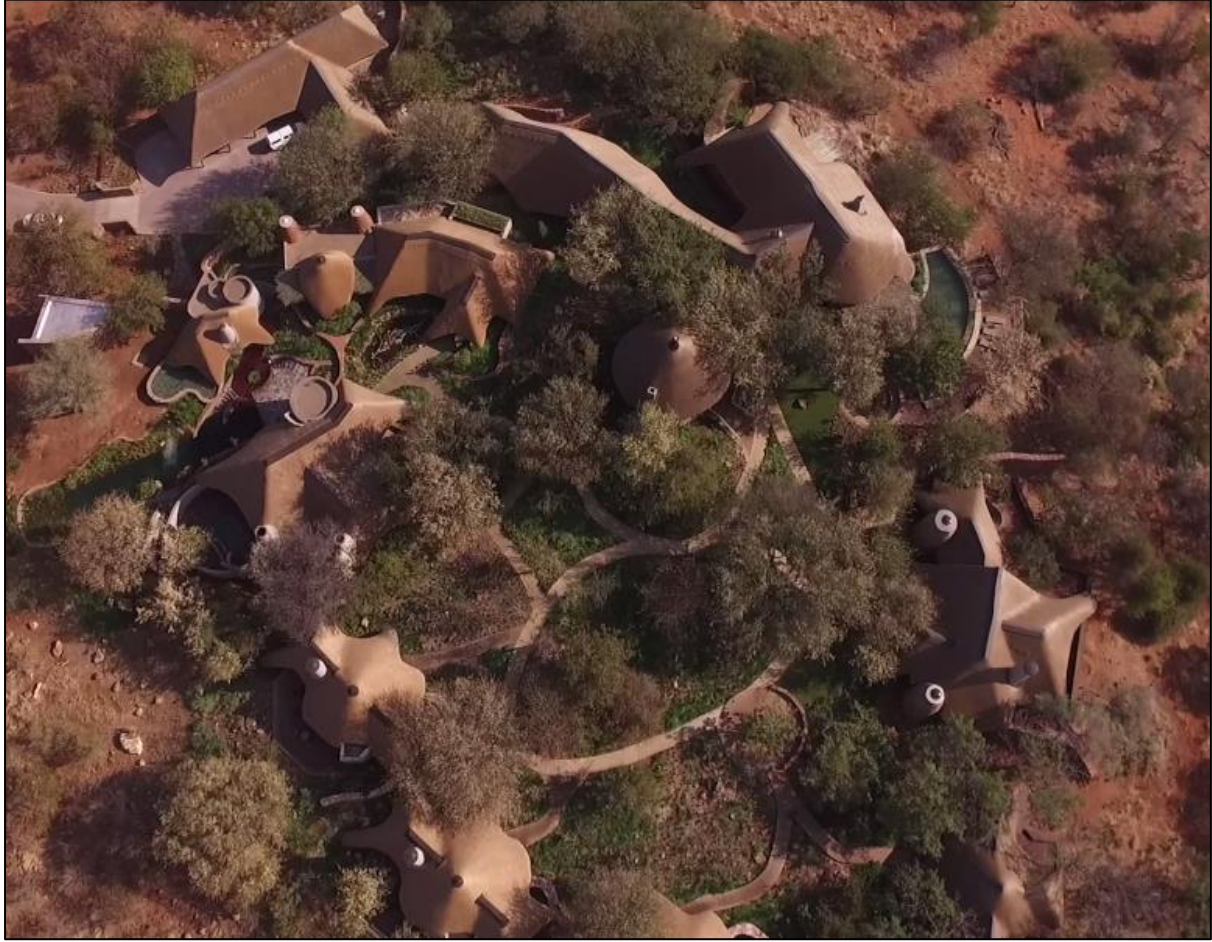
Aerial view of Pienaar Lodge after upgrading