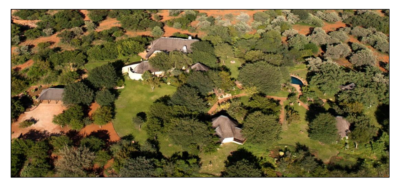
Photo portraying Pienaar Lodge prior to upgrading and refurbishment