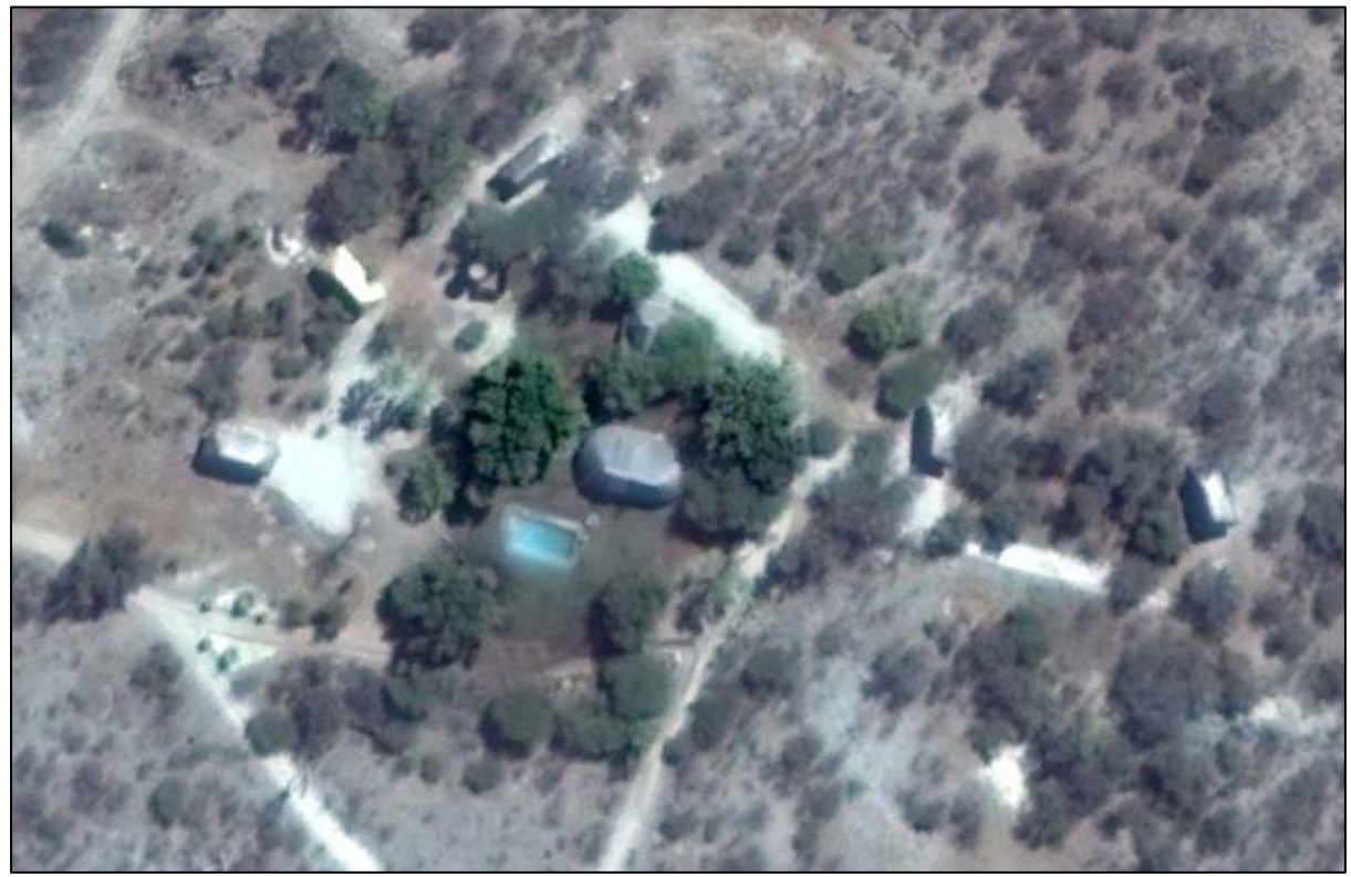
Leadwood Lodge prior to upgrading

Photo portraying Leadwood Lodge prior to upgrading: