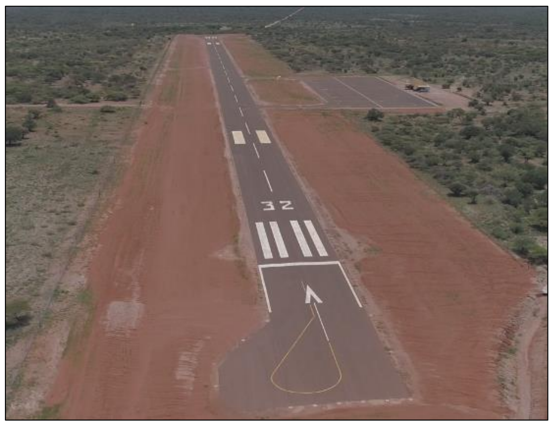
Airstrip after resurfacing and widening