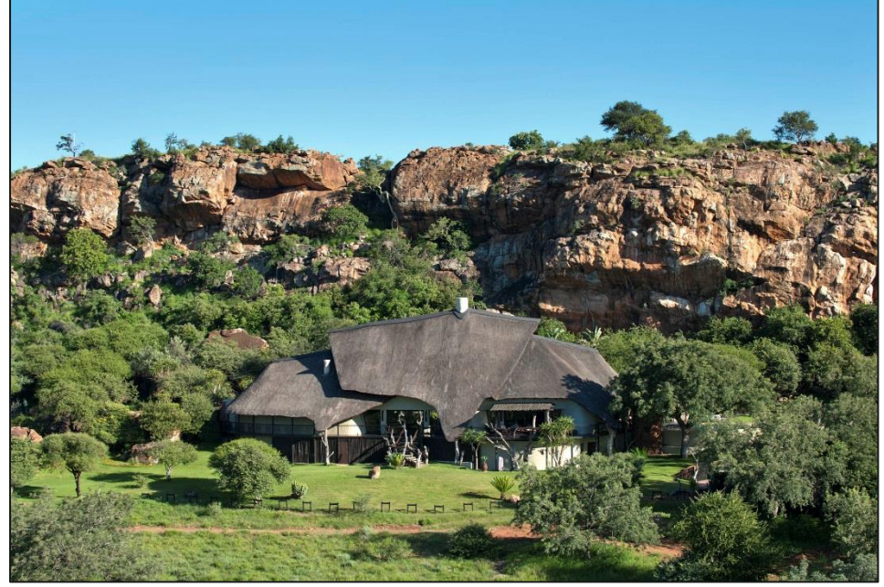
Central Facility prior to upgrading