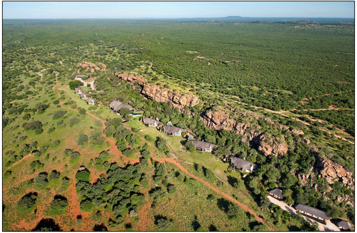
Overview of Main Lodge prior to refurbishment

Photos portraying Main Lodge prior to upgrading and refurbishment