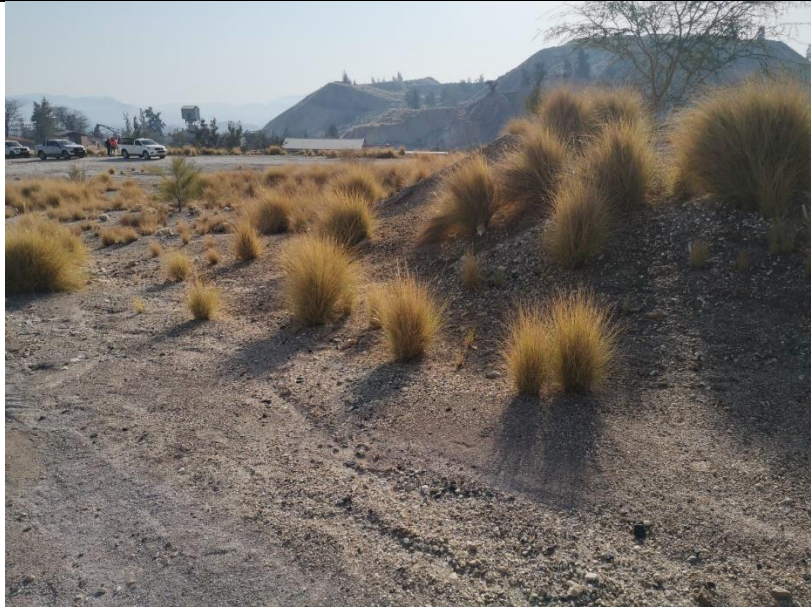
Photo of site before establishment of Asphalt Plant. Photo taken in an Eastern direction.