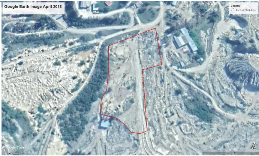
Google Earth satellite image of the Asphalt Plant site before establishment.