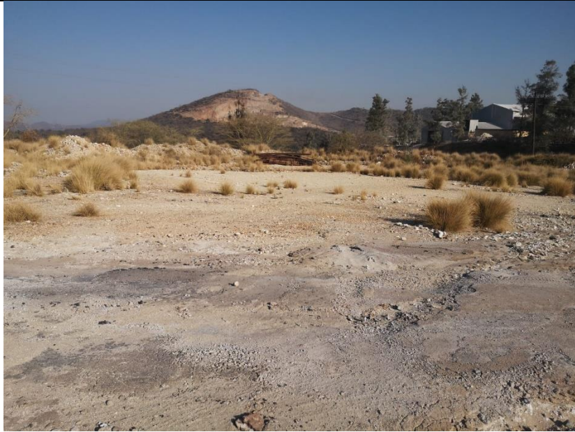
Photo of site before establishment of Asphalt Plant. Photo taken in a North-Western direction.