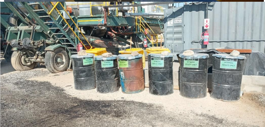
General waste bins. Date of photo: August 2020