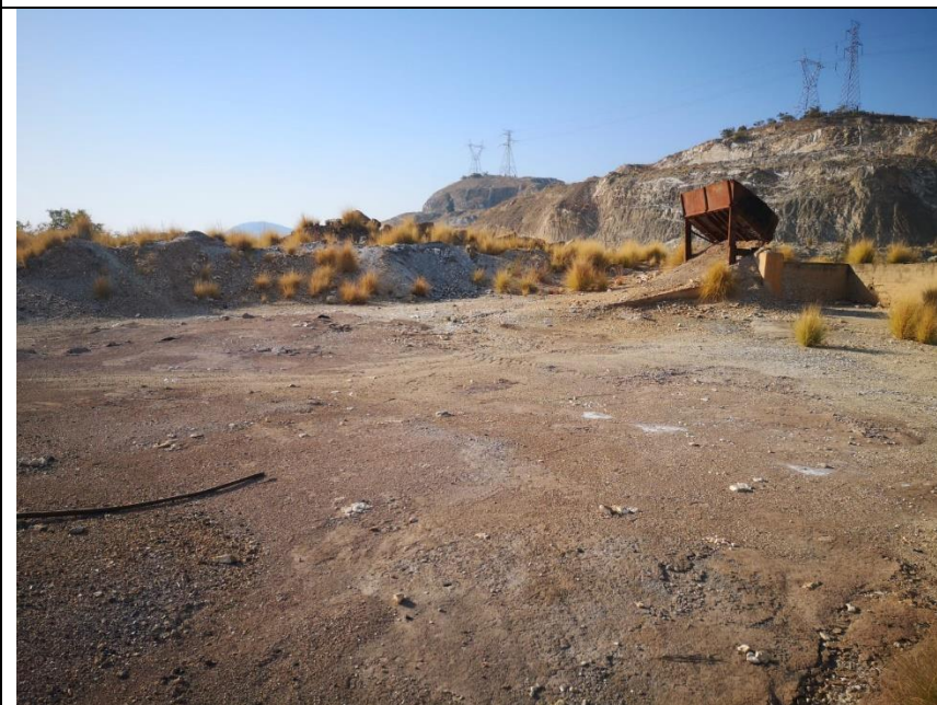
Photo of site before establishment of Asphalt Plant. Photo taken in a South-Eastern direction.