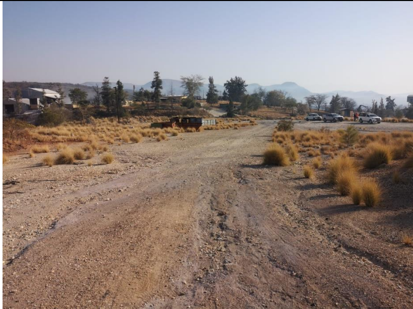
Photo of site before establishment of Asphalt Plant. Photo taken in a Northern direction.