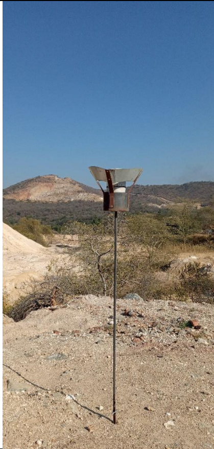
Dust bucket for Dust Fallout Monitoring. Date of photo: August 2020.