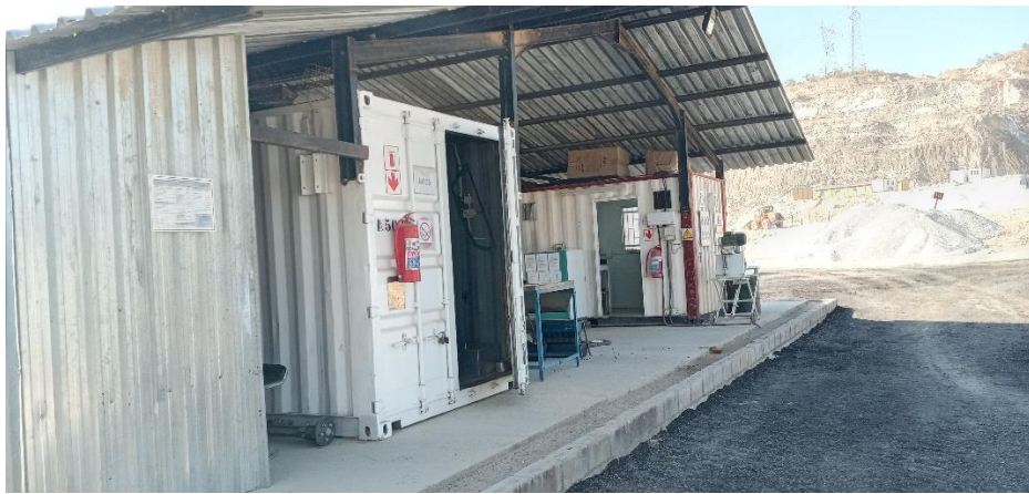
Lab. Date of photo: August 2020