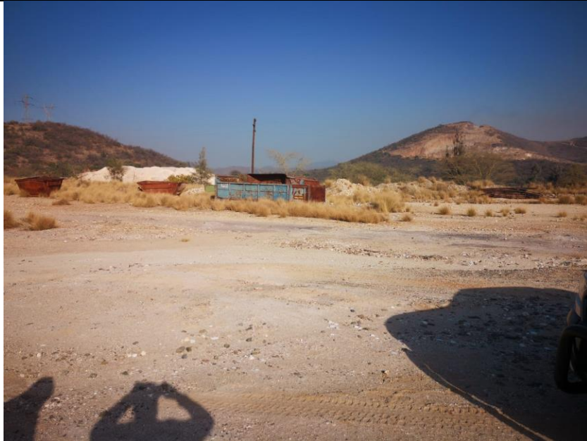
Photo of site before establishment of Asphalt Plant. Photo taken in a Western direction.