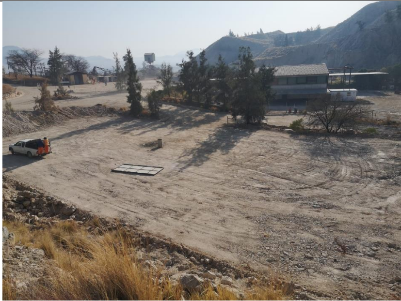
Photo of site before establishment of Asphalt Plant. This area is currently being used for material storage.