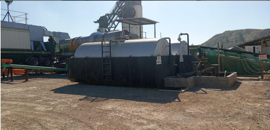
HFO storage tanks. Date of photo: July 2020