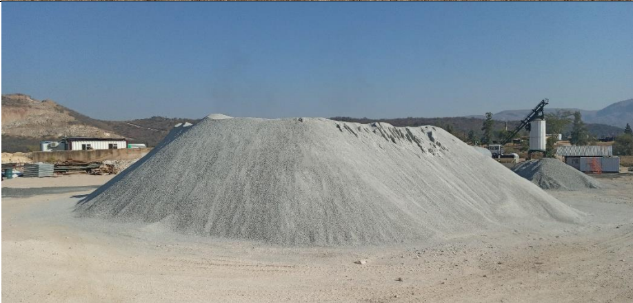
Aggregate stockpiles. Date of photo: August 2020