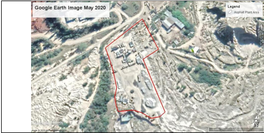
Google Earth satellite image of the Asphalt Plant site after establishment. Date of image: May 2020