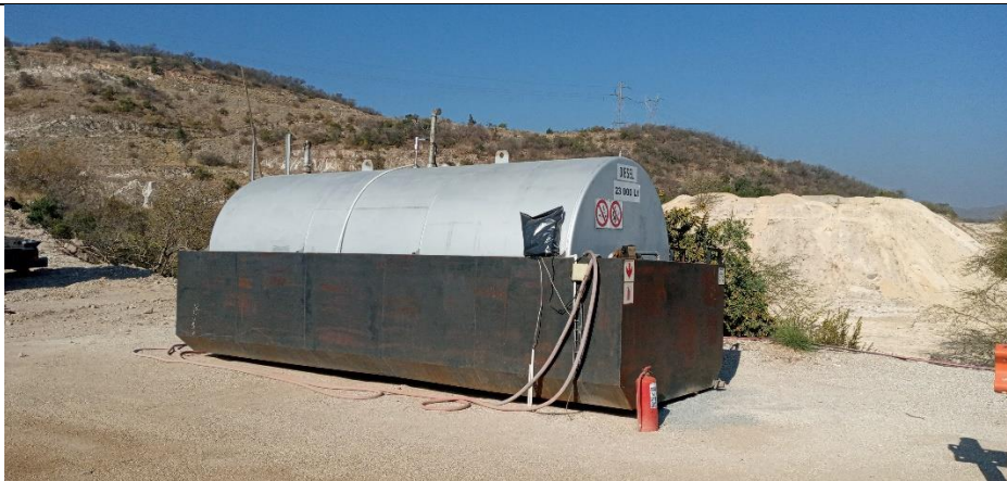
Diesel storage tank. Date of photo: August 2020