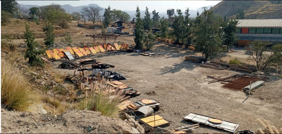
Material storage area. Date of photo: August 2020.