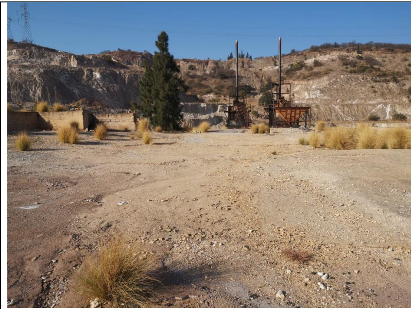
Photo of site before establishment of Asphalt Plant. Photo taken in a Southern direction.