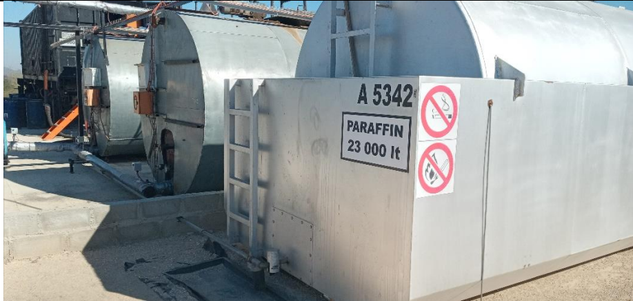
Paraffin storage tank. Date of photo: July 2020