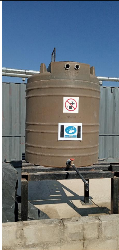
Water tanks on site. Date of photo: August 2020.