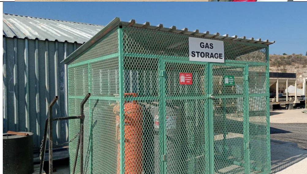
Gas storage area. Date of photo: August 2020.