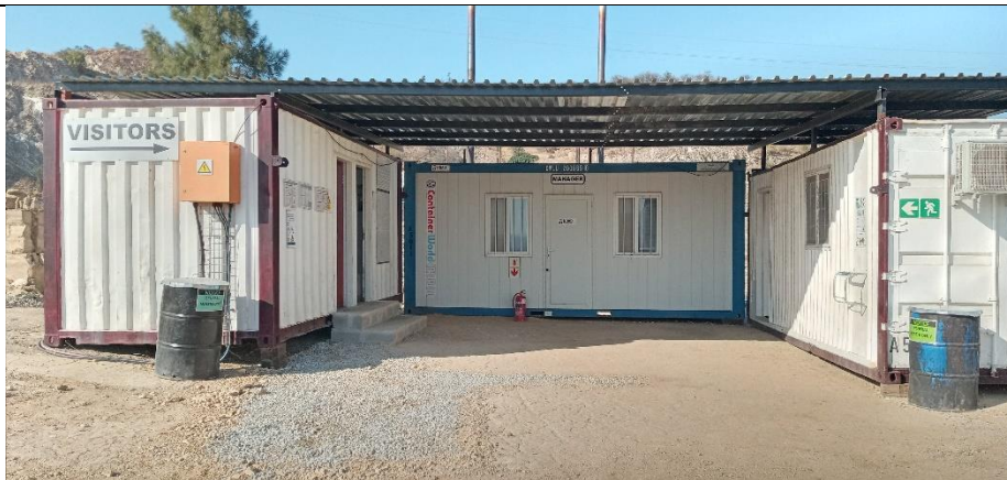
Offices. Date of photos: June and August 2020