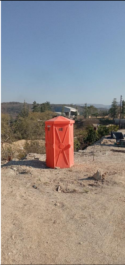
Mobile chemical ablation facility Date of photo: August 2020