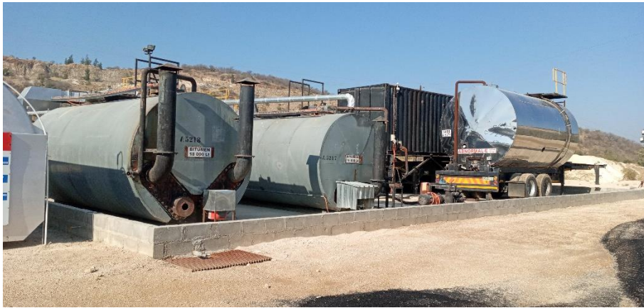
Bunded area with bitumen storage tanks. Date of photo: August 2020