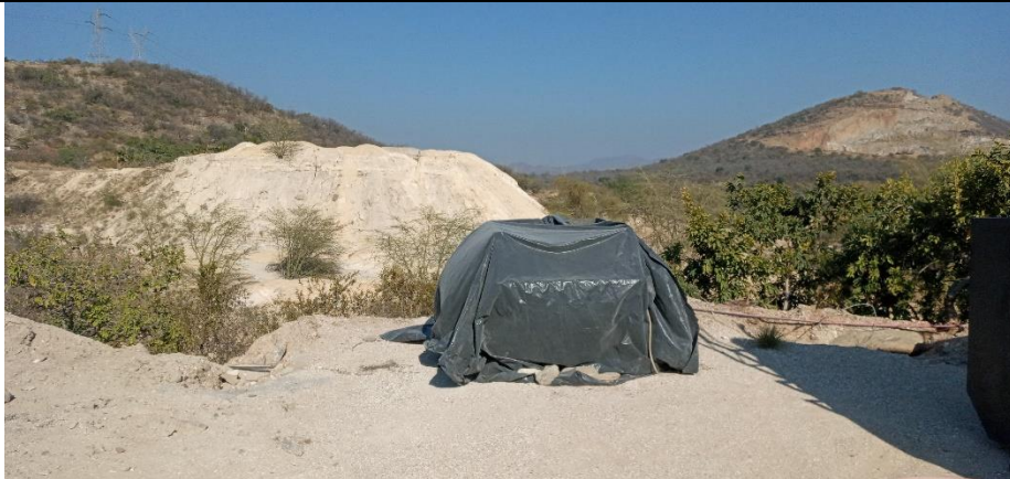
Contaminated soil skip. Date of photo: August 2020