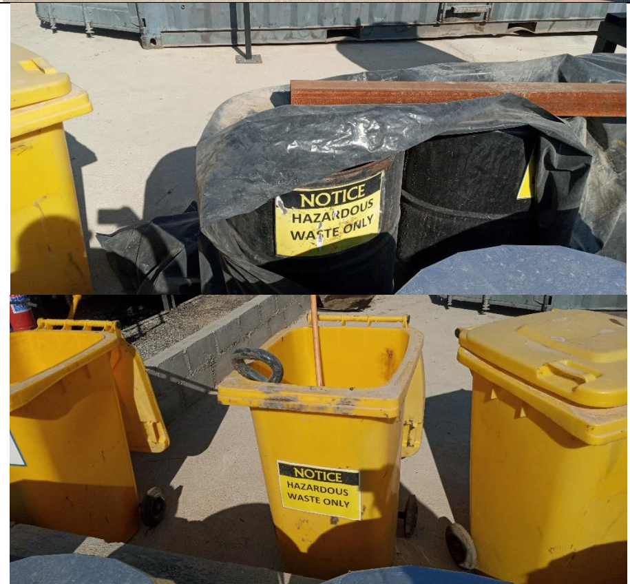
Hazardous waste bins. Date of photo: August 2020