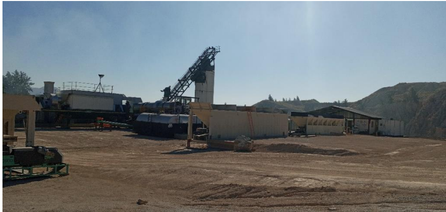
Asphalt Plant. Date of photo: July 2020