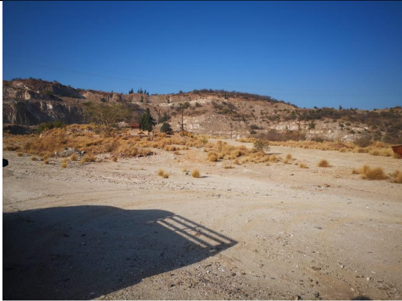
Photo of site before establishment of Asphalt Plant. Photo taken in a South-Western direction.