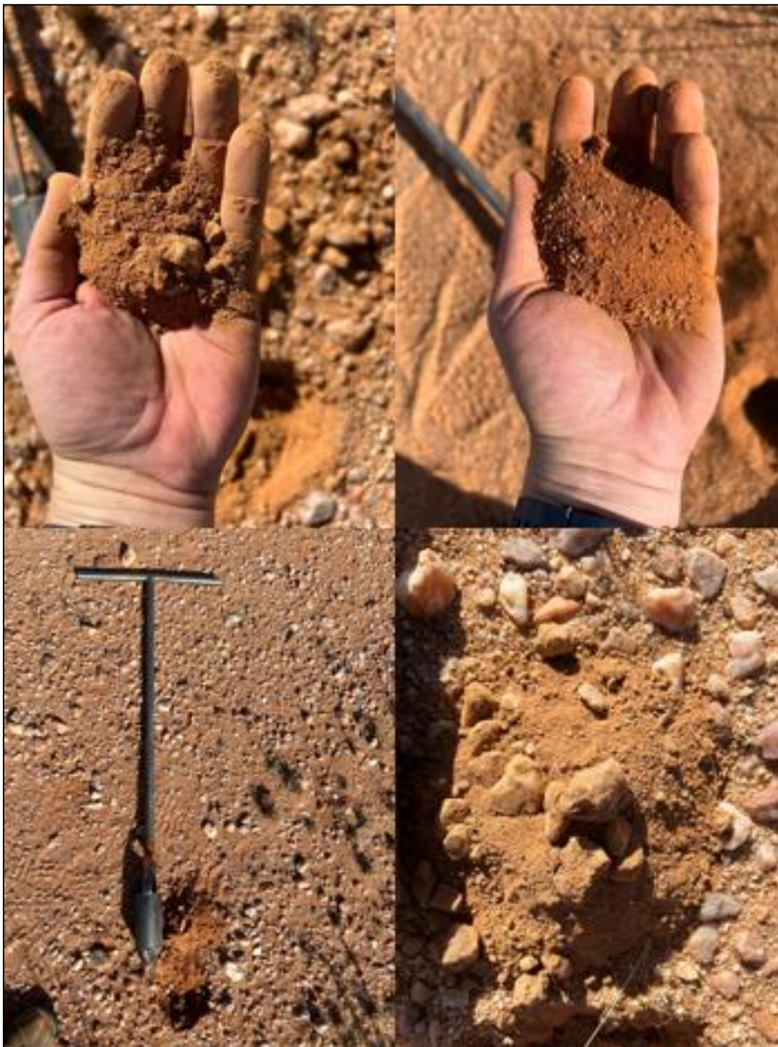
Figure 2: Soil forms identified within the proposed project area including shallow rocky Glenrosa and Mispah soil forms